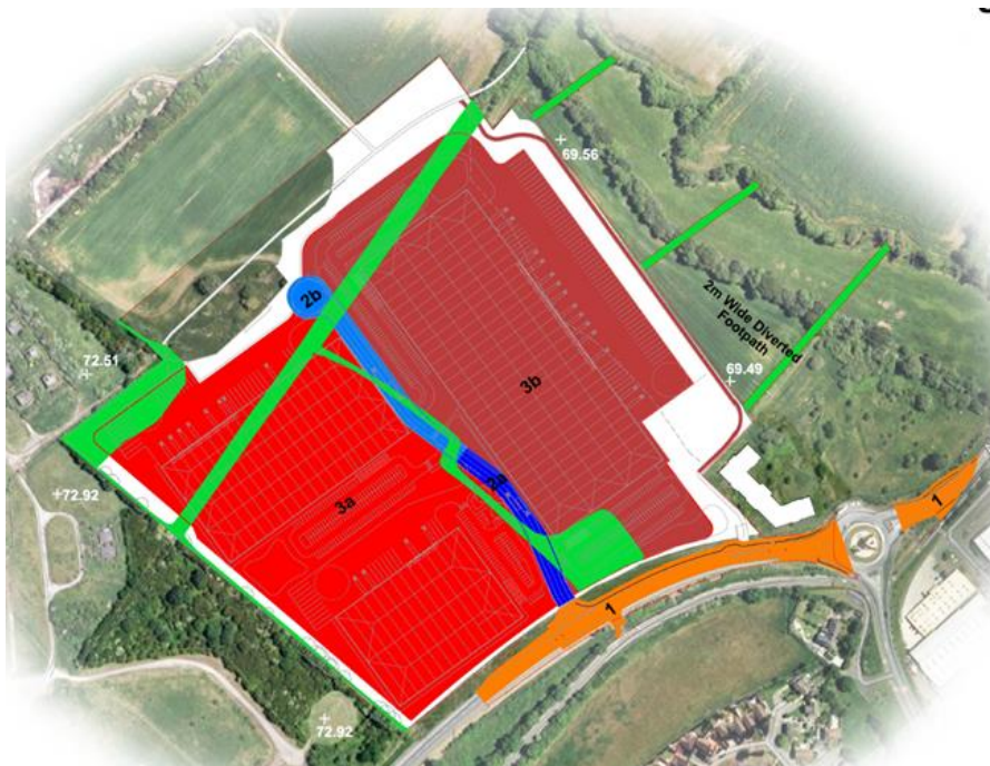
Figure 1 – Approved Phasing Plan