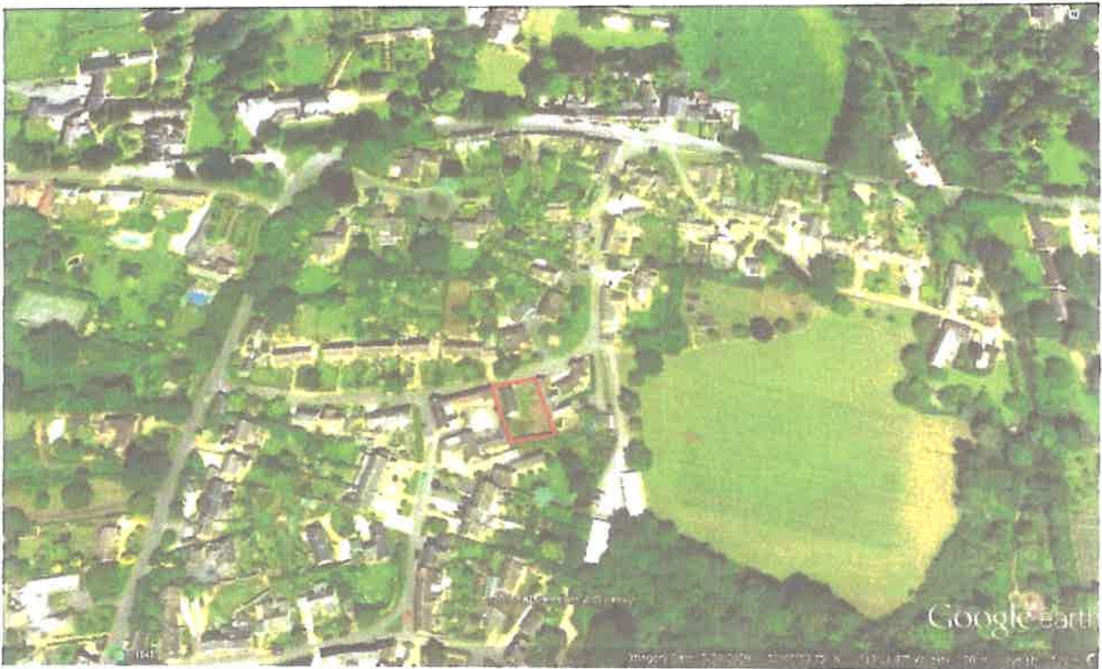
Aerial photograph showing location of the site (red outline).