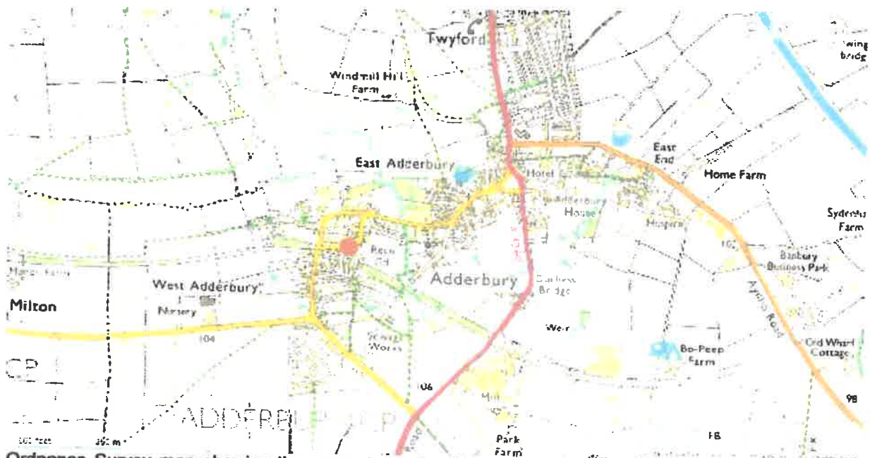
Ordnance Survey map showing the approximate location of the site (red circle) within the local area.