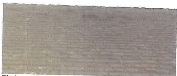
Photograph 3. A photograph showing some of the lifted wooden shingles.