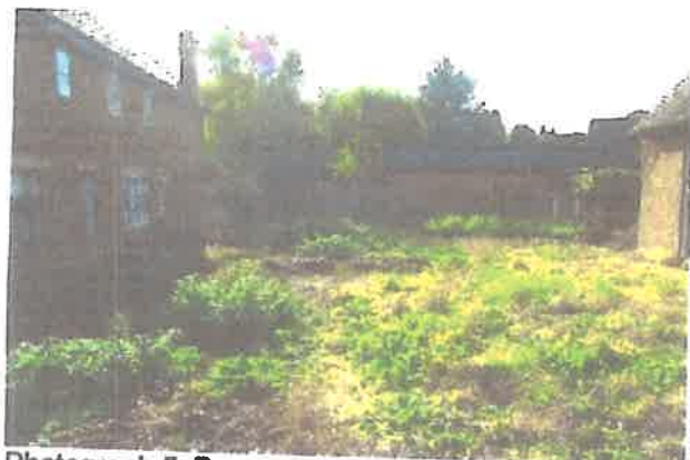
Photograph 5. Bare ground and ruderal vegetation.