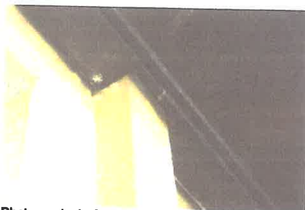
Photograph 4. A gap at the eaves of the western elevation.