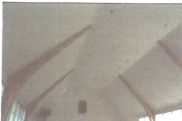
Photograph 2. The interior space of the church.