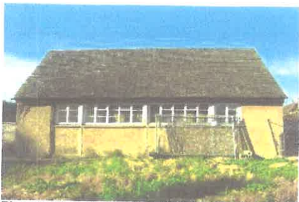
Photograph 1. St George's Church viewed from the east.