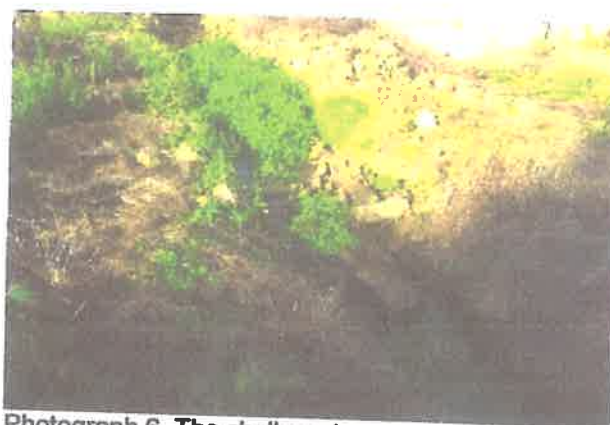
Photograph 6. The shallow stream.