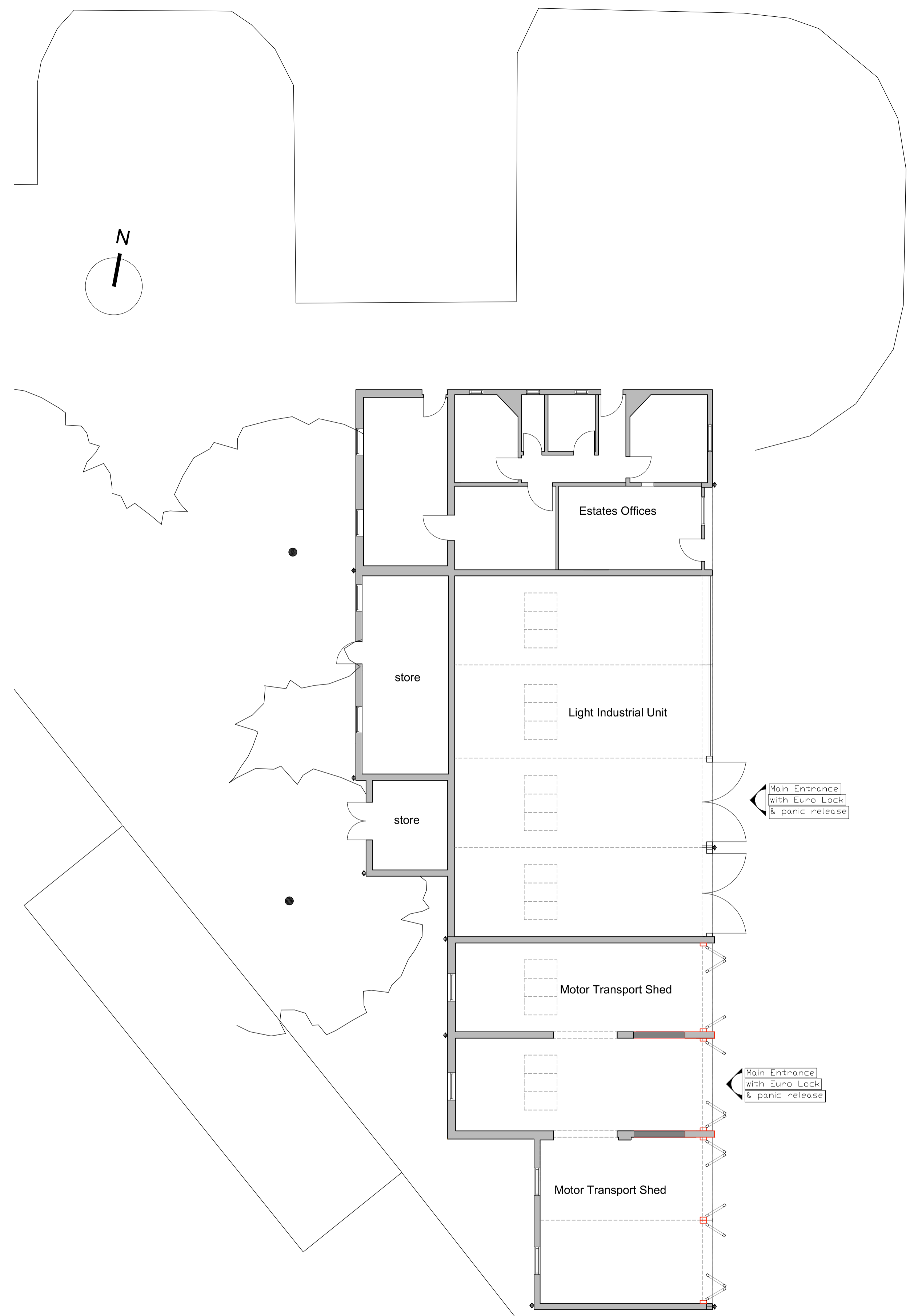
BUILDING 131 Ground Floor Plan