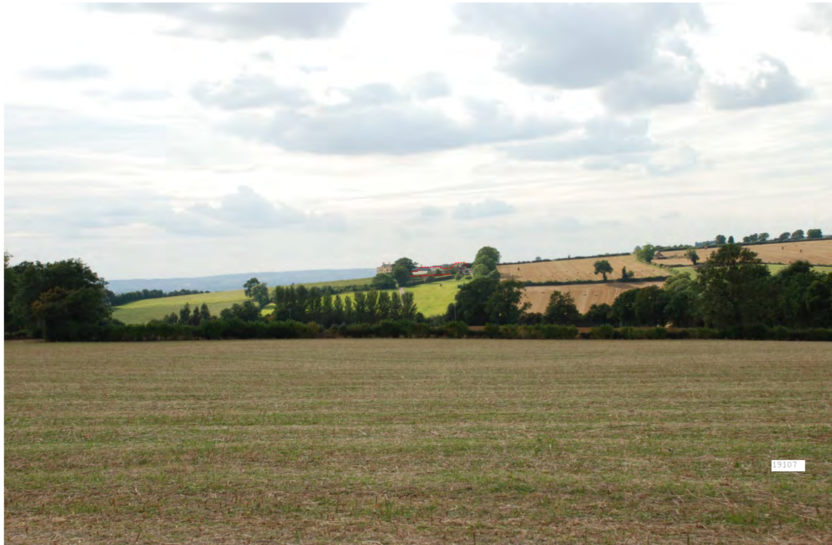
View showing replacement house (buildings to be removed shown with dashed red line)