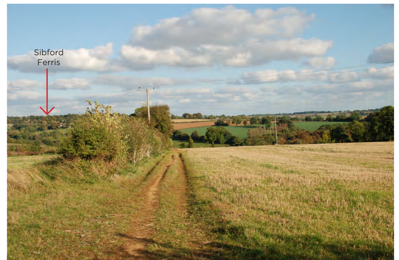
View looking east along direction of travel