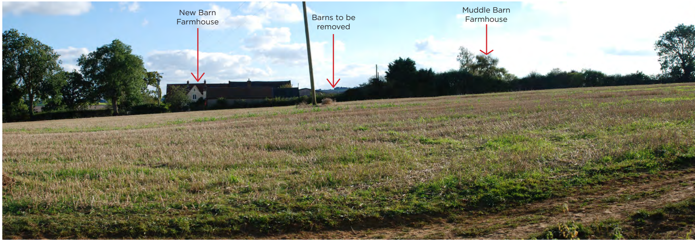
Note: telegraph pole leans