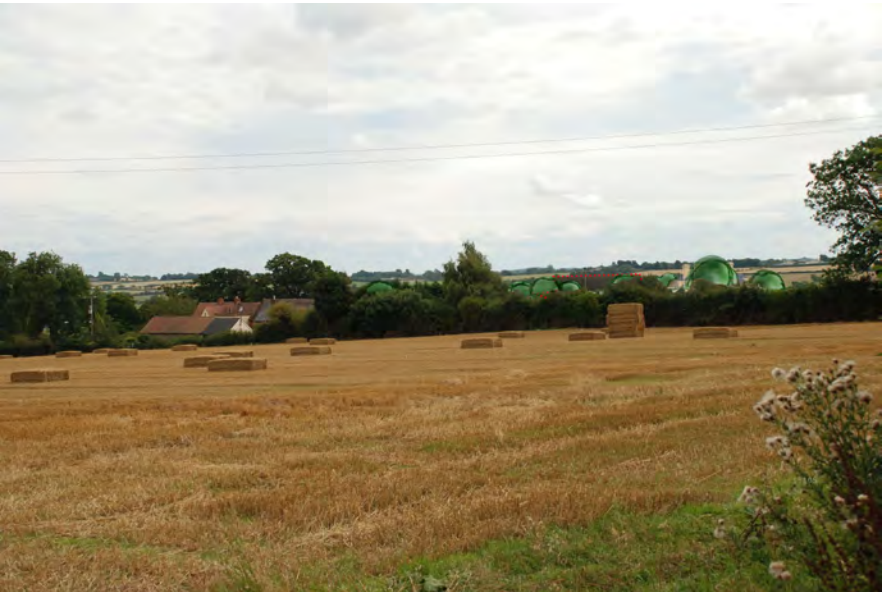
Figure 19 Sketch showing impact of planting on viewpoint 2B (BW 347/1)