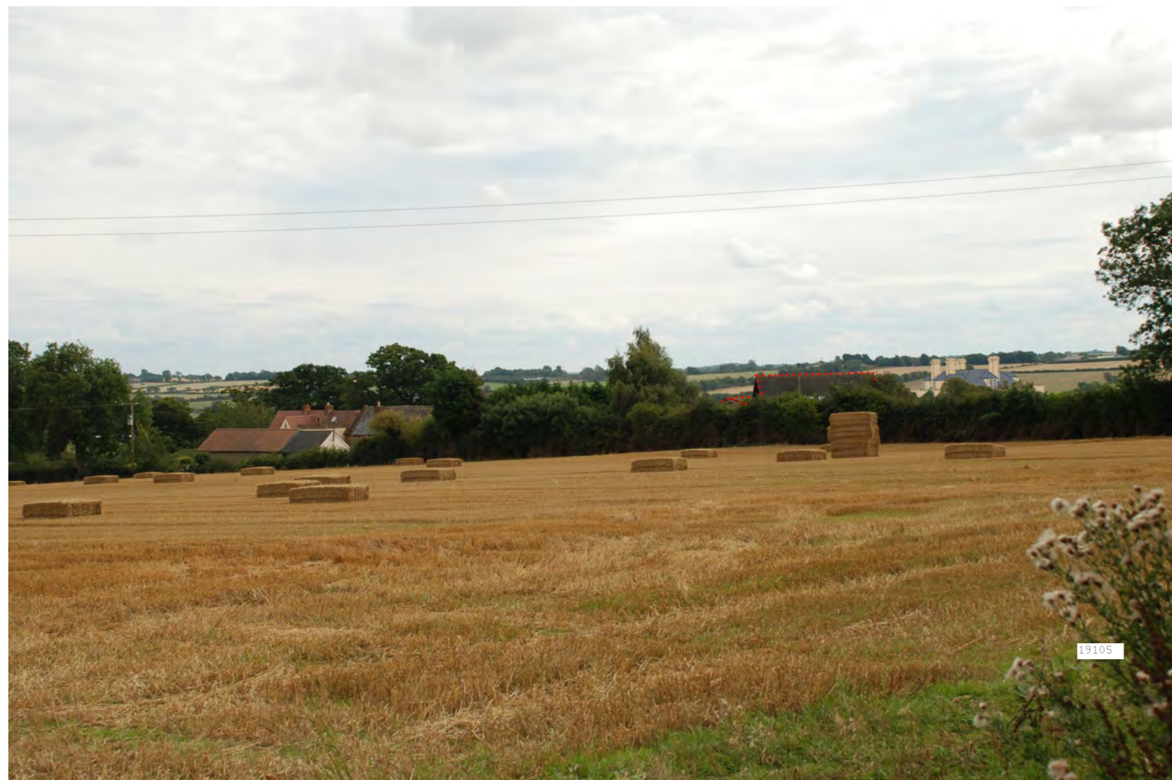
Zoomed in view showing replacement house (buildings to be removed shown with dashed red line)