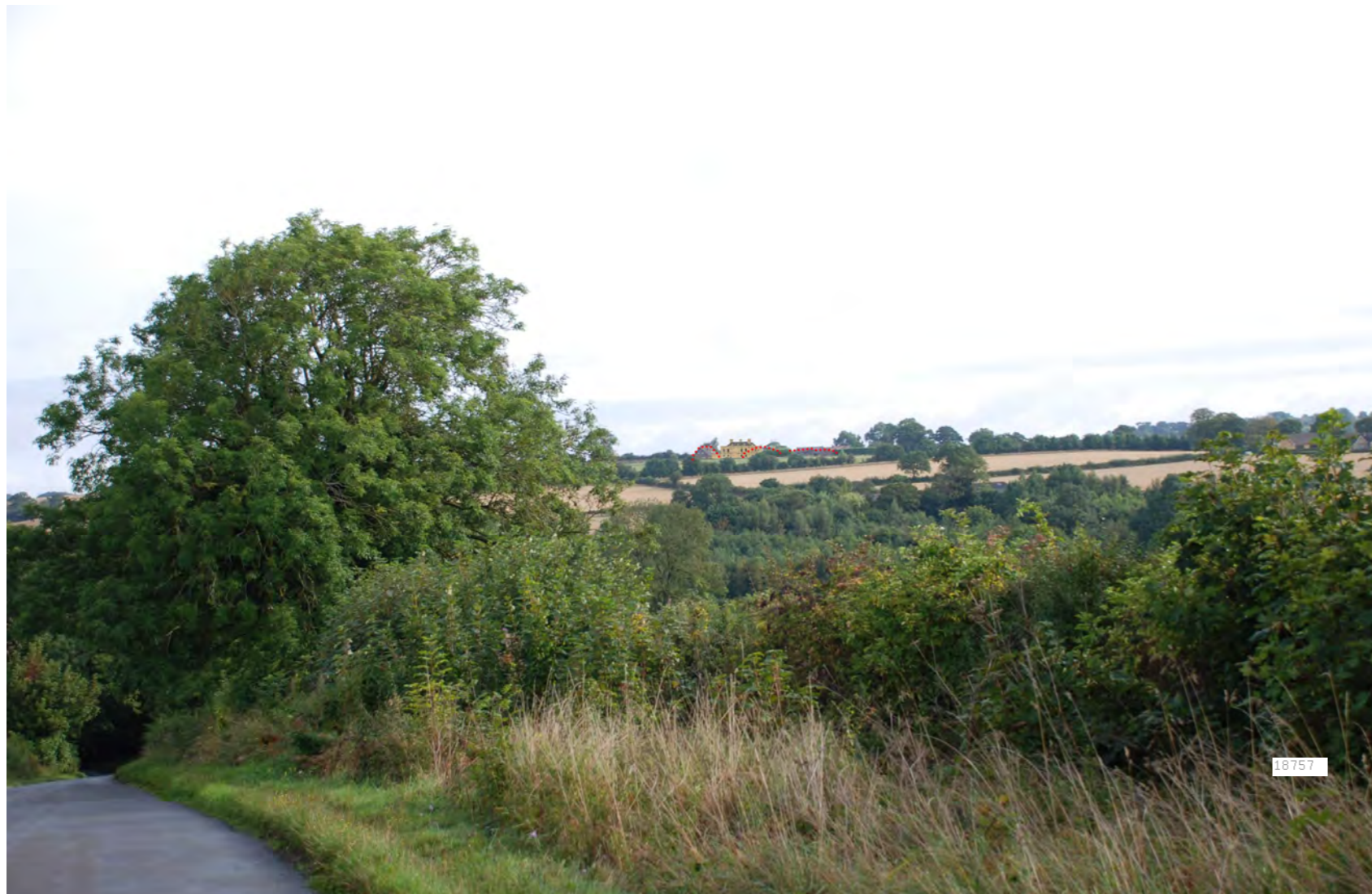
View showing replacement house (buildings to be removed shown with dashed red line)