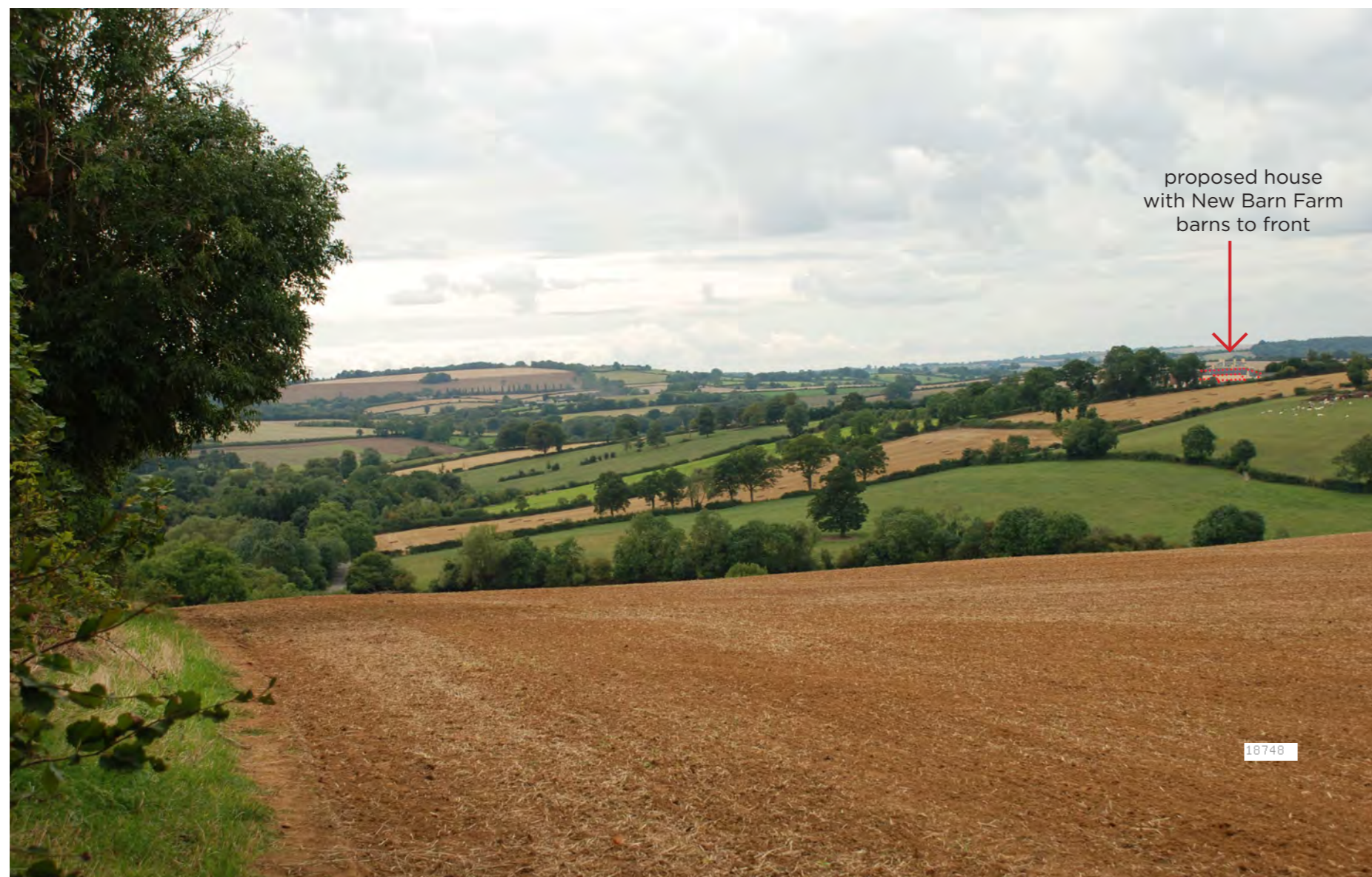
Zoomed in view showing replacement house (buildings to be removed shown with dashed red line)