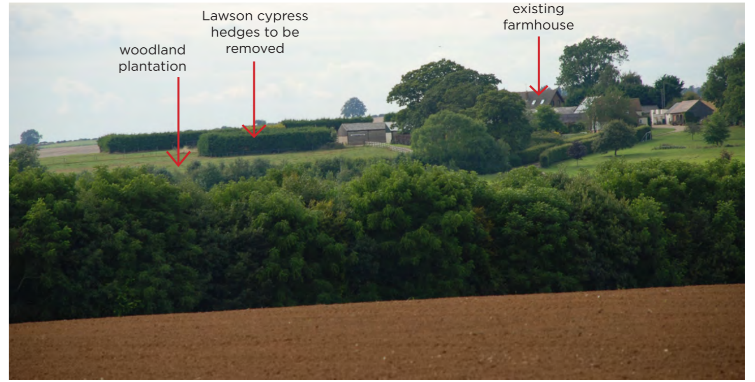
Zoomed in view