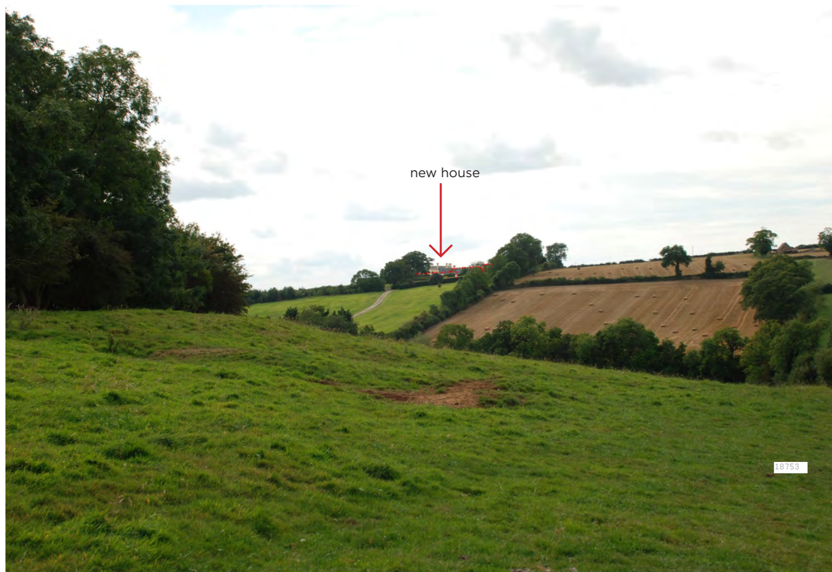
Zoomed in view showing replacement house (buildings to be removed shown with dashed red line)