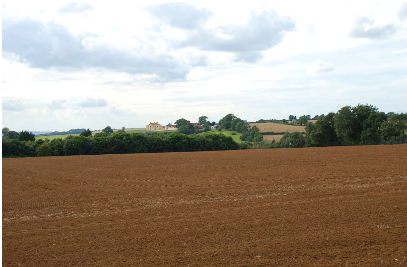
View showing replacement house (buildings to be removed shown with dashed red line)