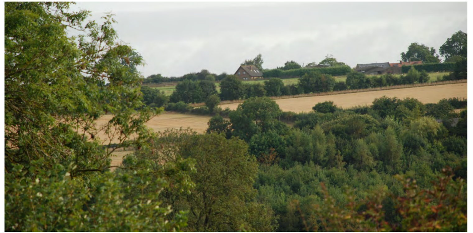
Zoomed in view