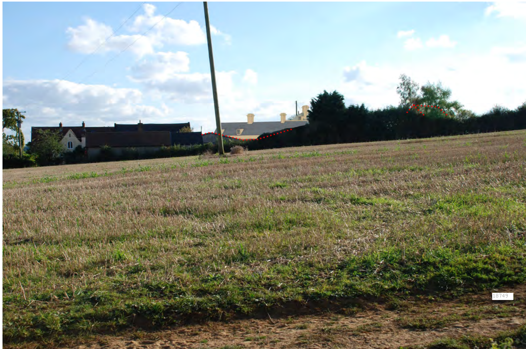
Zoomed in view showing replacement house (buildings to be removed shown with dashed red line)