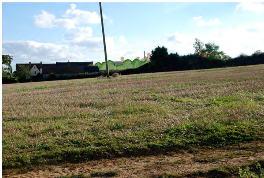
Figure 18 Sketch showing impact of planting on viewpoint 1B (FP 348/7)