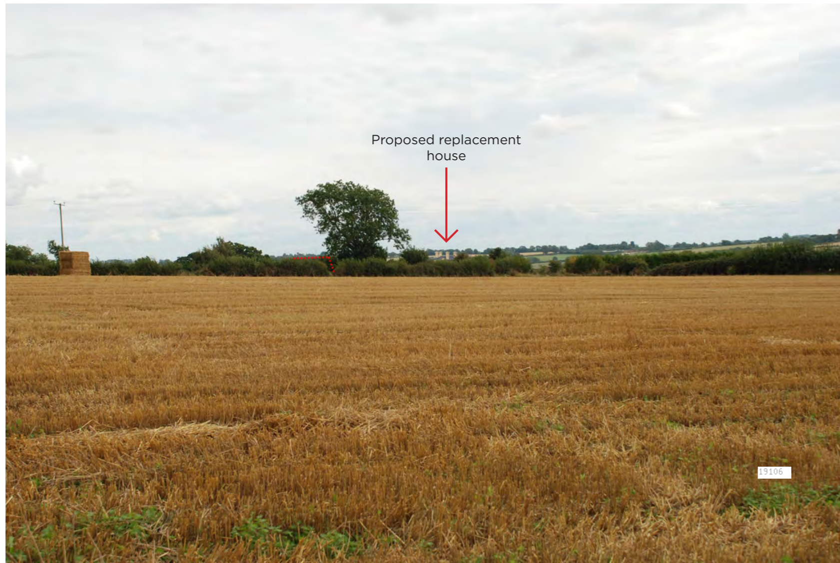
Zoomed in view showing replacement house (buildings to be removed shown with dashed red line)