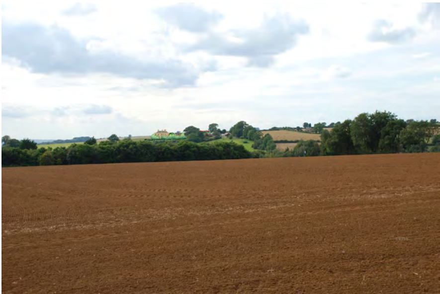
Figure 20 Sketch showing impact of planting on viewpoint VP5 (FP 347/2)