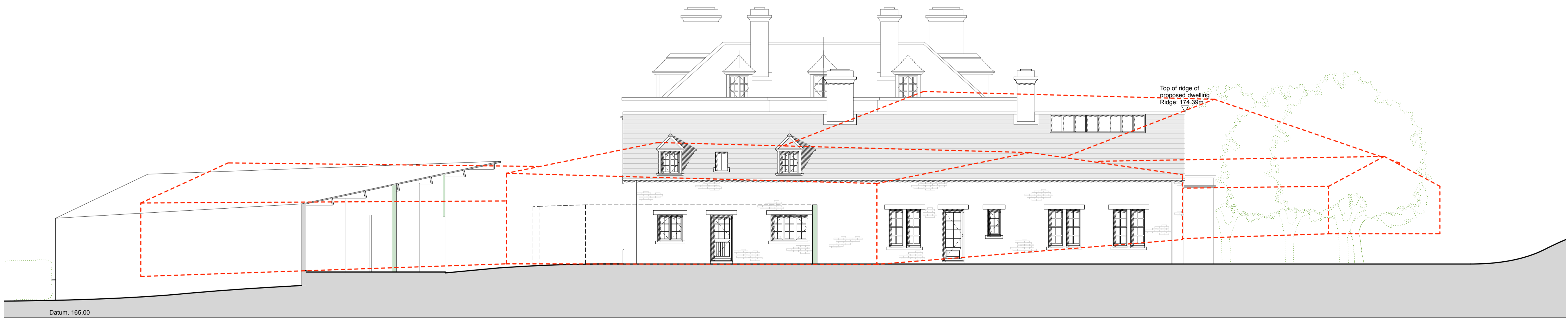
4: North East Elevation