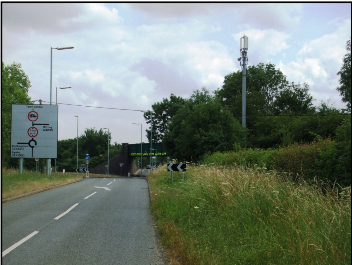
Plate 2: One of four mobile telecommunications masts (all on Messrs. Malins' land). This one is located near the roundabout at Bicester Road and the A4095