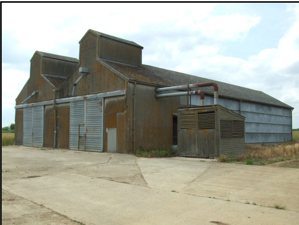
Plate 4: Asbestos clad building along Bucknell Road, located some 950m NW of the junction (roundabout) with the A4095 (Lord's Lane)