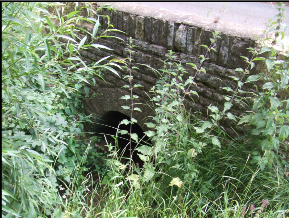
Plate 3: Stone-faced drainage culvert crossing beneath Bucknell Road at a location some 500m NW of the junction (roundabout) with the A4095 (Lord's Lane)