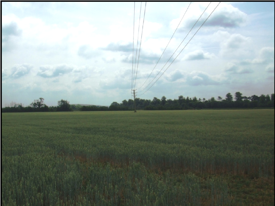
Plate 1: View of typical farmers fields at Bicester, with 33kv overhead cable