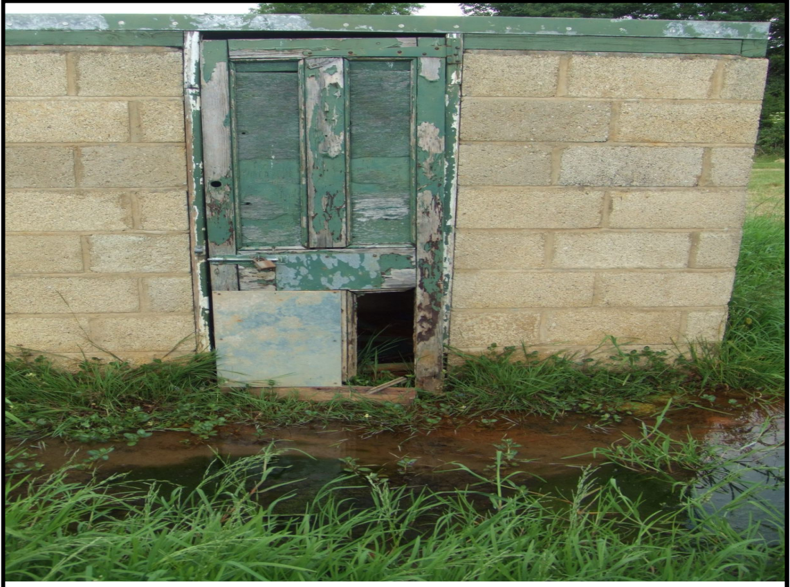
Plate 10 : Water Abstraction Point located on Messrs. Malins' land, between two mobile telecommunications masts (see Reference B3 on the Envirocheck Information drawing in Appendix A)