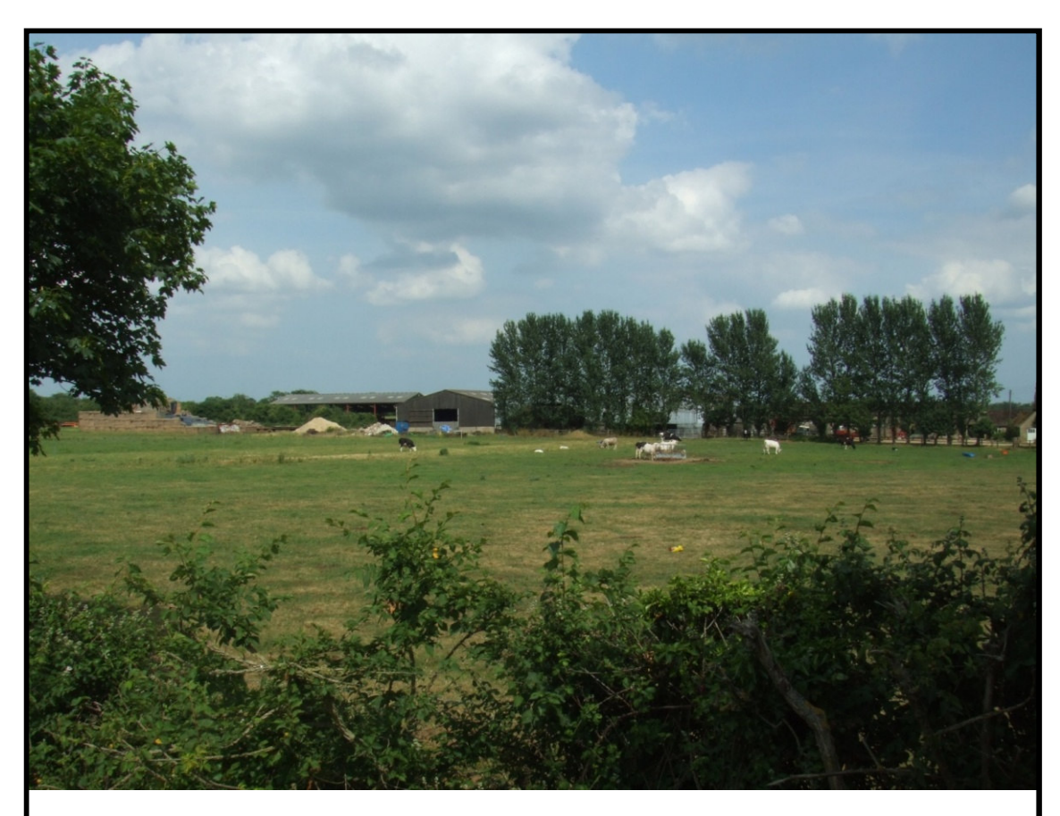
Plate 5: Cattle grazing in fields