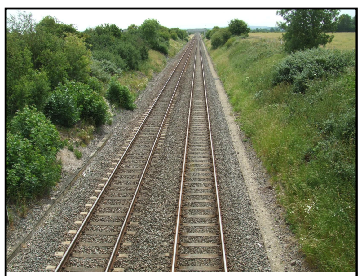
Plate 9 : The London to Birmingham railway line as it passes within the cutting beneath Middleton Road to the south-west of Bucknell village