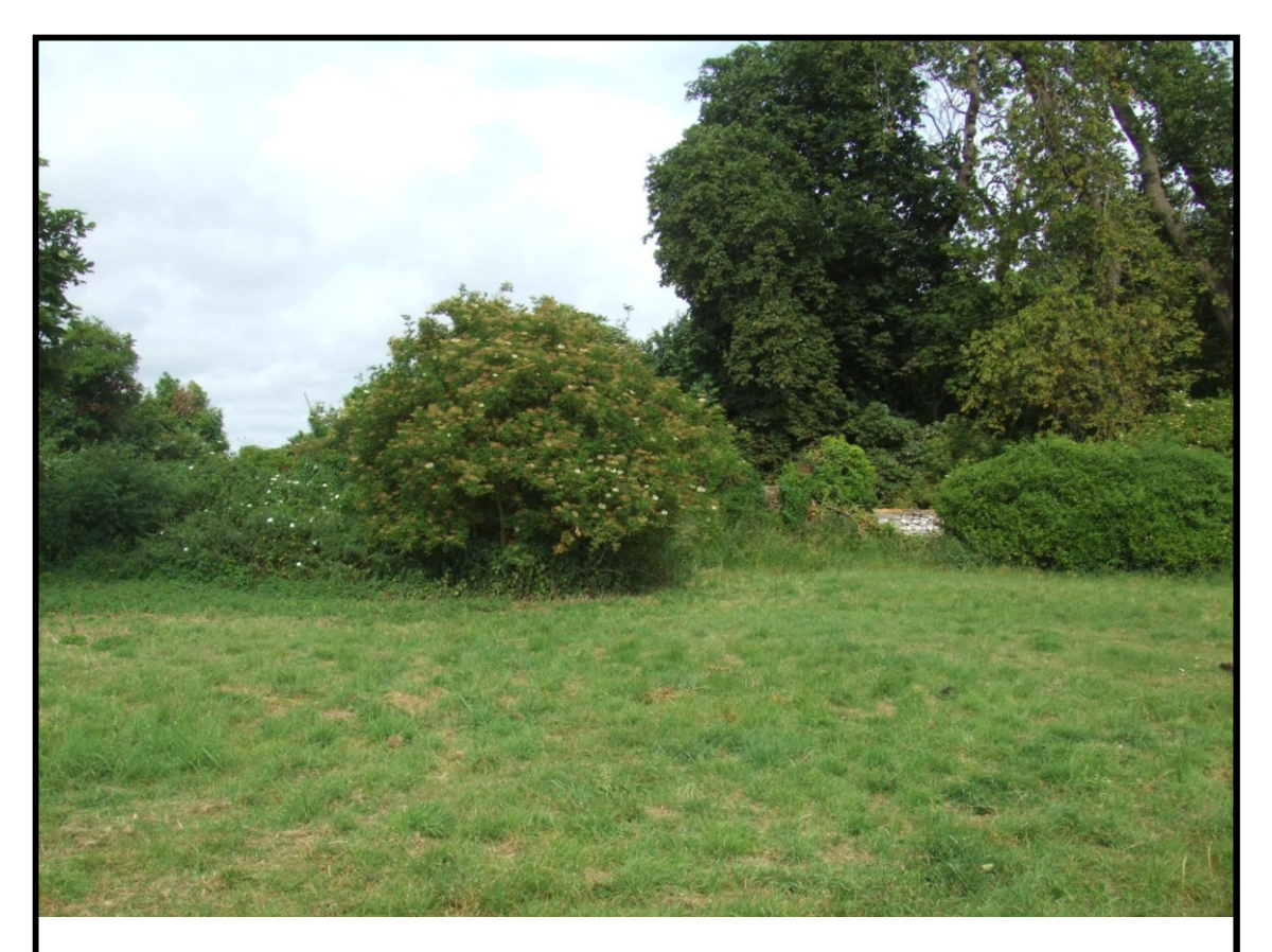
Plate 7 : Possible location of former quarry (see Reference D5 on the Envirocheck Information drawing in Appendix A)