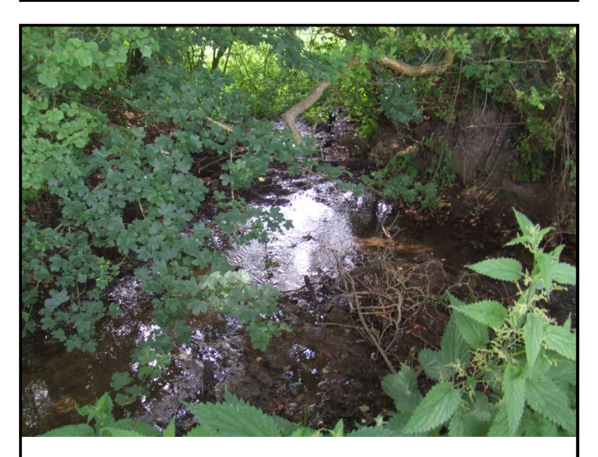
Plate 6: Most northerly of the two streams that feed the River Bure