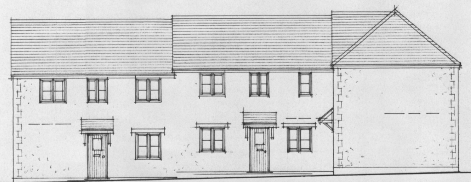
East Elevation 1:100

Notes: DO NOT SCALE. All dimensions must be checked/verified on site.