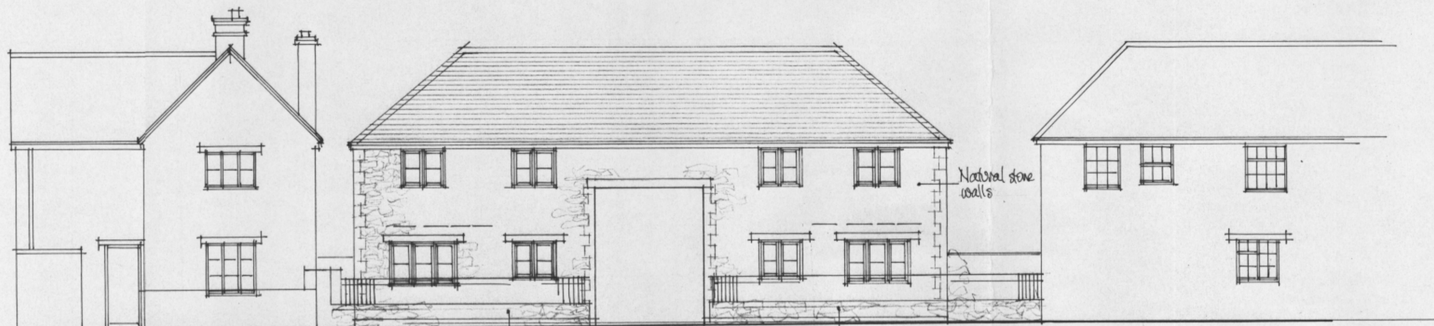
No.15 North Elevation 1:100

Natural stone walls maximum 600mm high with railings 700mm high.