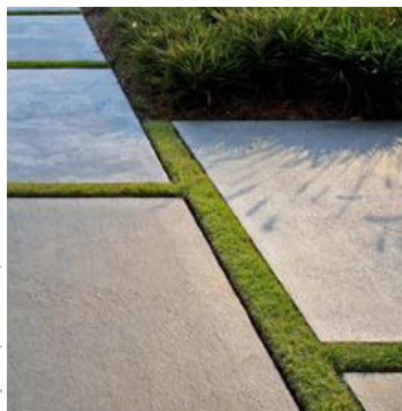
13. Large format flag paving set within grass