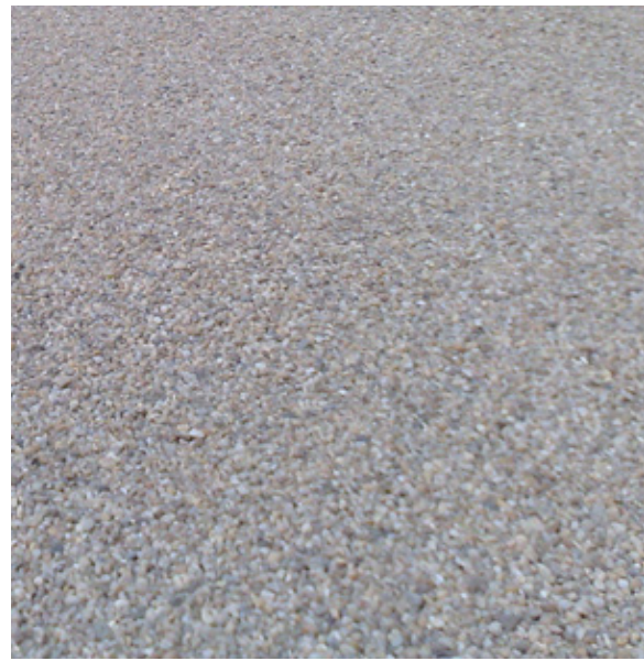
9. Resin bonded gravel