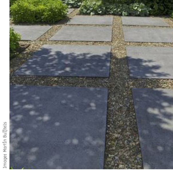
15. Large format flag paving set within gravel