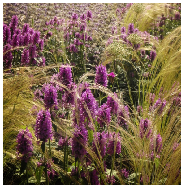
11. Ornamental grass and herbaceous planting