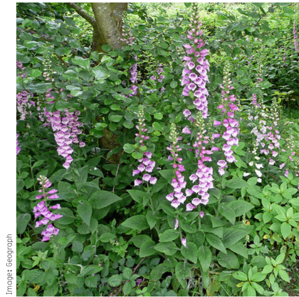
14. Woodland carpet