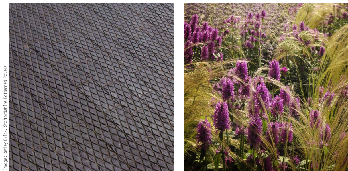
1. Blue engineering brick paver with diamond chequered pattern