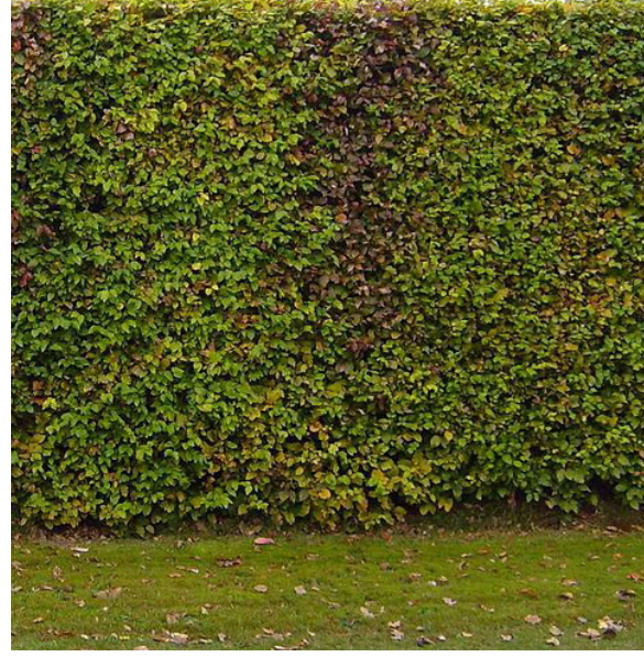
5. Hornbeam hedge

The landscape scheme serves to compliment the new dwelling design and provide a low-impact solution to the immediate surroundings.