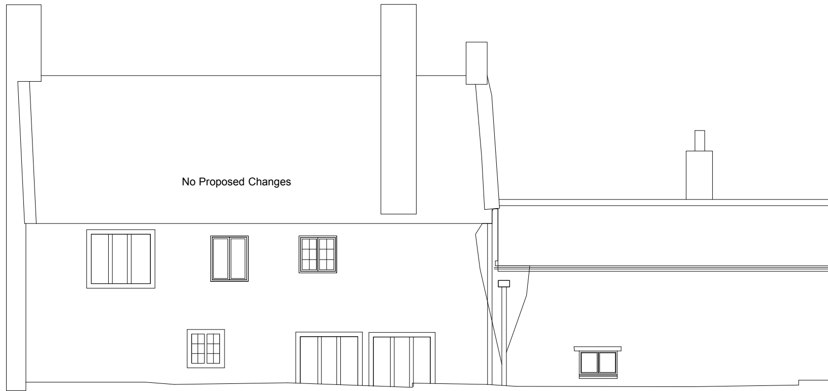
1 Proposed North Elevation - Part 1 Scale: 1:100