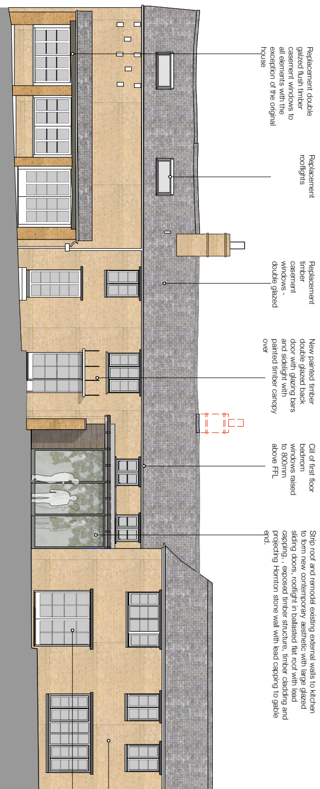
1 Proposed South Elevation - Part 1 Scale: 1:100

Replacement double glazed painted timber doors and sidelights with glazing bars. Replacement painted timber canopy above