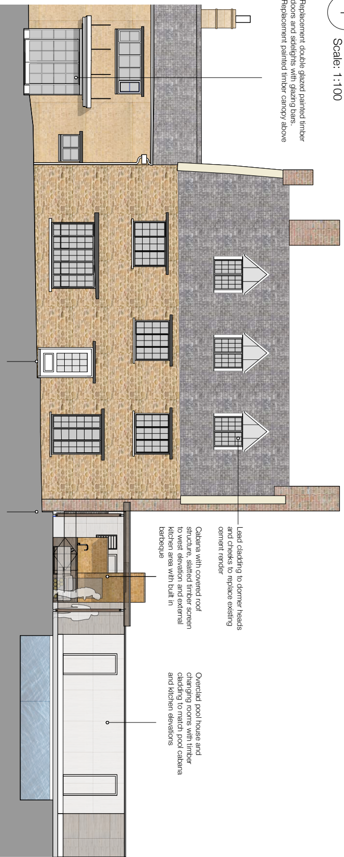
2 Proposed South Elevation - Part 2 Scale: 1:100

Replacement double glazed painted timber doors and sidelights with glazing bars. Replacement painted timber canopy above