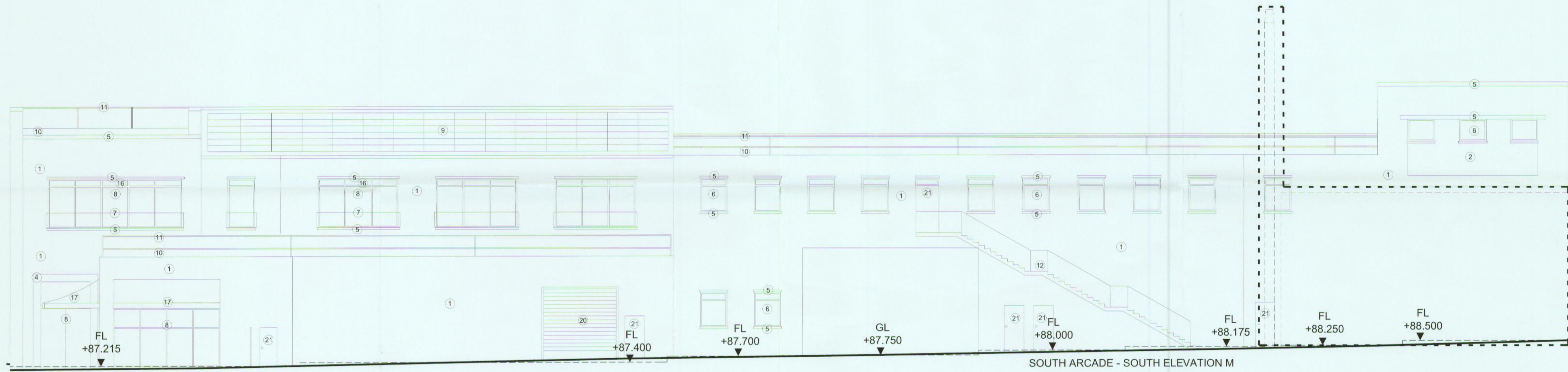
SOUTH ARCADE - SOUTH ELEVATION M