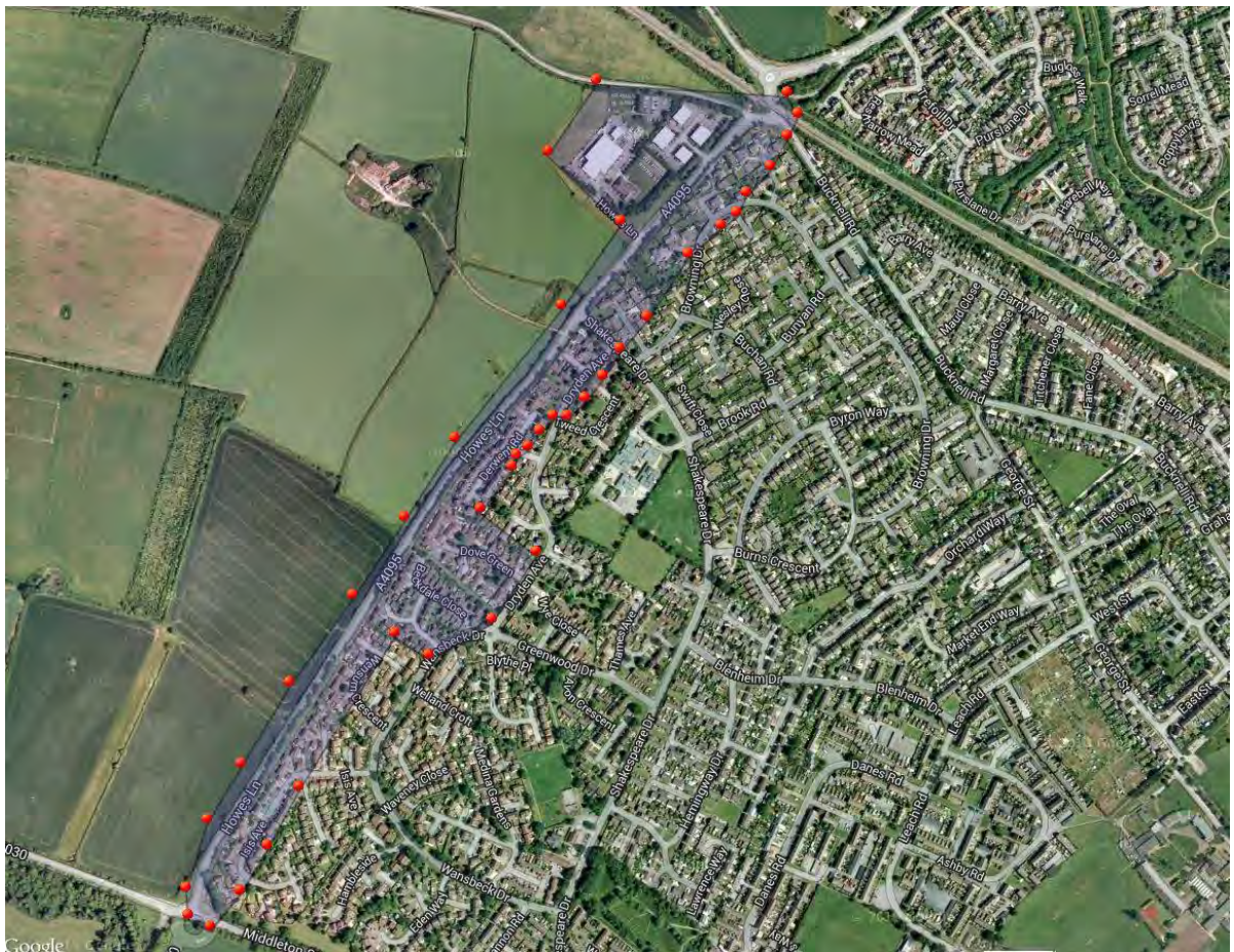
Howes Lane event consultation area

3.10.2 Residents from the surrounding area were informed of the dedicated event via invite letter, a copy of which is included in the Appendices.