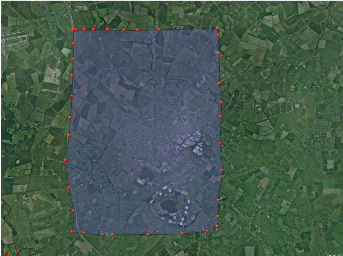
The consultation area

3.11.4As referenced, a dedicated stakeholder preview session was held on Thursday 5 December with the below individuals invited to attend. The stakeholder preview invitation letters, issued on 22 November 2013 with a copy of the invite newsletter, contained the details of the exhibition, as well as information relating to the telephone enquiry line and dedicated project website. Copies of the stakeholder preview invitation letters are included in the Appendices.