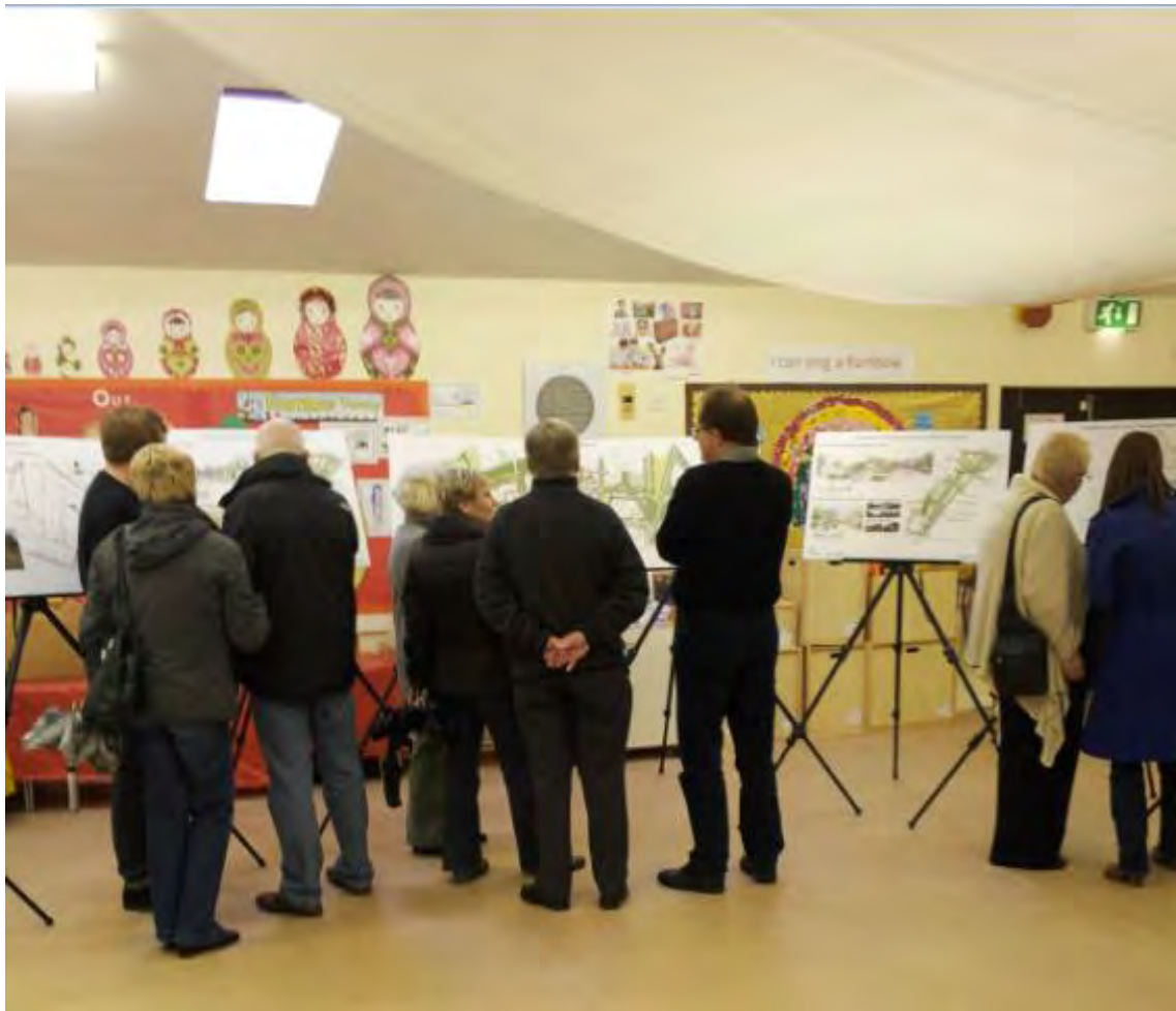
Residents at the Howes Lane event

3.10.4A total of 261 residents including 11 local businesses were invited to attend the event. A total of 66 residents attended over the course of the day with 34 completed feedback forms being returned.