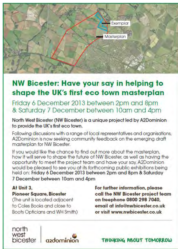
The Oxford Mail advert

3.11.5 To further raise awareness of the public exhibition, news releases were issued to the local and regional media including Oxford Mail, Bicester Advertiser and Review supported by paid for advertisements.