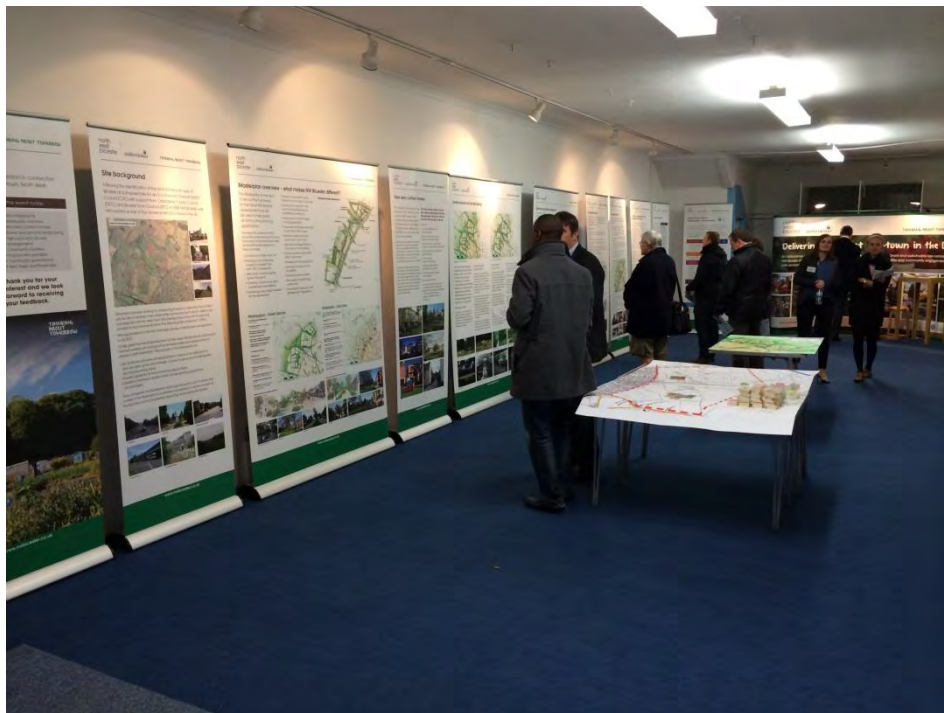
Residents view the display boards

3.11.8 Copies of the exhibition display boards are contained within the Appendices.