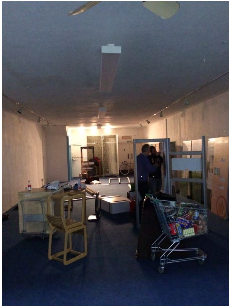
Unit 3 prior to the exhibition