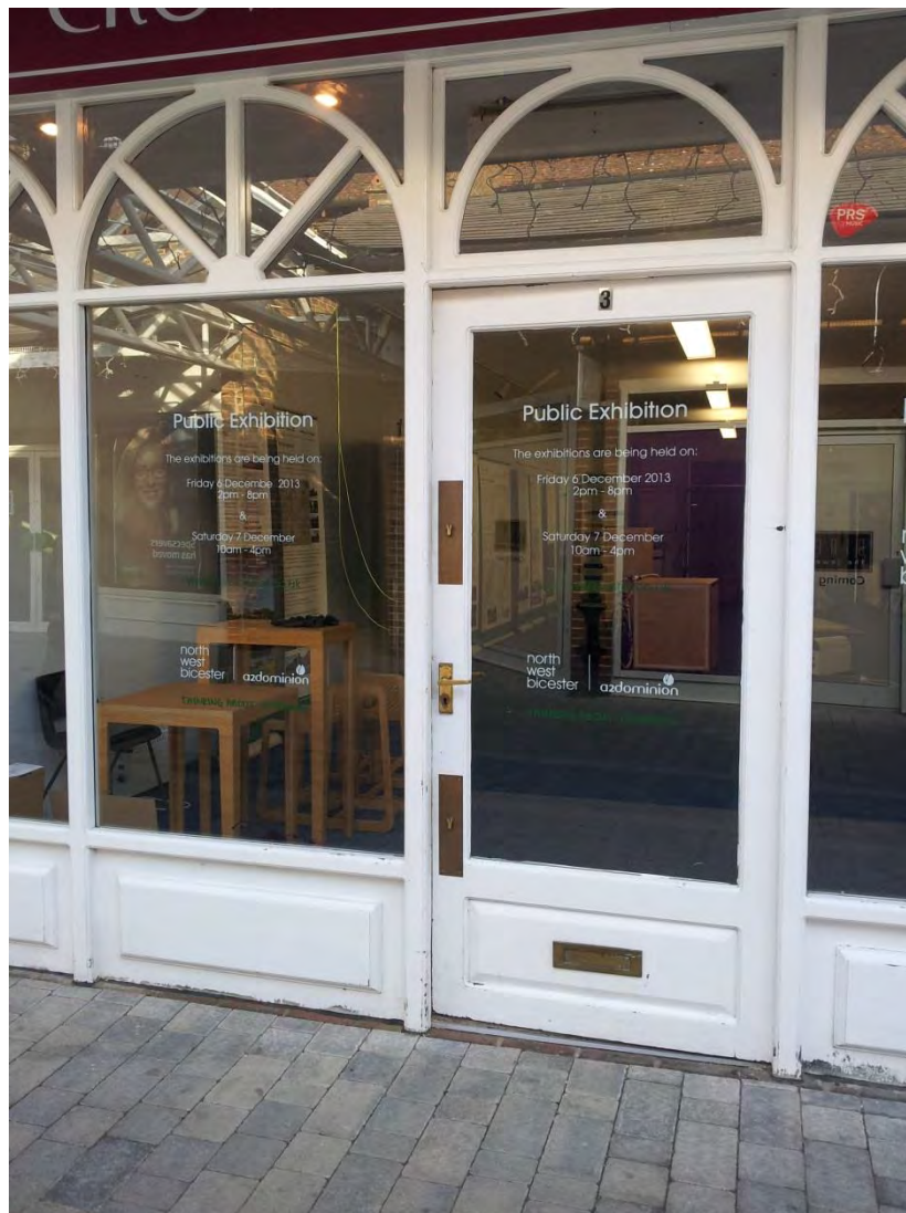
Unit 3, Crown Walk, Bicester

3.11.1 In order to provide the local community with every opportunity to view, consider and provide feedback on the draft Masterplan proposals, a public exhibition was held over the course of Friday 6 December between 2pm and 8pm and Saturday 7 December 2013 between 10.00am and 4.00pm in Unit 3, Crown Walk, Bicester. The public sessions were preceded by a dedicated stakeholder event held on Thursday 5 December between 3.00pm and 8.00pm.