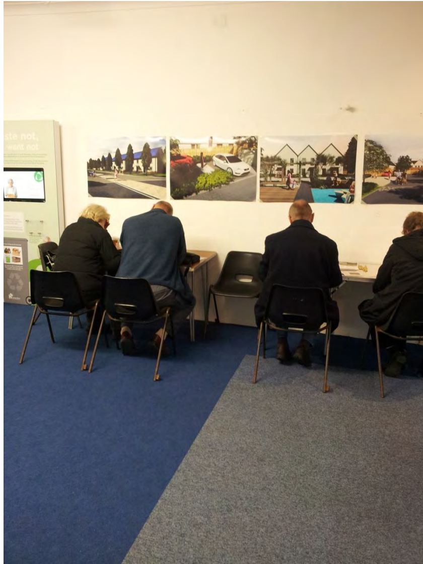
Residents completing feedback forms