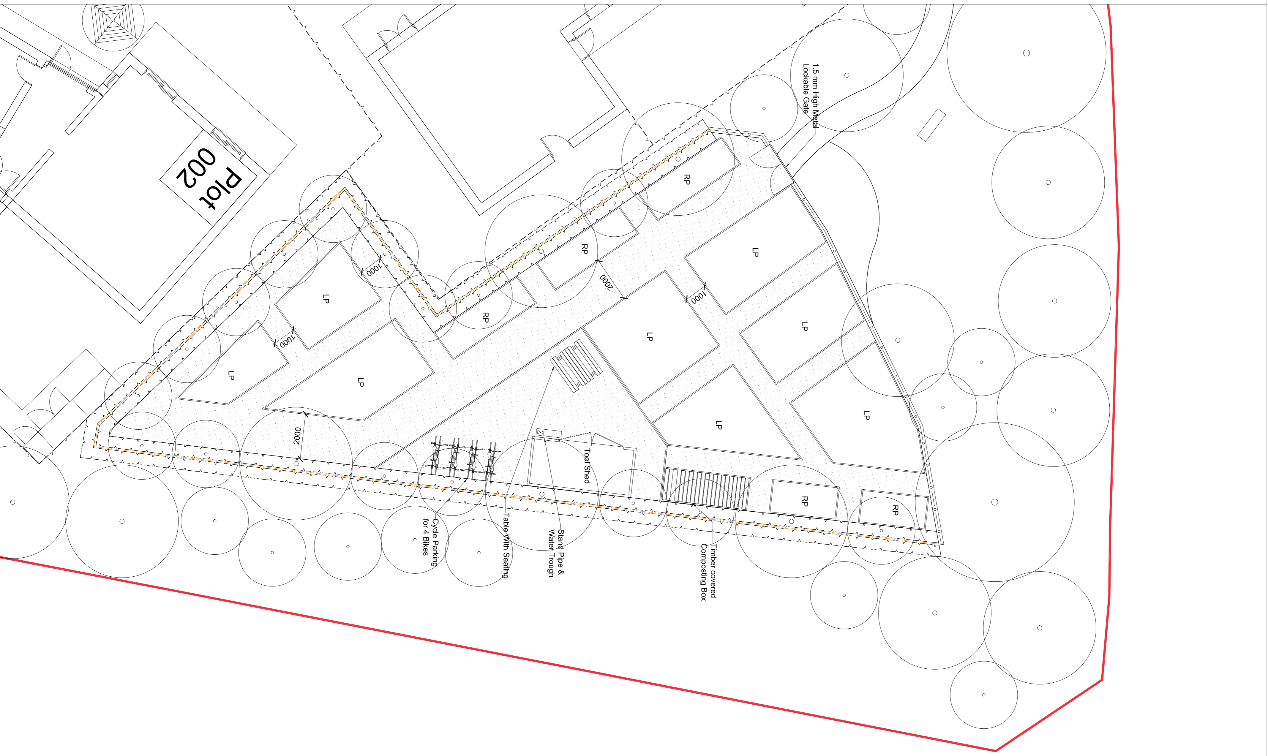
COMMUNITY GARDEN 9