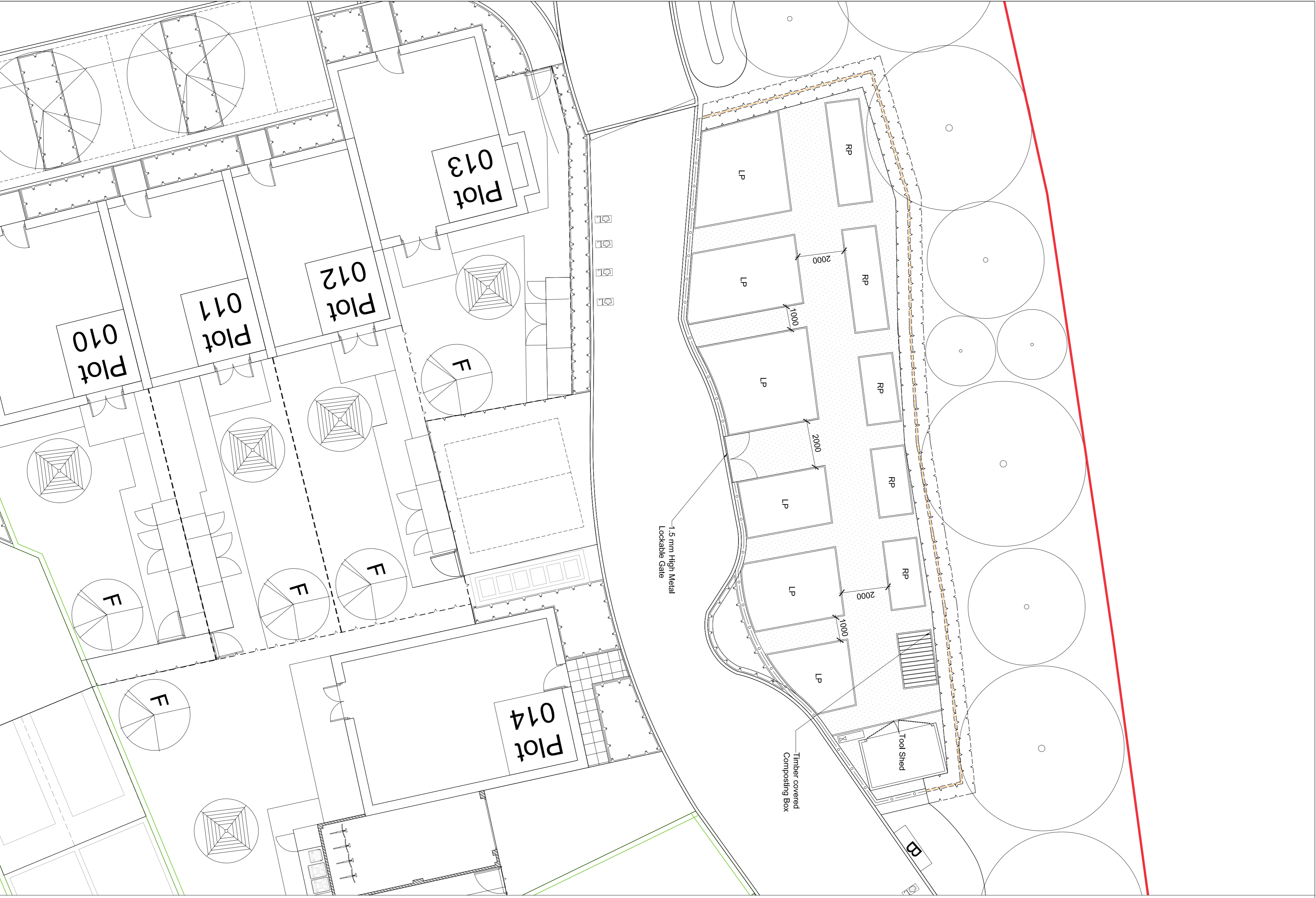
COMMUNITY GARDEN 8

PPP Architects 100 Old London Street London E1 1AA F +44 (0)20 7951 1200 E info@ppparchitects.co.uk