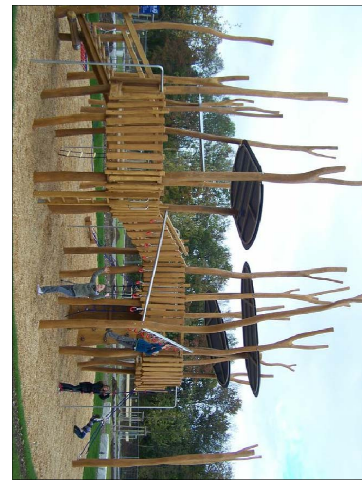
LEAP Play Equipment: Name: Climbing park 'Magie Forest' order number: 907723300R material: R: Robbhaak glazed manufacturer: FHS HOLZTECHNIK www.fhs-holztechnik.de or similar approved