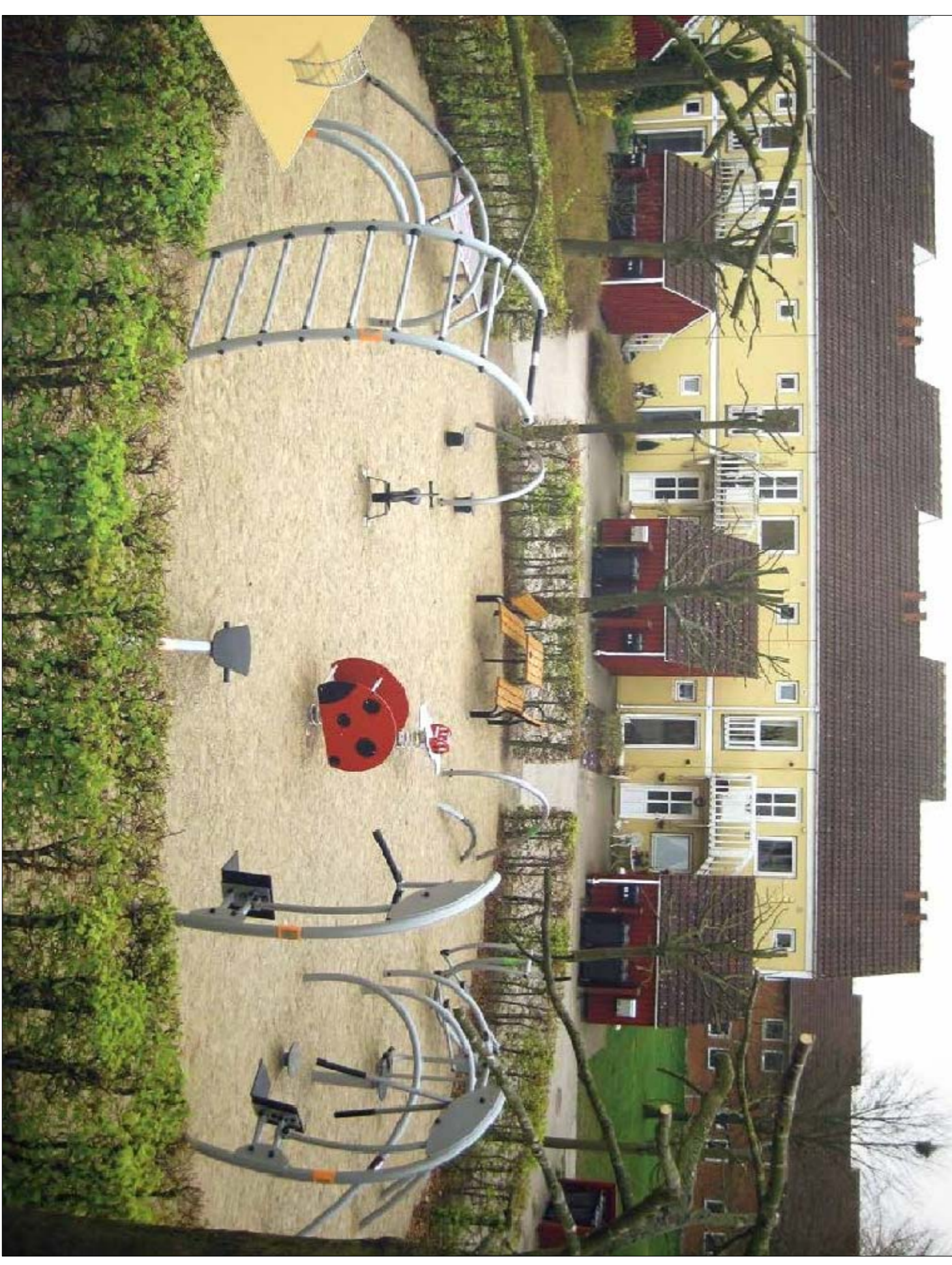
OUTDOOR GYM EQUIPMENT: BY NORWELL or similar approved