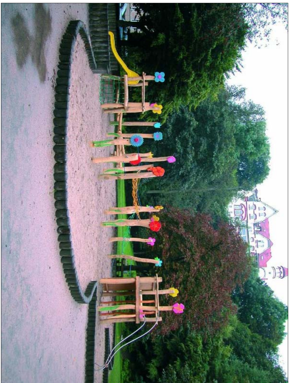
4. THEMATIC CLIMBING SYSTEM WITH SLIDE name: Gardener's playground: Sunflower climbing system order number: 50725250R material: R: Robinia/oak glazed

NOTES - The contractor is responsible for checking dimensions, tolerances and references. Any discrepancy to be verified with the Architect before proceeding with the work. - Where an item is covered by drawings to different scales the larger scale drawing is to be worked to. - Do not scale drawing. Figure dimensions to be worked to in all cases. CDM Regulations 2015 All current drawings and specifications for the project must be read in conjunction with the Designer's Hazard and Environmental Assessment Record.