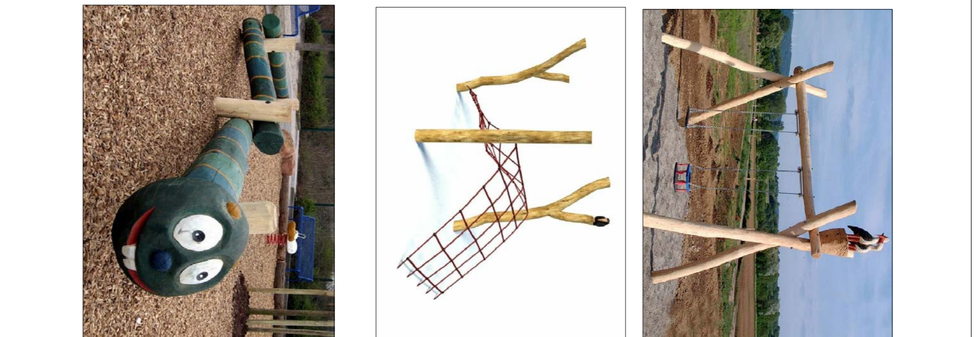
1. TIMBER SWING Russell Play 00-2 Cattle Seals Timber Swing or similar approved