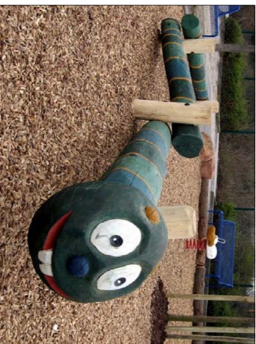
3. BALANCING TIMBER EQUIPMENT Russell Play H11 Hungry Caterpillar or similar approved