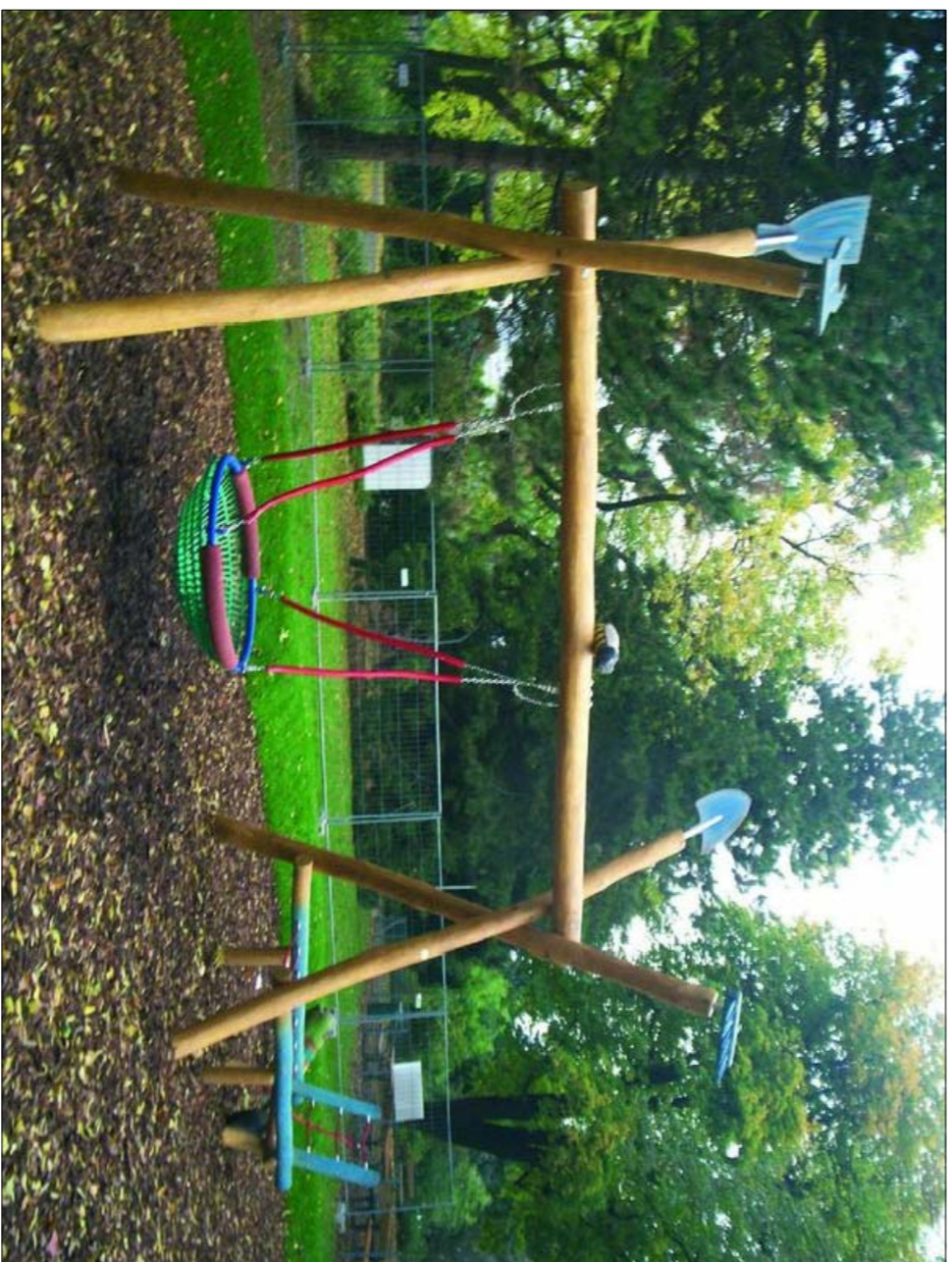
4. THEMATIC SWING name: Gardener's playground: Gardener's swing order number: 50725200R material:R: Robinia/oak glazed