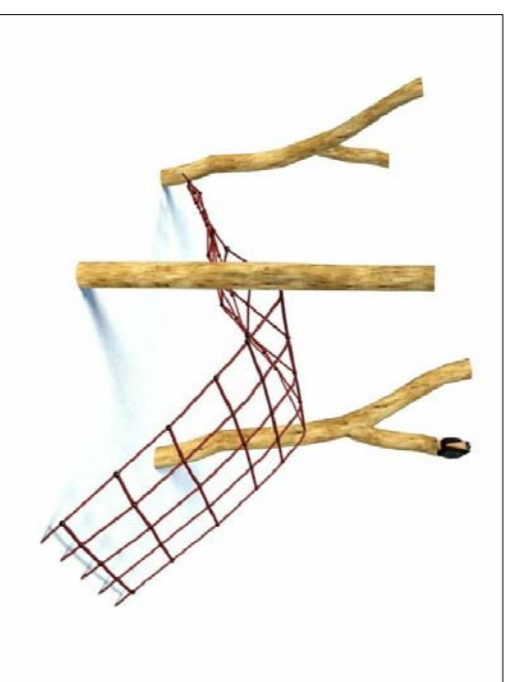
2. CLIMBING SET Russell Play 17-1 Bird Climbing Frame or similar approved