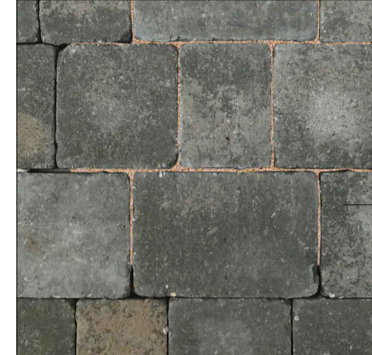
Charcon Woburn Rumbled 134 x 134 x 60mm. Colour - Graphite.