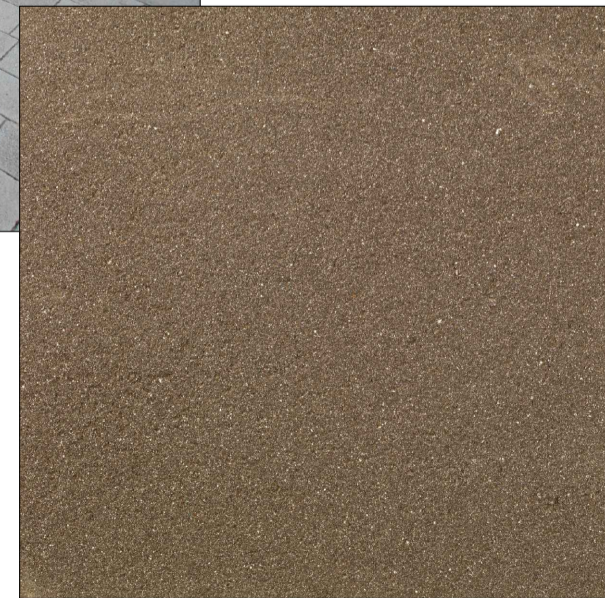
Charcon Infilta Andover textured (200+300+400) x 100 x 200mm. Colour - Oak. Pattern Random coarse.