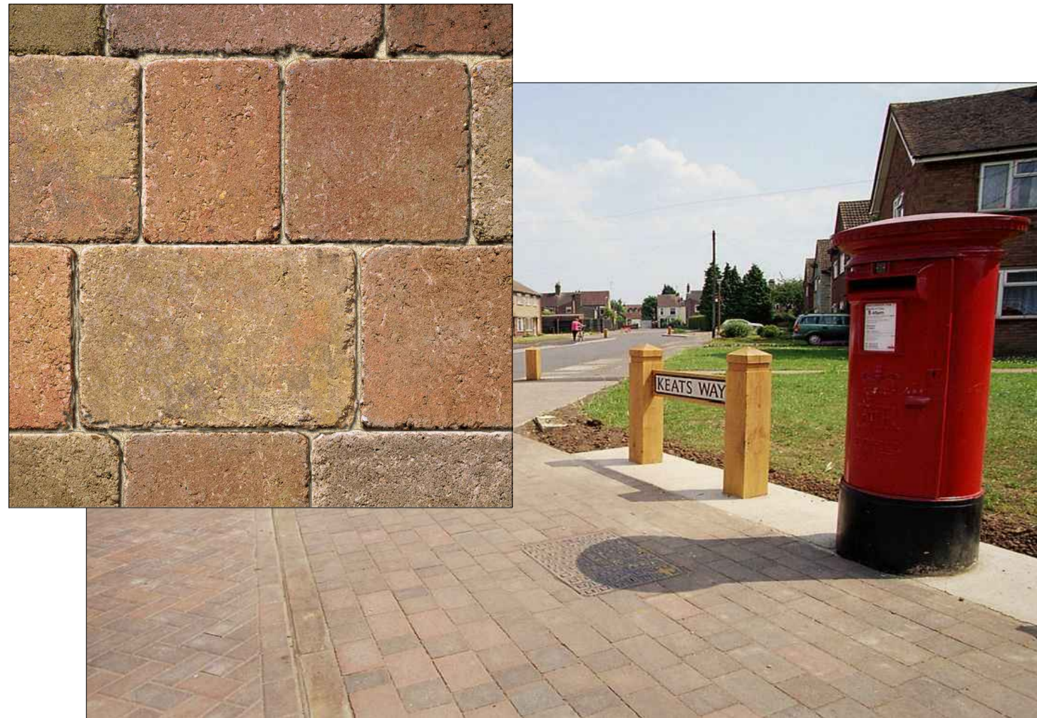
Charcon Woburn Rumbled 201 x 134 x 60mm. Colour - Autumn.