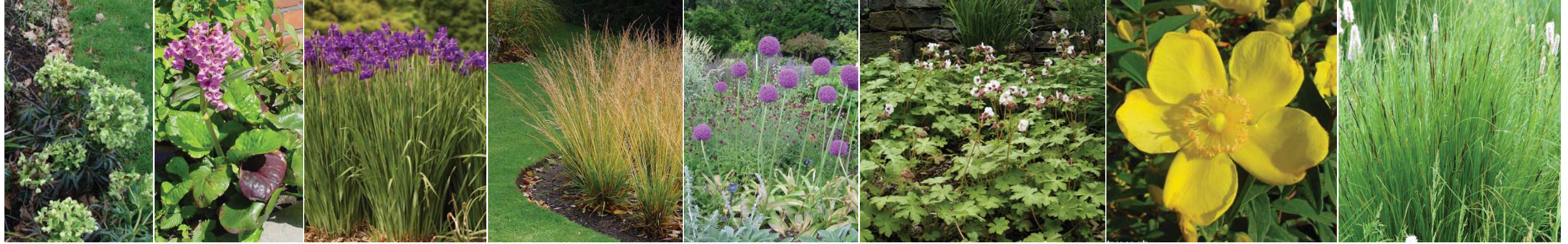
WINTER Helleborous foetidus