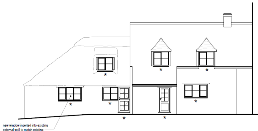
Proposed Elevation Scale 1:100

The existing windows are a part and parcel to the existing street-scene. The proposal, whilst not significantly changing the appearance, will respect the architectural character of the building and replacement of the existing windows provides an opportunity to achieve improvement to the general heritage of the street and the building it relates to.