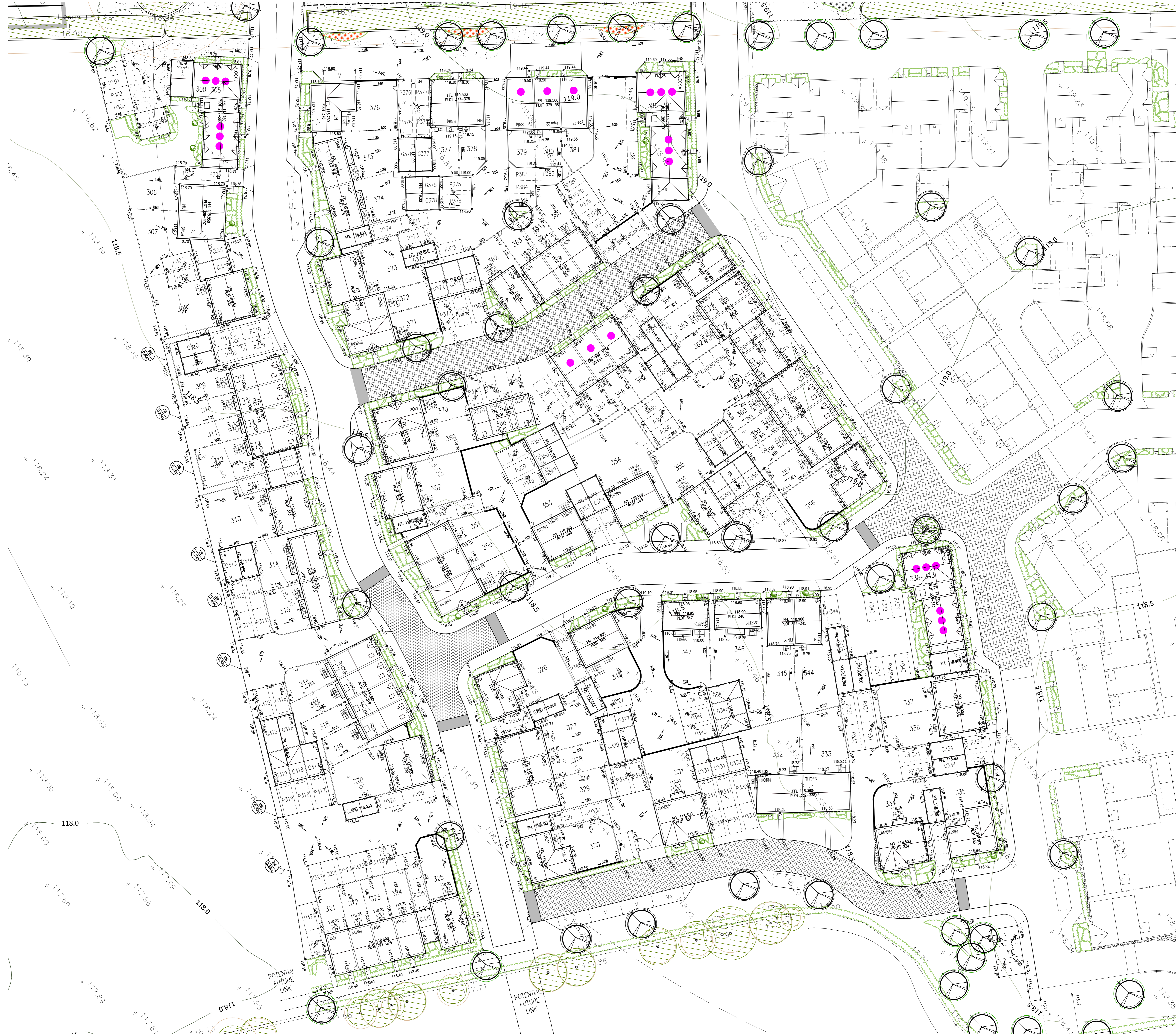
EXTERNAL WORKS LAYOUT