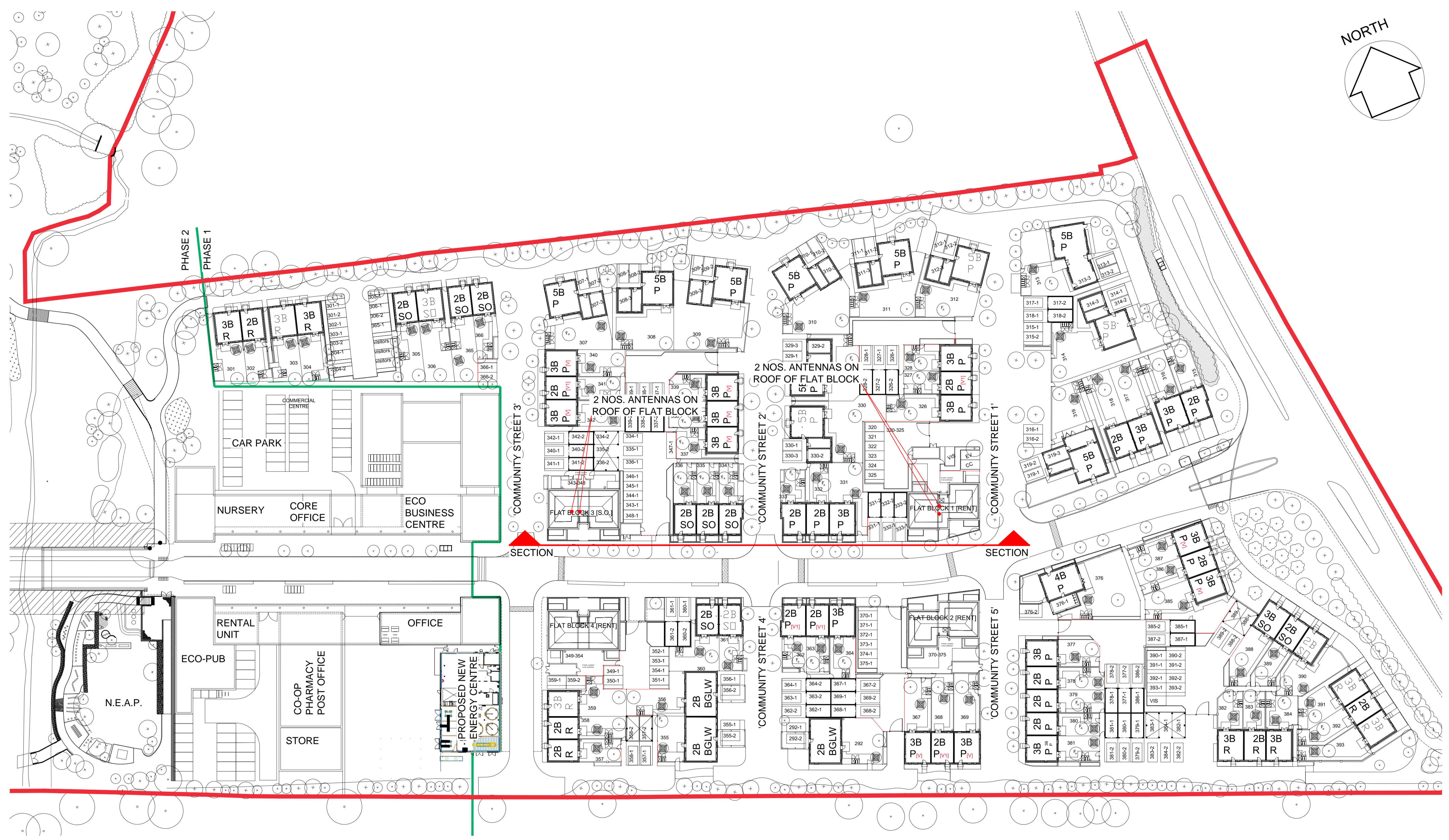
SITE PLAN - Scale 1:500