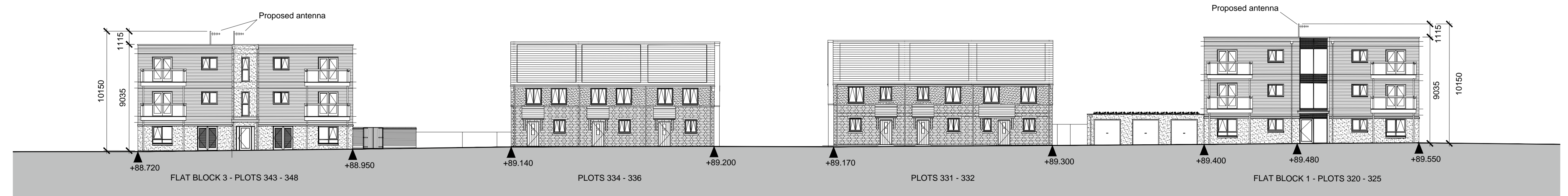
SECTION - Scale 1:200