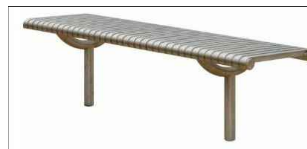
2. Marshalls M3 straight bench (or similar approved)