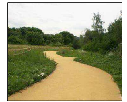
1. Self binding gravel