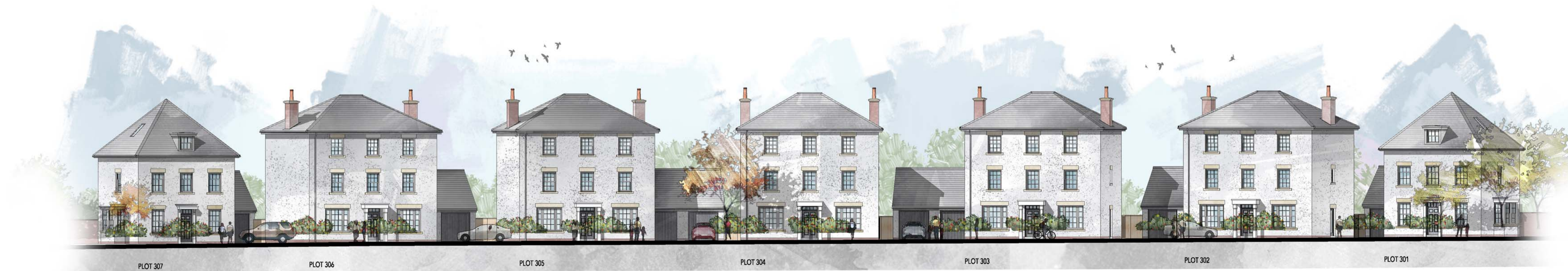
STREET SCENE 3 - VILLAGE GREEN