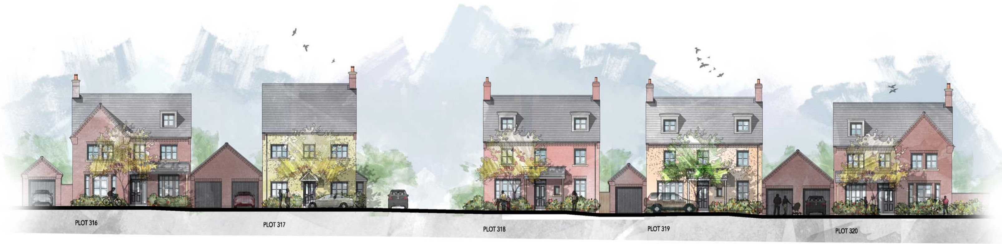
STREET SCENE 1 - CORE HOUSING EAST