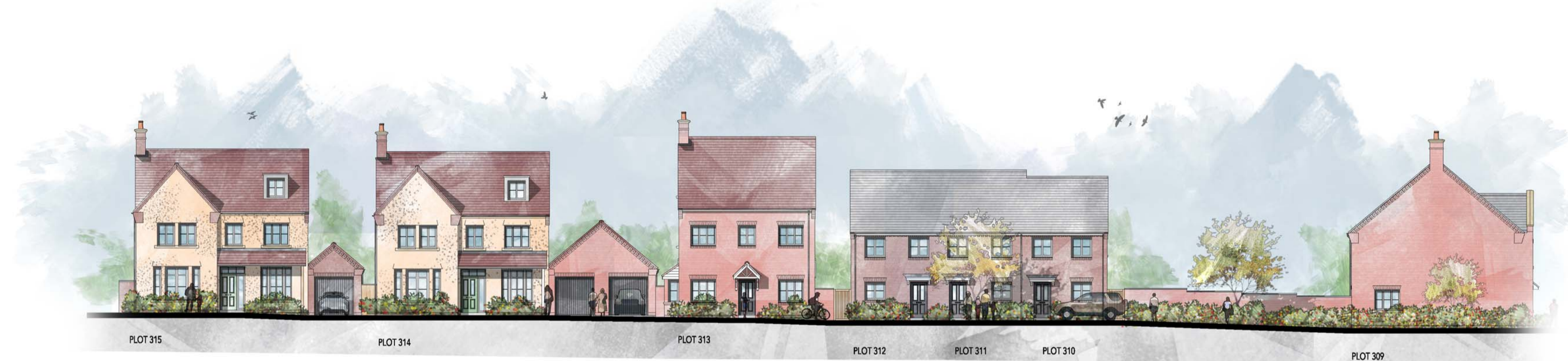
STREET SCENE 2 - CORE HOUSING EAST