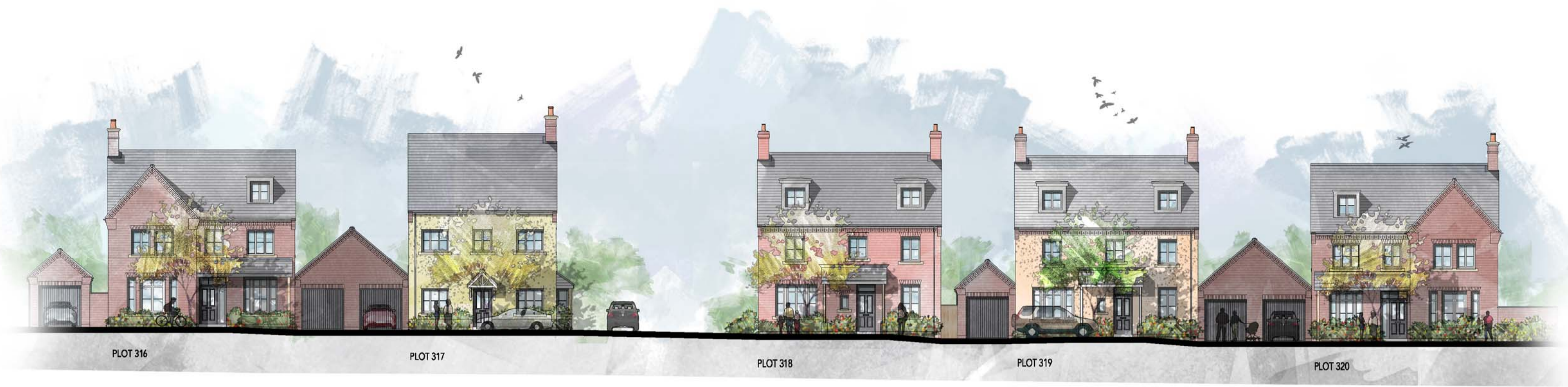
STREET SCENE 1 - CORE HOUSING EAST