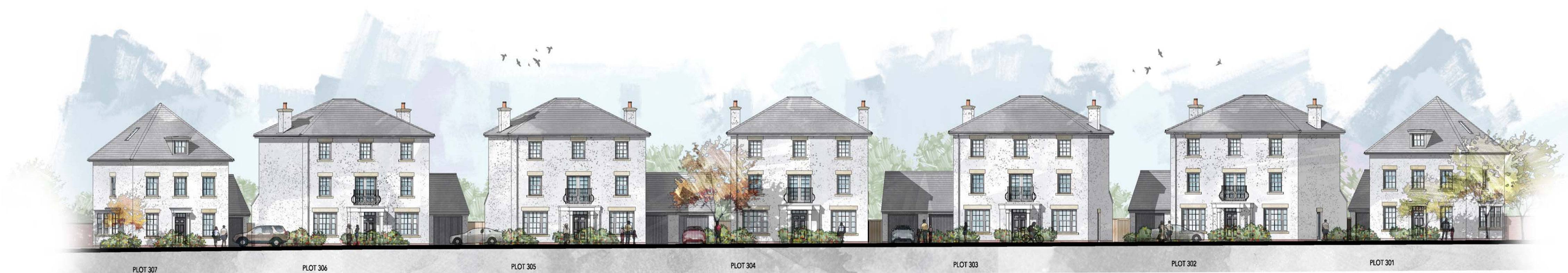
STREET SCENE 3 - VILLAGE GREEN