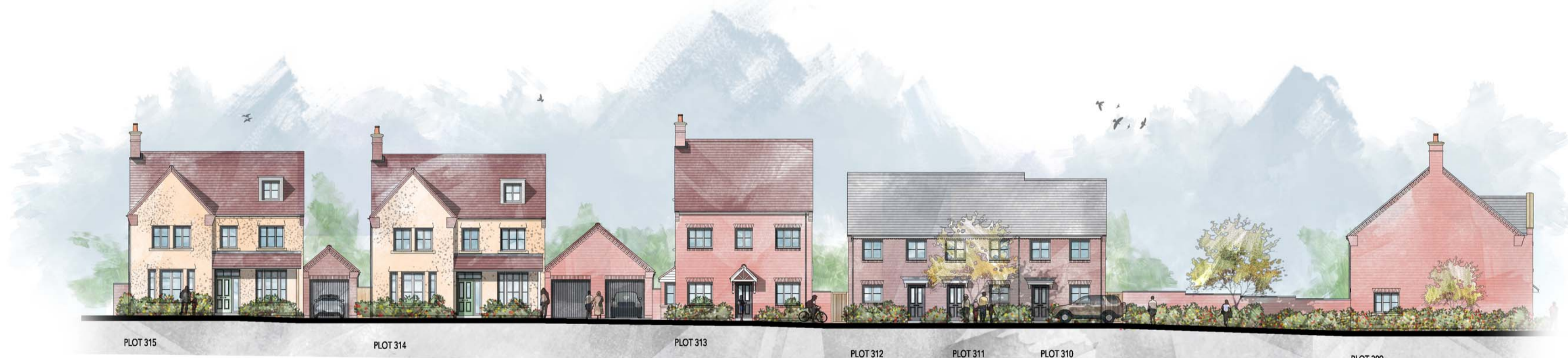
STREET SCENE 2 - CORE HOUSING EAST