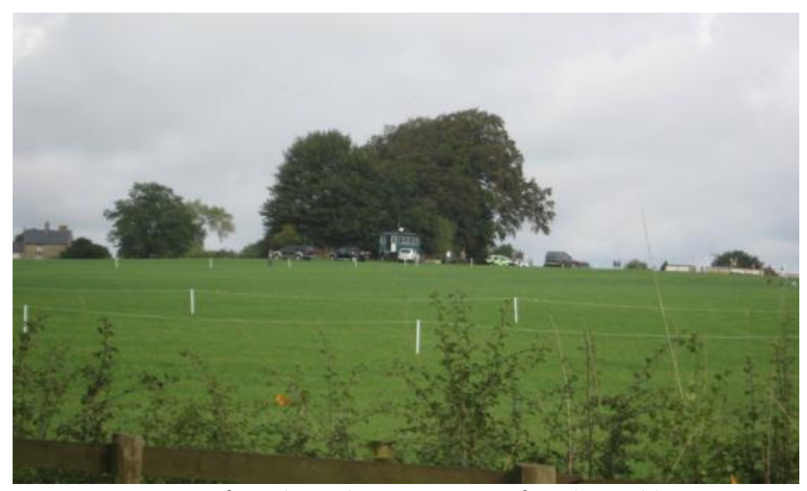
View of Loud Speaker Box at Top of 28 day Field