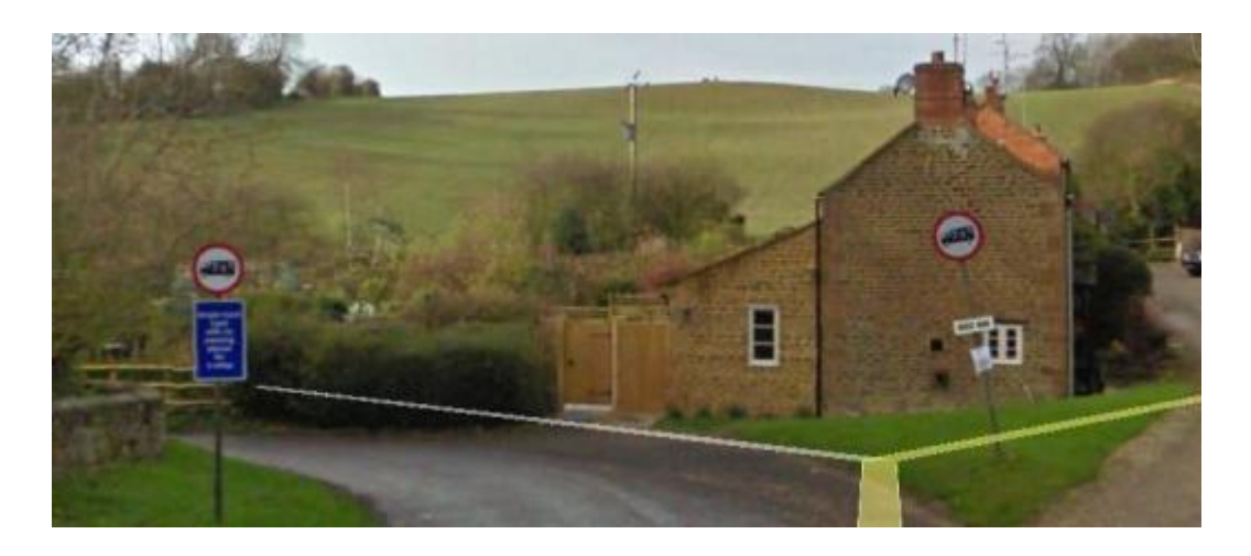
Weight Limit Signs at the Top of Park Lane