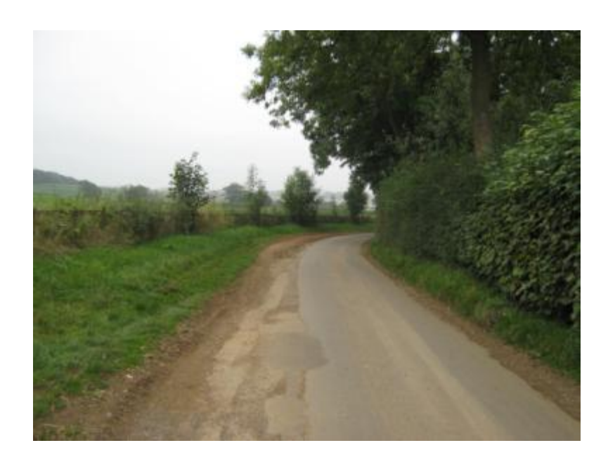
View of the damage on Grange Lane