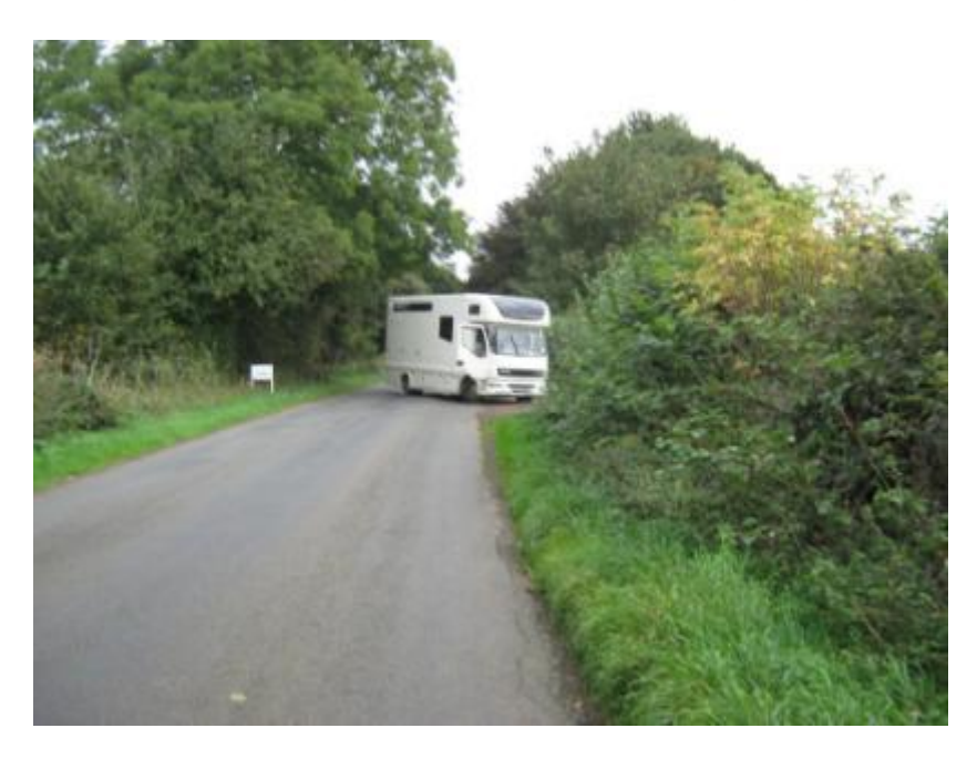
Vehicles approaching from the East along Main Street Blocking the Highway whilst the Passenger opens Gate

During the day it was observed that there was no traffic management on the gate and the drivers or passengers of the horseboxes and cars entering and leaving the site had to alight and open and close the gate themselves and the photos below show the obstruction that was occasionally caused by this operation. This would obviously be exacerbated during larger events.