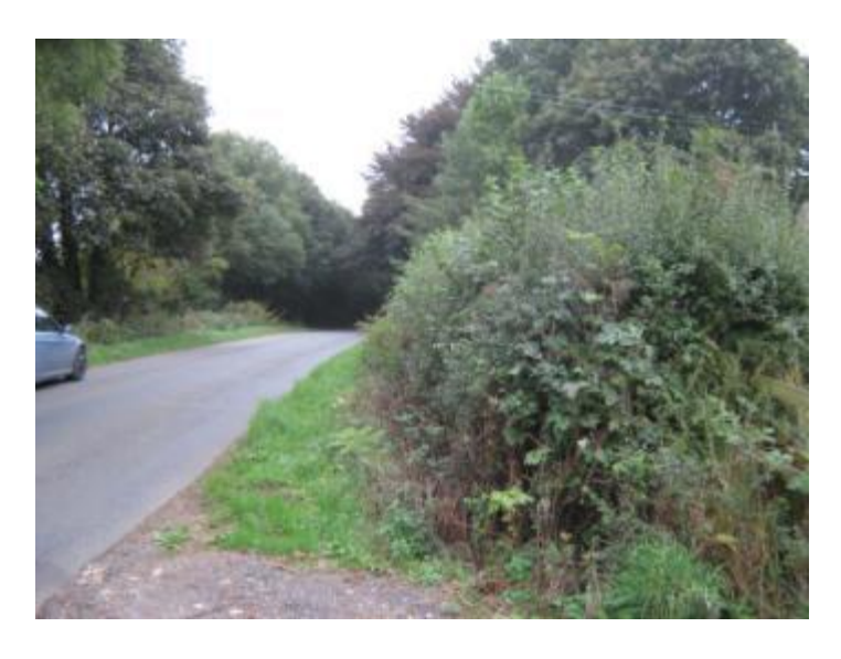
Visibility to the right from the 28 day Field Access

The photos in the Transport Statement show this access onto what has been previously called the" 28 Day Field" but is now the application site. This has gateway has been developed without planning permission and provides insufficient turning space so vehicles straddle the highway to gain access to the fields. It is the main entrance used for horseboxes and cars for the competitions. Whilst the hedges in the photo contained in the Transport Statement were taken in the winter, the photos on 5<sup>th</sup> October 2013 shows there is restricted visibility for those exiting the site.