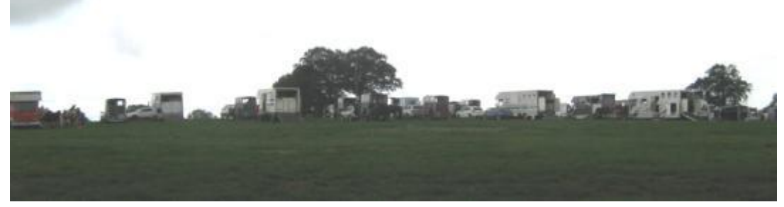
Parking on 28 day field