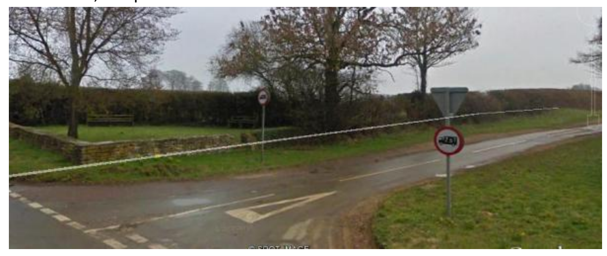
North End of Grange Lane Showing 7.5T Weight Limit Sign

The photos of this junction in the Transport Statement illustrate quite clearly that Grange Lane is unsuitable for large horseboxes and for cars to pass one another. The verges have been severely overrun beyond the 2.5m tarmac road and the Highway Authority have reinforced this issue by imposing a 7.5T limit on the road, See photo below.