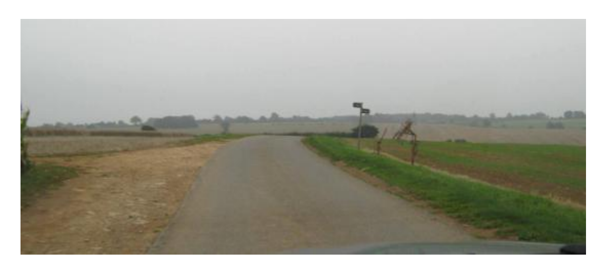
Mid-Way down Park Lane (Some maps refer to this as a continuation of Grange Lane)