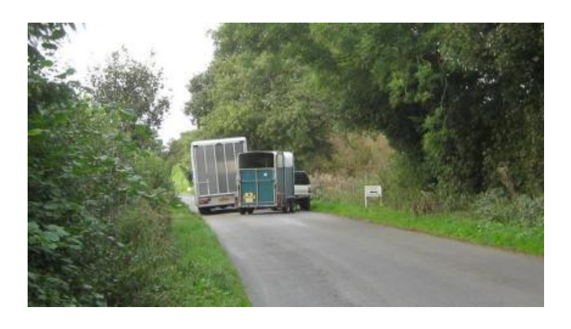
Vehicles exiting to the West along Main Street Blocking the Highway whilst the Passenger closes the Gate