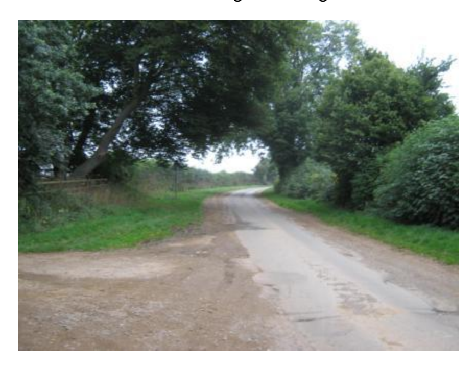
View of the damage i on Grange Lane

With the use of an enlarged park for Lorries at Grange Farm, this route will be used by large horseboxes during wet and indeed wintry weather conditions when these verges will become slippery and even more dangerous especially as speeds have been recorded over 30mph.