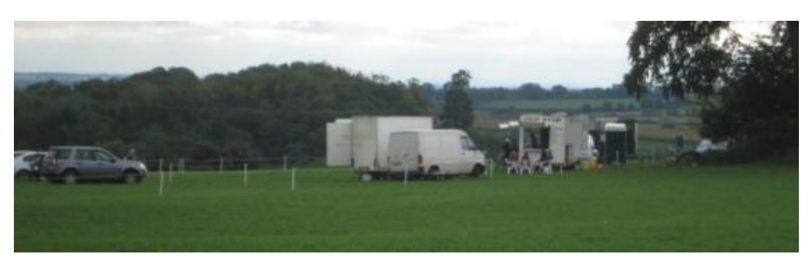
Commercial Element using 28 day field