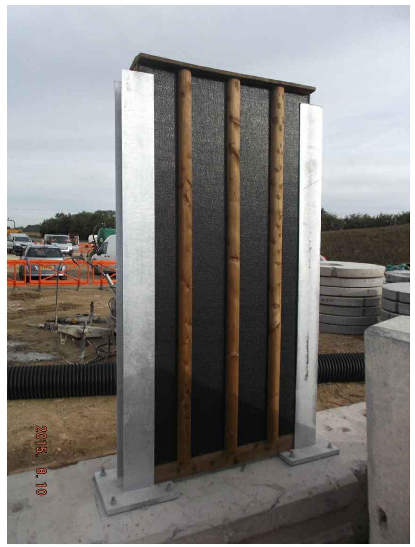
TYPICAL VIEW OF BARRIER FROM RAIL SIDE