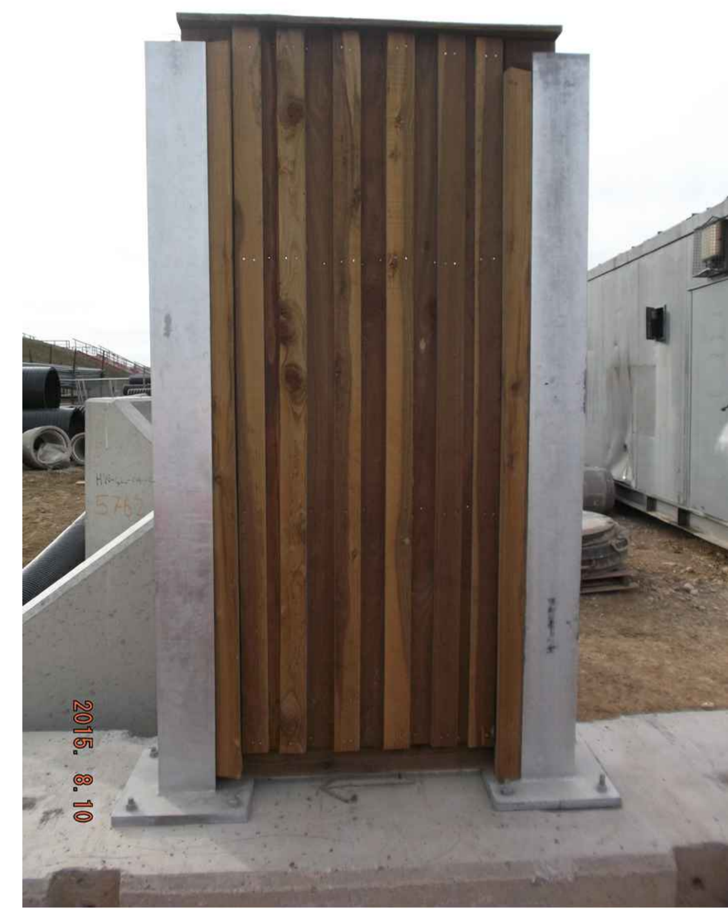
TYPICAL VIEW OF BARRIER FROM PUBLIC SIDE