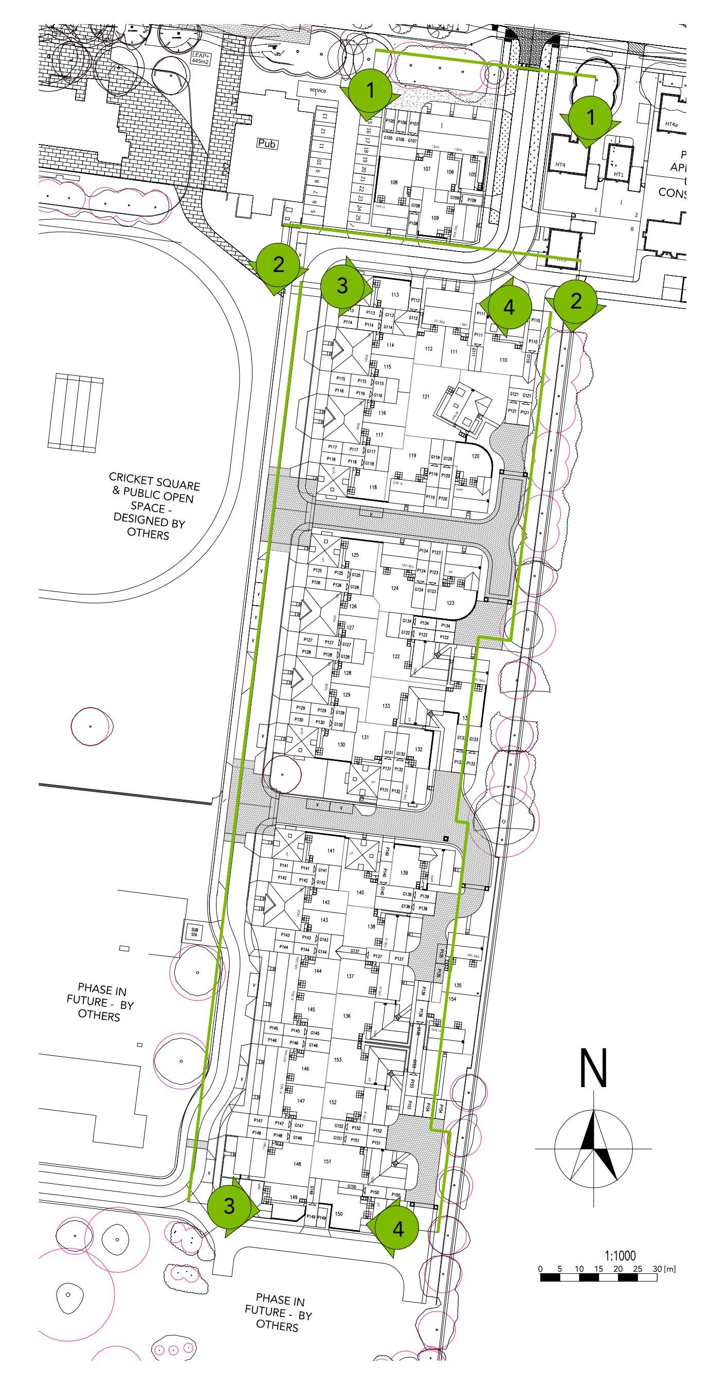
STREET SCENES 2 VILLAGE CENTRE (OFF CAMP ROAD)