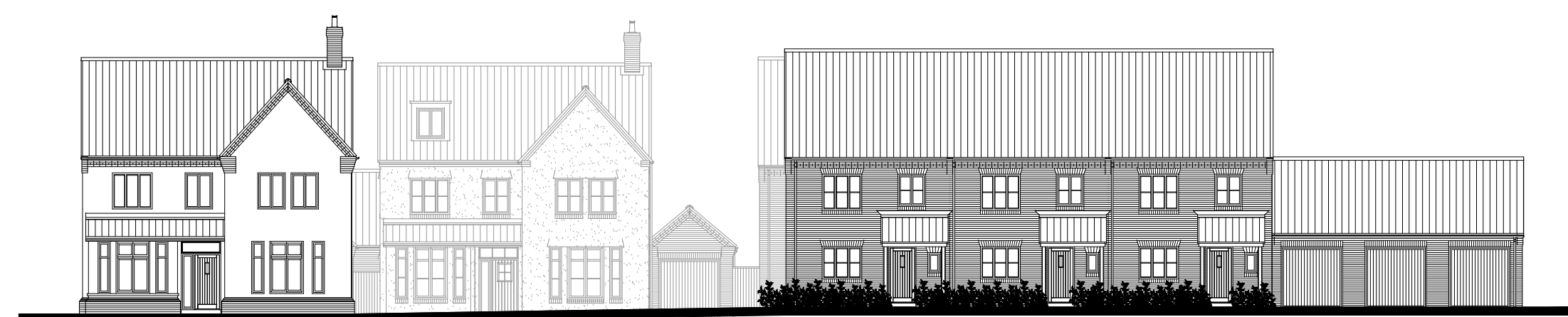
PLOT 105 PLOT 106 PLOT 107

REVISIONS: A. 2014-10-25. Street scenes amended following changes made to the planning layout REV A. SRS B. 2014-11-13. Street scenes amended following changes made to the planning layout REV B. SRS C. 2014-11-23. Street scenes amended following changes made to the planning layout REV C. SRS