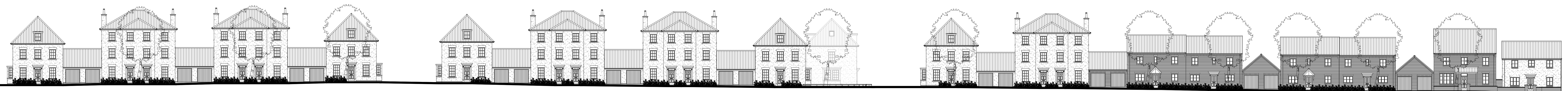
PLOT 113 PLOT 114 PLOT 115 PLOT 116 PLOT 117 PLOT 118 PLOT 119 PLOT 120 PLOT 121 PLOT 122 PLOT 123 PLOT 124 PLOT 125 PLOT 126 PLOT 127 PLOT 128 PLOT 129 PLOT 130 PLOT 131 PLOT 132 PLOT 133 PLOT 134 PLOT 135 PLOT 136 PLOT 137 PLOT 138 PLOT 139 PLOT 140 PLOT 141 PLOT 142 PLOT 143 PLOT 144 PLOT 145 PLOT 146 PLOT 147 PLOT 148 PLOT 149