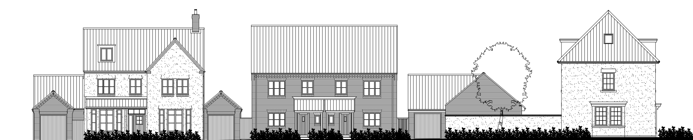
PLOT 110 PLOT 111 PLOT 112 PLOT 113