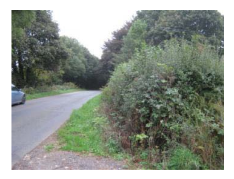
Visibility to the right from the Northern Field Access on to Main Street

The view photos (See Photos in the Transport Assessment) show this access onto what has been classified as the 28 day field(top field). This is a permanent feature for the equestrian activities on the farm and on the site visits on both the 29<sup>th</sup> September and the 5<sup>th</sup> October 2013 this was the ONLY entrance used for horseboxes and cars. Whilst the hedges in the photo are a winter scene, visibility photos shown below are an autumn scene taken on the 5<sup>th</sup> October 2013 and show there is restricted visibility for those exiting the site.