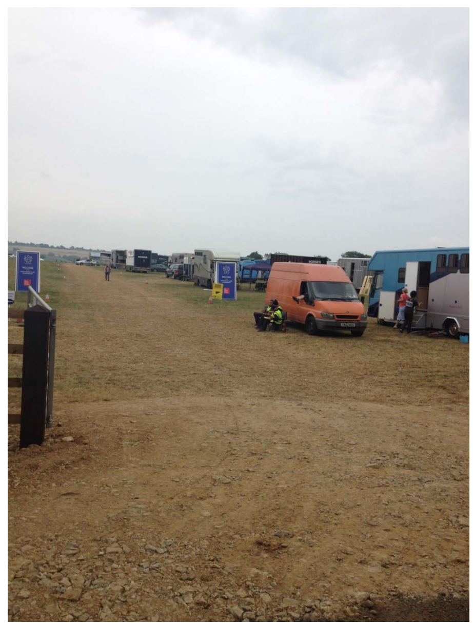
Resulting layout when using new gate position.

The above photos taken in August 2014 during the 3-day National Event appear to be at odds with those taken on site on the 21<sup>st</sup> September under the Section 6 of the Transport Assessment "The Event Internal Arrangements," so once again misleading or confusing information is being presented.