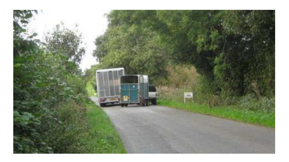
Vehicles exiting to the West along Main Street Blocking the Highway whilst the Passenger closes the Gate

It was reported to me that this was a small event although looking on the website there were 92 entrants registered on the day and therefore it is within the