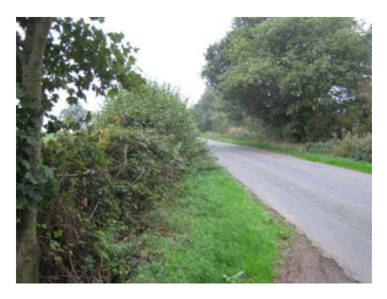
Visibility to the left from the northern Field Access on to Main Street