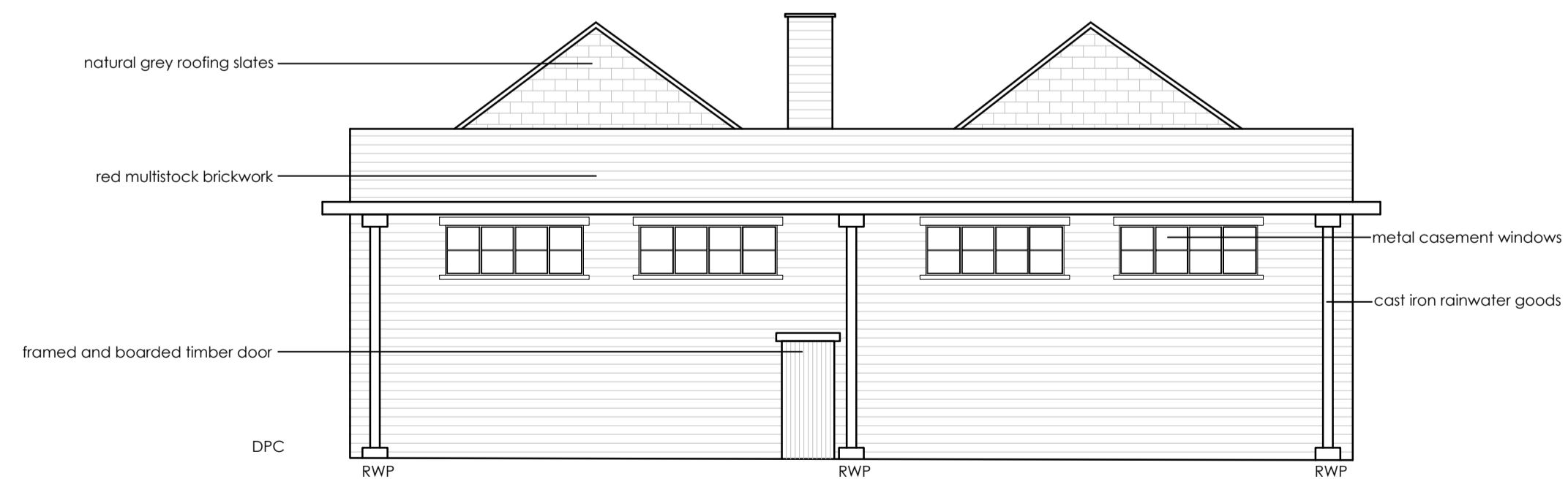
BUILDING 119 NORTH ELEVATION - EXISTING