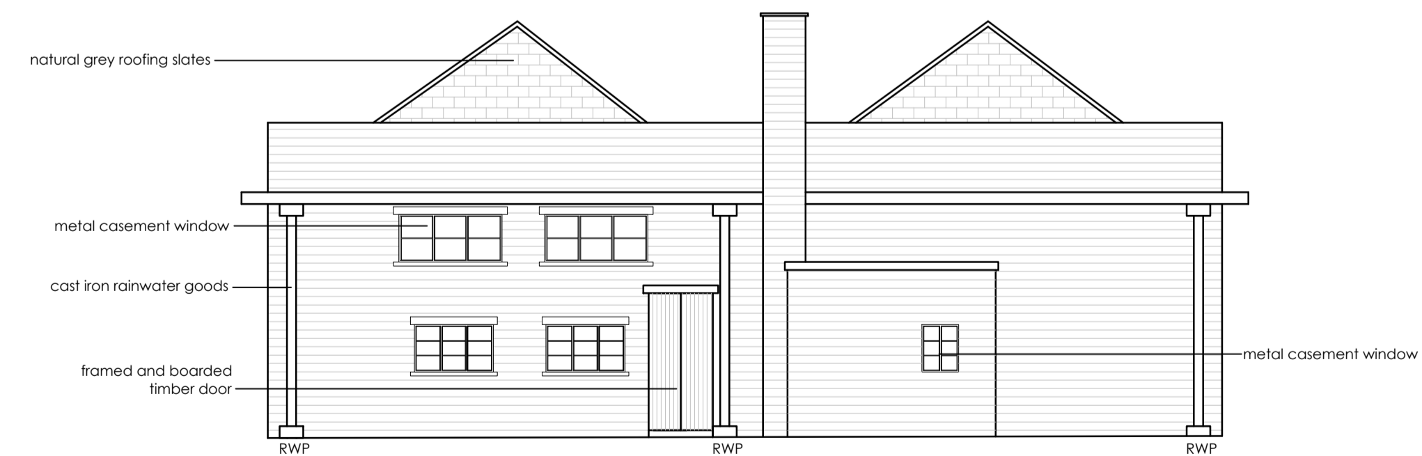
BUILDING 119 SOUTH ELEVATION - EXISTING

This drawing is copyright. All rights described in Chapter IV of the Copyright, Designs and Patents Act 1988 have generally been assigned. All drawings are the property of the architect. No part of this drawing may be reproduced without the written consent of the architect.