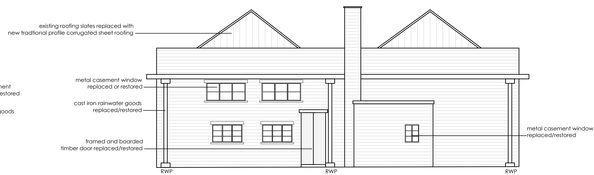
BUILDING 119 SOUTH ELEVATION - PROPOSED

This drawing is copyright. All rights described in Chapter IV of the Copyright, Designs and Patents Act 1988 have generally been asserted. All drawings are the property of the Architect. No responsibility is accepted for any discrepancy between the drawing and the construction of the building.