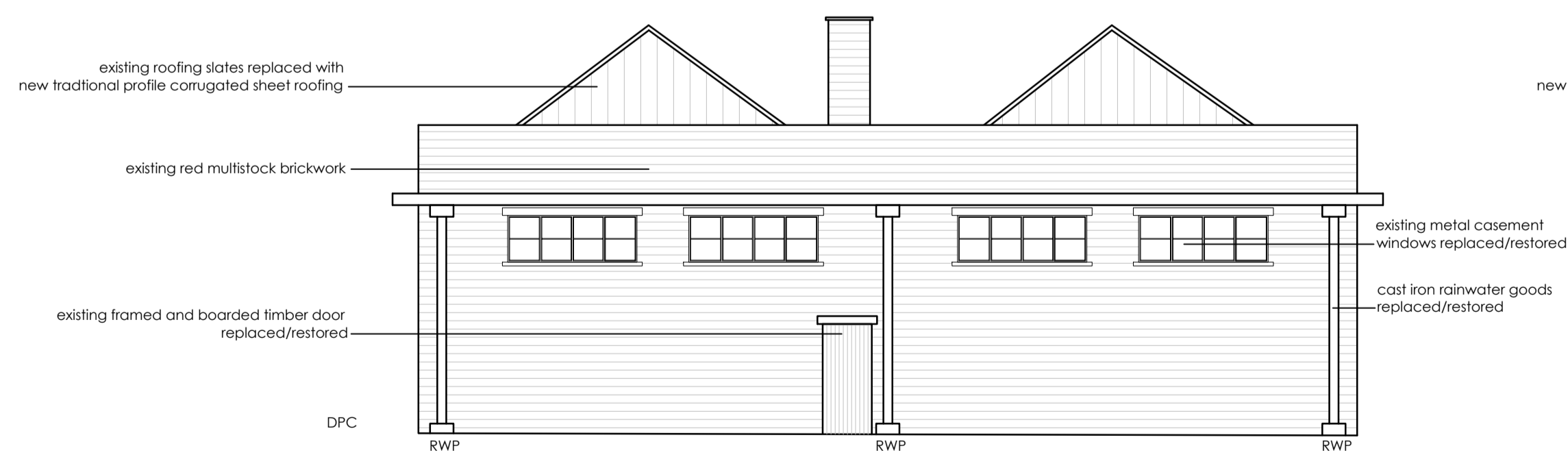
BUILDING 119 NORTH ELEVATION - PROPOSED