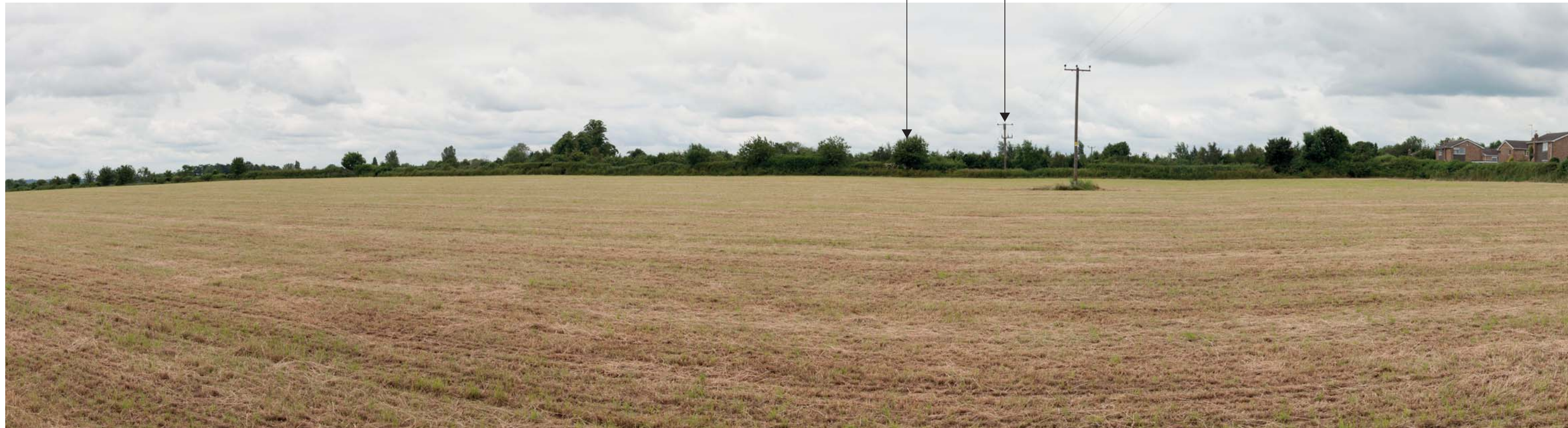
Viewpoint 3: View from public right of way to the east, looking west towards the site.

Overhead cables on poles continuing across site