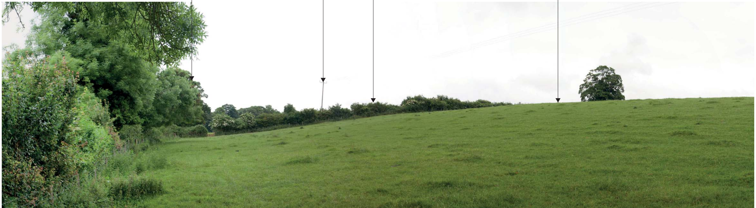
Viewpoint 8: View from public right of way to the south, looking north towards the site

Site gradually obscured by rising landform to the south-east