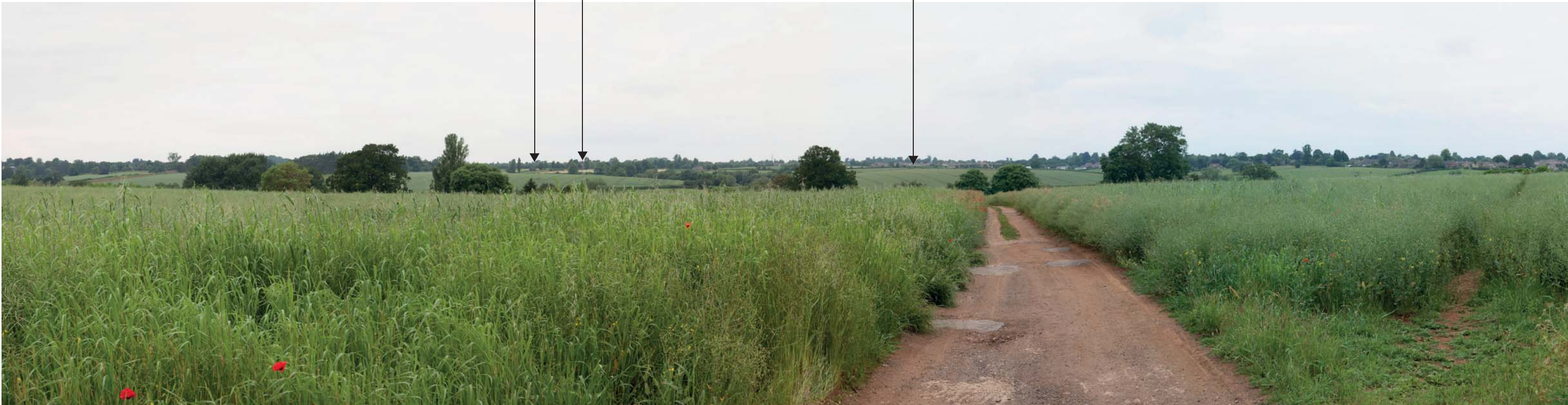
Viewpoint 15: View from Bloxham Grove Road, looking north towards the site