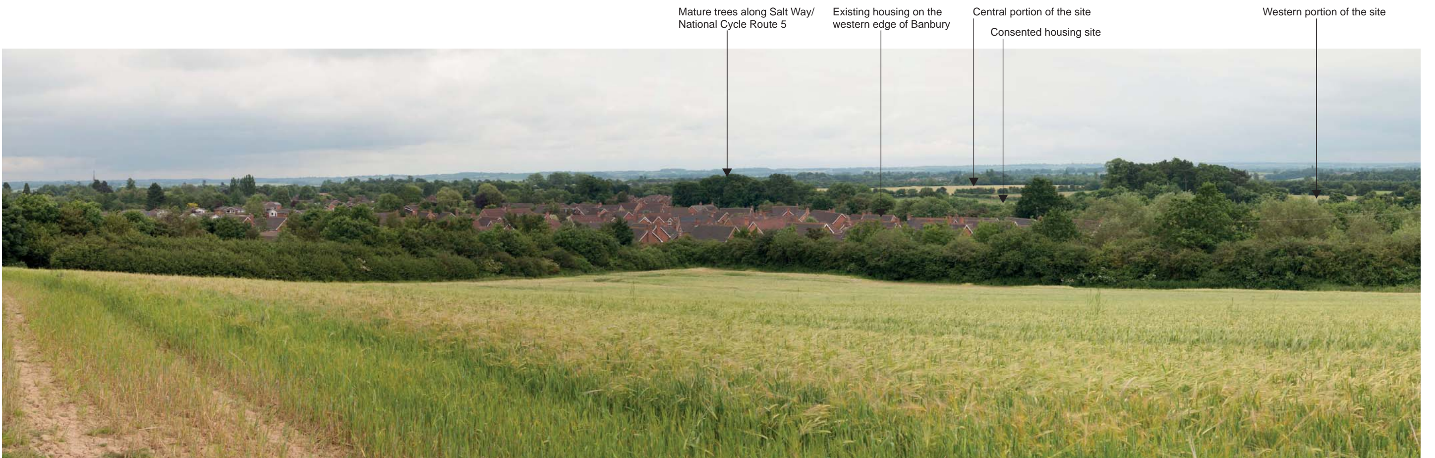
Viewpoint 12: View from Crouch Hill to the north-west, looking south-east towards the site.