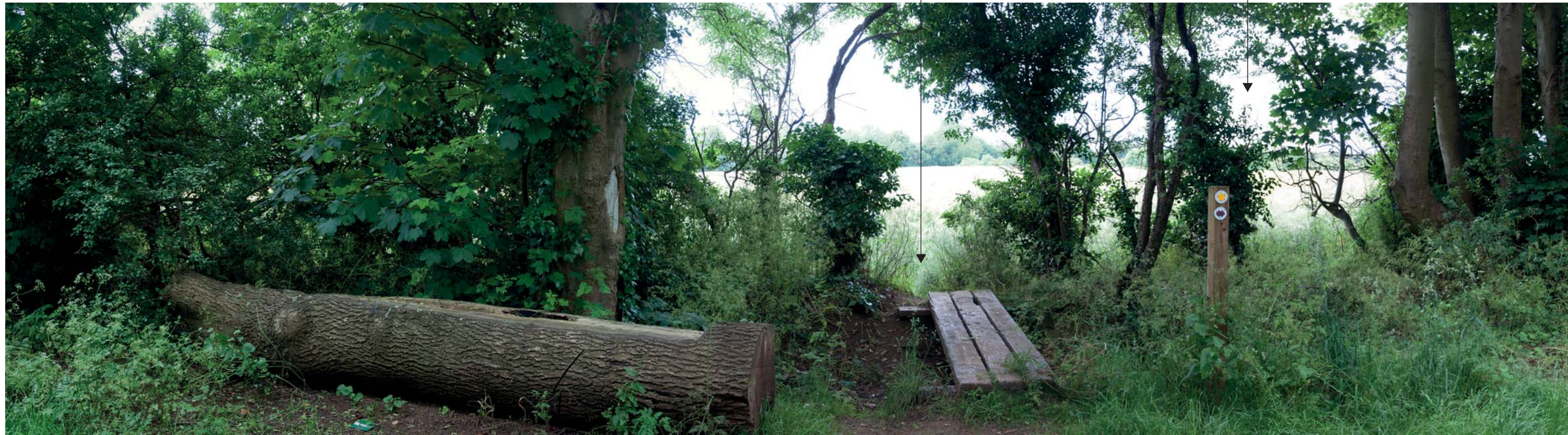
Viewpoint 2: View from Salt Way/ National Cycle Route 5, looking south in to the site.

Glimpses of site afforded through mature trees and vegetation on is northern boundary along Salt Way/National Cycle Route 5