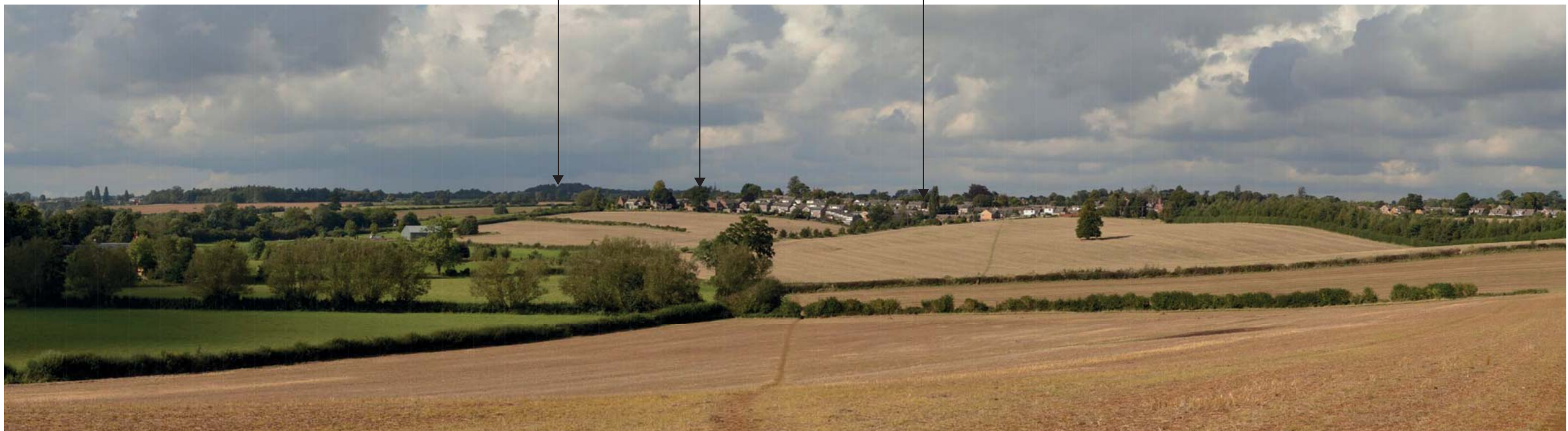
Viewpoint 16: View from public right of way west of Twyford, looking north-west towards the site.

No. Revision Date Checked Approved Photographs taken 16/06/2014