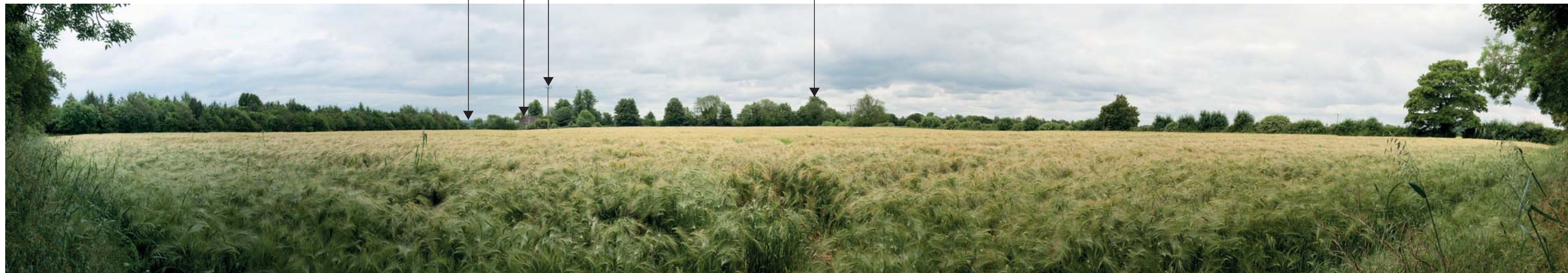
Viewpoint 2a: Insert of view received from public right of way beyond vegetation along Salt Way. (For illustrative purposes only).

Maturing trees and vegetation on site's southern boundary