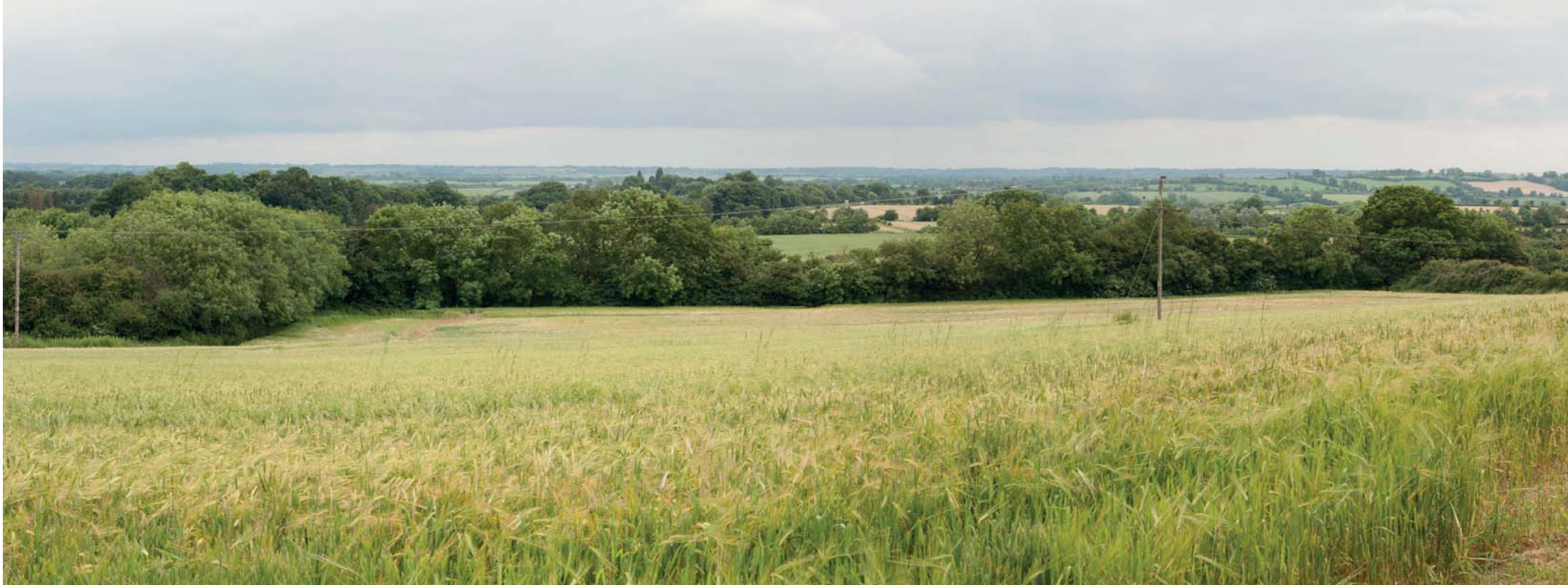
Viewpoint 12: Continued.

No. Revision Drawn Checked Approved Date Photographs taken 16/06/2014