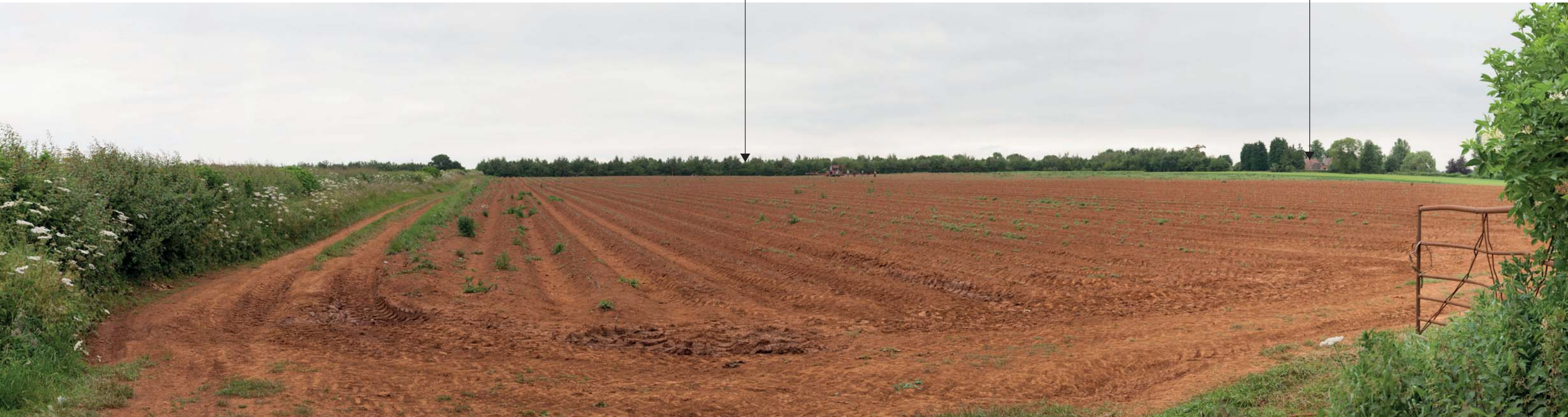
Viewpoint 7: View from gateway on Wykham Lane, looking north towards the site

Mature tree belt on site's western boundary