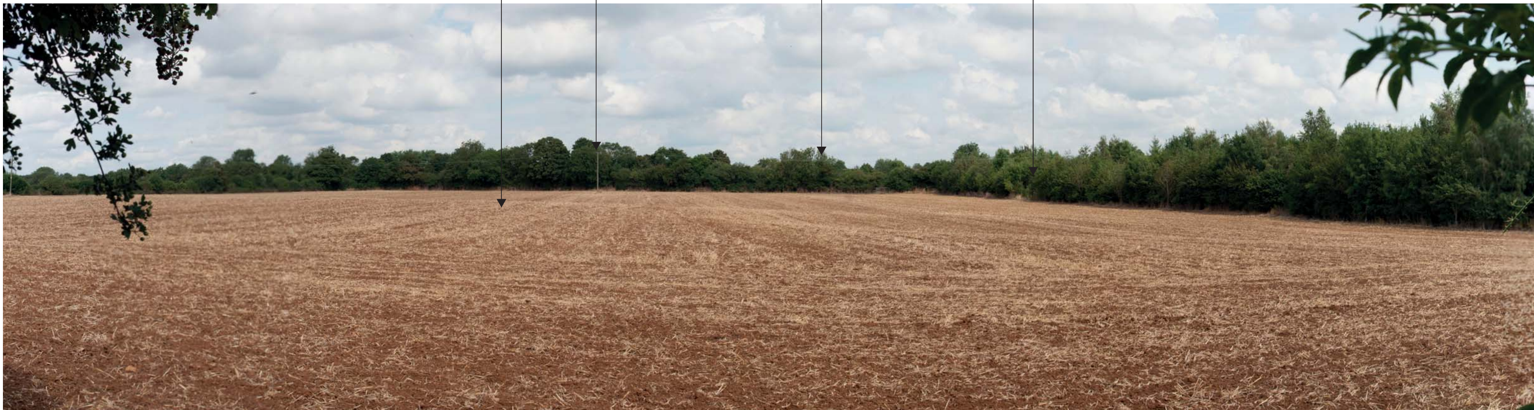
Viewpoint 6: View from public right of way as it crosses through hedgerow on site's southern boundary, west of Wykham Farm Cottage,

Public right of way crossing the site, enclosed by vegetation