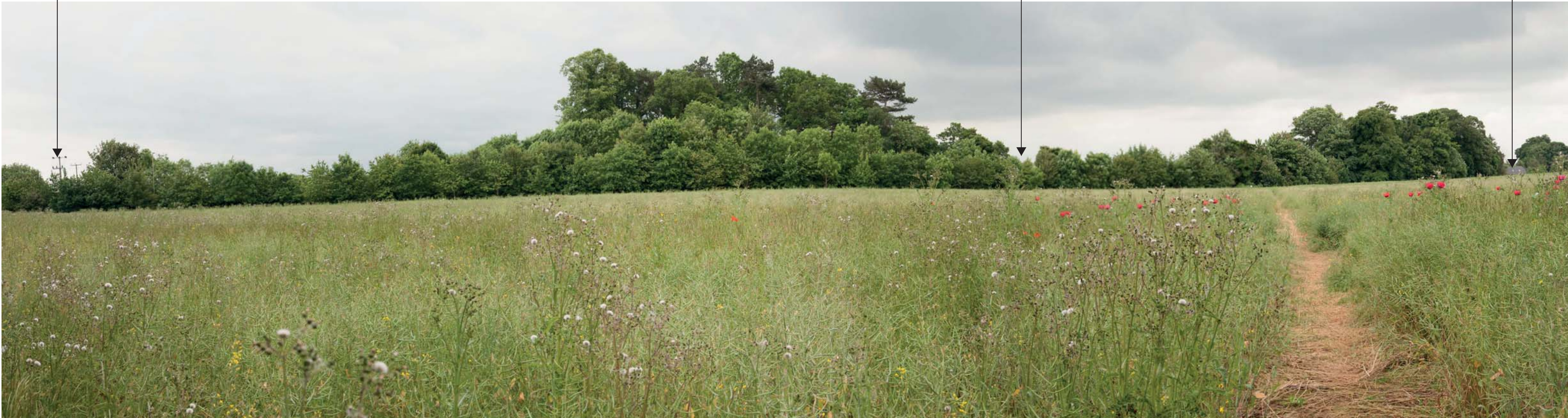
Viewpoint 11: View from public right of way to the west, looking south-east towards the site.

No. Revision Date Checked Approved By Photographs taken 16/06/2014