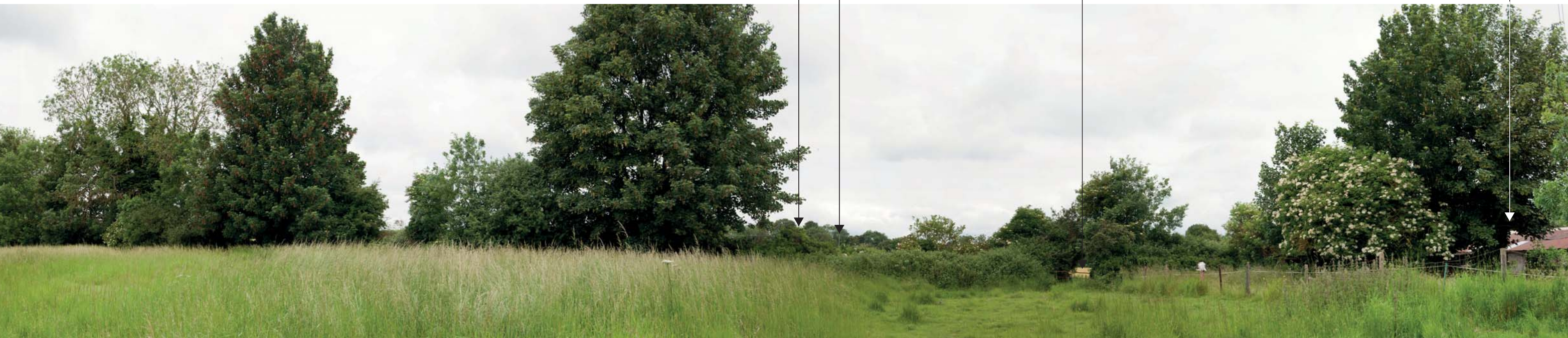
Viewpoint 6a: Insert of view from public right of way west of Wykham Farm Cottage, beyond southern boundary hedgerow and trees. (For illustrative purposes only).

No. Revision Date Checked Approved By Photographs taken 16/06/2014 and 08/08/14