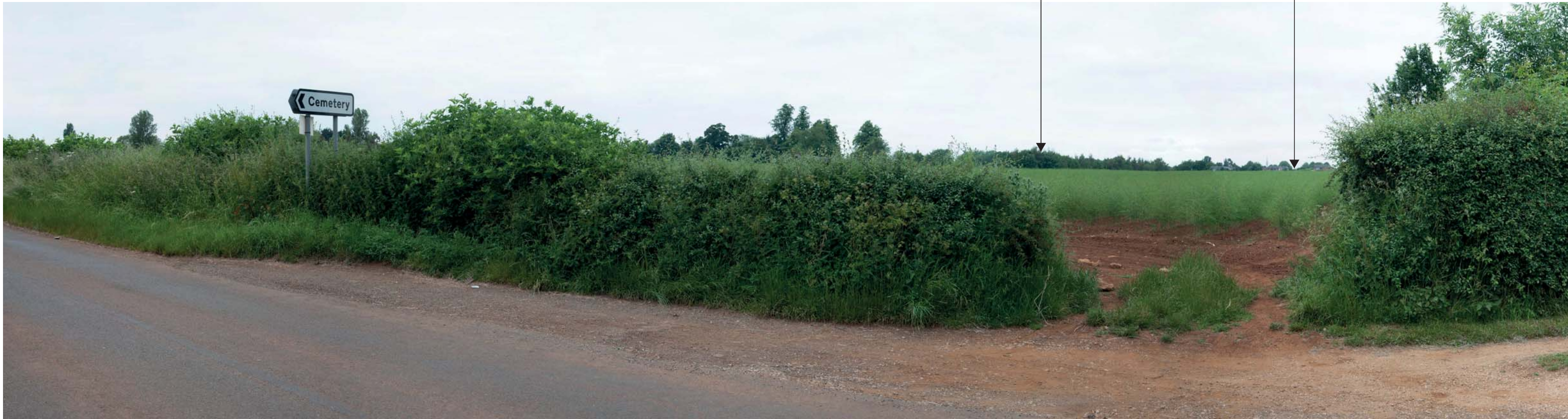
Viewpoint 5: View from car park entrance to Bodicote cemetery, looking north-west towards the site

Eastern portion of the site, seen immediately in front of existing properties in Easington