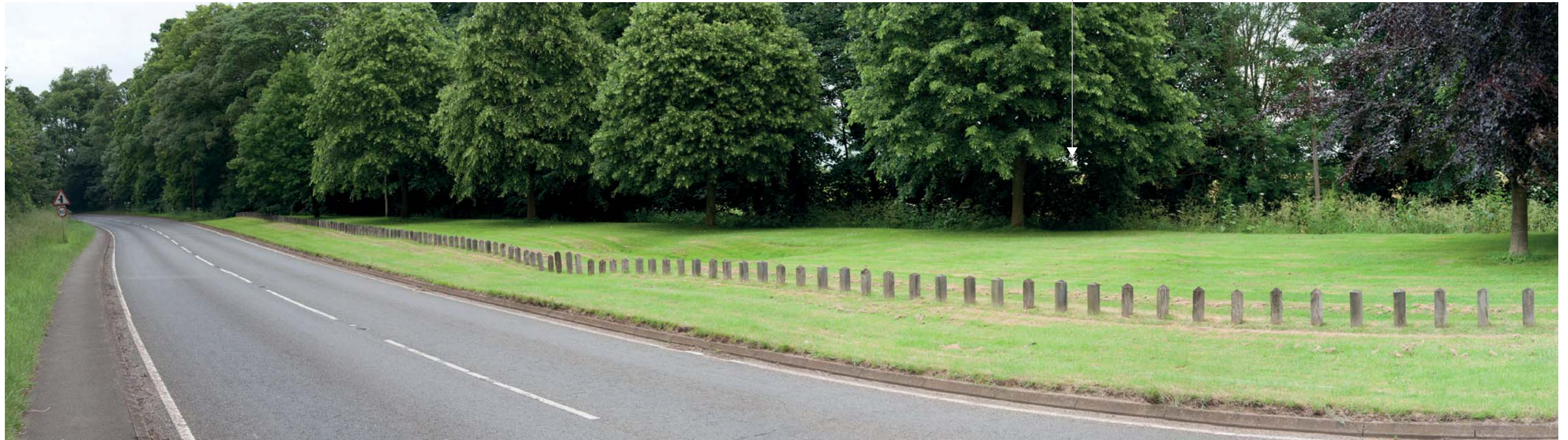
Viewpoint 10: View from entrance gateway to Wykham Park (Tudor Hall), looking east in to the site

Western portion of the site, largely screened by mature trees and hedgerow on its western boundary (along Bloxham Road)