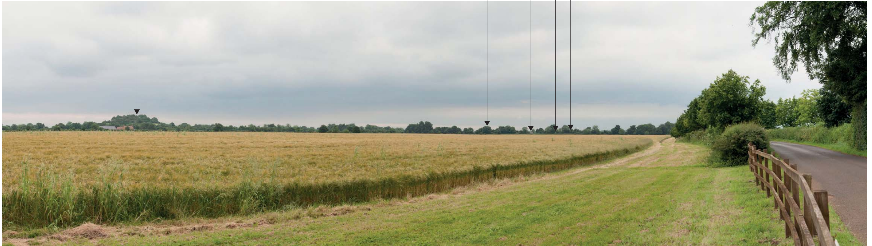
Viewpoint 9: View from Wykham Lane west of the site, looking north-east towards the site

The Bungalow, signage and lighting columns on Bloxham Road