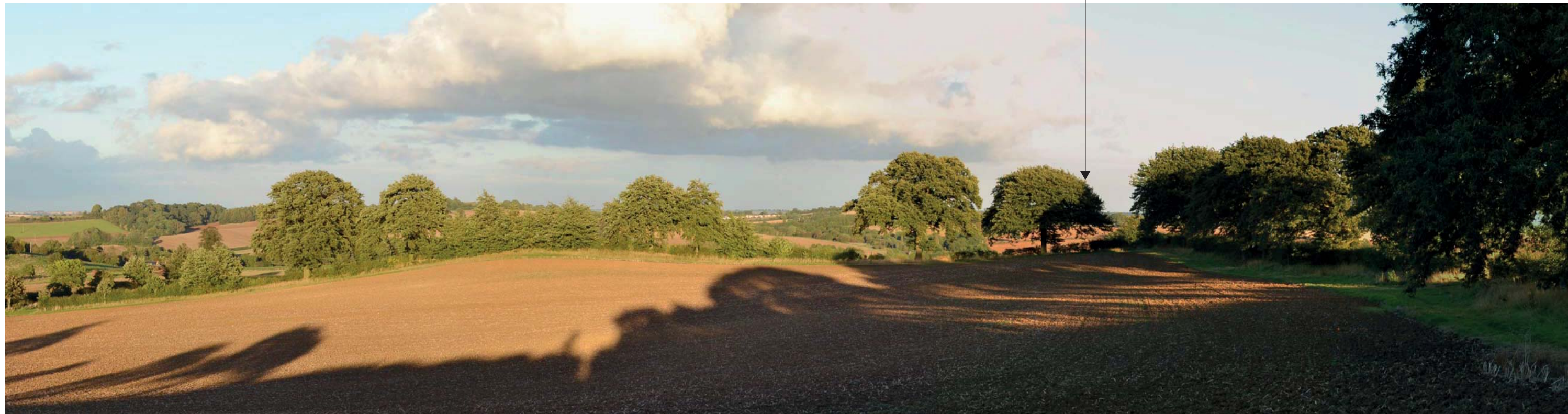
Viewpoint 13: Taken from public right of way to the west (south of North Newington), looking east towards the site.

September 2012.