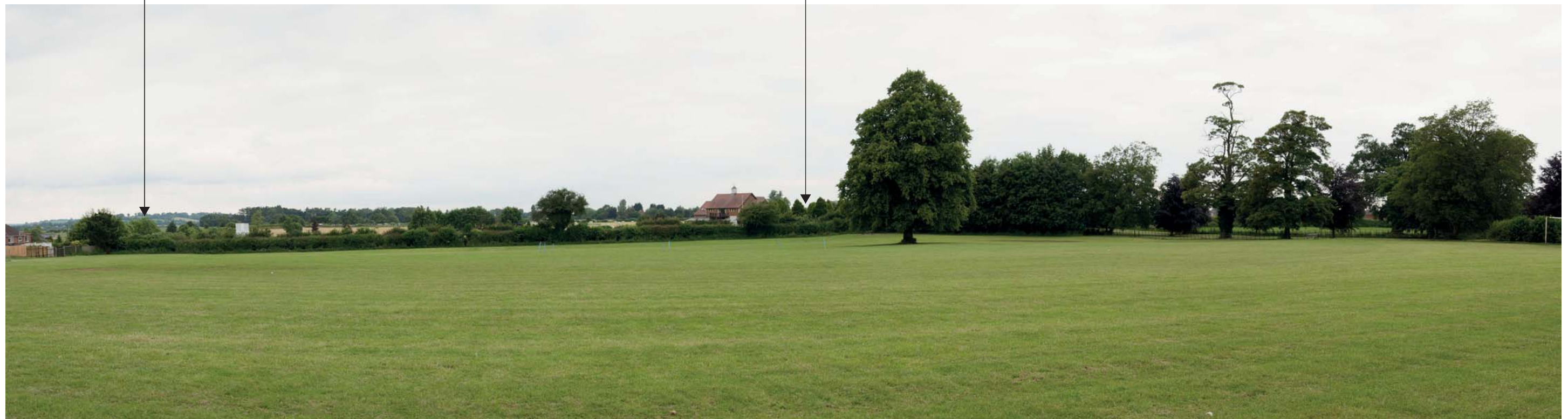
Viewpoint 4: View from recreational ground on the north-western edge of Bodicote, looking west towards the site

The site, behind mature intervening vegetation