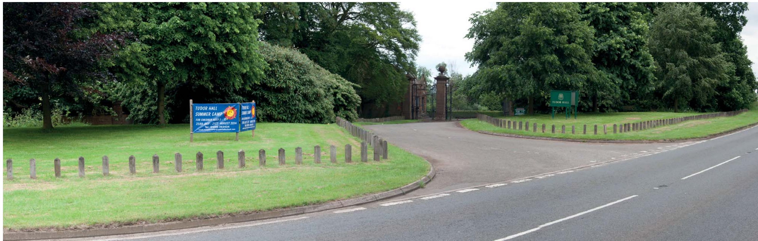
Viewpoint 10: Continued.

No. Revision Photographs taken 16/06/2014