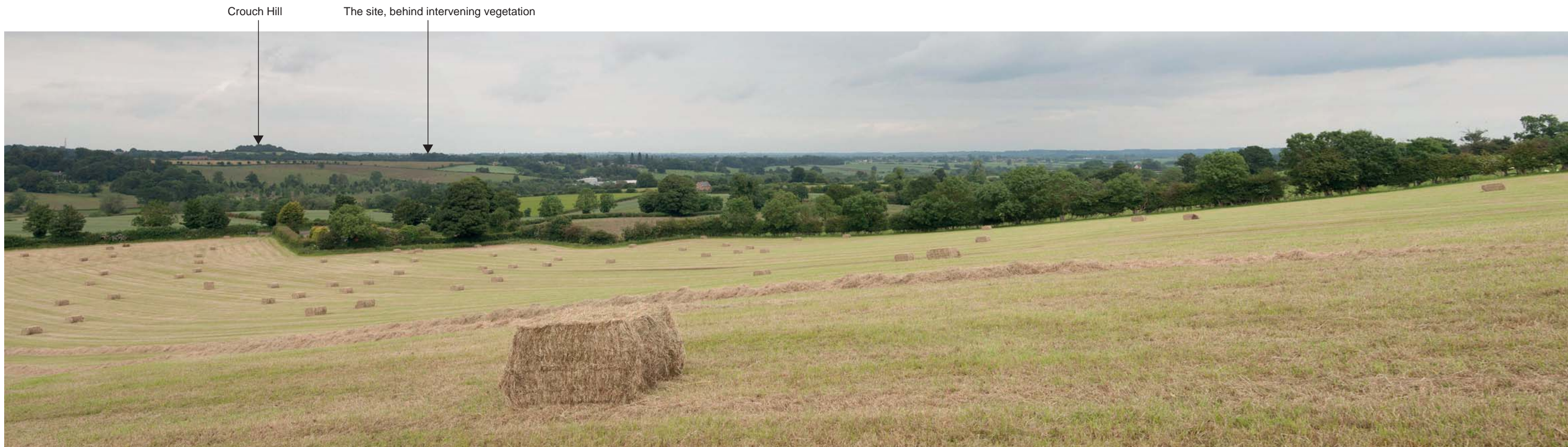
Viewpoint 14: View from public right of way on Hobb Hill, looking north-east towards the site