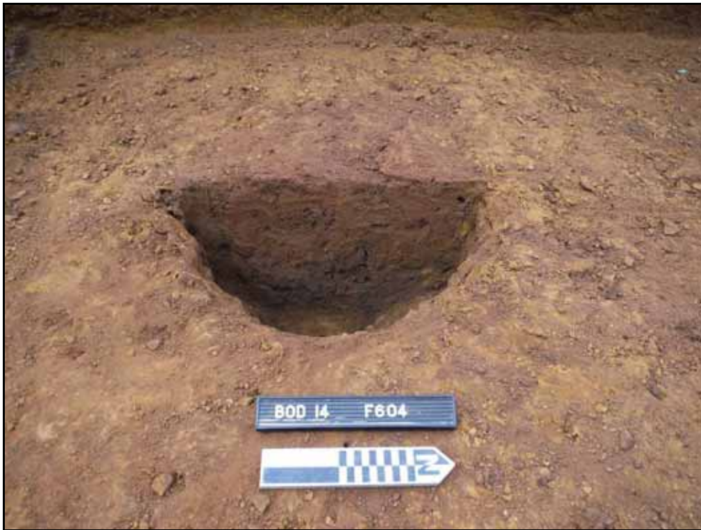
Figure 7- W-facing view of pit F.604 (Scale- 1 x 0.2m)