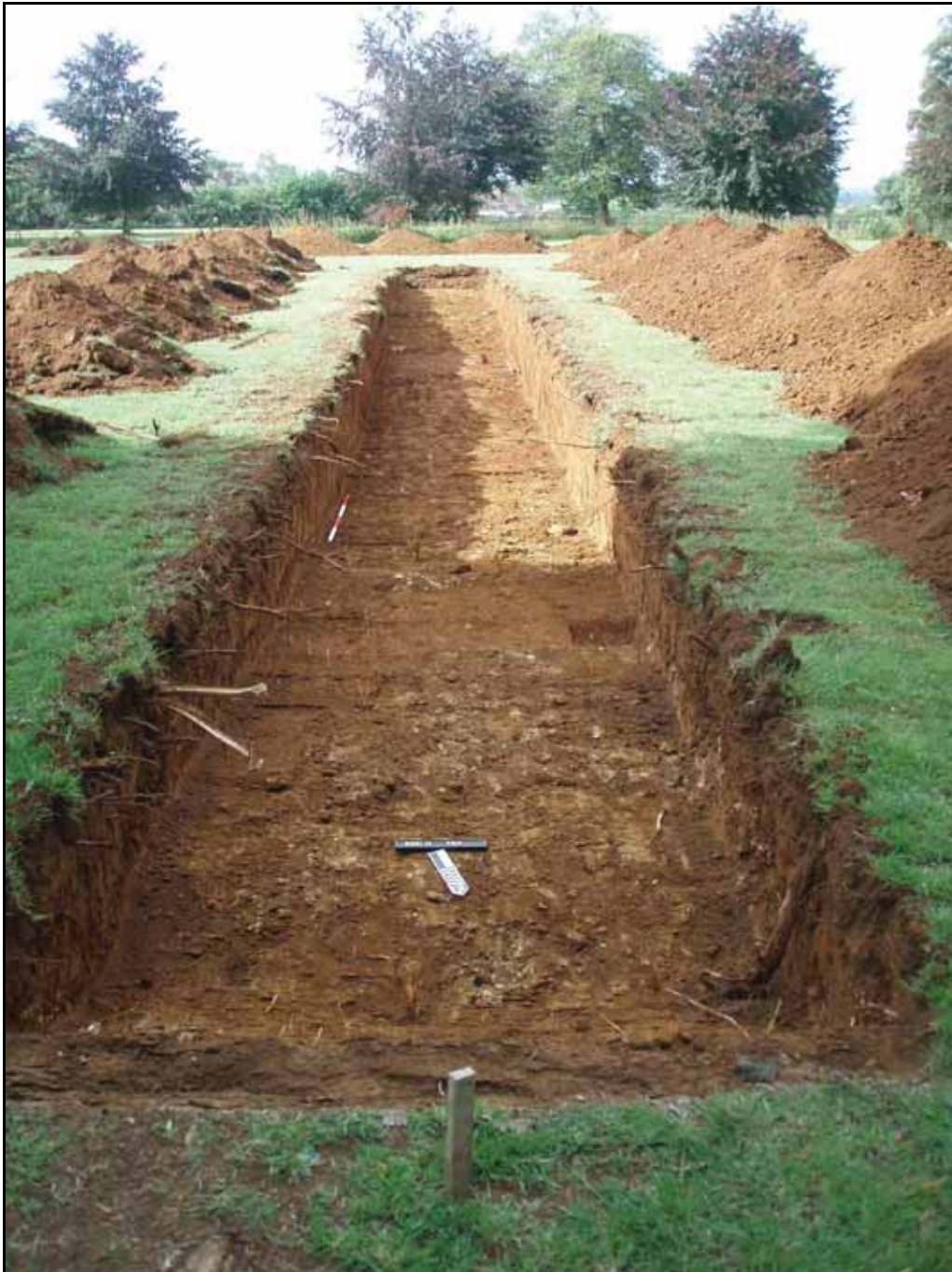
Figure. 3- SSW facing view of Trench 3 (Scale- 2 x 2m)