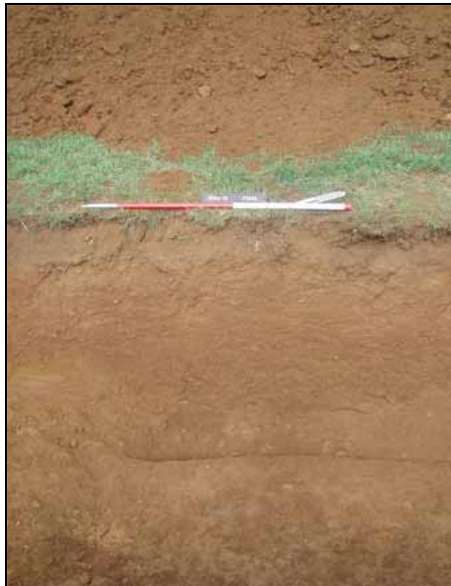
Figure 5- NW facing view of linear F.306 (Scale- 1 x 1m)