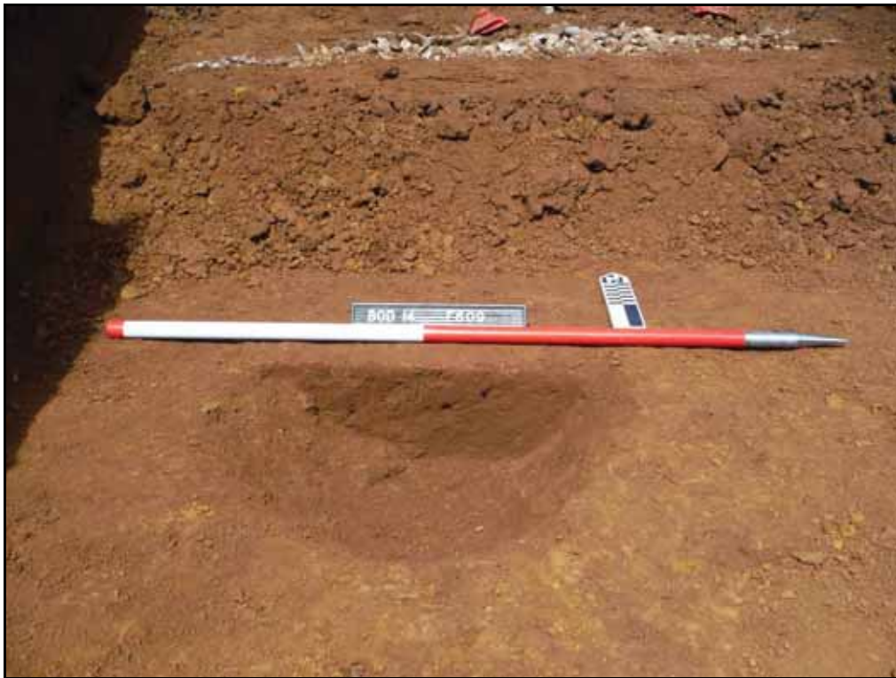
Figure 9- N-facing view of pit/linear terminus F.609. Note modern land drain in the background (Scale- 1 x 1m)