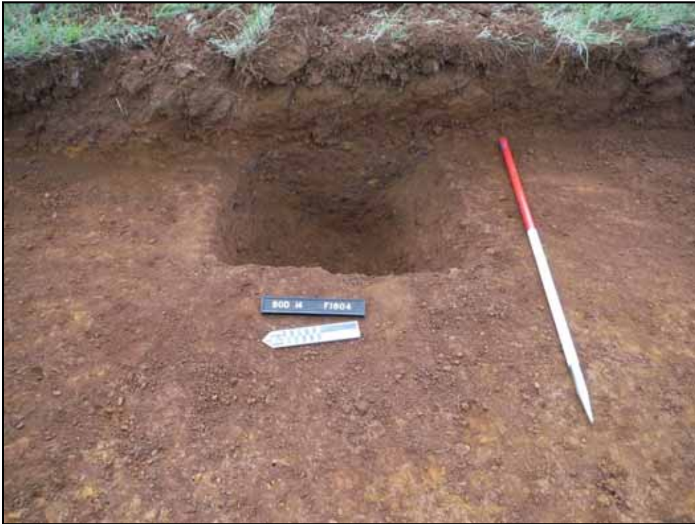
Figure. 24- E-facing view of F.1804 (Scale- 1 x 1m)