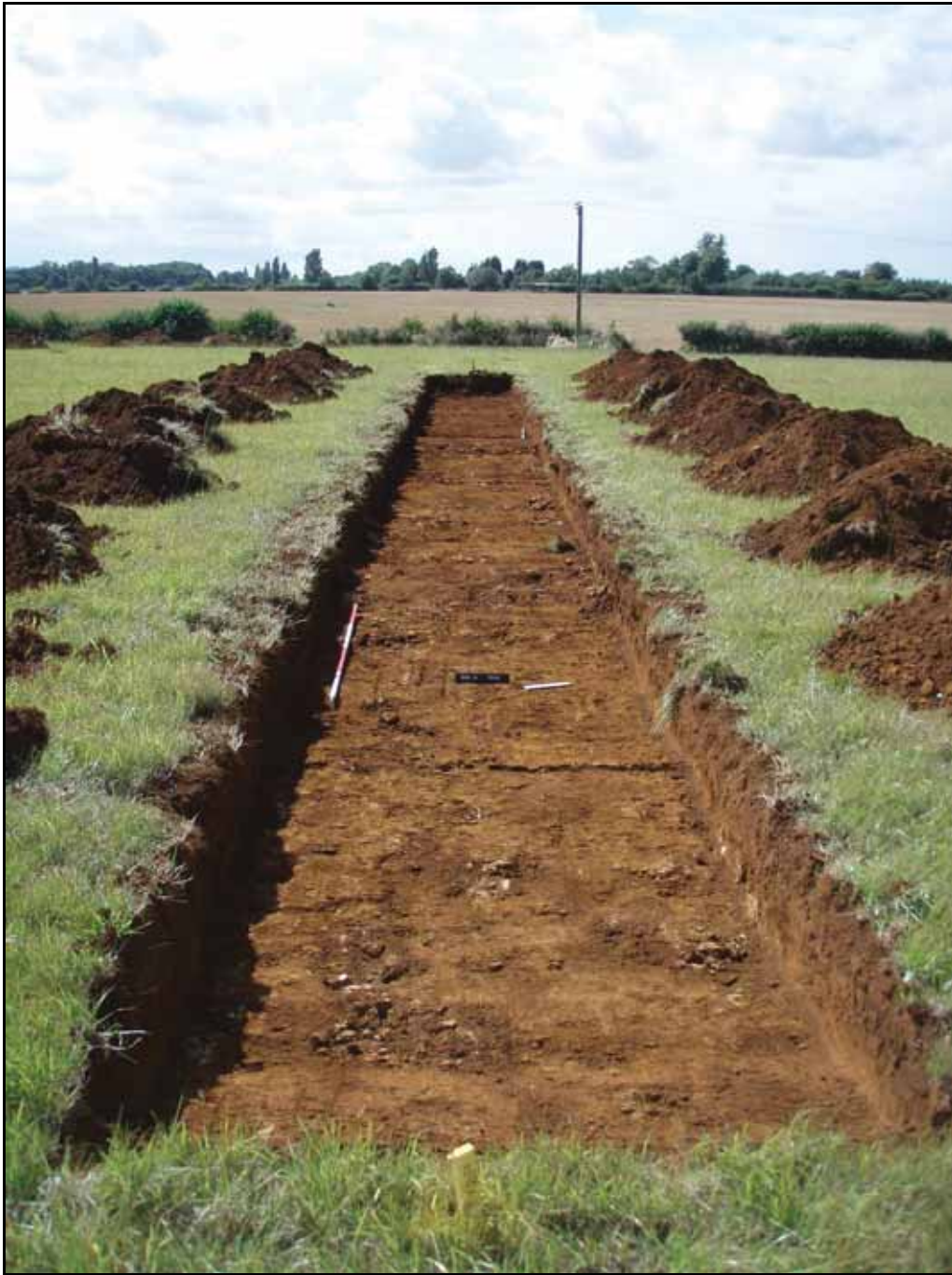
Figure. 15- WSW facing view of Trench 13 (Scale- 2 x 2m)