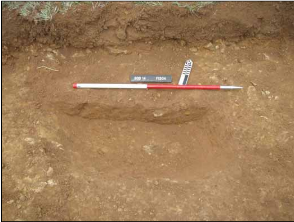
Figure. 16- NNW facing view of linear terminus F.1304 (Scale- 1 x 1m)