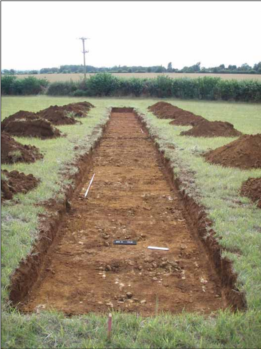
Figure. 28- SW facing view of Trench 20 (Scale- 2 x 2m)