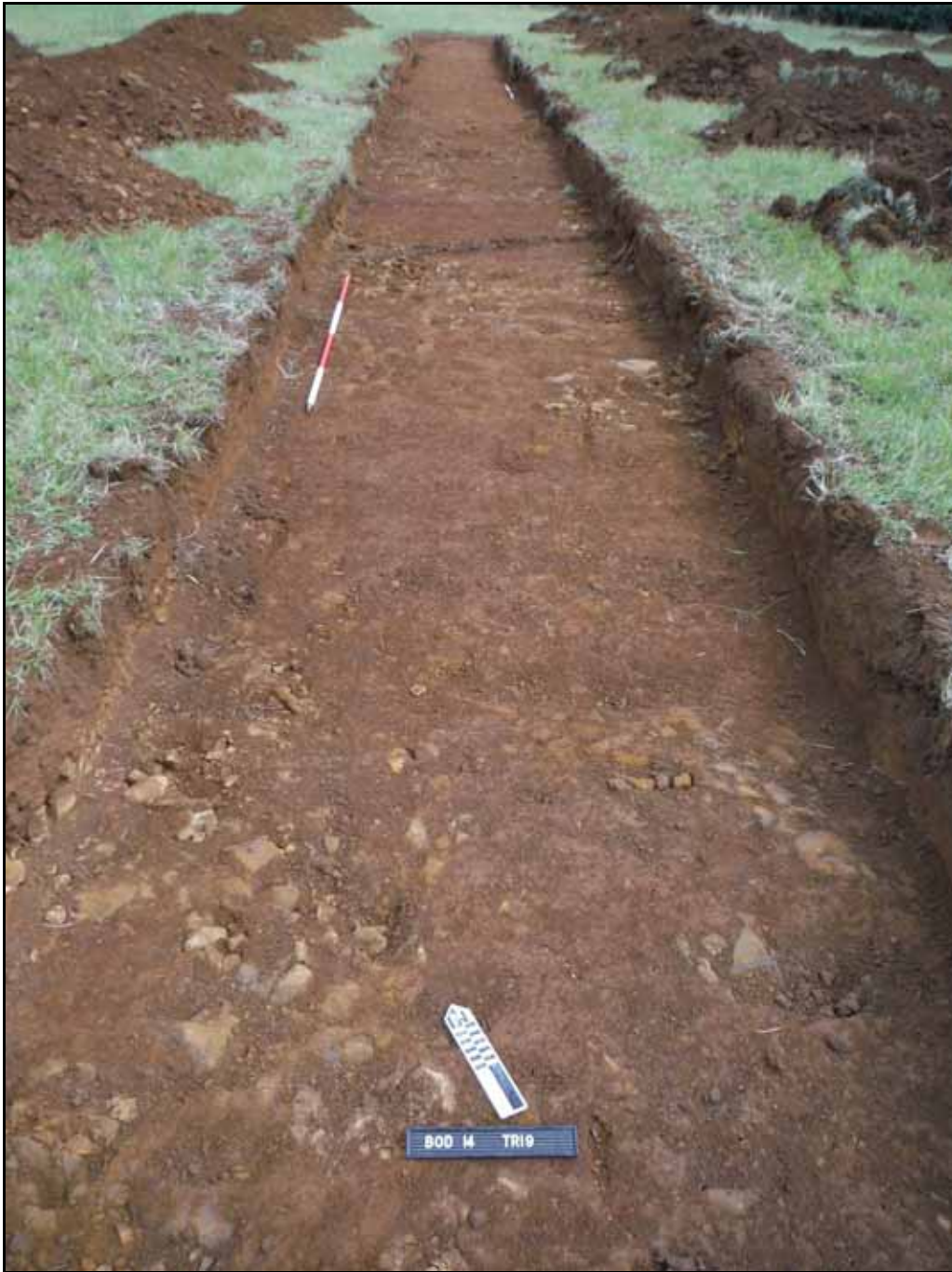
Figure. 25- NNE facing view of Trench 19 (Scale- 2 x 2m)