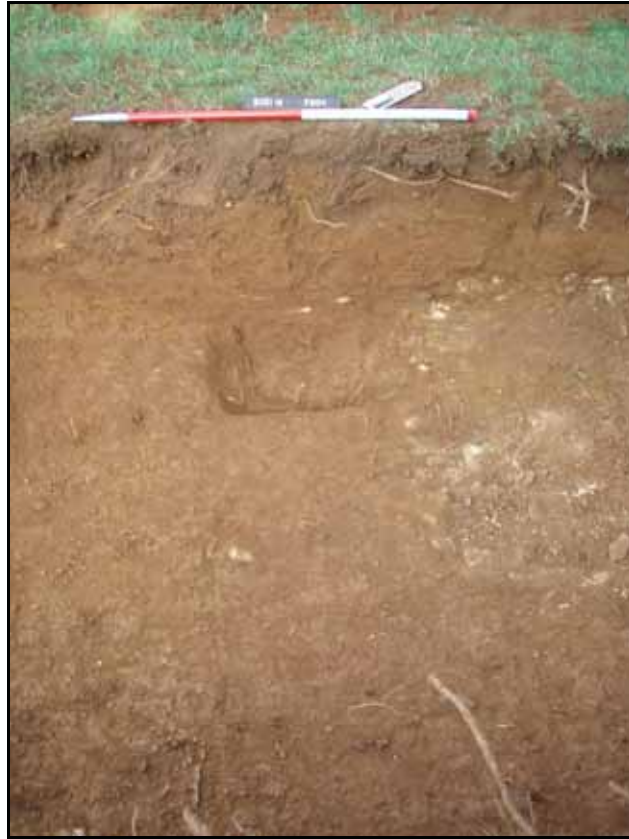
Figure 4- NW facing view of linear F.304 (Scale 1 x 1m)