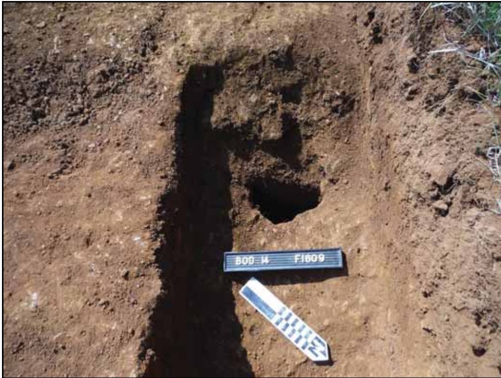
Figure. 22- SW facing view of posthole F.1609