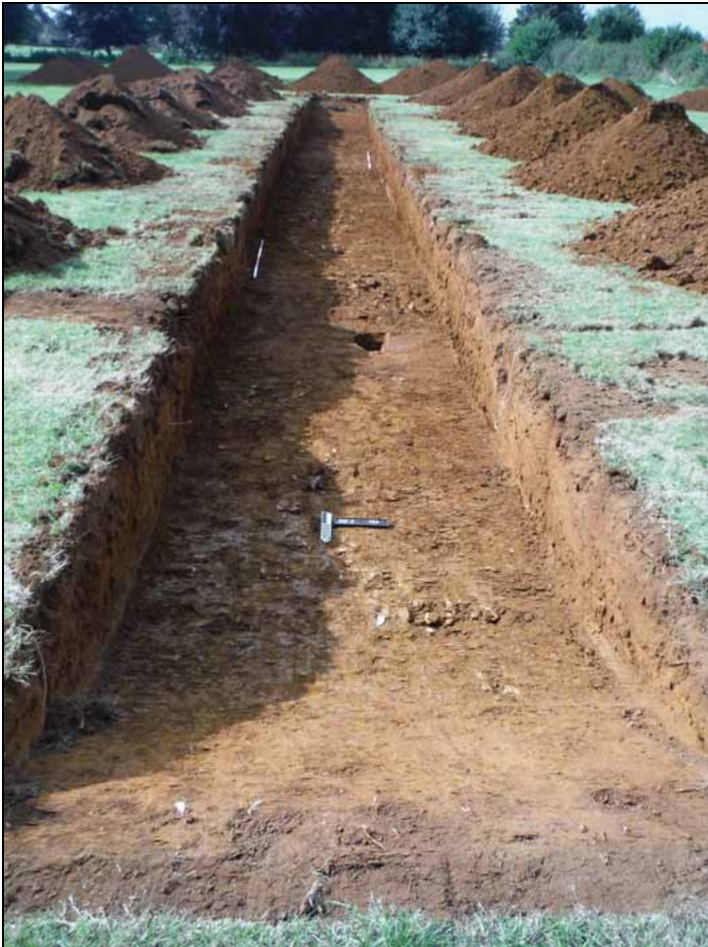
Figure. 10 – S-facing view of Trench 8 (Scale- 2 x 2m)