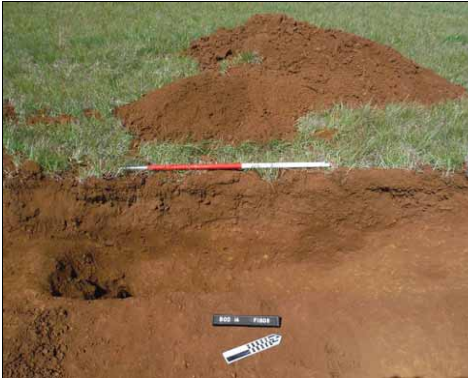
Figure. 20- WNW facing view of F.1606 (Scale- 1 x 2m)