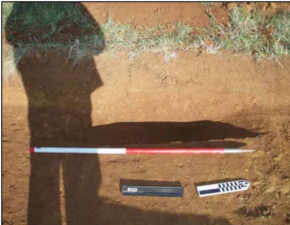
Figure. 27- W-facing view of linear F.1908 (Scale- 1 x 1m)