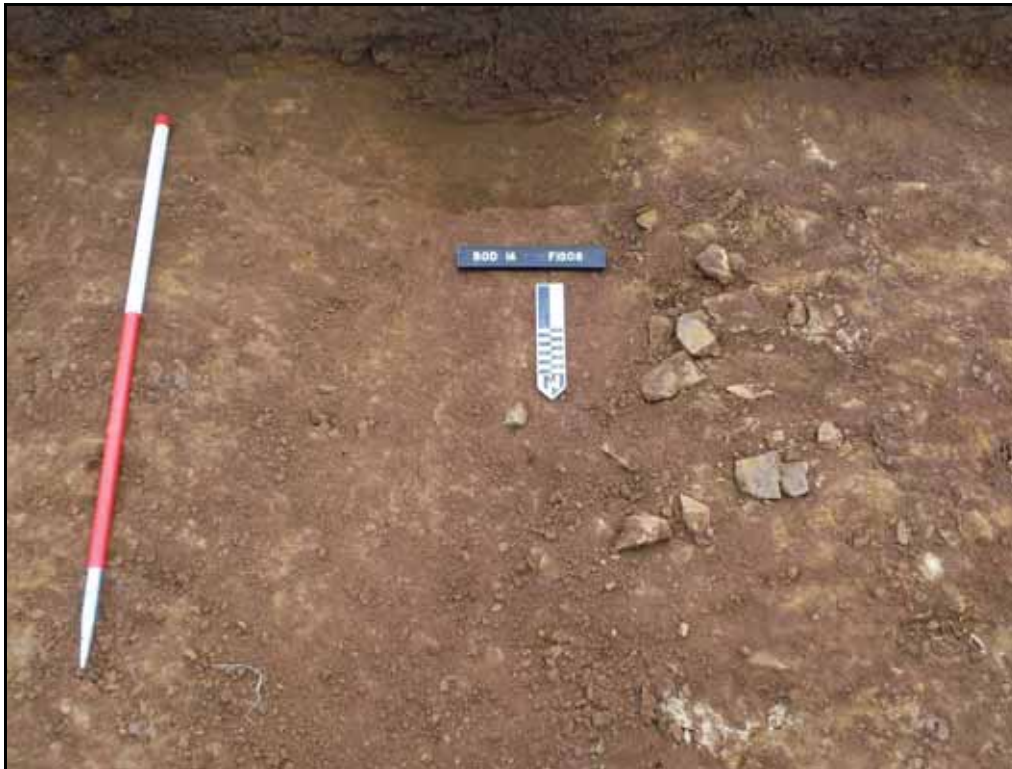
Figure. 17- S-facing view of linear F.1306 (Scale- 1 x 1m)