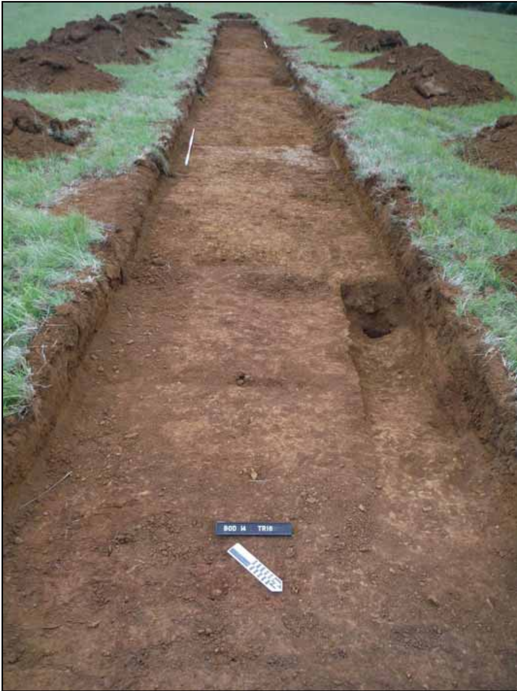
Figure. 19- SW-facing view of Trench 16 (Scale- 2 x 2m)