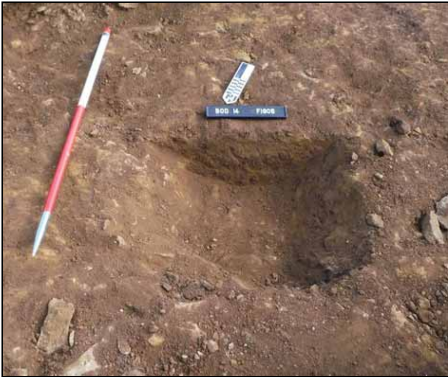
Figure. 26- SSE facing view of linear F.1905 (Scale – 1 x 1m)