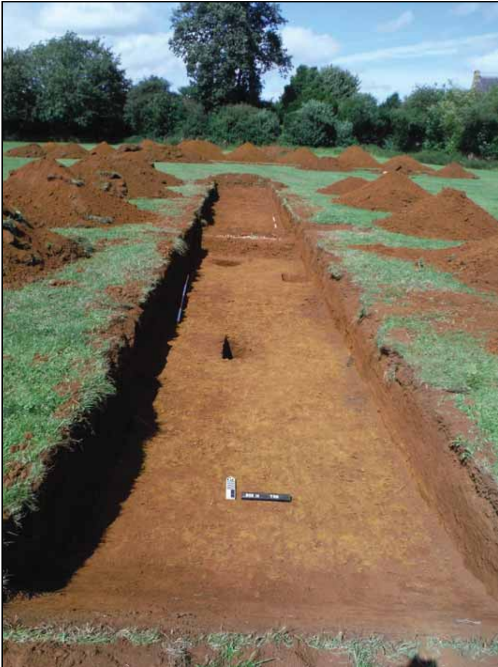
Figure 6- N-facing view of Trench 6 (Scale- 2 x 2m)