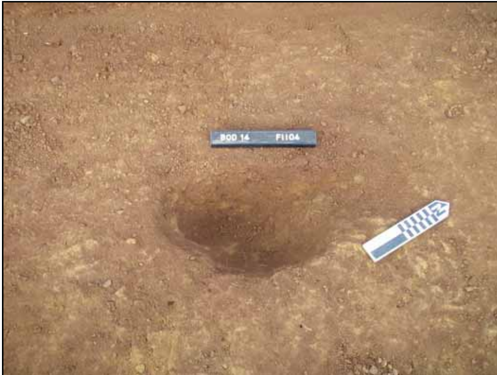
Figure. 13- NW facing view of pit/posthole F1104 (Scale- 1 x 0.2m)