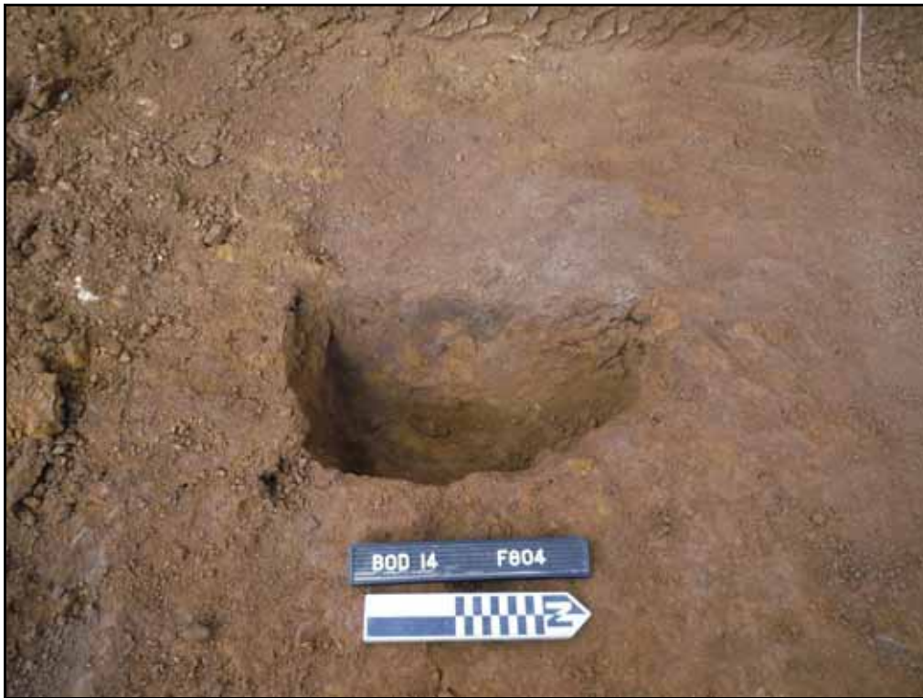
Figure. 11- W-facing view of pit F.804 (Scale- 1 x 0.2m)