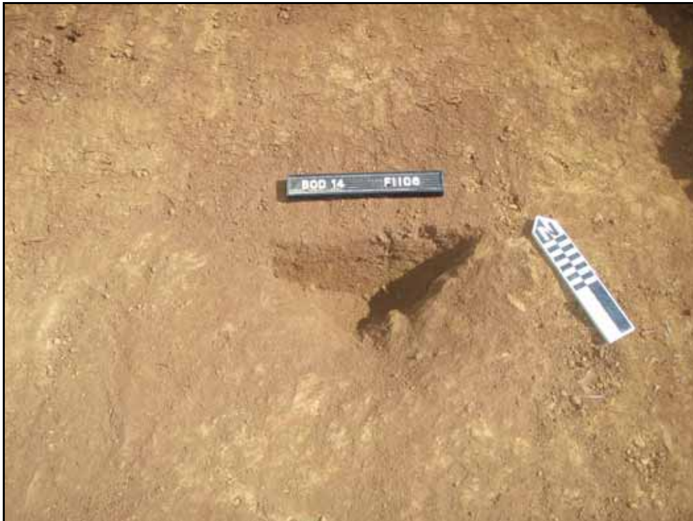
Figure. 14- NNE facing view of pit/posthole F.1106 (Scale- 1 x 0.2m)