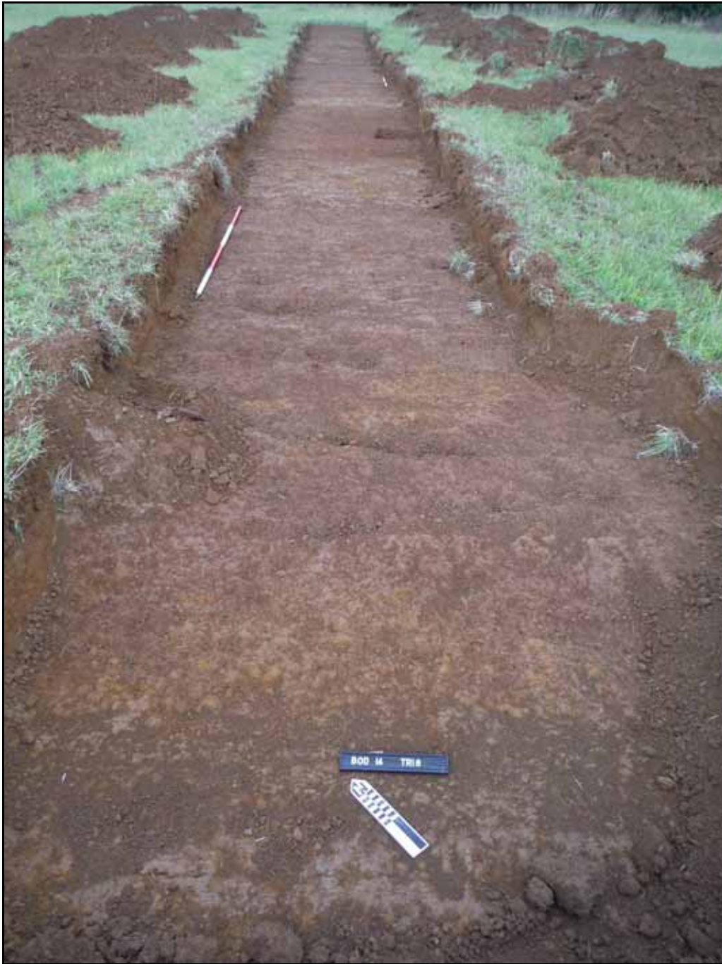
Figure. 23- NE facing view of Trench 18 (Scale 2 x 2m)