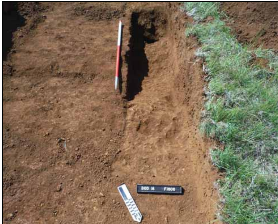
Figure. 21- SSW facing view of linear F.1606. Note truncating posthole F.1609 visible at southern edge of linear F.1606 (Scale- 1 x 1m)