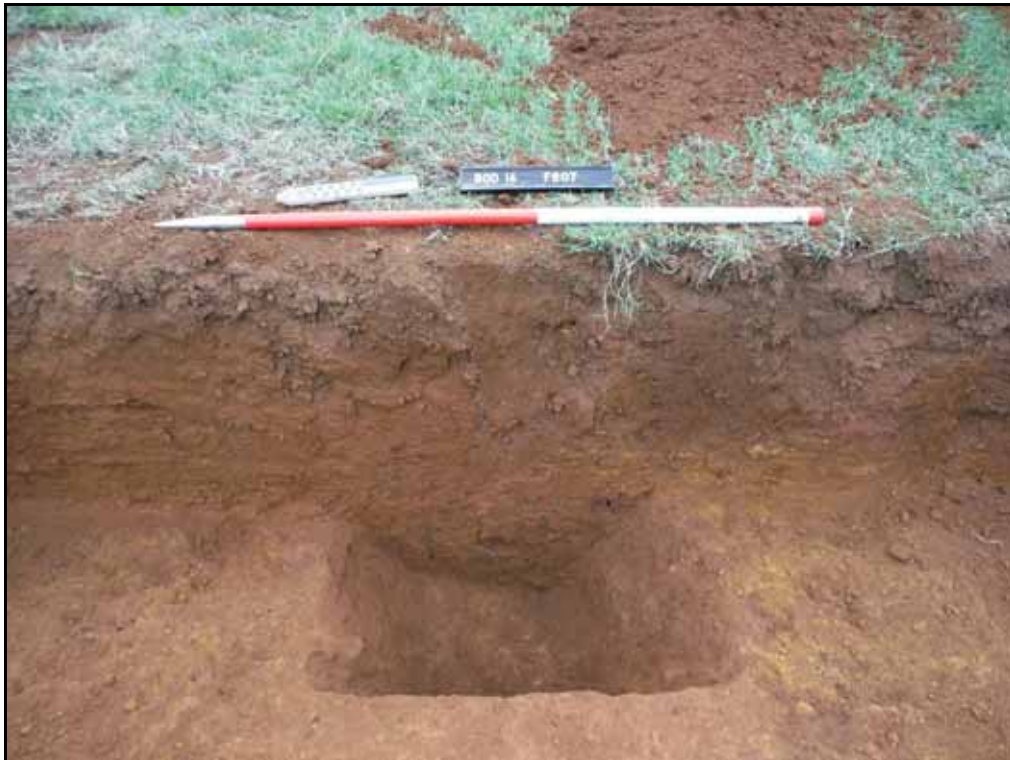
Figure 8- E-facing view of linear F.607 (Scale- 1 x 1m)