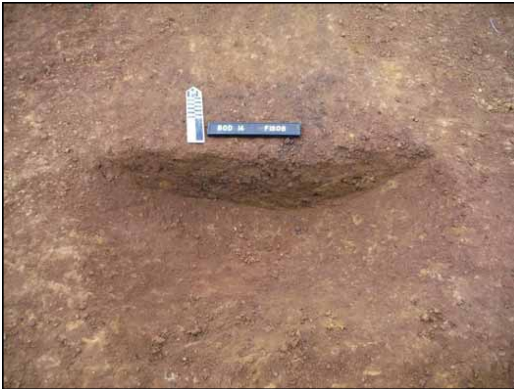
Figure. 18- N-facing view of pit F.1308 (Scale- 1 x 0.2m)