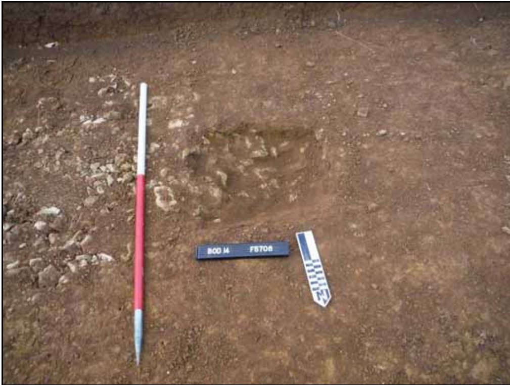
Figure. 75- SSW-facing view of F.5706 (Scale- 1 x 1m)