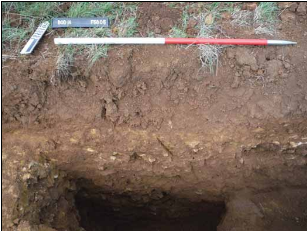
Figure. 79- N-facing view of pit F.5804- not excavated to maximum depth (Scale- 1 x 1m)