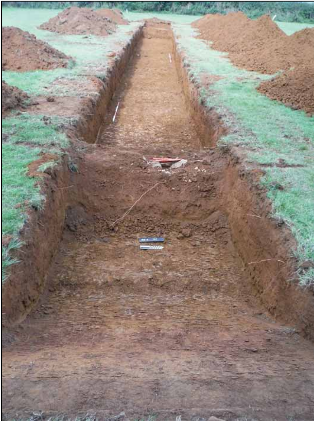
Figure. 122- W-facing view of Trench 7. Note unexcavated foul pipe bisecting eastern extent of Trench 7 (Scale- 2 x 2m)