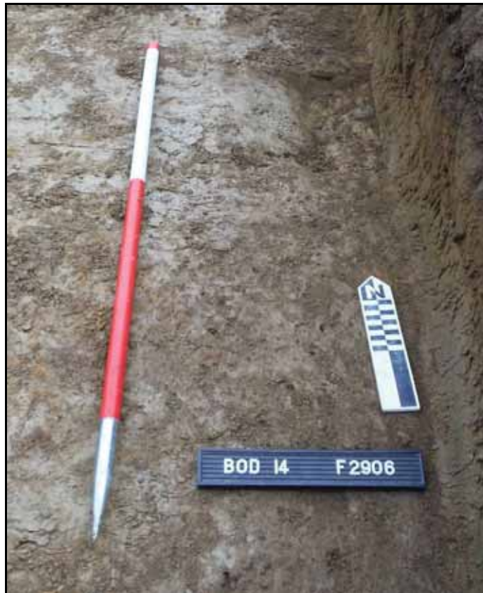
Figure. 36- N-facing view of linear F.2906 (Scale- 1 x 1m)