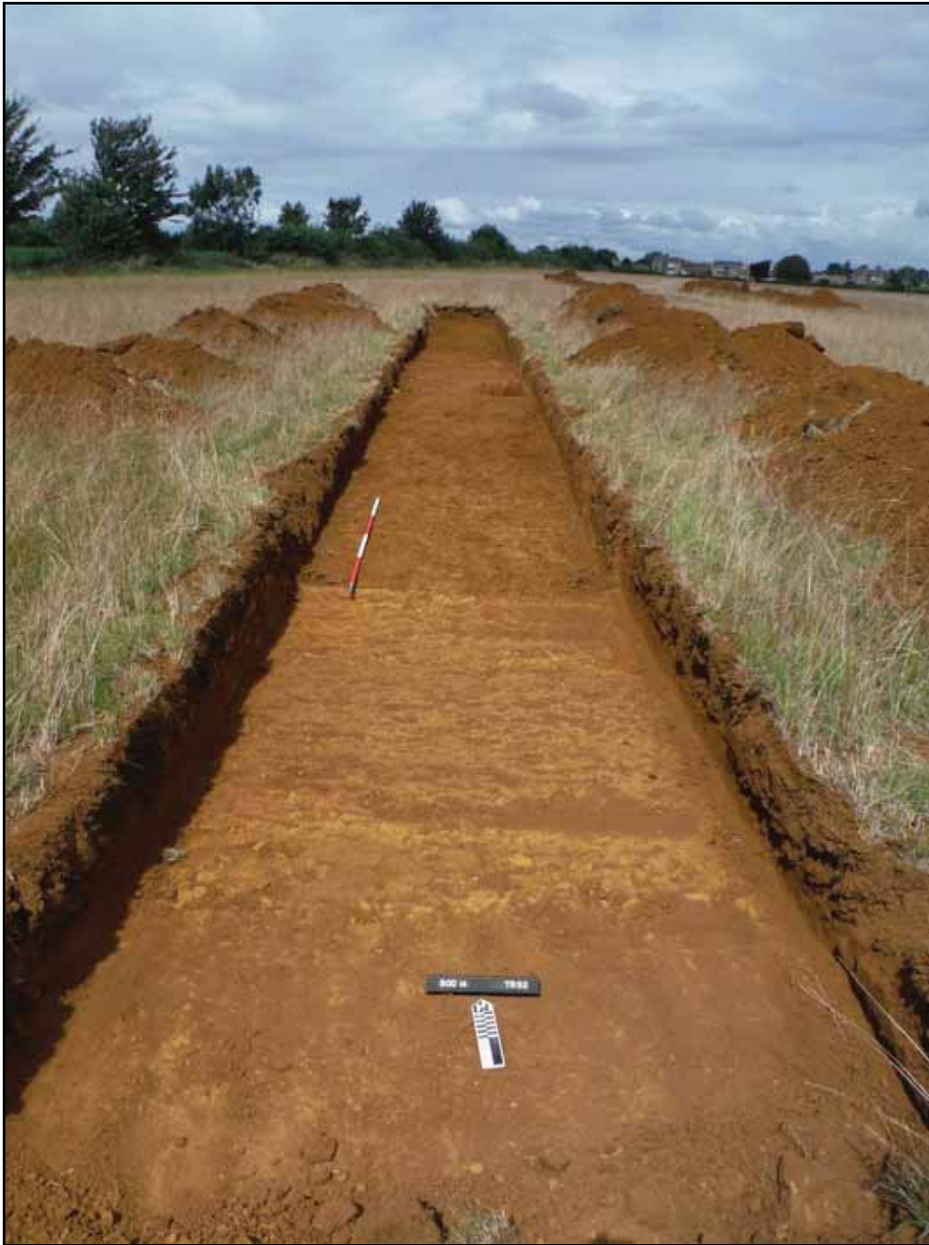
Figure. 62- NNE- facing view of Trench 52 (Scale- 2 x 2m)