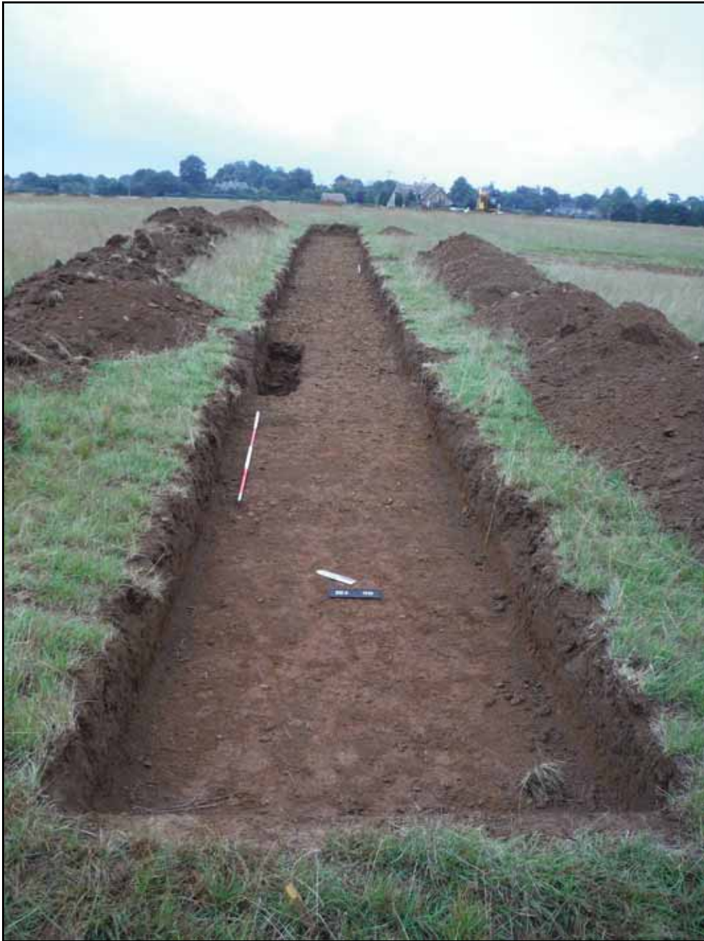
Figure. 77- NE-facing view of Trench 58 (Scale- 2 x 2m)