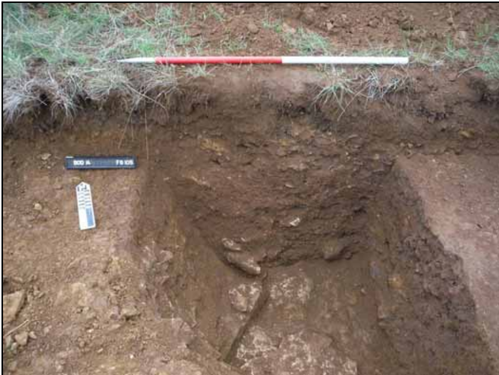
Figure. 92- SSW facing section through pit F.6105 (Scale- 1 x 1m)