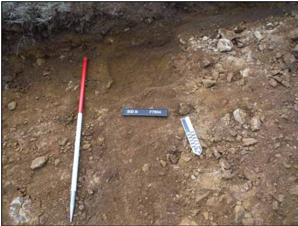
Figure. 118- N-facing section through linear F.7504 (Scale- 1 x 1m)