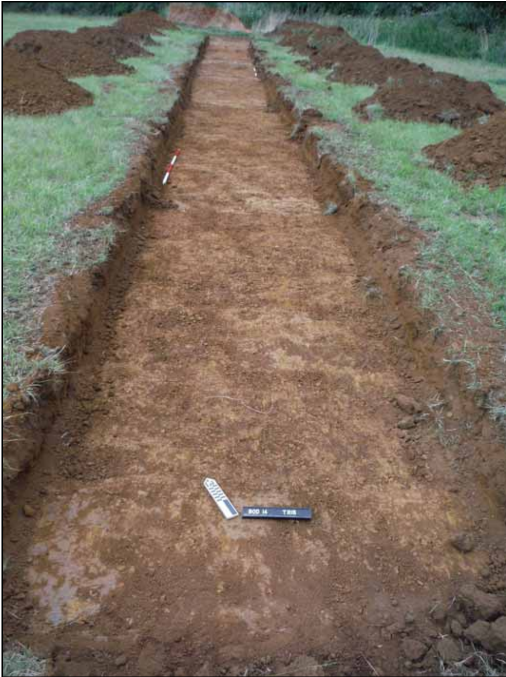
Figure. 127- NE-facing view of Trench 15 (Scale- 2 x2m)