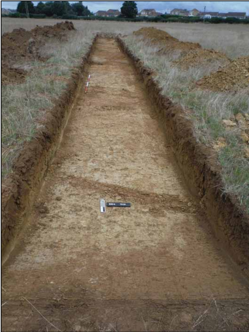
Figure. 31- N facing view of Trench 29 (Scale- 2 x 2m)