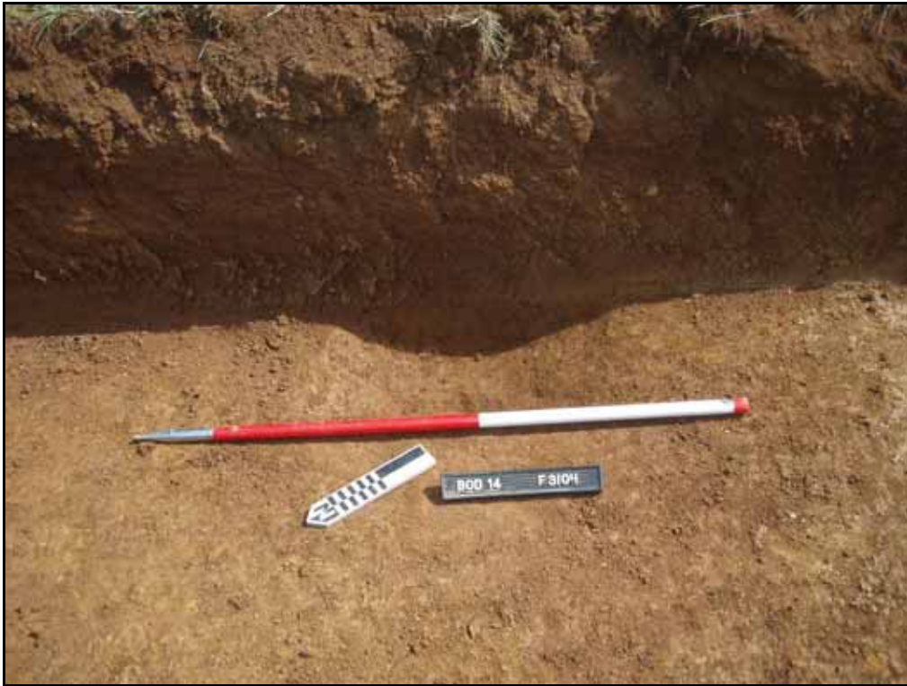
Figure. 45- SE facing view of linear F.3104 (Scale- 1 x 1m)