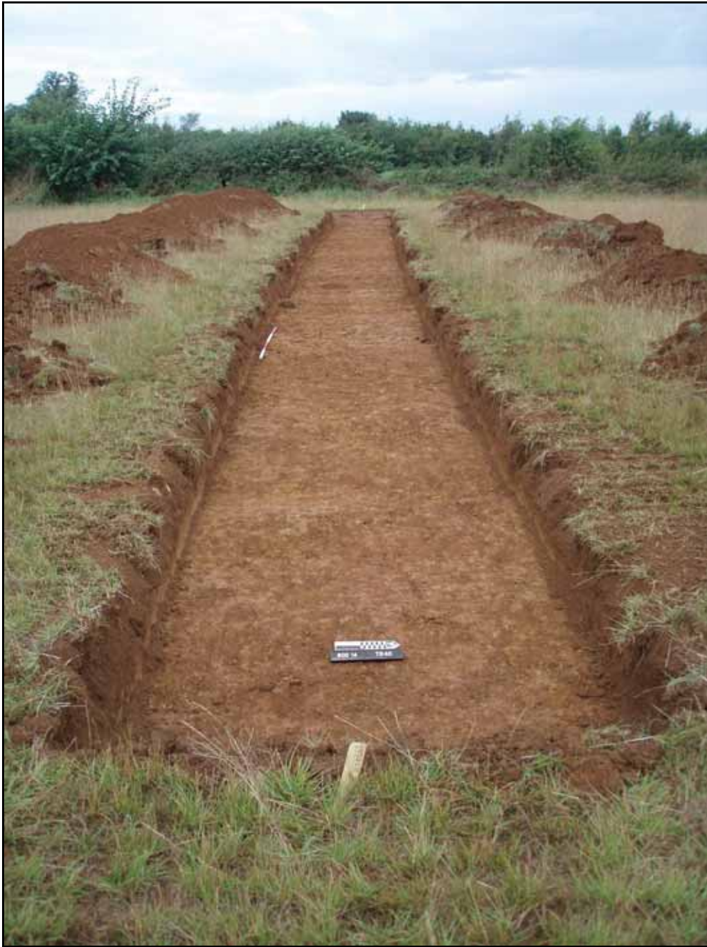
Figure. 136- NE-facing view of Trench 40 (Scale- 2 x 2m)