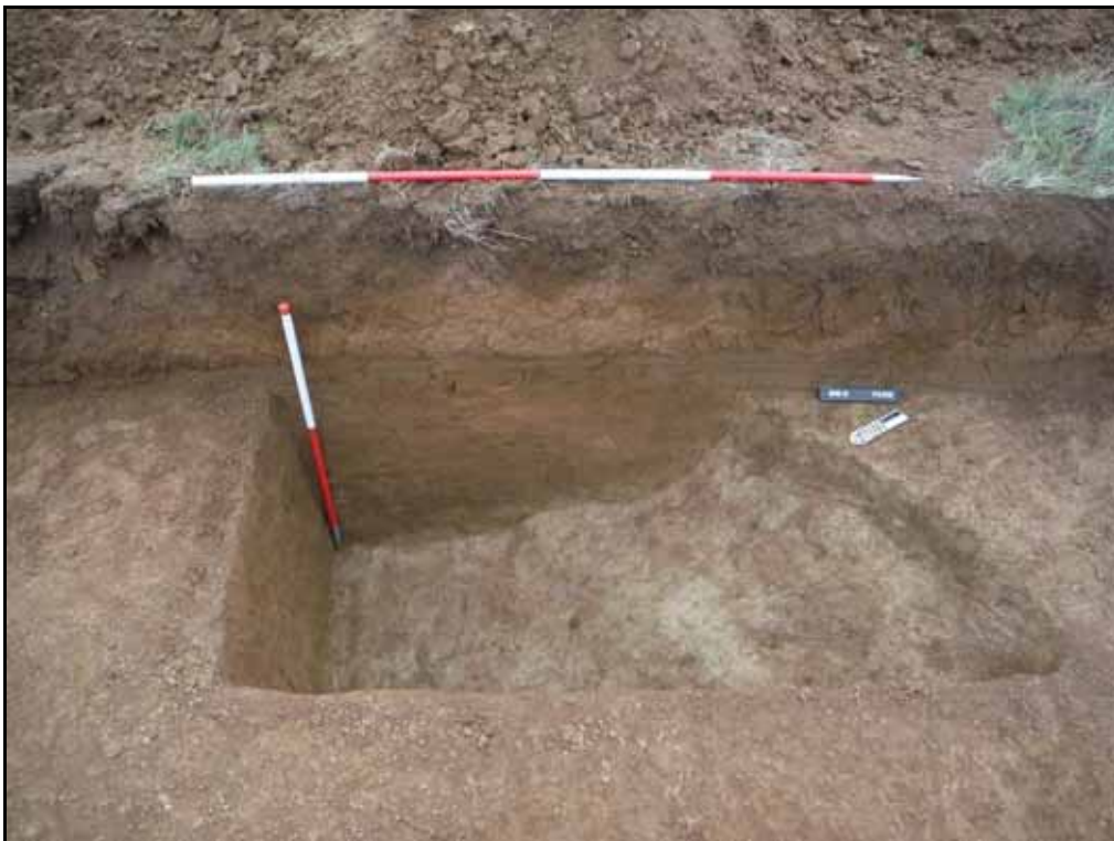
Figure. 56- SE-facing view of pit F.4306 (Scale- 1 x 2m & 1 x 1m)