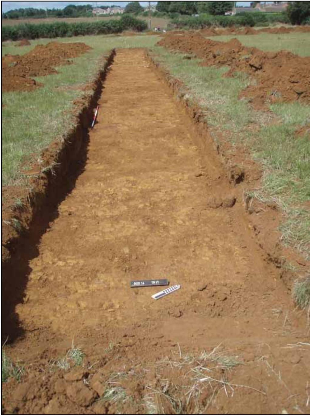
Figure. 128- NW-facing view of Trench 17 (scale- 2 x 2m)