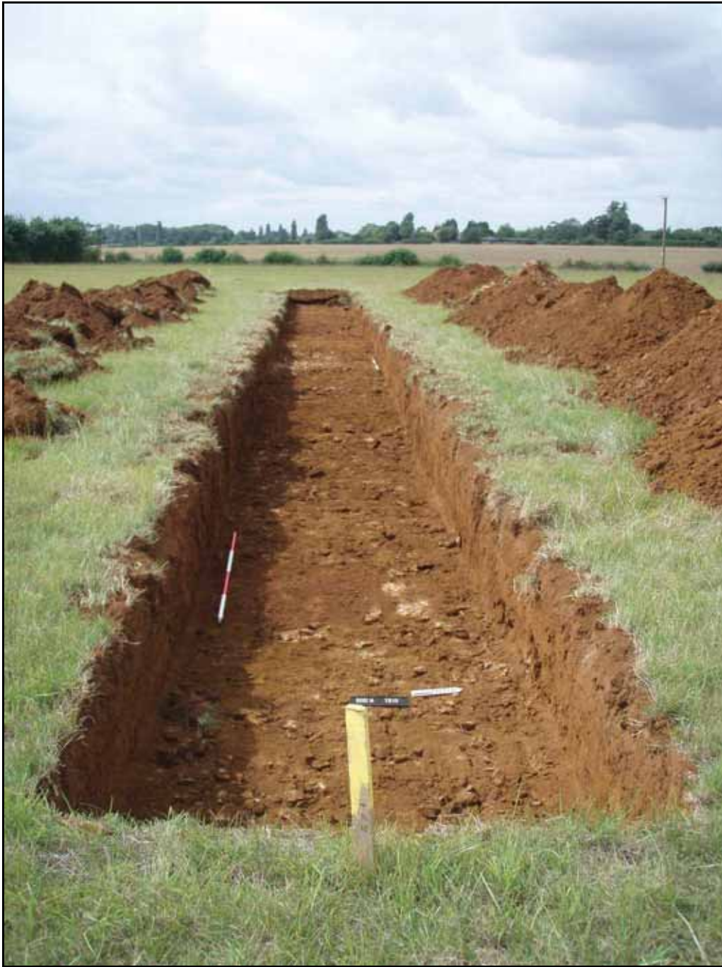
Figure. 124- W-facing view of Trench 10 (Scale- 2 x 2m)