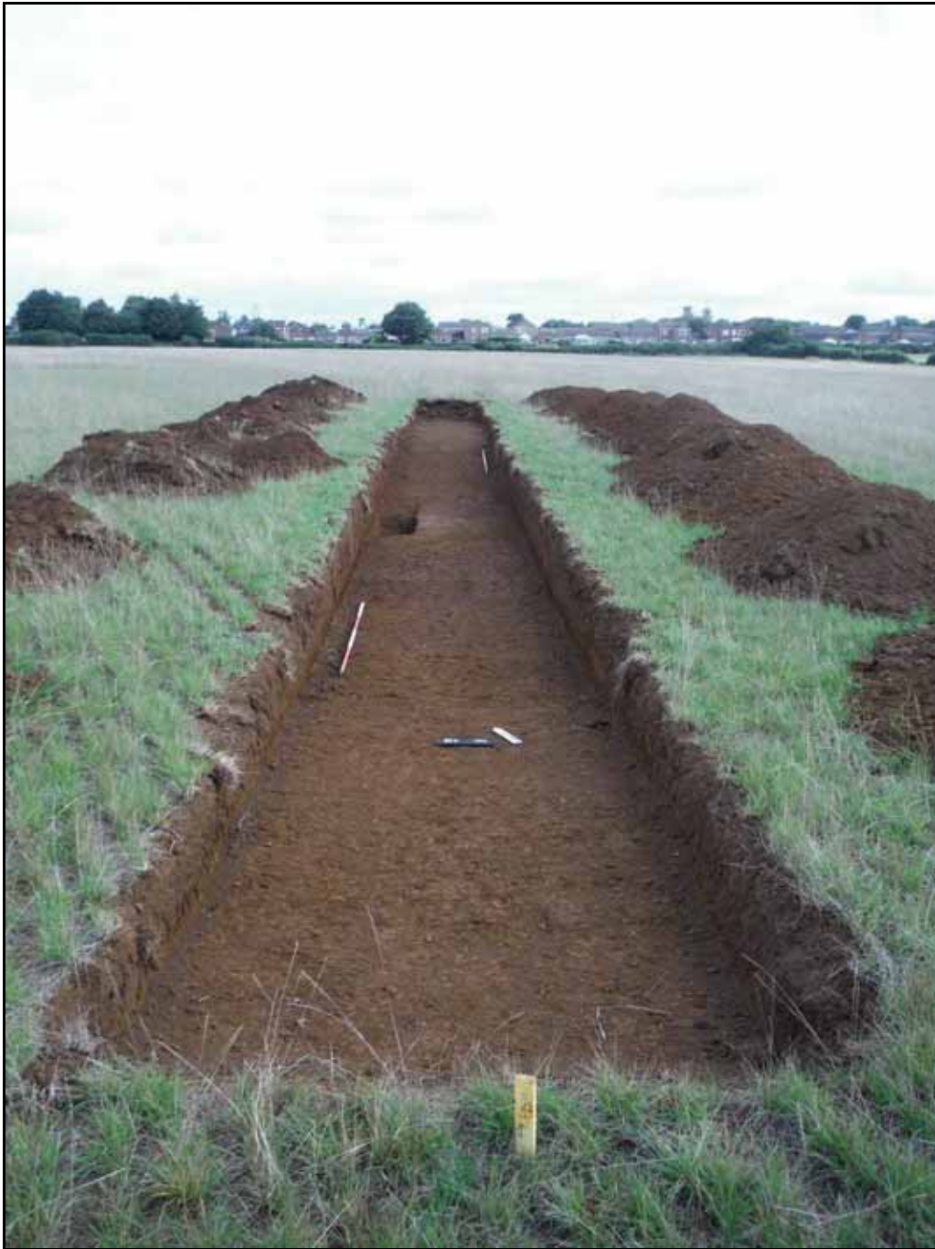
Figure. 52- NE facing view of Trench 43 (Scale- 2 x 2m)