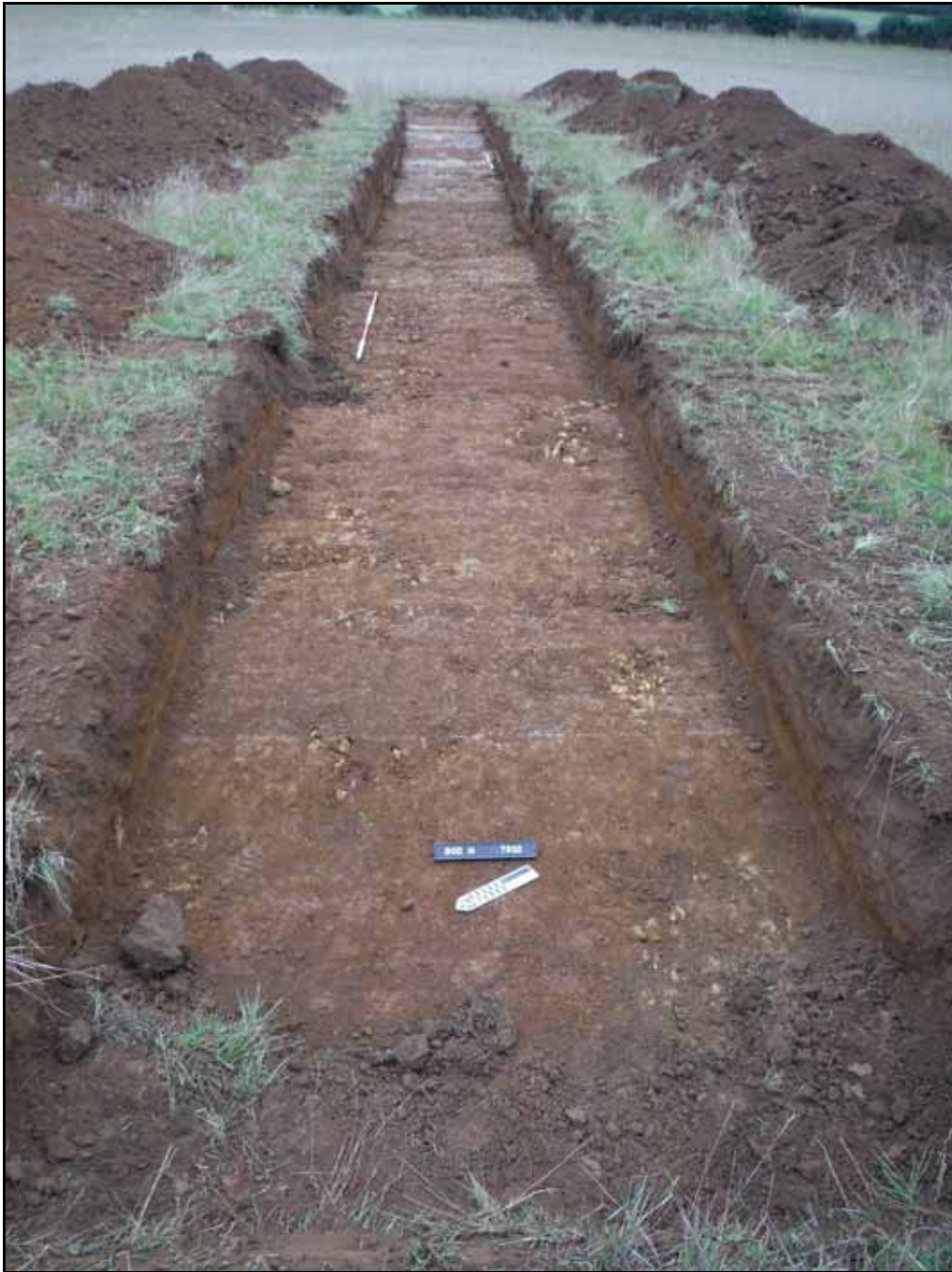
Figure. 134- SW-facing view of Trench 32 (Scale- 2 x 2m)