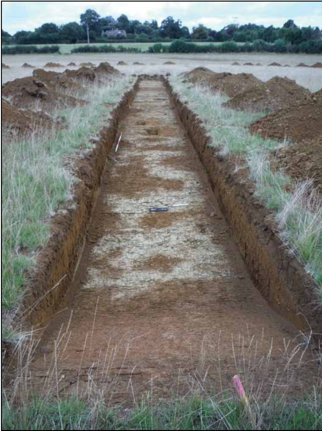
Figure. 140- E-facing view of Trench 45 (Scale- 2 x 2m)