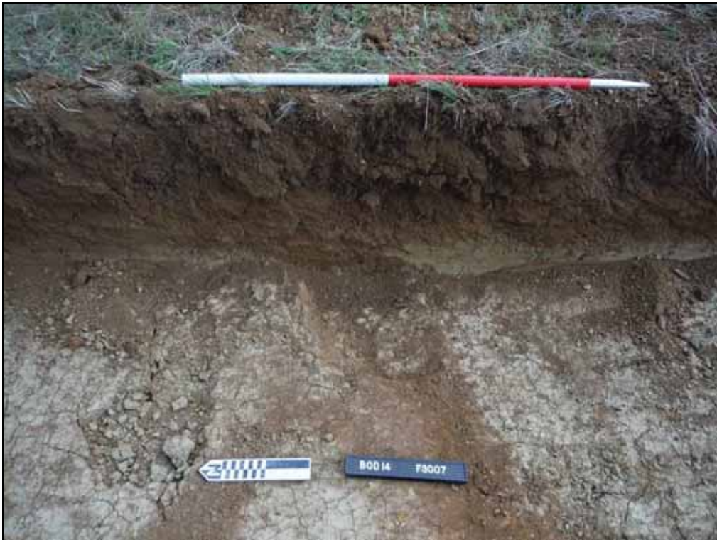
Figure. 40- E-facing view of ditch F.3007 (Scale- 1 x 1m)