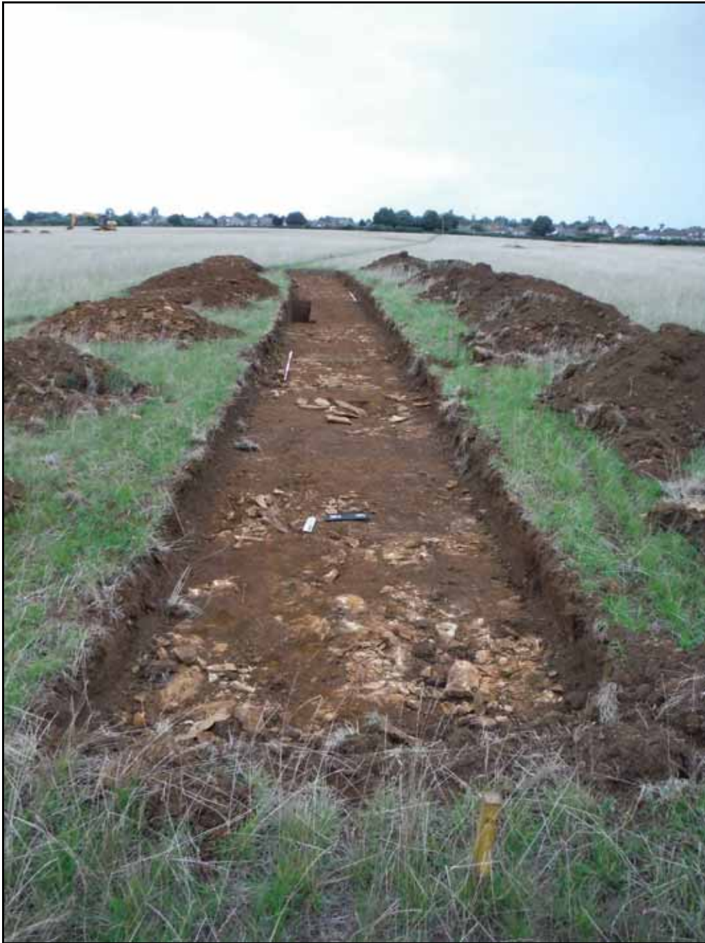
Figure. 116- N-facing view of Trench 70 (Scale- 2 x 2m)