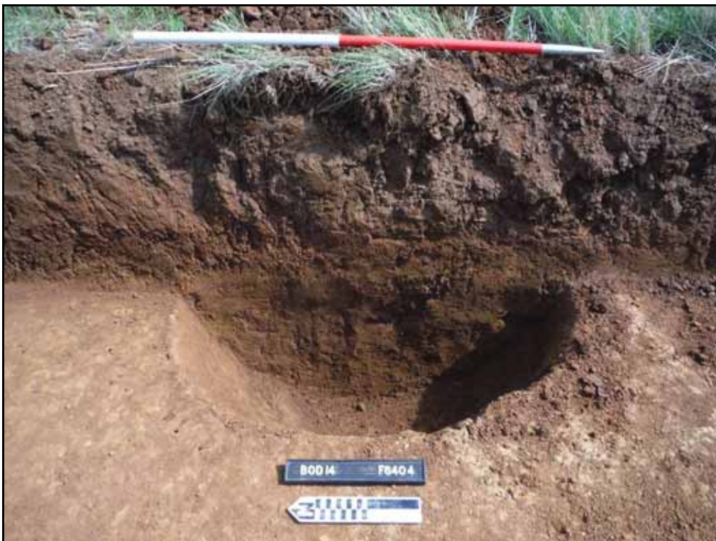
Figure. 98- E-facing view of pit F.6404 (Scale- 1 x 1m)