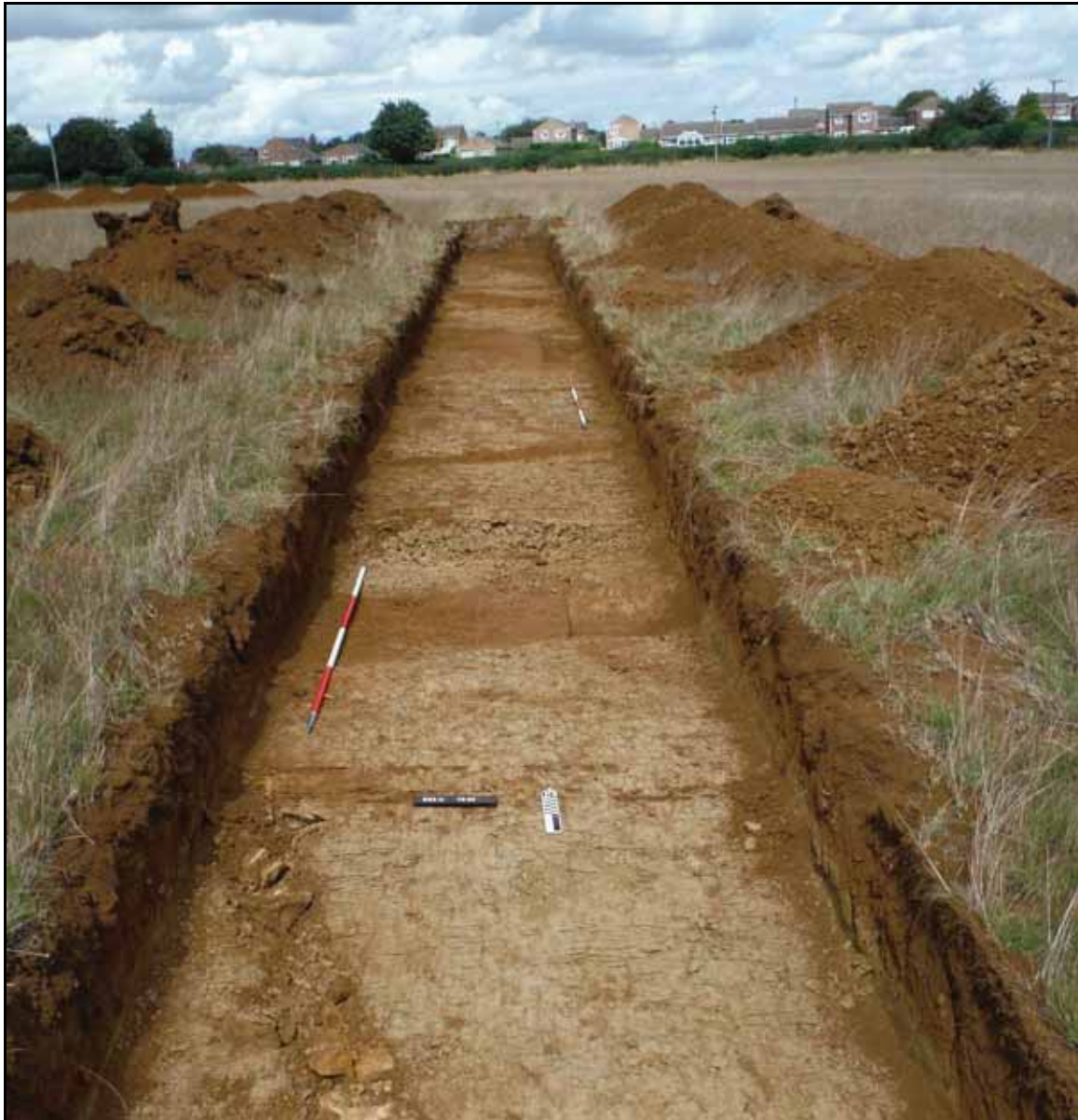
Figure. 38- N-facing view of Trench 30 (Scale- 2 x 2m)