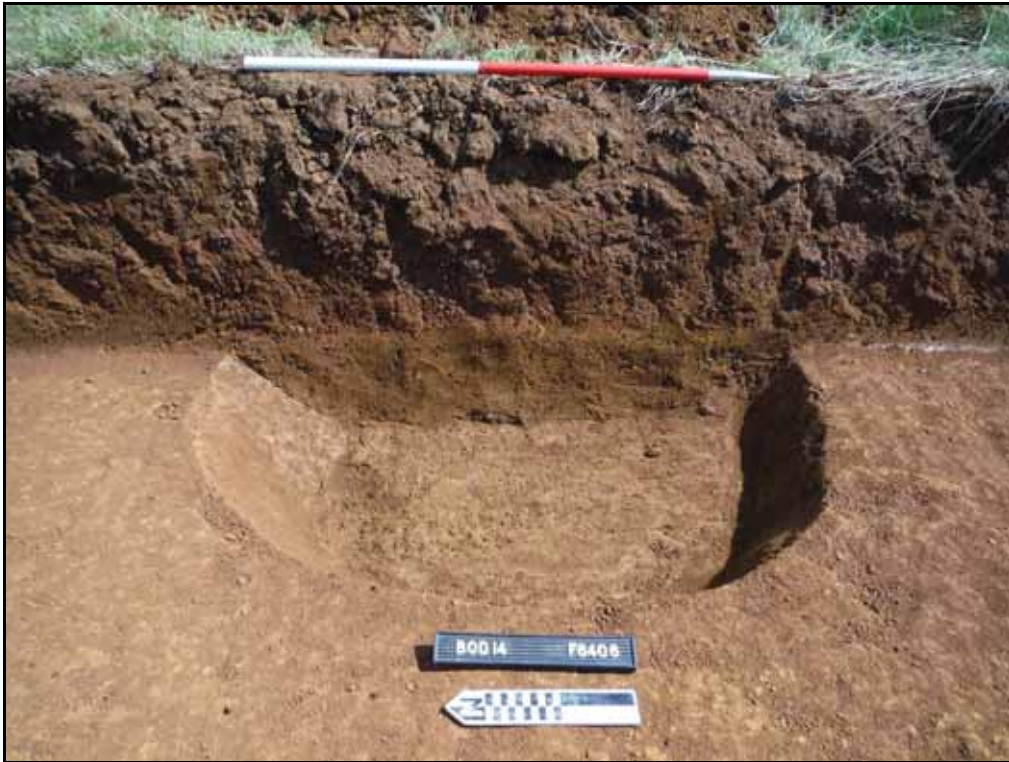
Figure. 100- E-facing view of pit F.6406 (Scale- 1 x 1m)