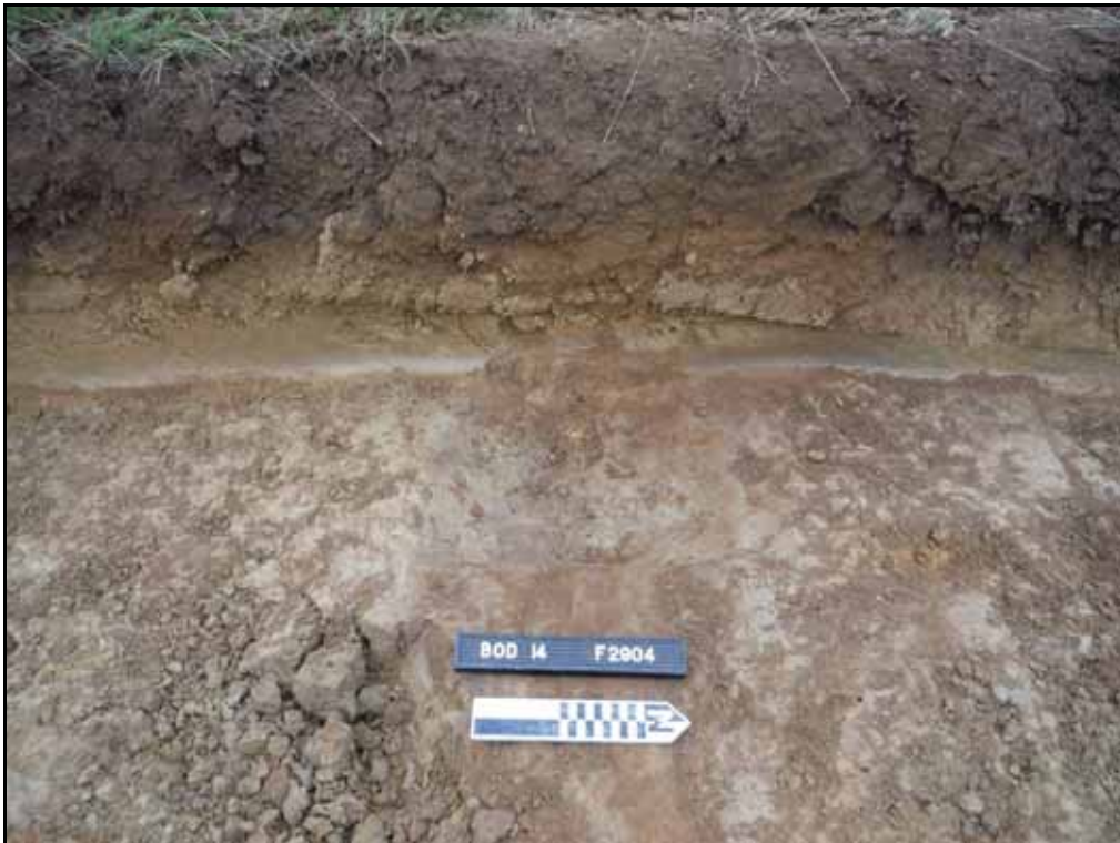
Figure. 35- W-facing view of linear F.2904 (Scale- 1 x 0.2m)