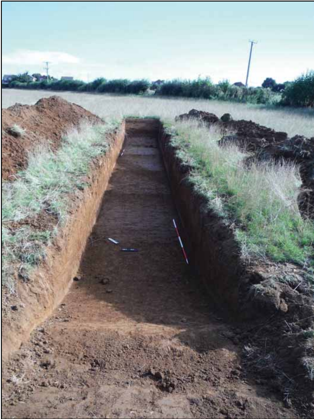
Figure. 130- NE-facing view of Trench 24 (Scale- 2 x 2m)