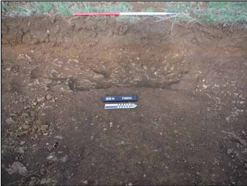
Figure. 106- E-facing section through linear F.6604 (Scale- 1 x 1m)