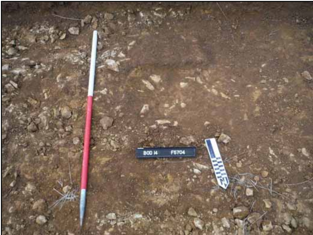
Figure. 73- S-facing view of F.5704 (Scale- 1 x 1m)