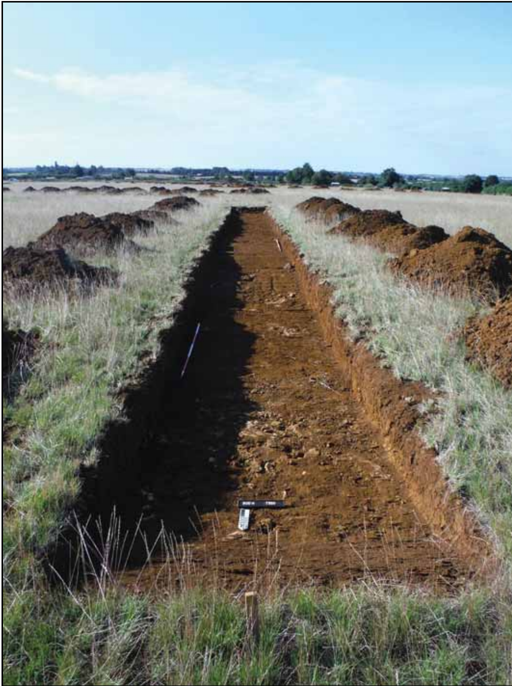
Figure. 61- S-facing view of Trench 50 (Scale – 2 x 2m)