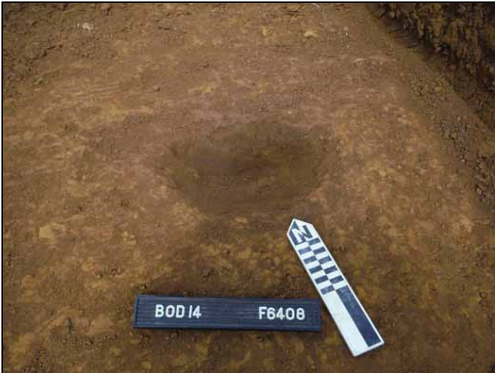
Figure. 101- NE-facing view of posthole F.6408 (Scale 1 x 0.2m)