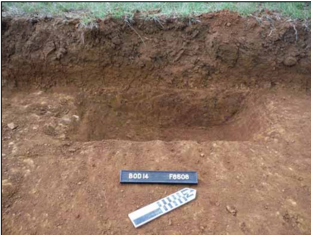
Figure. 104- SE-facing section through linear F.6508 (Scale- 1 x 0.2m)