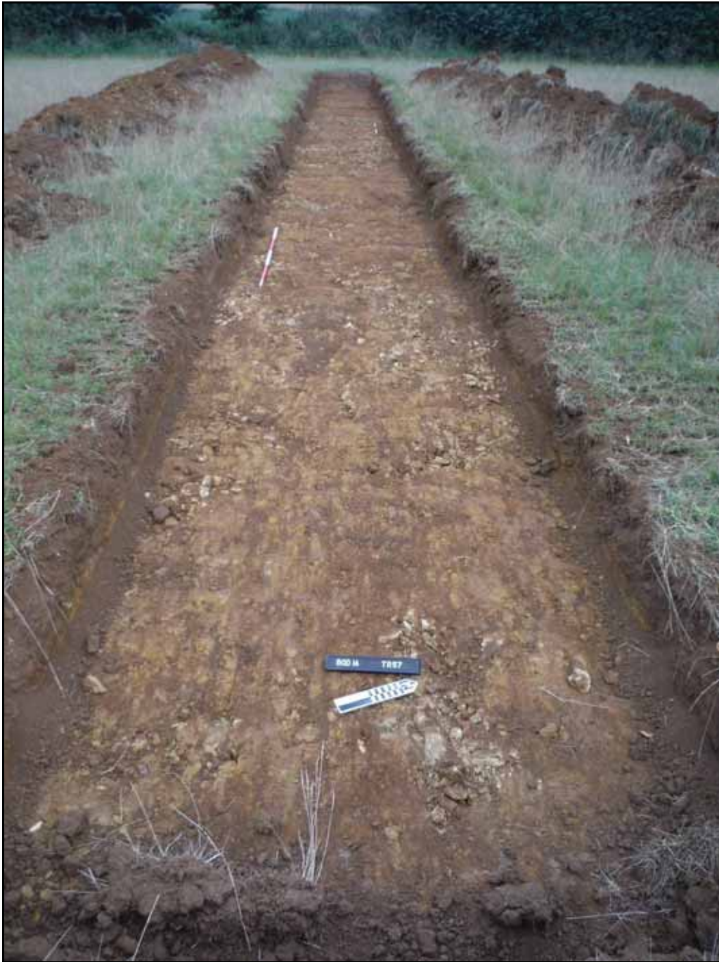
Figure. 74- WNW-facing view of Trench 57 (Scale- 2 x 2m)