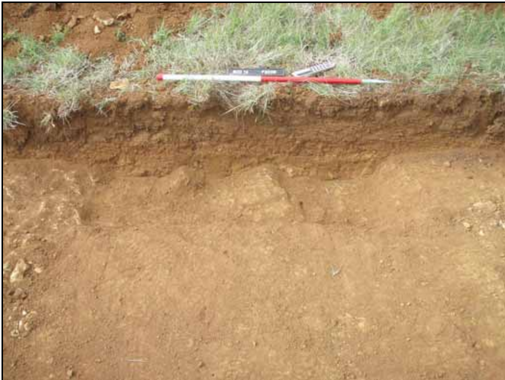
Figure. 30- NW facing view of linear F.2006 (Scale- 1 x 2m)