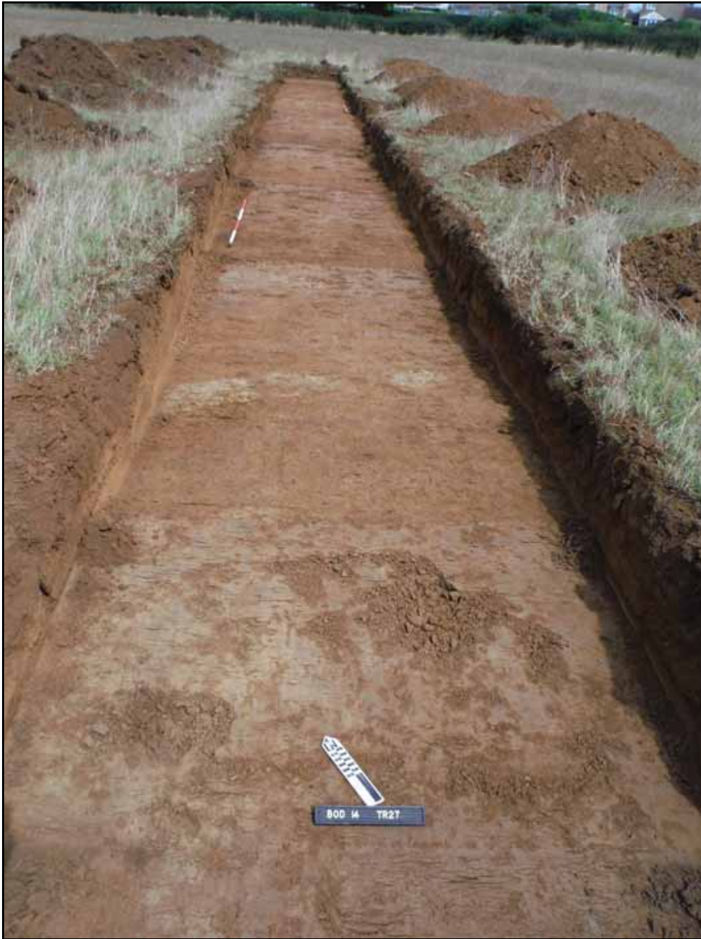
Figure. 132- NE-facing view of Trench 27 (Scale- 2 x 2m)