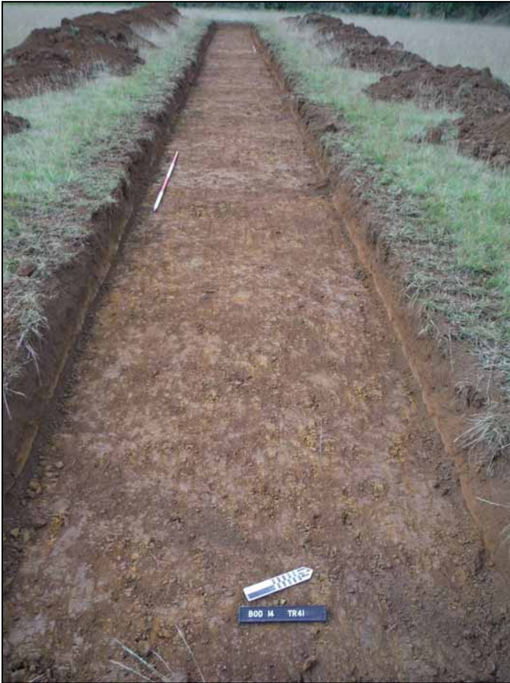
Figure. 137- WNW-facing view of Trench 41 (Scale 2 x 2m)