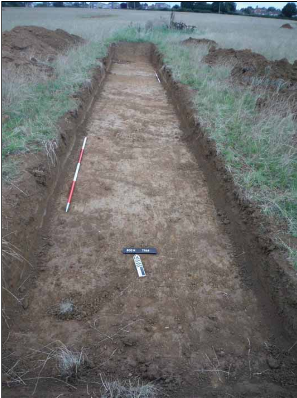
Figure. 58- NNE view of Trench 48 (Scale- 2 x 2m)