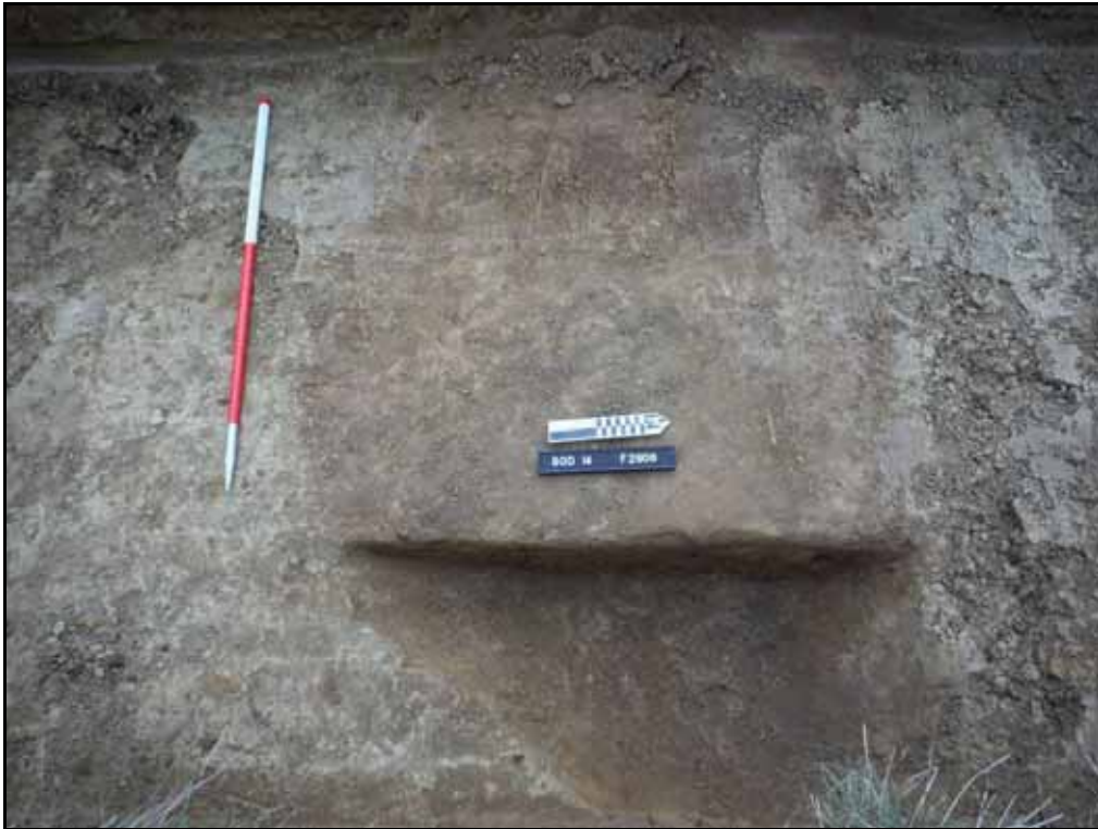
Figure. 32- W-facing view of pit F.2908 (Scale- 1 x 1m)