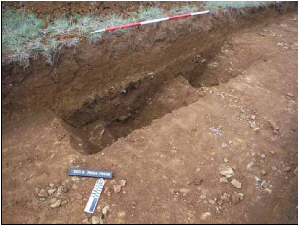
Figure. 103- NW-facing view of enclosure ditches F.6504 and F.6506 (Scale- 1 x 2m)