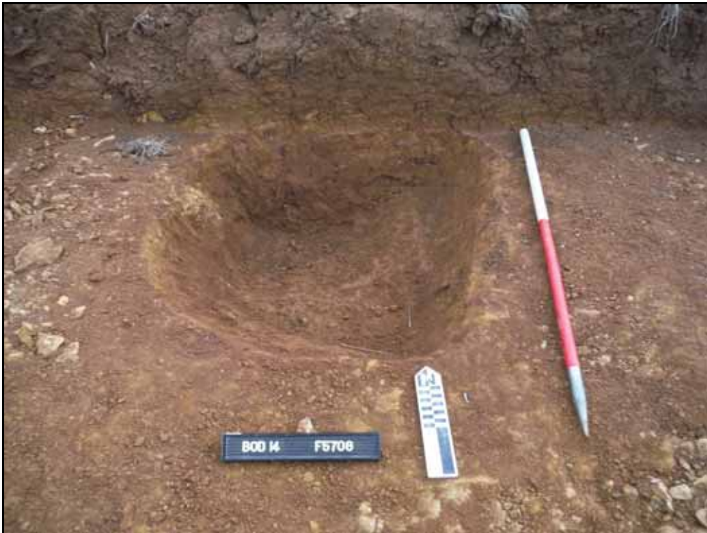
Figure. 76- N-facing view of pit F.5708 (Scale- 1 x 1m)