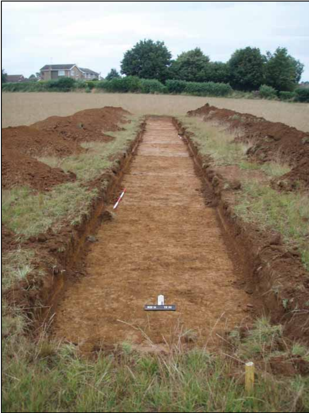
Figure. 135- N-facing view of Trench 33 (Scale- 2 x 2m)