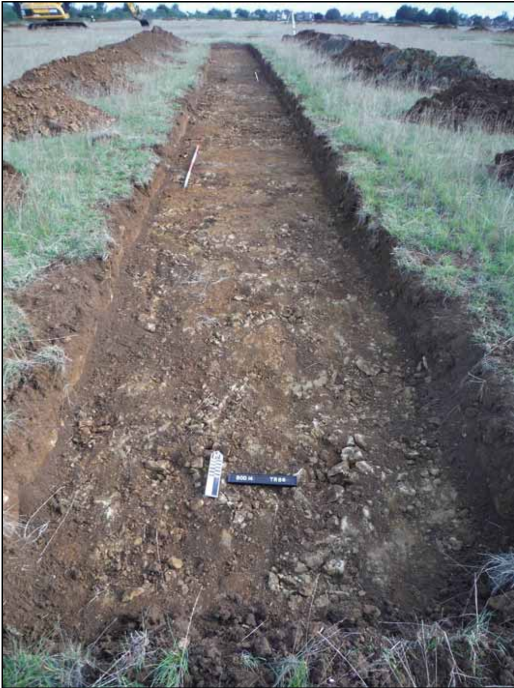
Figure. 105- N-facing view of Trench 66 (Scale- 2 x 2m)