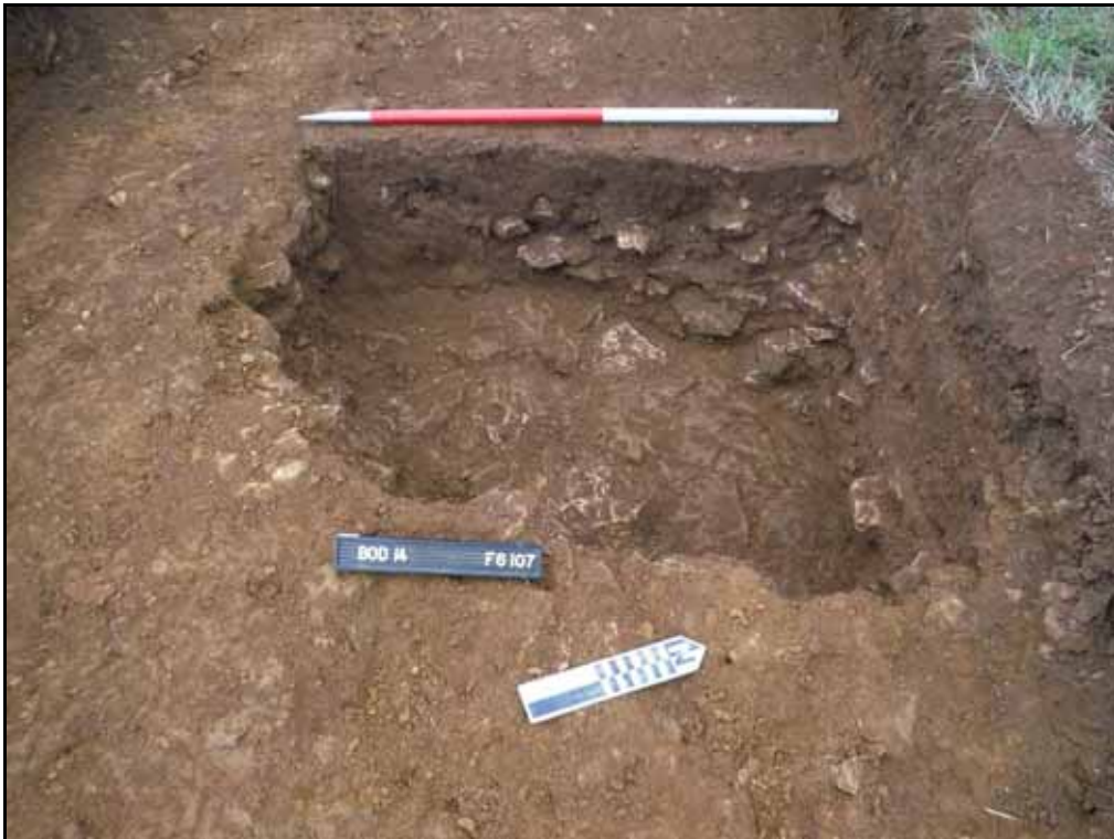
Figure. 94- ESE facing section through pit F.6107 (Scale- 1 x 1m)