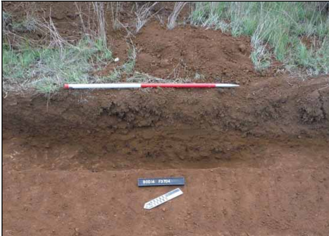
Figure. 47- SE facing view of ditch F.3704 (Scale- 1 x 1m)