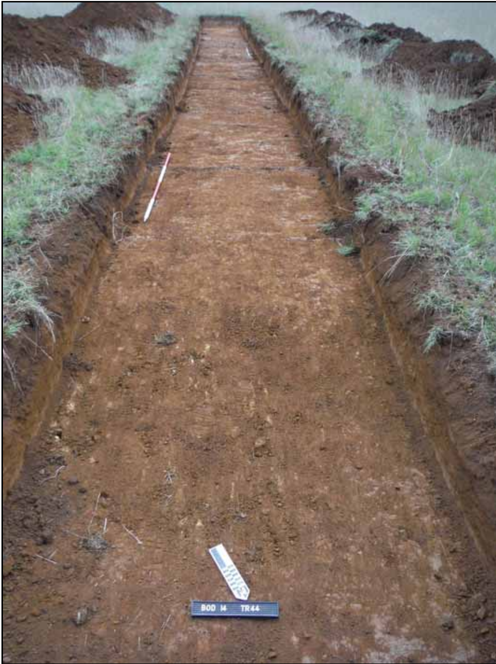
Figure. 139-SW-facing view of Trench 44 (Scale- 2 x 2m)