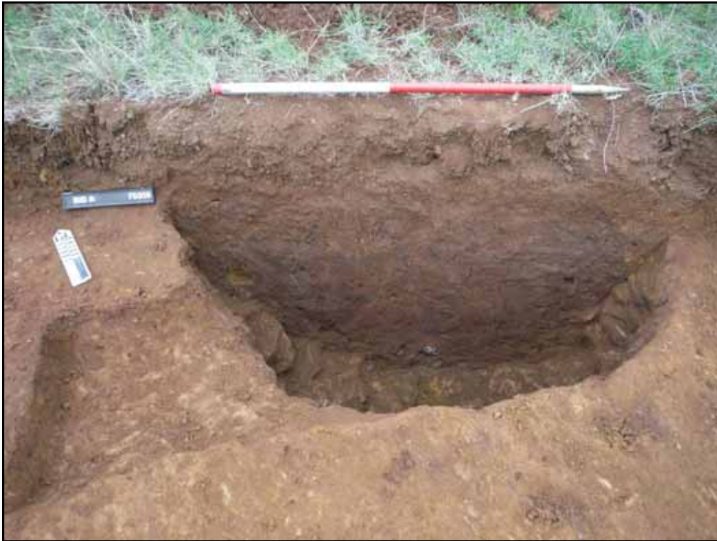
Figure. 69- NE-facing view of pit F.5309 and gully F.5311 (Scale- 1 x 1m)