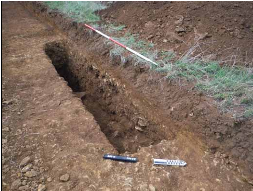
Figure. 78- W-facing view of pits F.5804 and F.5808 in association with enclosure ditch F.5806 (Scale 1 x 2m)