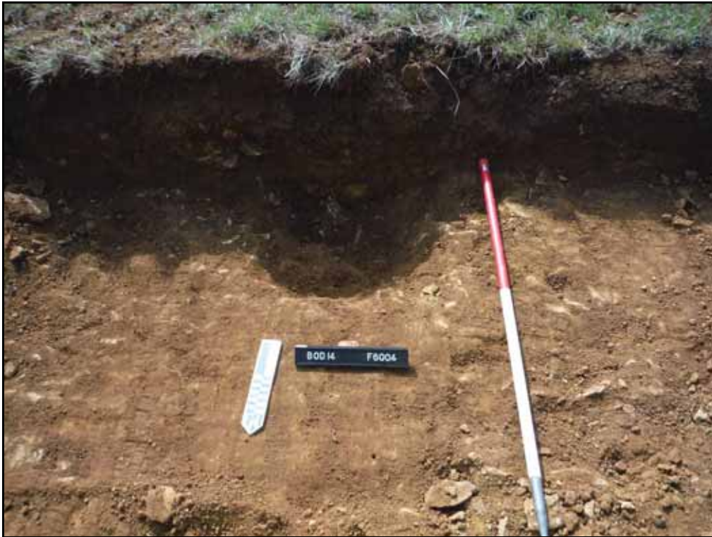
Figure. 86-facing view of pit F.6004 (Scale- 1 x 1m)