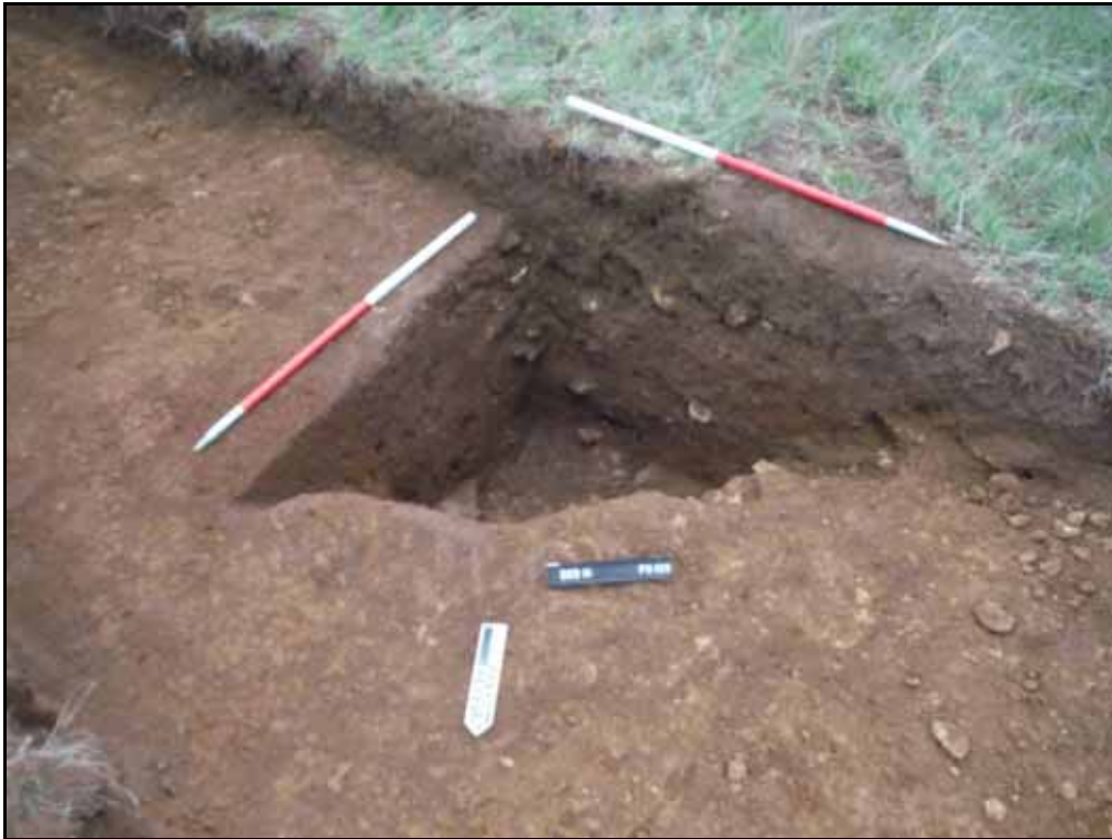
Figure. 95- S-facing view of pit F.6109 (Scale- 2 x 1m)