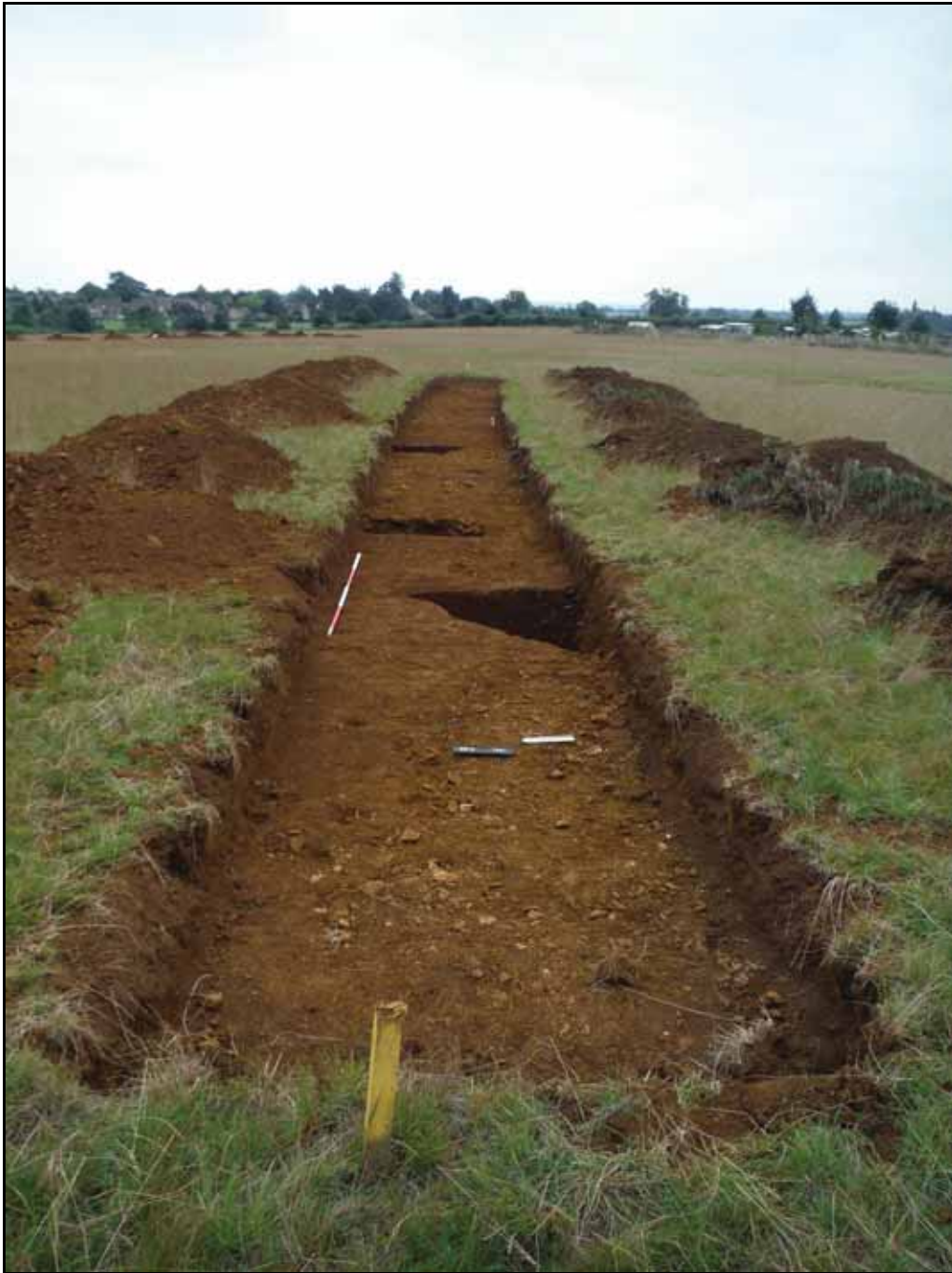
Figure. 90- E-facing view of Trench 61 (Scale- 2 x 2m)