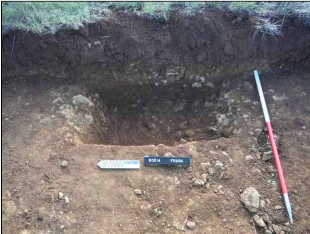
Figure. 83- E-facing view of linear F.5904 (Scale- 1 x 1m)