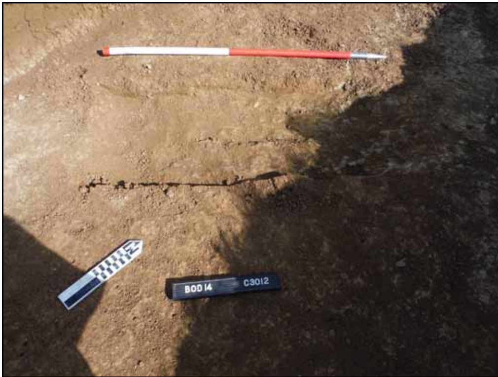
Figure. 43- NE-facing view of linear F.3012