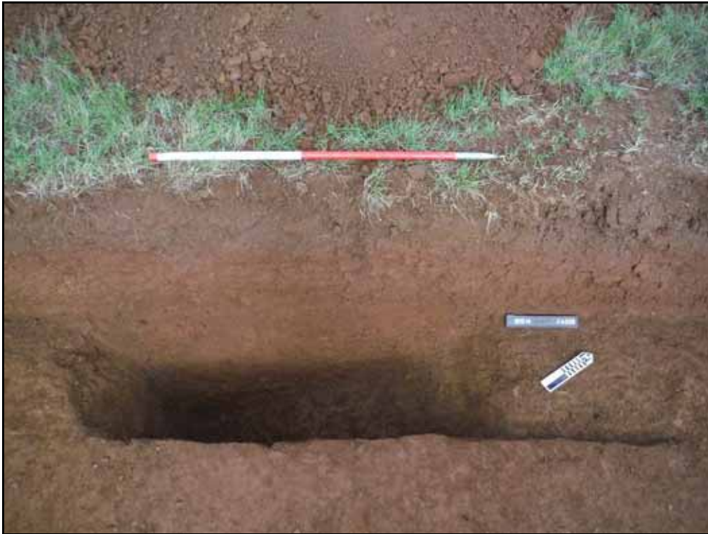
Figure. 53- NW facing view of linear F.4304 (Scale- 1 x 1m)