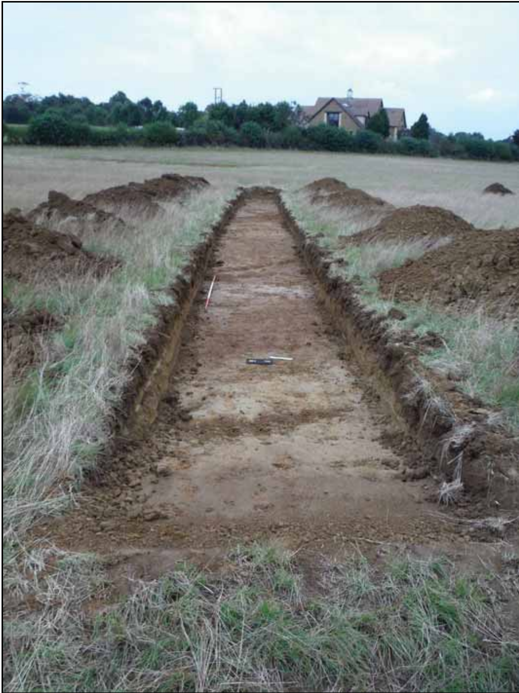
Figure. 141- E-facing view of Trench 46 (Scale- 2 x 2m)