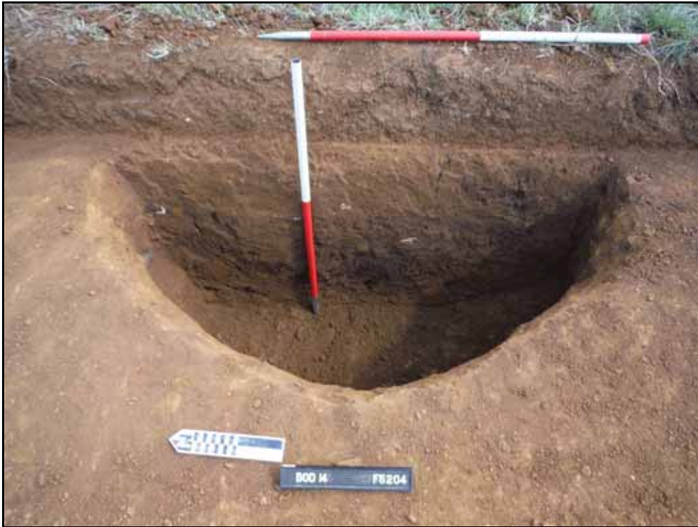
Figure. 63- E-facing view of pit F.5204 (Scale- 2 x 1m)