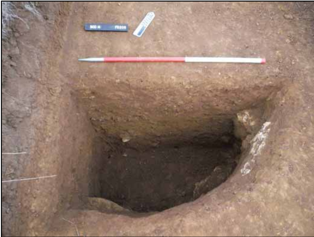
Figure. 65- NNW-facing view of pit F.5208 (Scale- 1 x 1m)