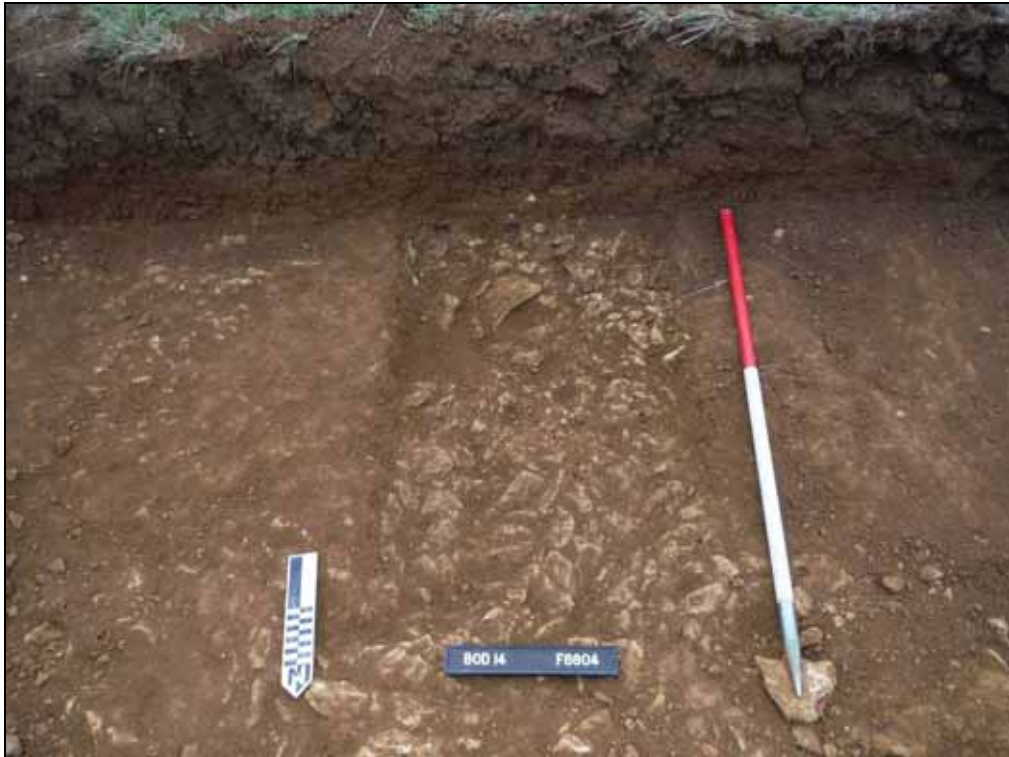
Figure. 110- S-facing view of linear F.6804 (Scale- 1 x 1m)