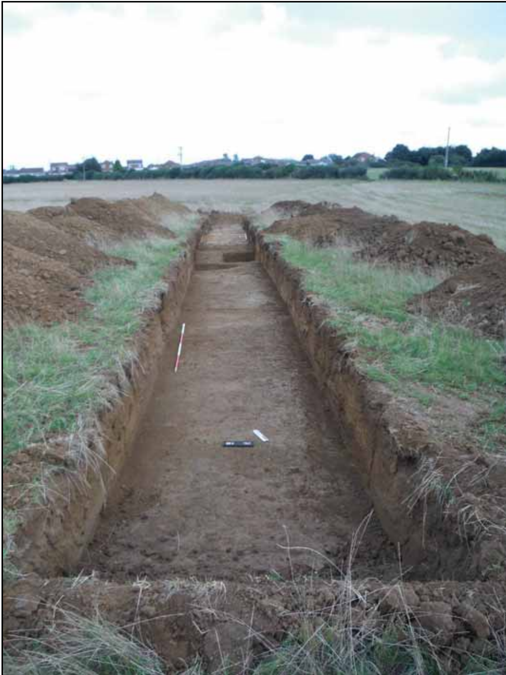
Figure. 57- NNE-facing view of Trench 47 (Scale 2 x 2m)