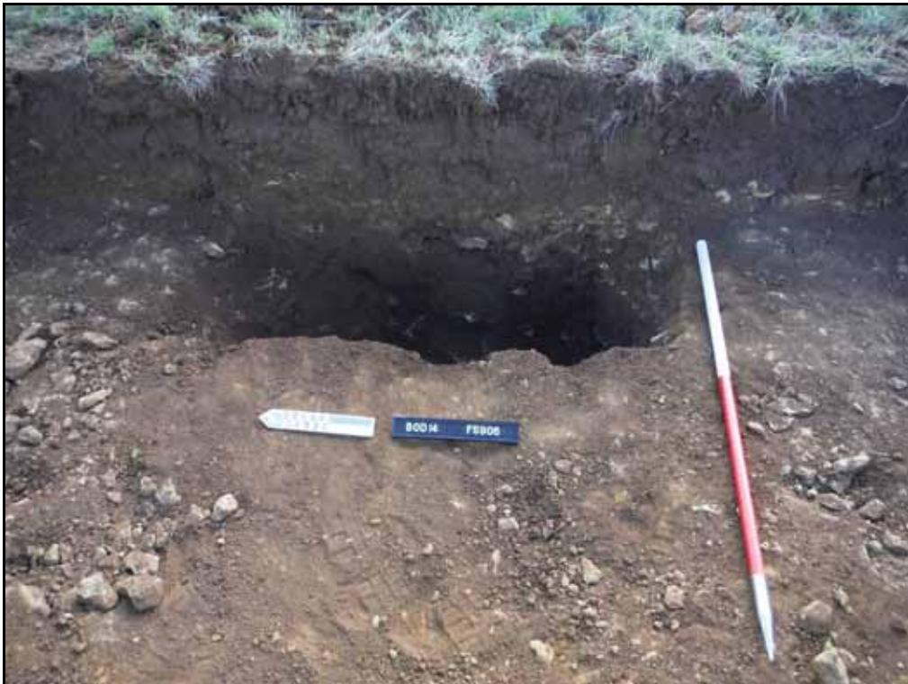
Figure. 84- E-facing view of linear F.5906 (Scale- 1 x 1m)