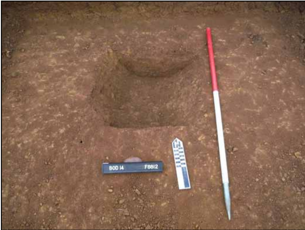
Figure. 114- N-facing view of linear F.6812 (Scale- 1 x 1m)