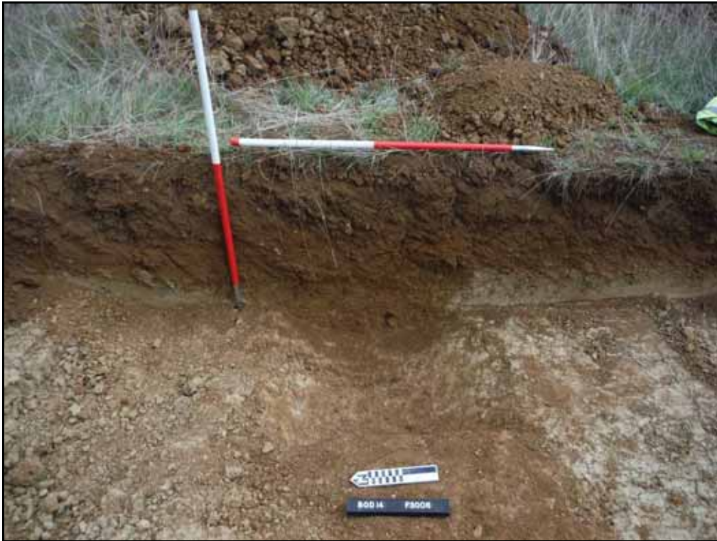
Figure. 39- E-facing view of ditch F.3005 (Scale- 2 x 1m)