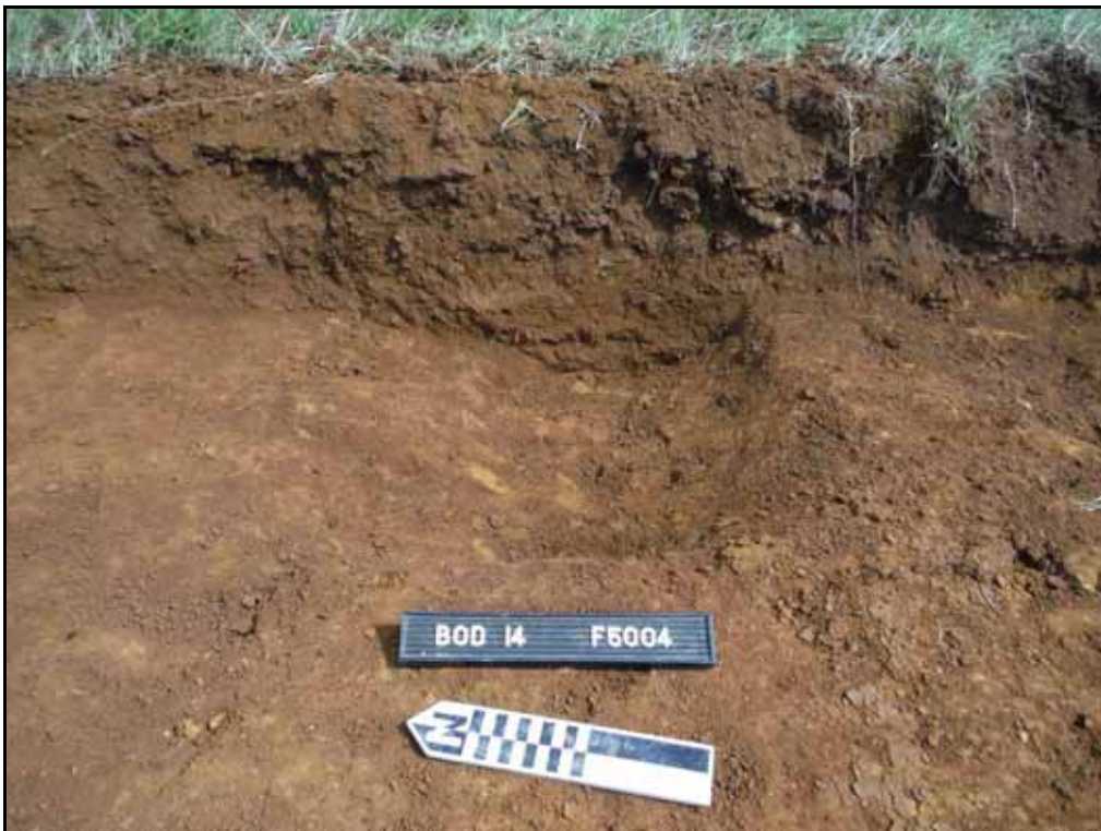
Figure. 60- E-facing view of furrow F.5004 (Scale 1 x 0.2m)