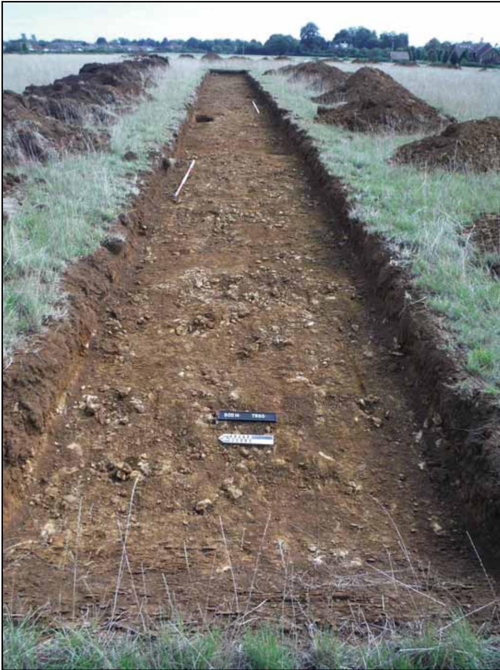
Figure. 85- W-facing view of Trench 60 (Scale- 2 x 2m)