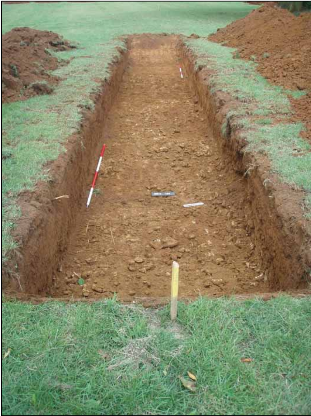
Figure. 121- WNW- facing view of Trench 5 – Trench shortened to avoid damage to nearby trees (Scale- 2 x 2m)