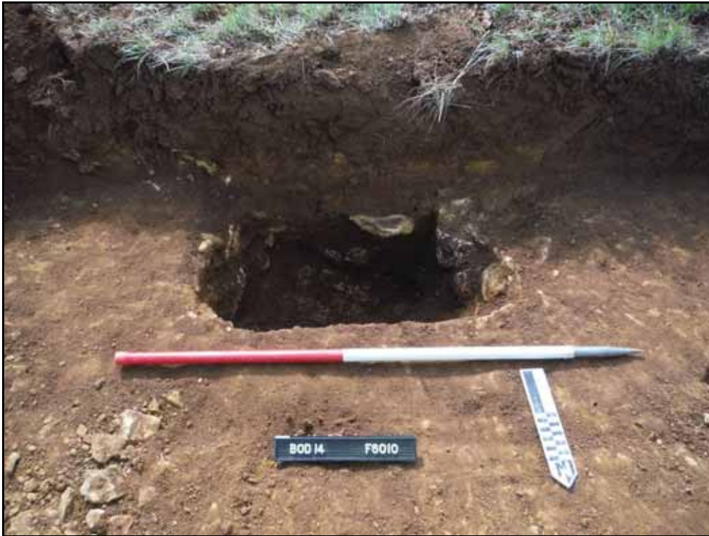
Figure. 88- S-facing view of pit F.6010 (Scale- 1 x 1m)