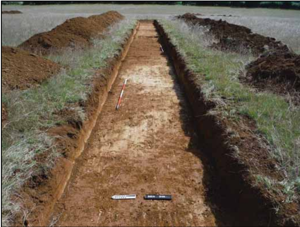
Figure. 143- E-facing view of Trench 55 (Scale- 2 x 2m)