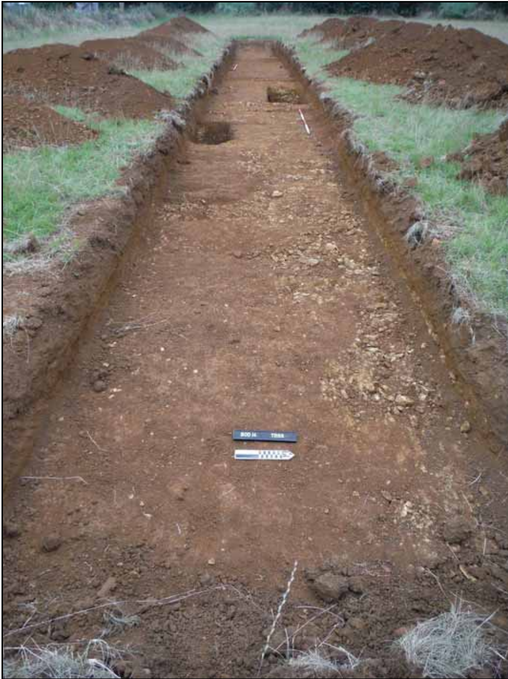
Figure. 111- W-facing view of Trench 68 (Scale- 2 x 2m)