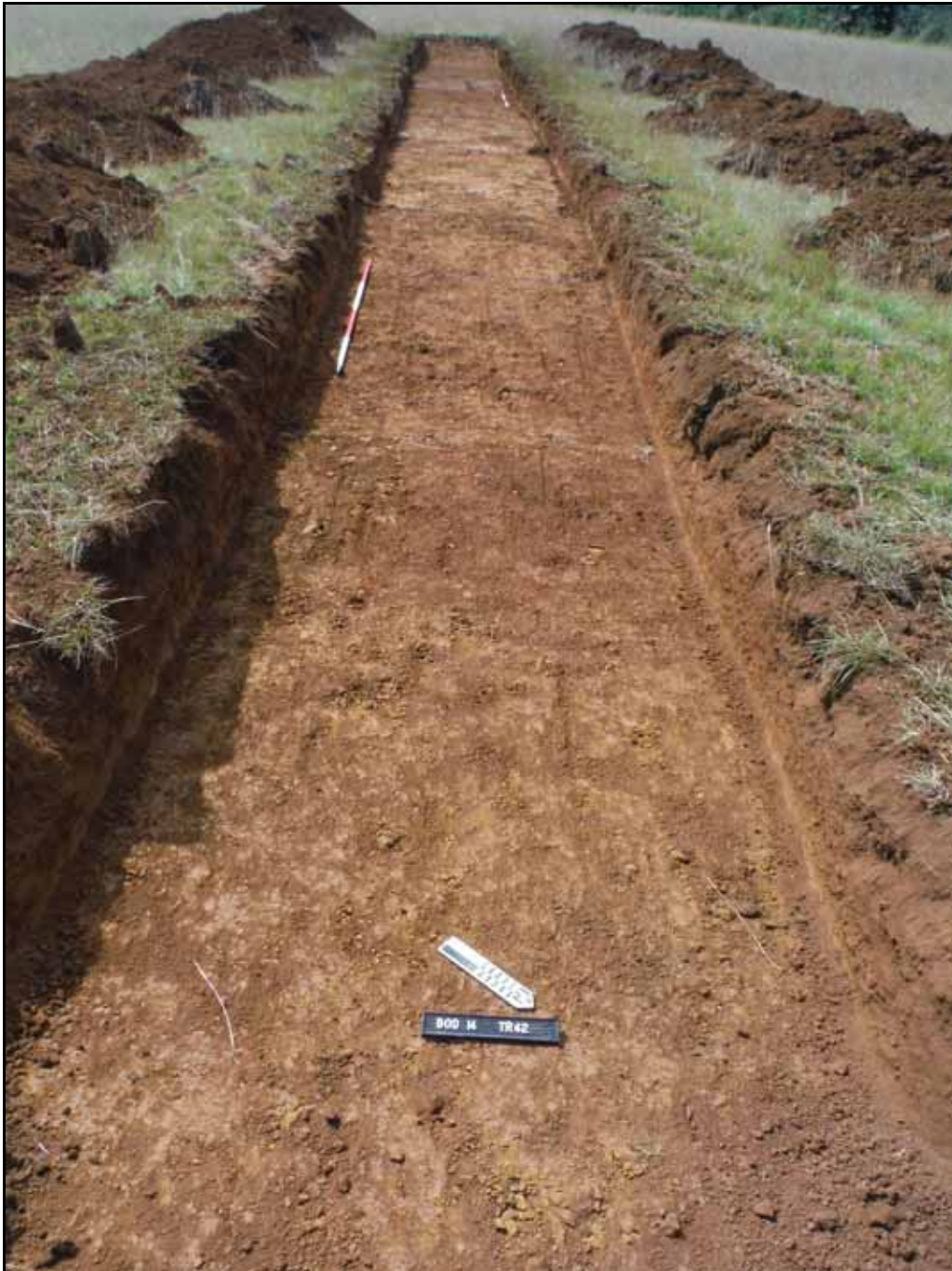
Figure. 138- SW-facing view of Trench 42 (Scale- 2 x 2m)