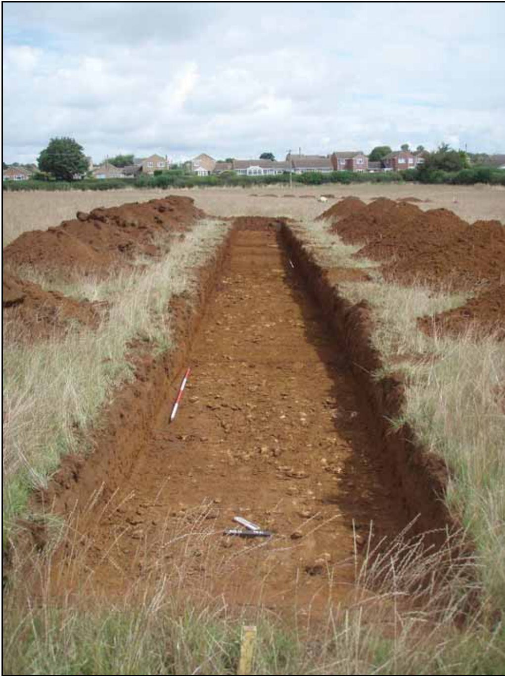
Figure. 44- NE facing view of Trench 31 (Scale- 2 x 2m)