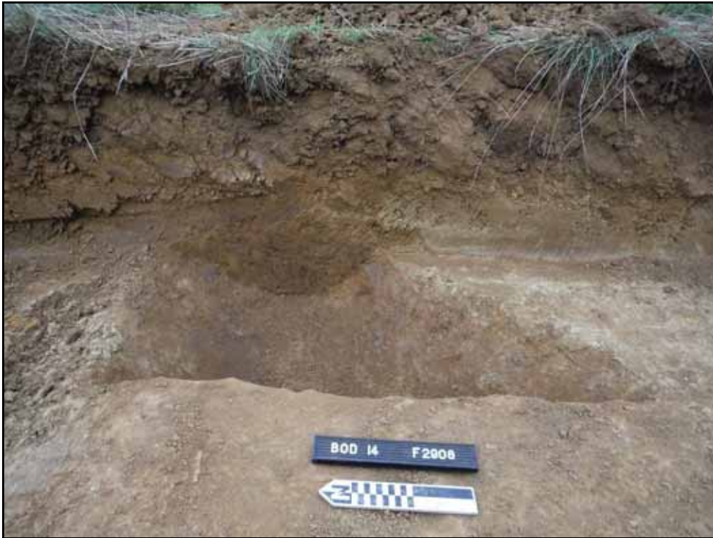
Figure. 34- E-facing view of section F.2908 (Scale- 1 x 0.2m)