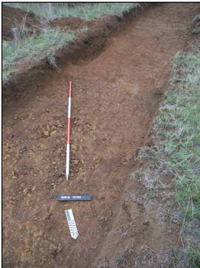
Figure. 48- SSW facing view of linear F.3704 (Scale- 1 x 2m)