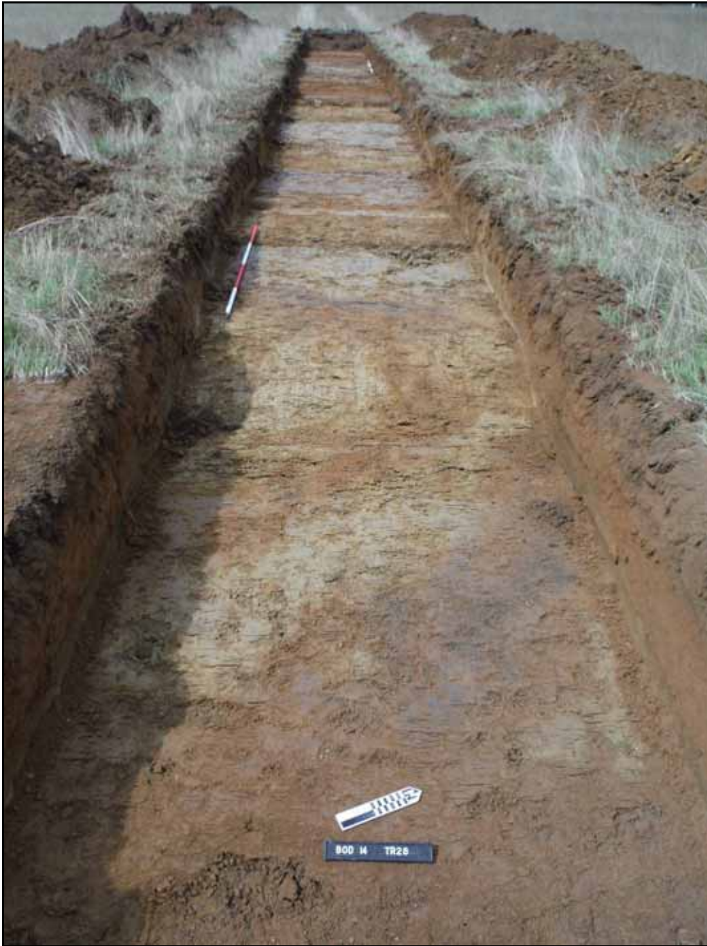
Figure. 133- WNW-facing view of Trench 28 (Scale- 2 x 2m)