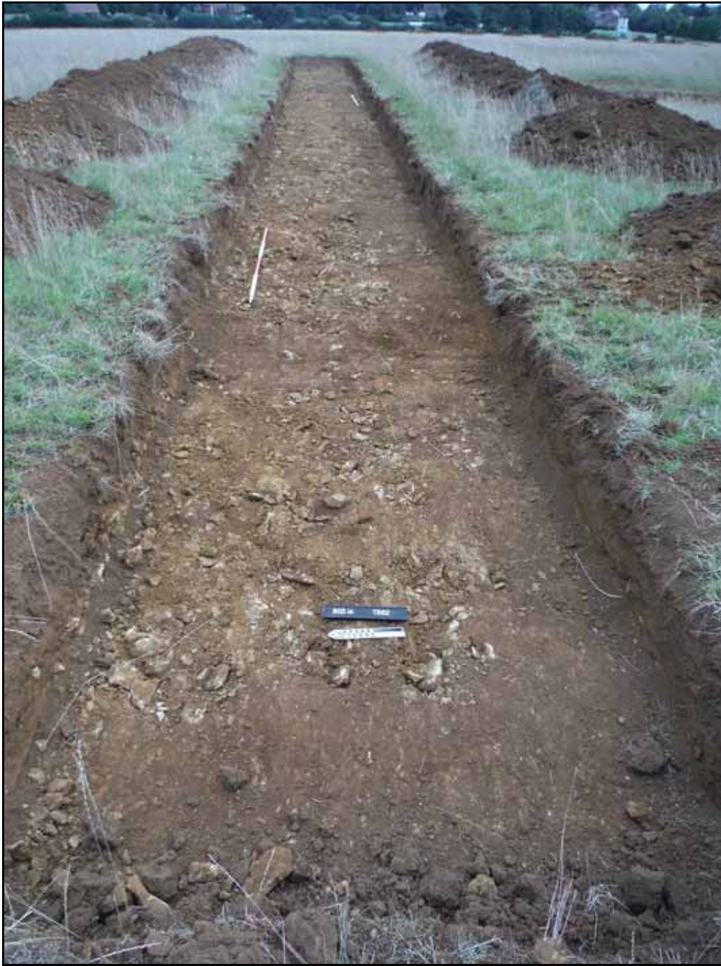
Figure. 145- E-facing view of Trench 62 (Scale- 2 x 2m)