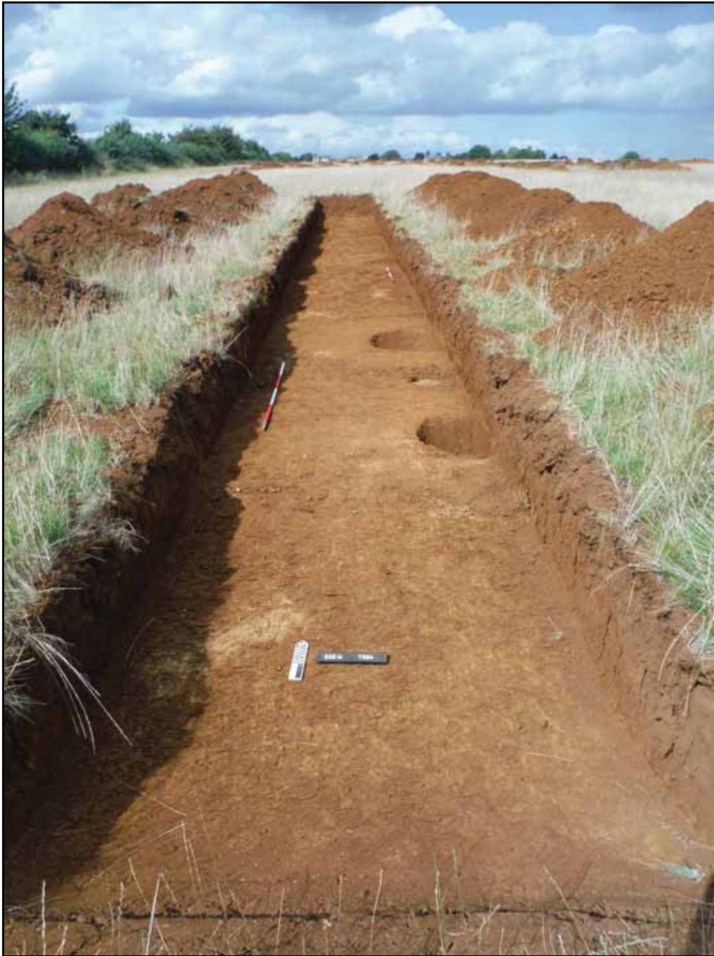
Figure. 99- N-facing view of Trench 64 (scale- 2 x 2m)