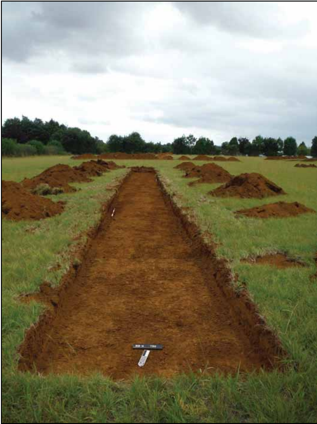
Figure. 126- SSE-facing view of Trench 14 (Scale- 2 x 2m)