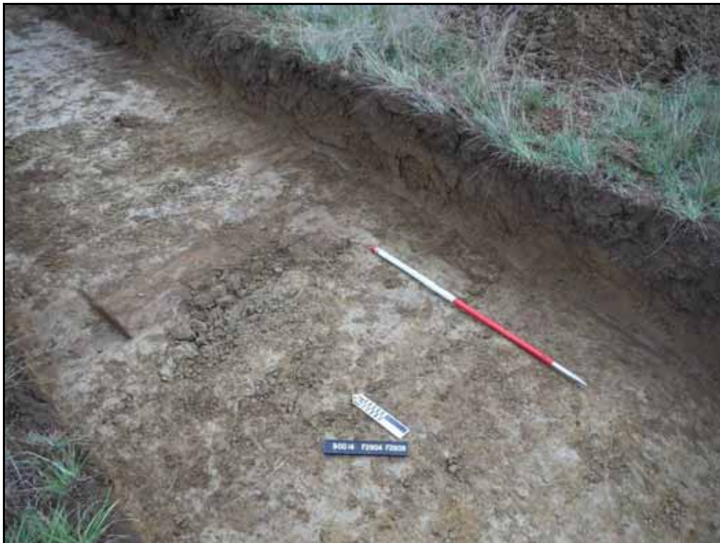
Figure. 37- NE-facing view of linears F.2906 and F.2904 (Scale- 1 x 1m)