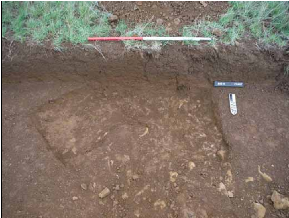
Figure. 72- S-facing view of F.5407 and F.5409 (Scale- 1 x 1m)