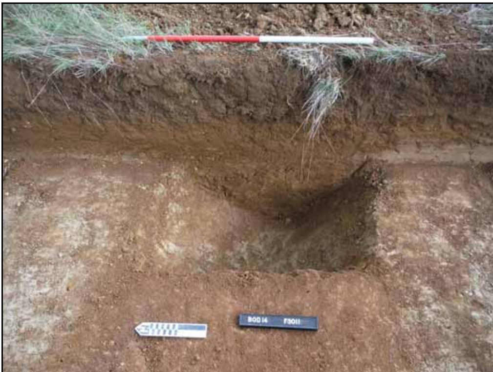
Figure. 42- E-facing view of ditch F.3011 (Scale- 1 x 1m)