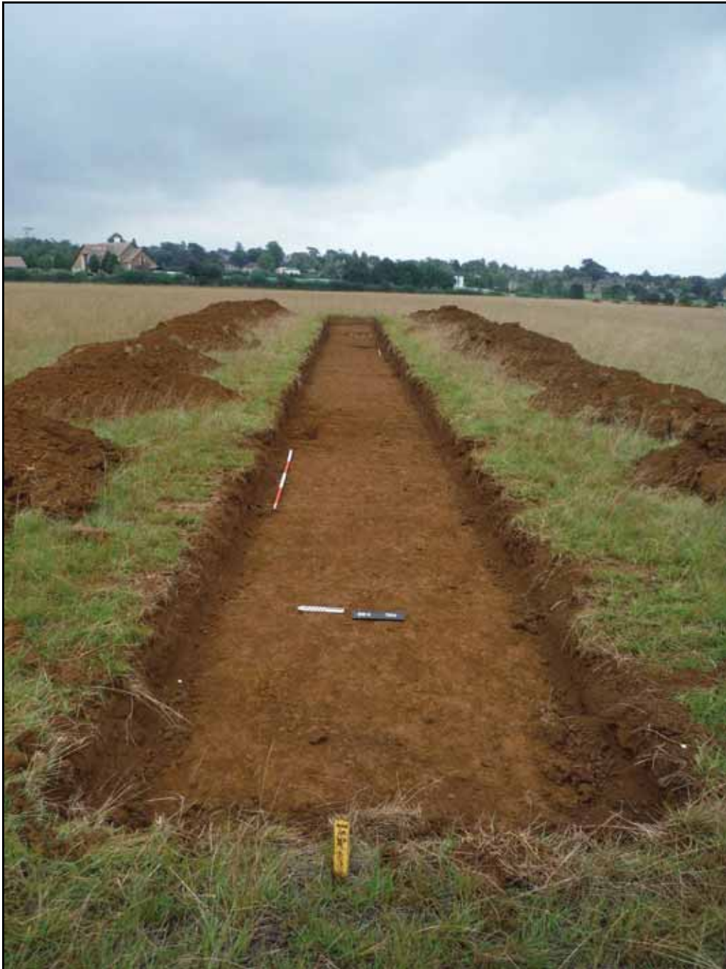
Figure. 71- E-facing view of Trench 54 (Scale- 2 x 2m)