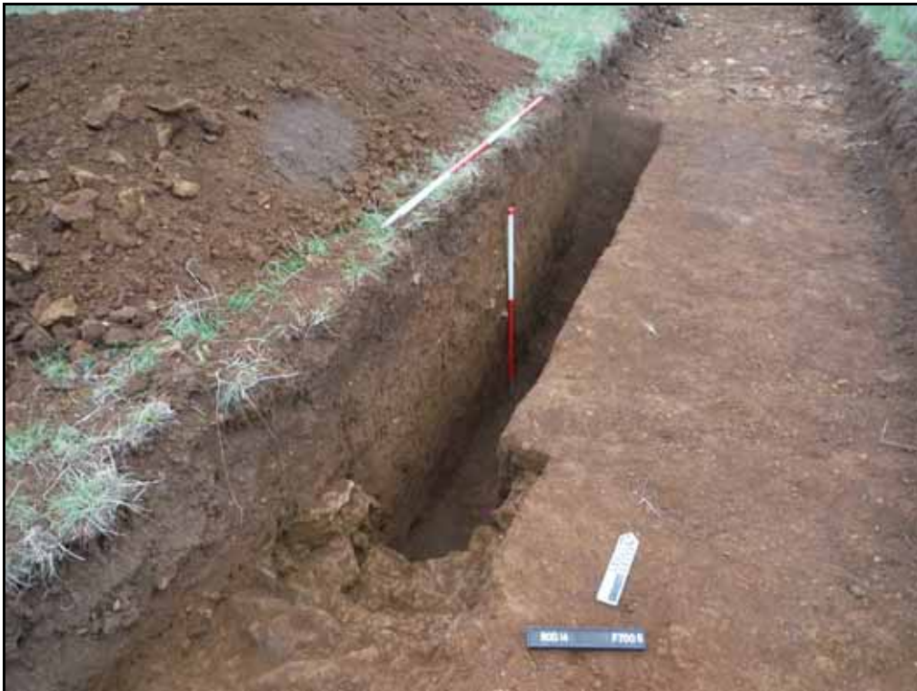
Figure. 115- E-facing oblique section through pit F.7005 (Scale- 2 x 1m)