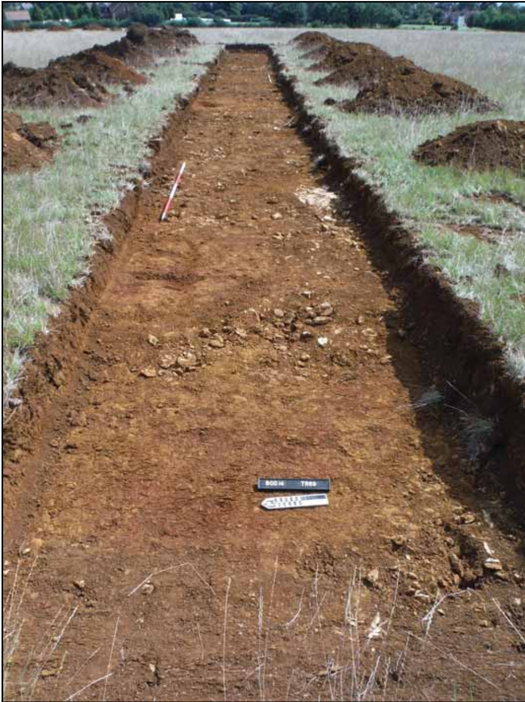
Figure. 146- E-facing view of Trench 69 (Scale- 2 x 2m)