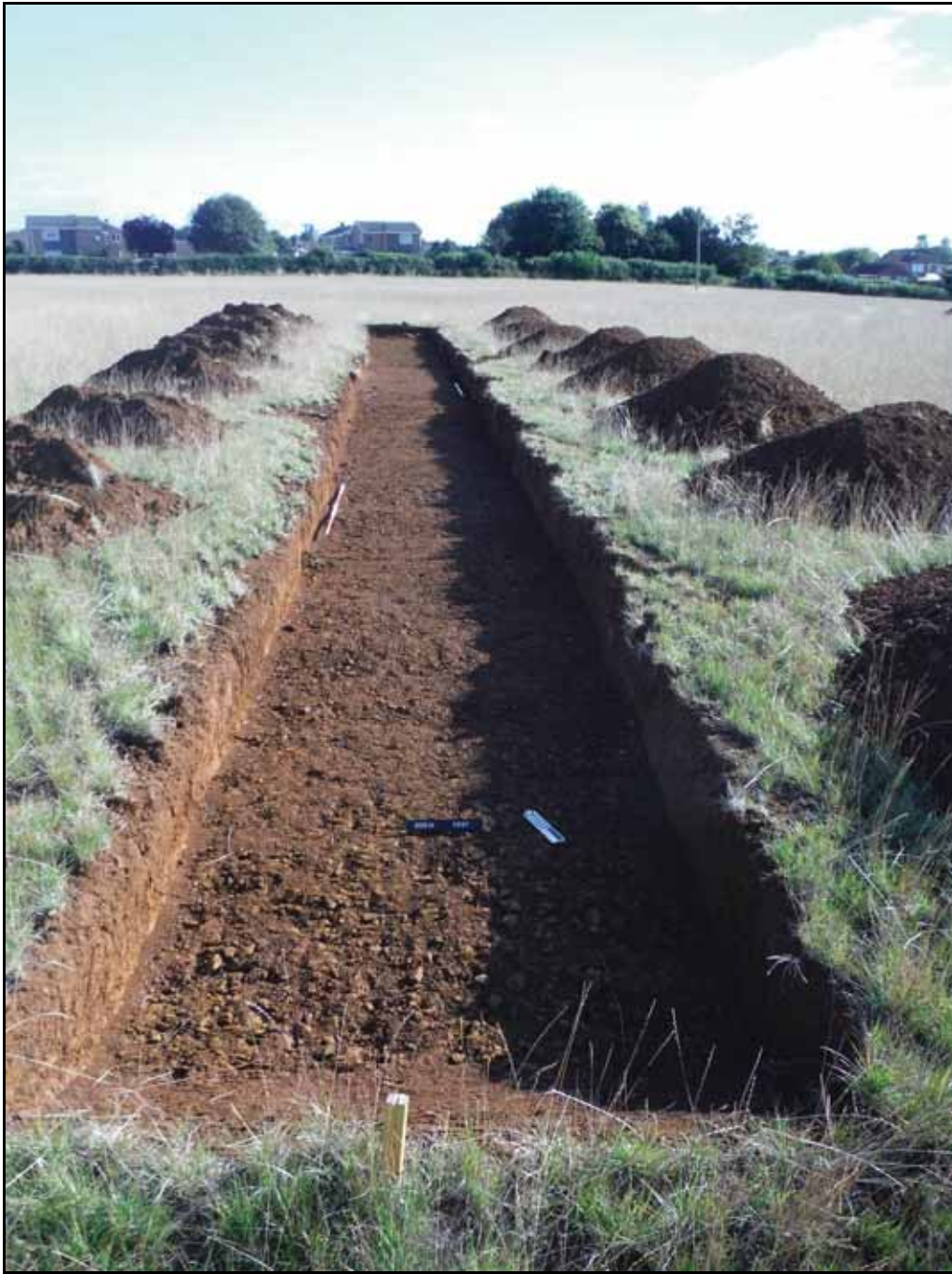
Figure. 46- NNE facing view of Trench 37 (Scale- 2 x 2m)