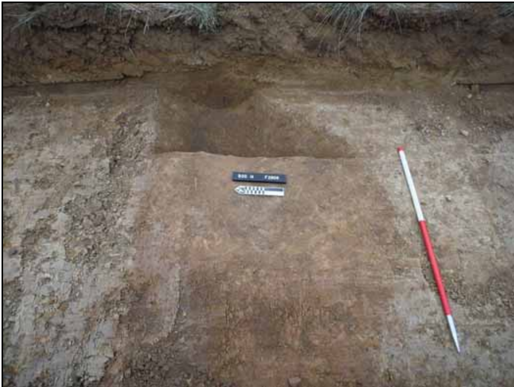
Figure. 33- E-facing view of pit F.2908 (Scale- 1 x 1m)