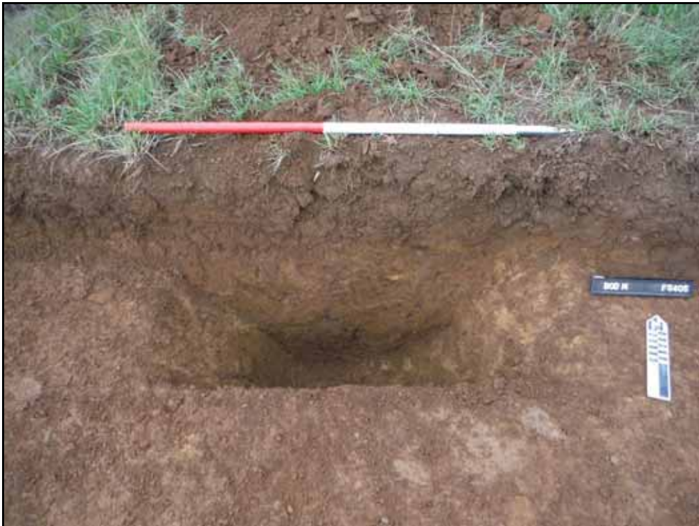
Figure. 70- N- facing view of linear F.5405 (Scale- 1 x 1m)