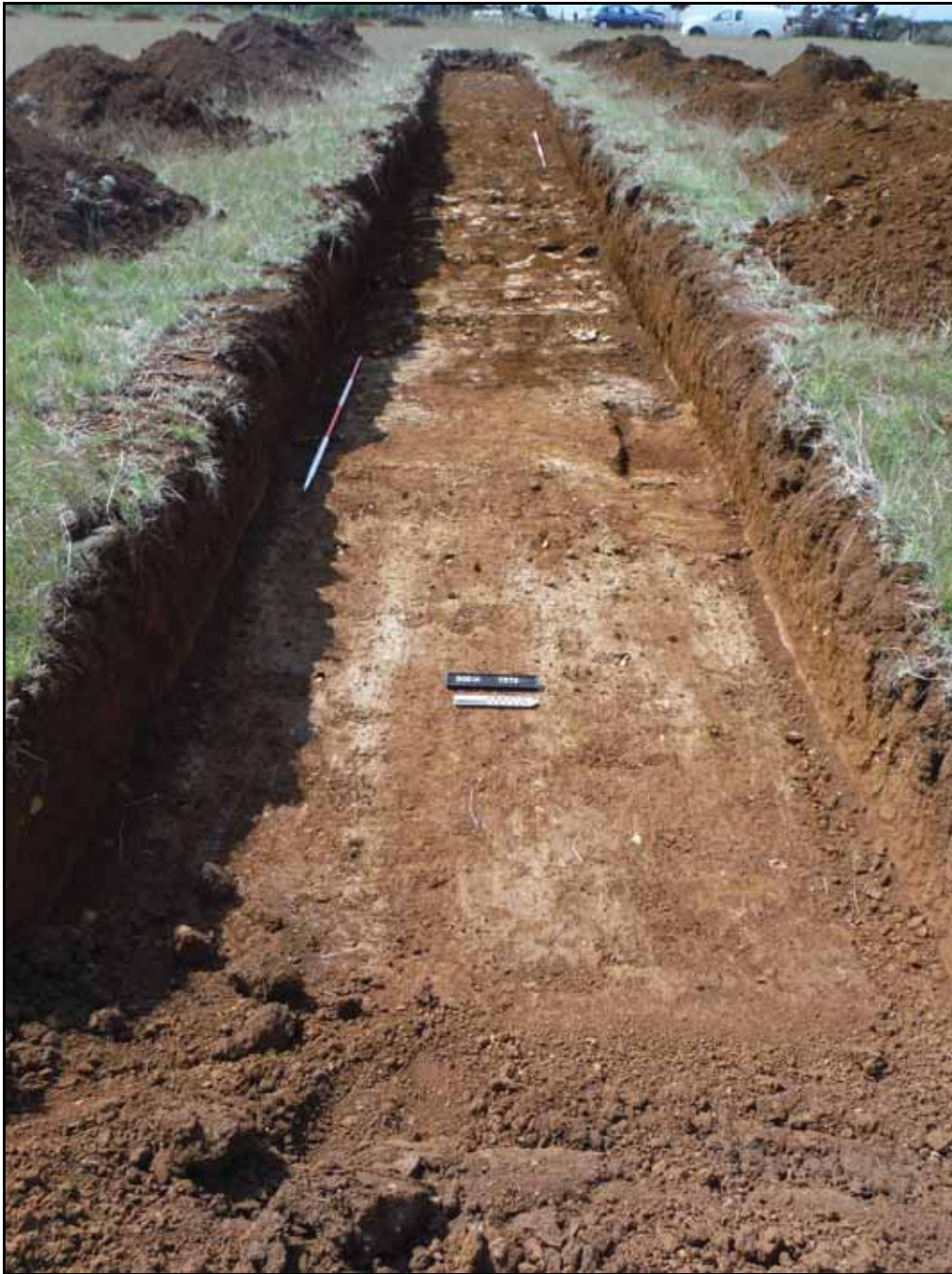
Figure. 108- W-facing view of Trench 67 (Scale- 2 x 2m)