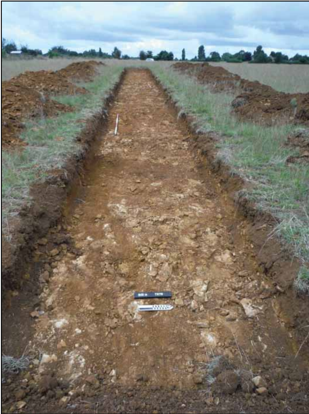
Figure. 117- W-facing view of Trench 75 (Scale- 2 x 2m)