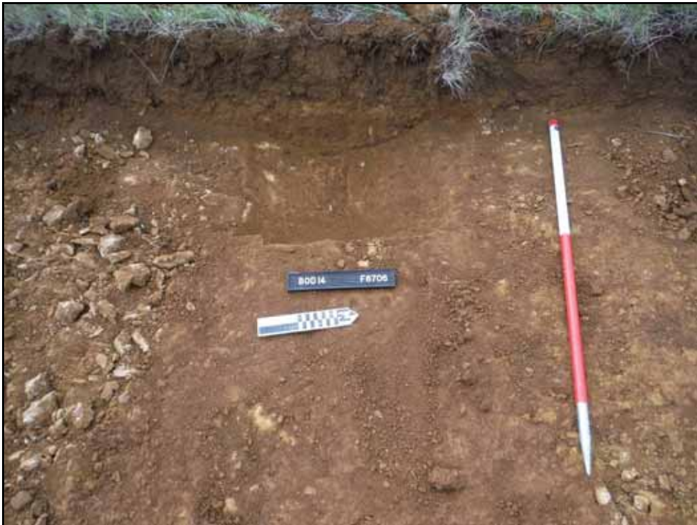
Figure. 107- E-facing section through linear F.6704 (Scale- 1 x 1m)