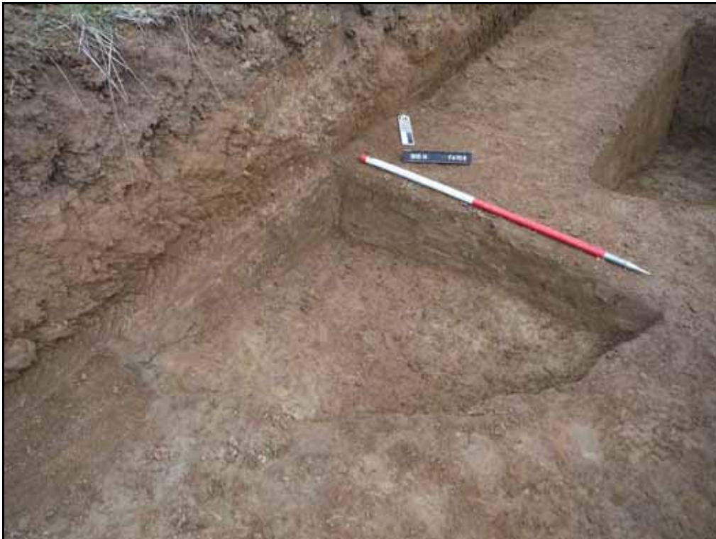
Figure. 54- N-facing view of pit F.4705 (Scale- 1 x 2m)