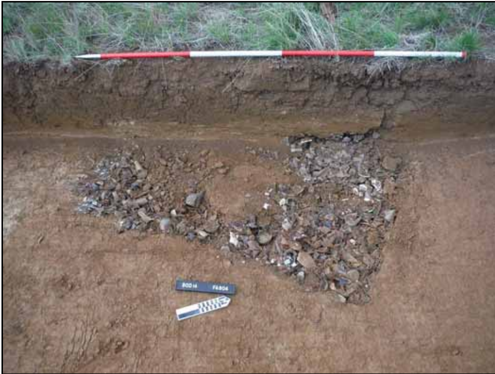
Figure. 59- WNW facing view of pit F.4805 (Scale 1 x 2m)