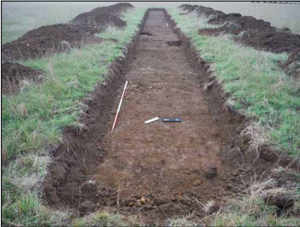
Figure. 67- SW- facing view of Trench 53 (Scale- 2 x 2m)