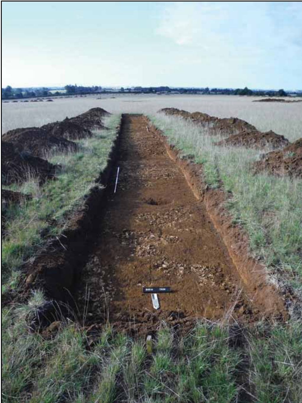
Figure. 51- SSW facing view of Trench 39 (Scale- 2 x 2m)