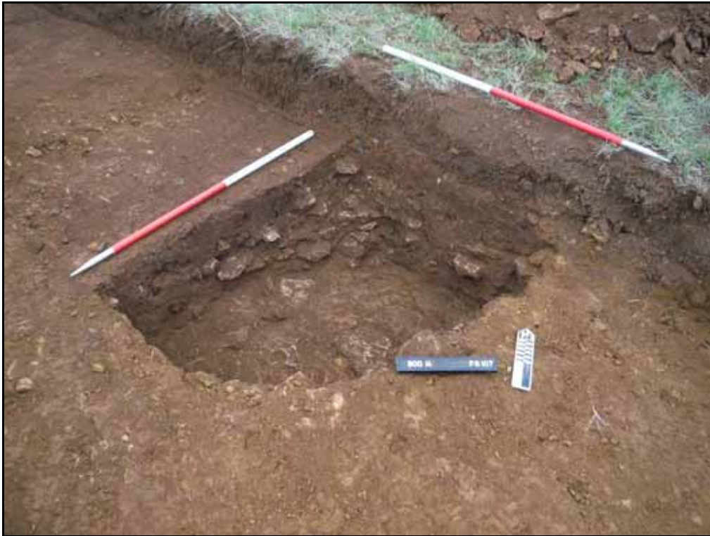
Figure. 93- N-facing view of pit F.6107 (Scale- 2 x 1m)