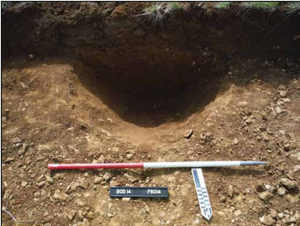
Figure. 89- S-facing view of pit F.6014 (Scale- 1 x 1m)