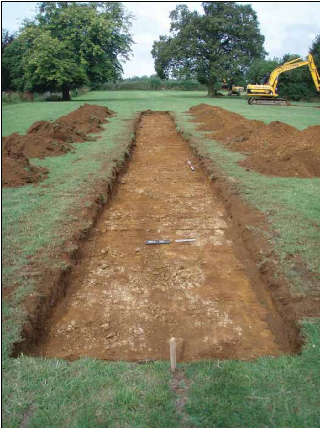
Figure. 119- W-facing view of Trench 2 (Scale- 2 x 2m)