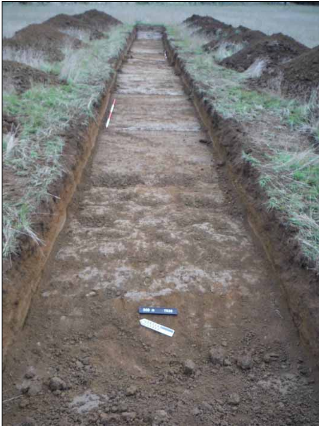
Figure. 131- ENE-facing view of Trench 26 (Scale- 2 x 2m)