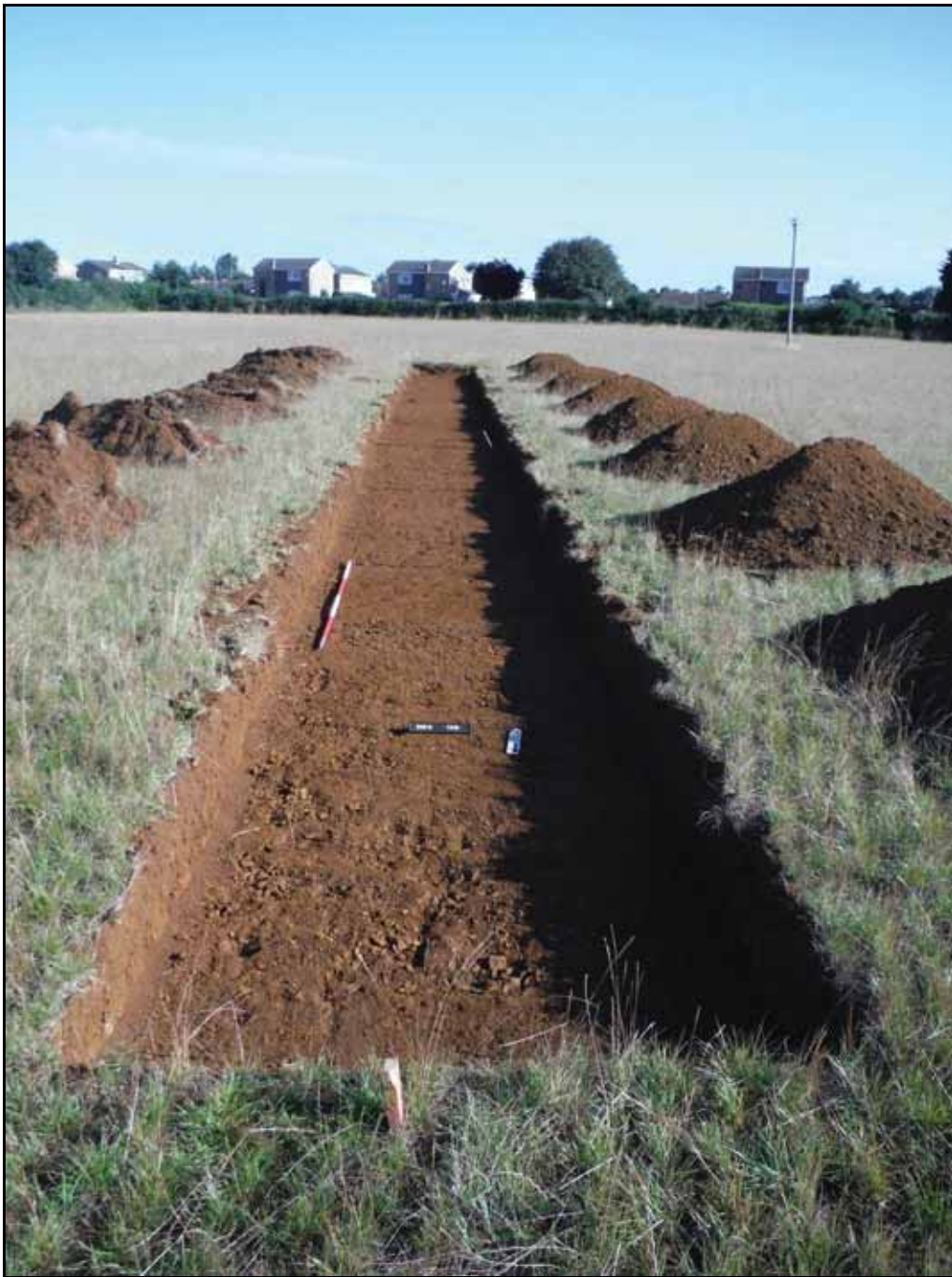
Figure. 49- N-facing view of Trench 38 (Scale- 2 x 2m)