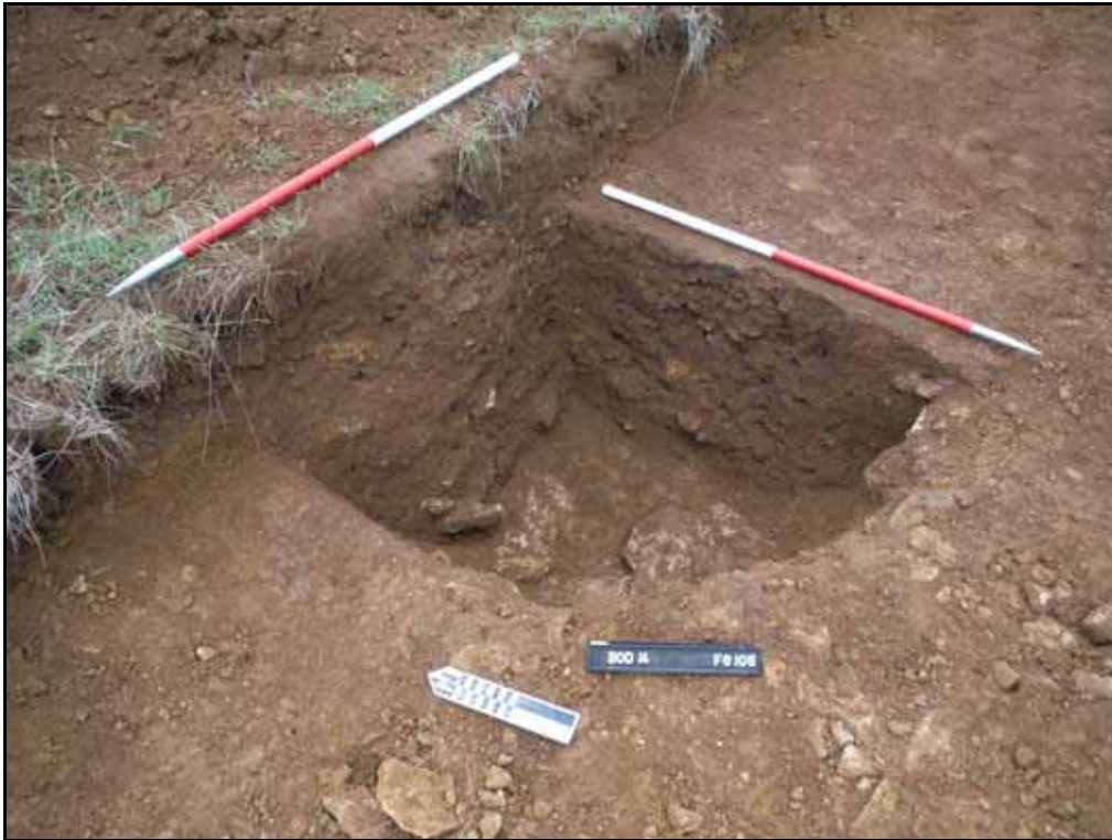
Figure. 91- NE-facing view of pit F.6105 (Scale -2 x 1m)