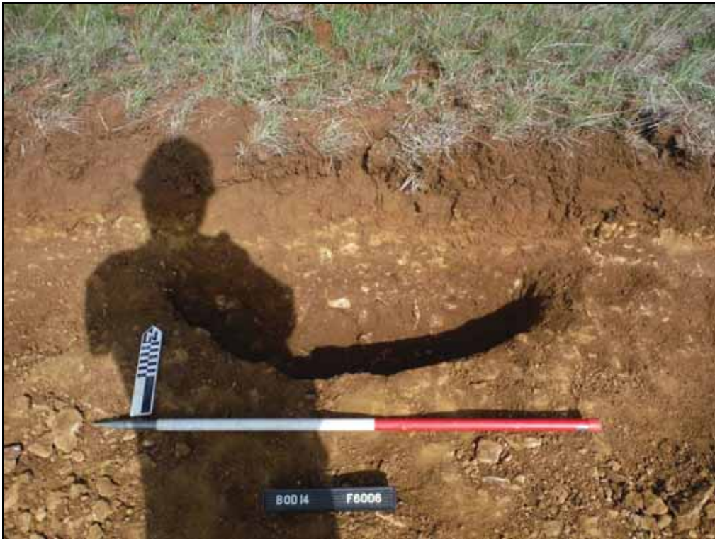
Figure. 87- N-facing view of pit F.6006 (Scale – 1 x 1m)