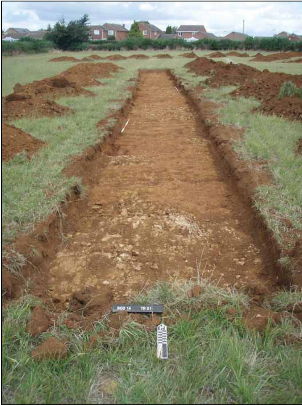
Figure. 129- N-facing view of Trench 21 (Scale- 2 x 2m)