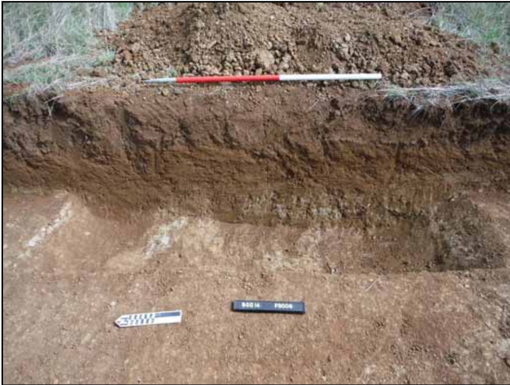
Figure. 41- E-facing view of ditch F.3009 (Scale- 1 x 1m)