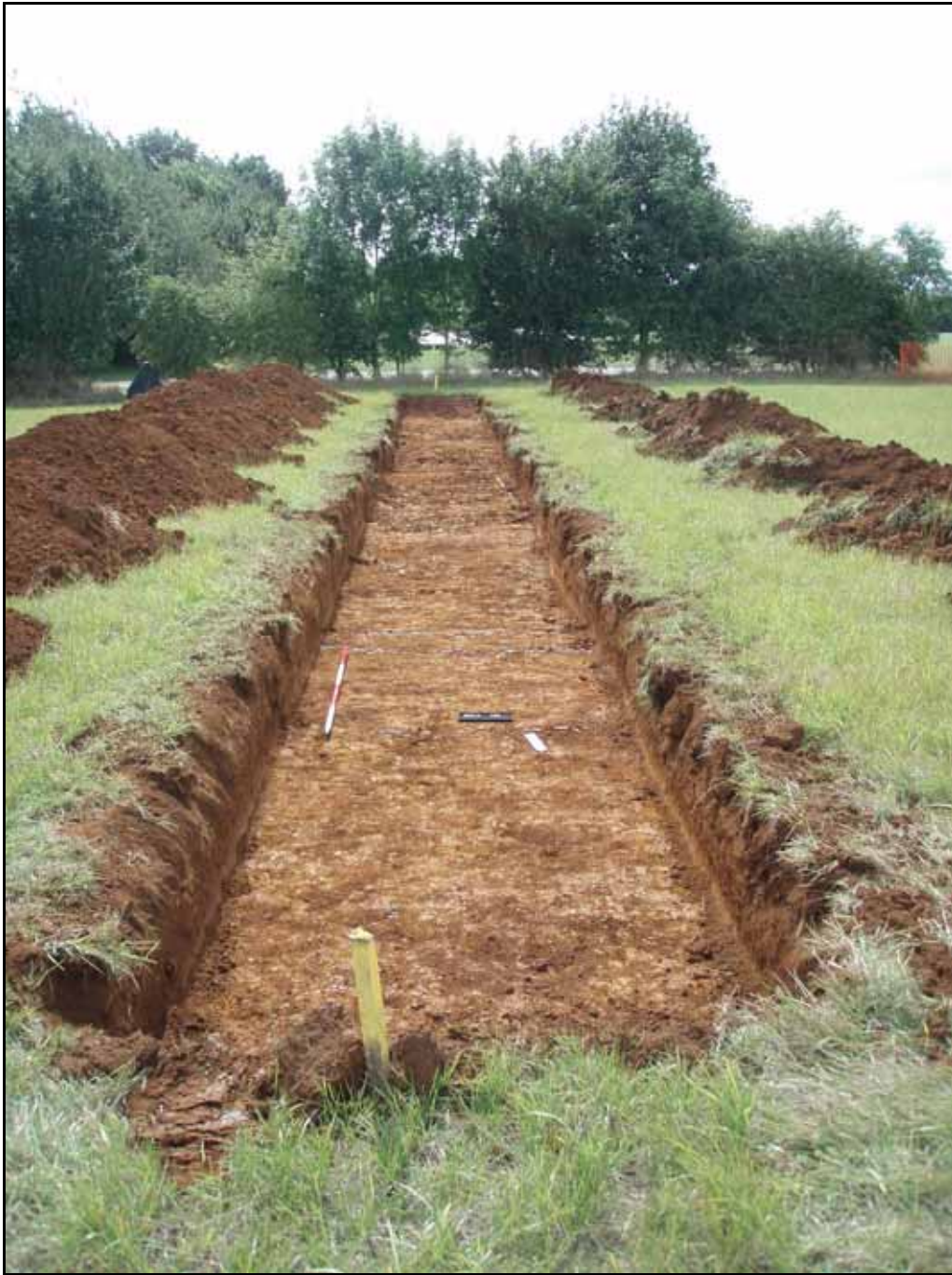
Figure. 123- SW-facing view of Trench 9 (Scale- 2 x 2m)