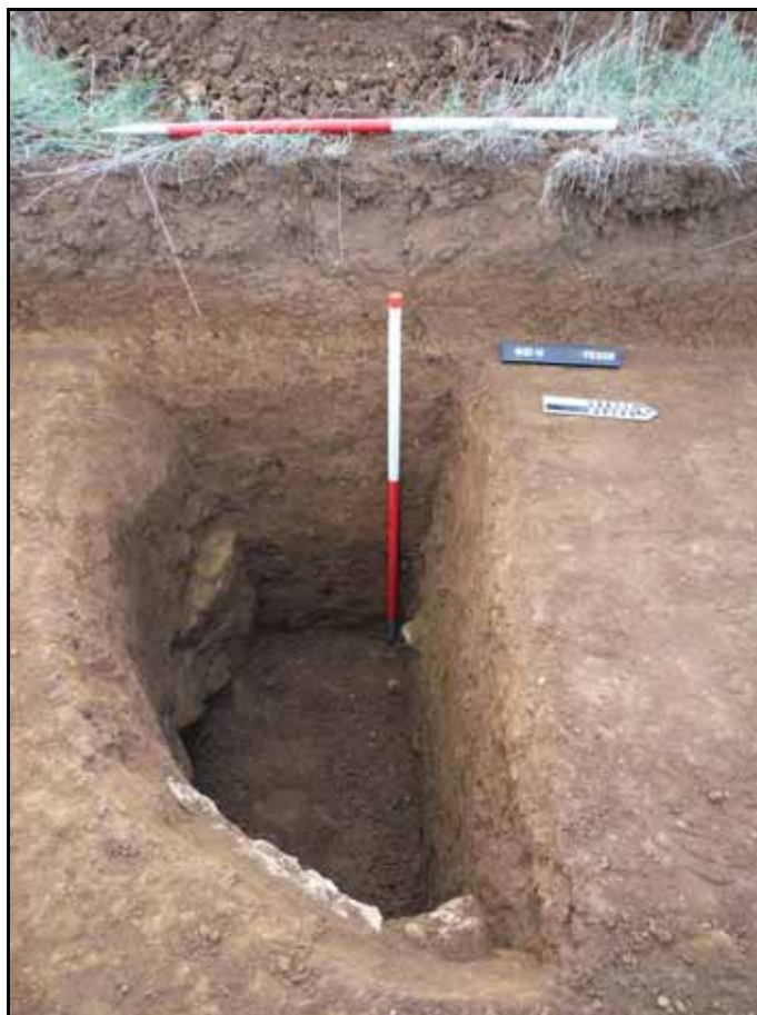
Figure. 66- W-facing view of pit F.5208 (Scale- 2 x 1m)