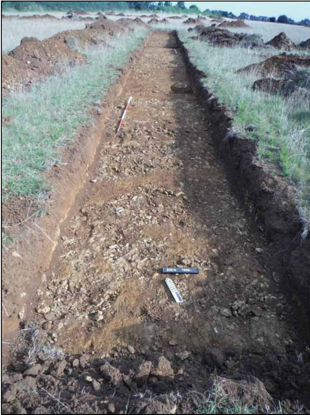
Figure. 82- NNE-facing view of Trench 59 (Scale- 2 x 2m)