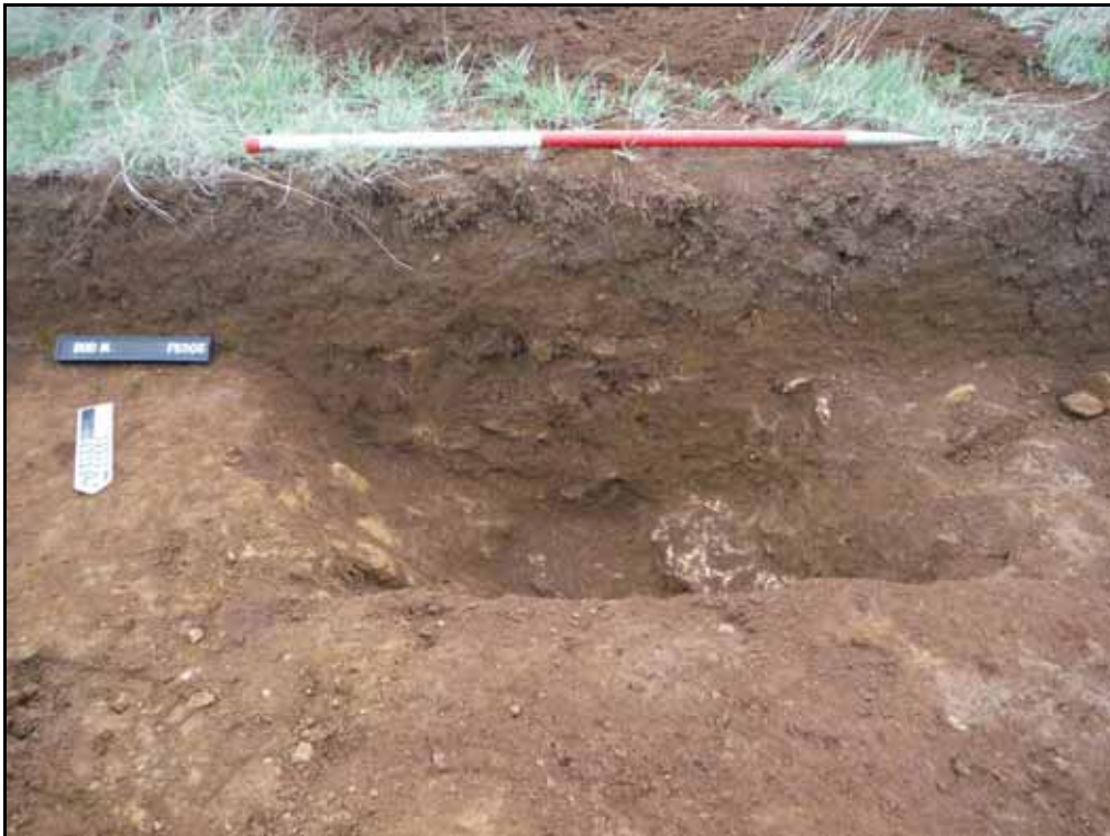
Figure. 68- SSW-facing view of linear F.5305 (Scale – 1 x 1m)