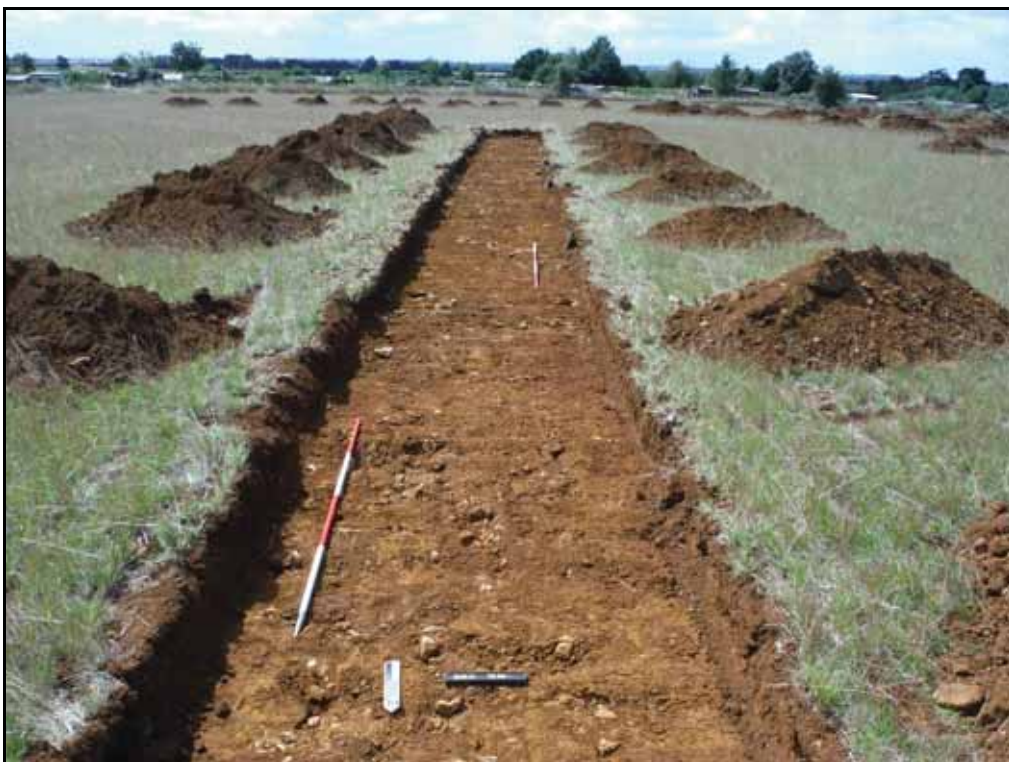
Figure. 148- S-facing view of Trench 63 (Scale- 2 x 2m)