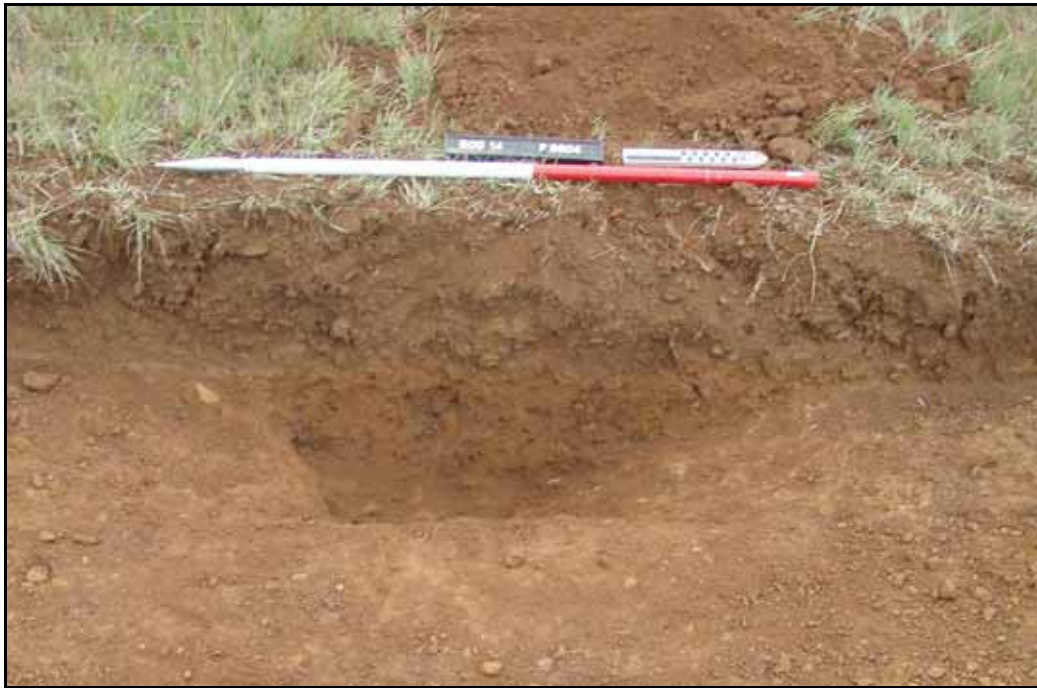
Figure. 50- E-facing view of linear F.3804 (Scale- 1 x 1m)