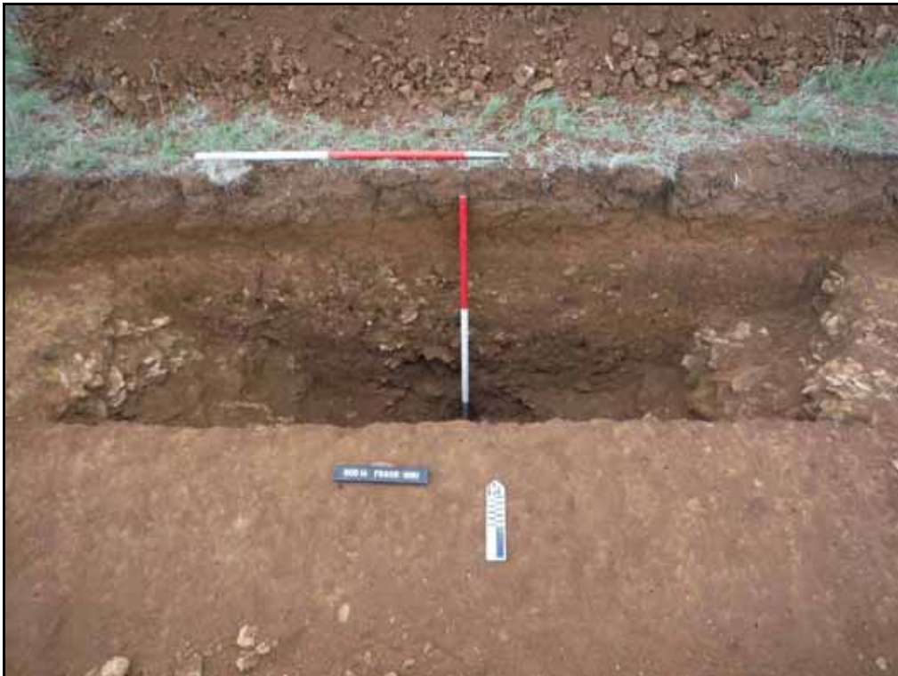
Figure. 113- S-facing section through enclosure ditches F.6808 and F.6814 (Scale- 2 x 1m)