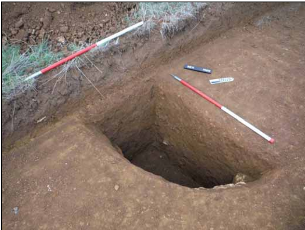
Figure. 64- NW-facing view of pit F. 5408 (Scale- 2 x 1m)