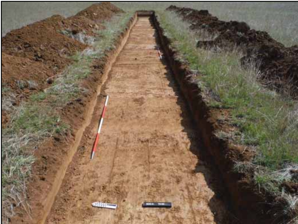
Figure. 144- E-facing view of Trench 56 (Scale- 2 x 2m)