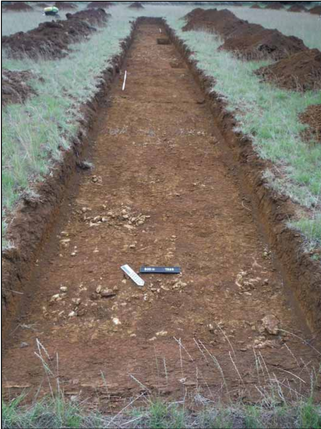
Figure. 102- SE-facing view of Trench 69 (Scale- 2 x 2m)