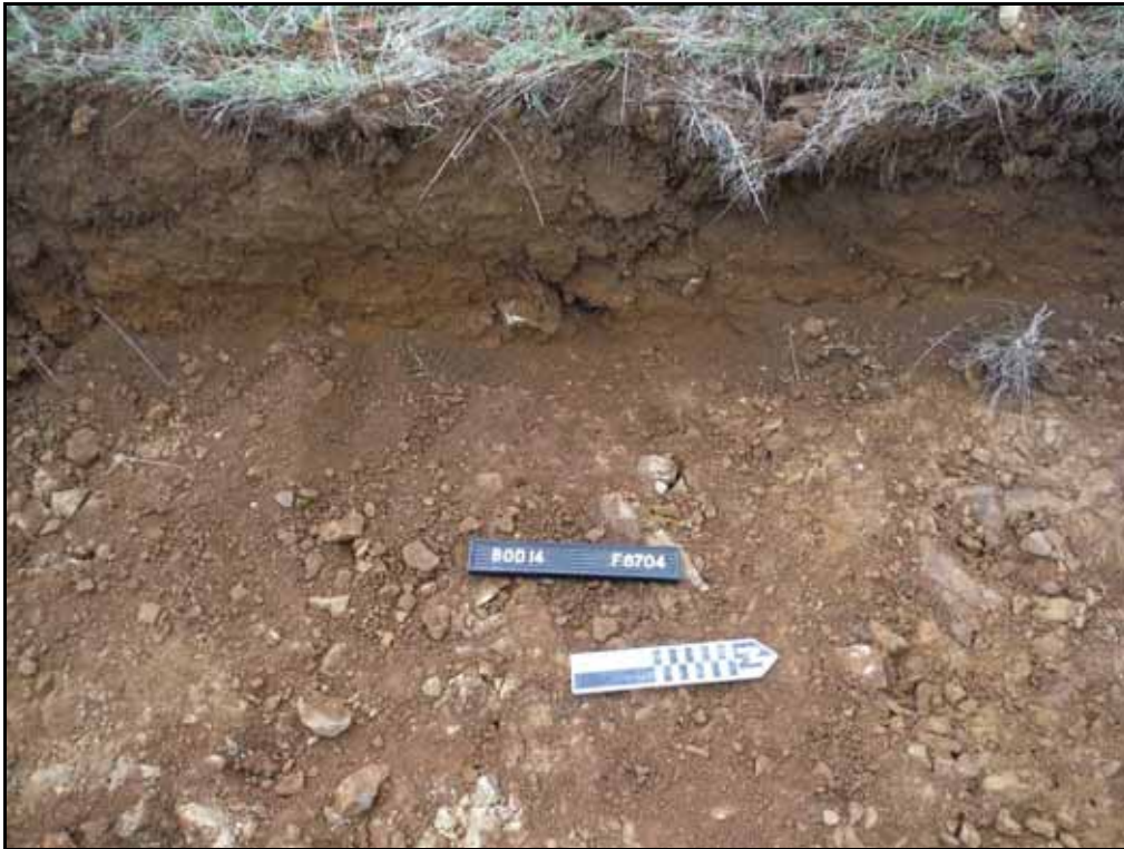
Figure. 109- E-facing section through furrow F.6704 (Scale 1 x 0.2m)