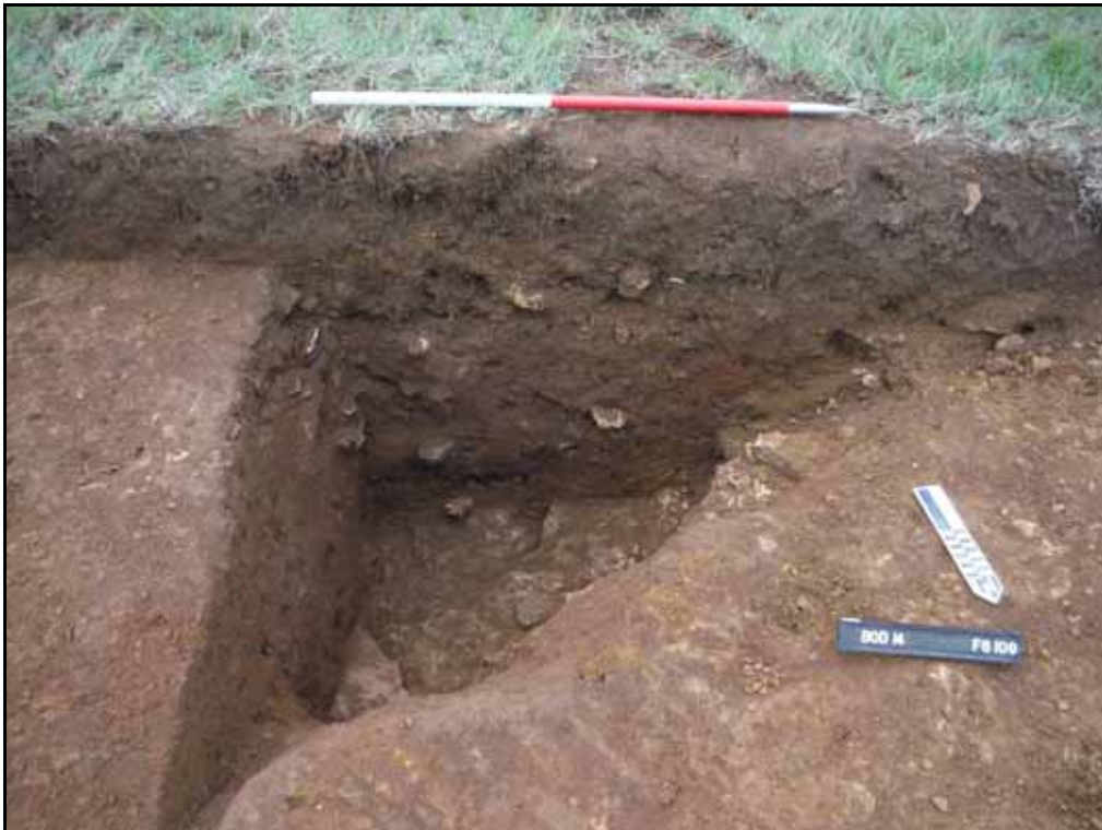
Figure. 96- NNE-facing section through pit F.6109 (Scale- 1 x 1m)