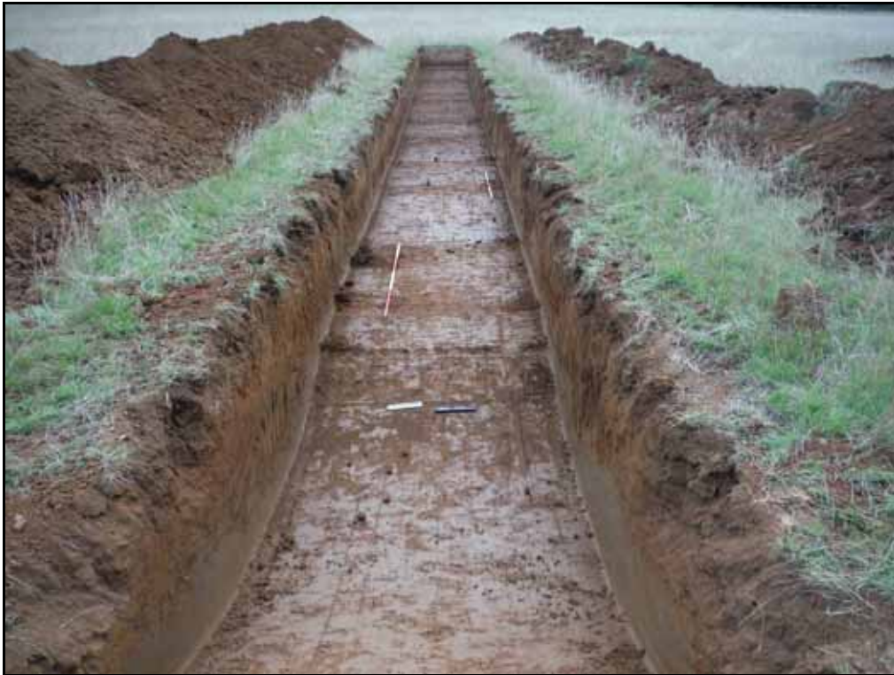
Figure. 147- E-facing view of Trench 72- (Scale- 2 x 2m)