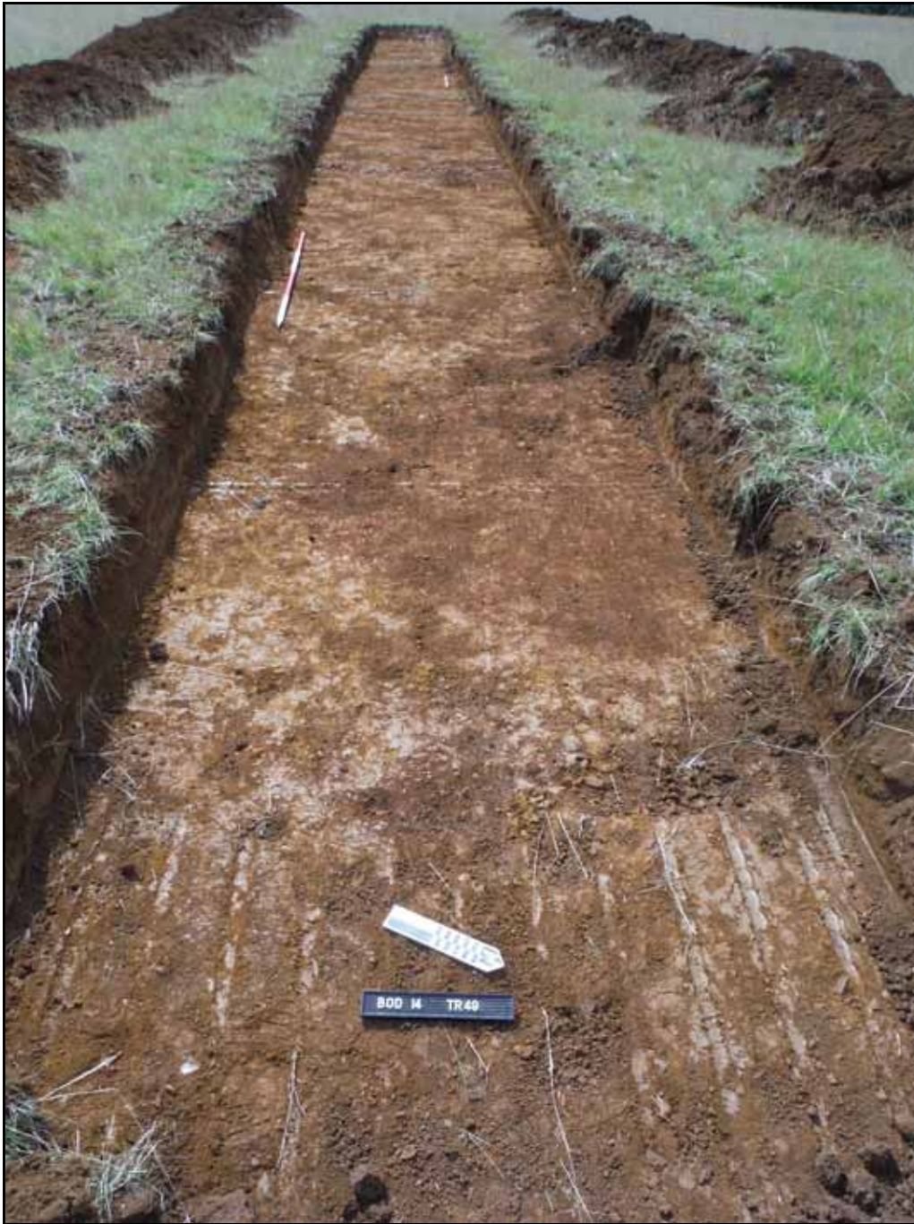
Figure. 142-SW-facing view of Trench 49 (Scale- 2 x 2m)