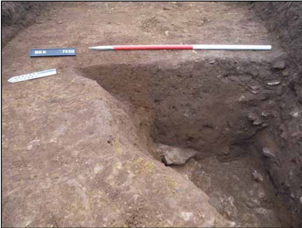
Figure. 97- WNW-facing section through pit F.6109 and linear F.6111. Note truncation of linear F.6111 by pit F.6109 (Scale- 1 x 1m)