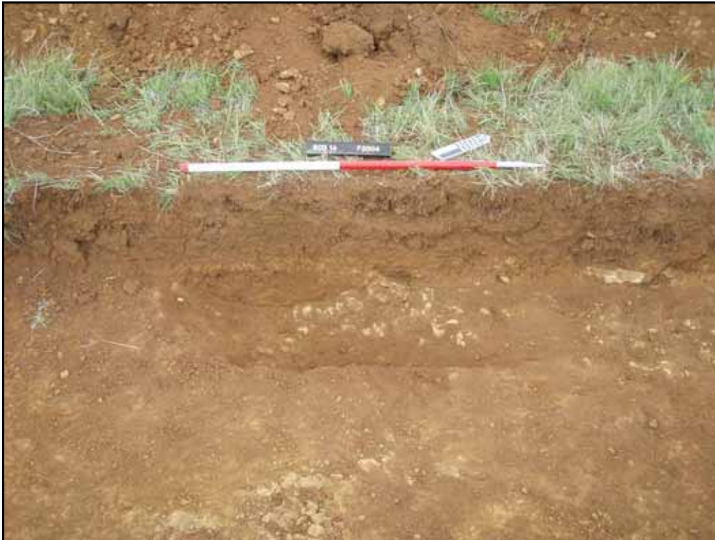
Figure. 29- NW facing view of linear F.2004 (Scale- 1 x 2m)