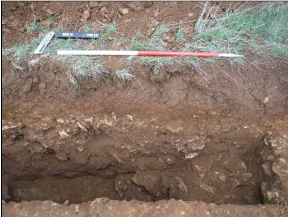
Figure. 80- N facing view of pit F.5808 (Scale- 1 x 1m)