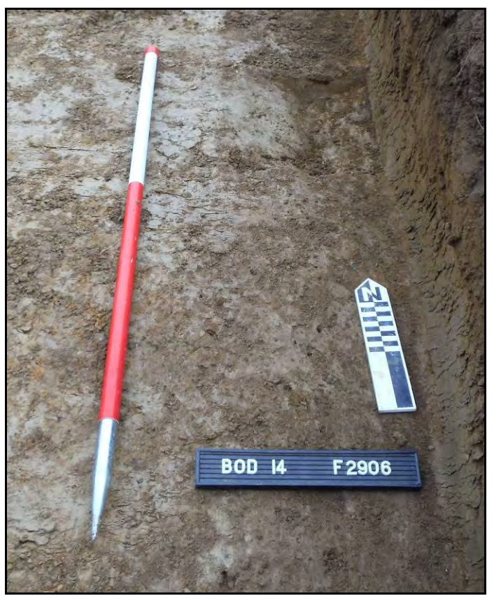
Figure. 36- N-facing view of linear F.2906 (Scale- 1 x 1m)