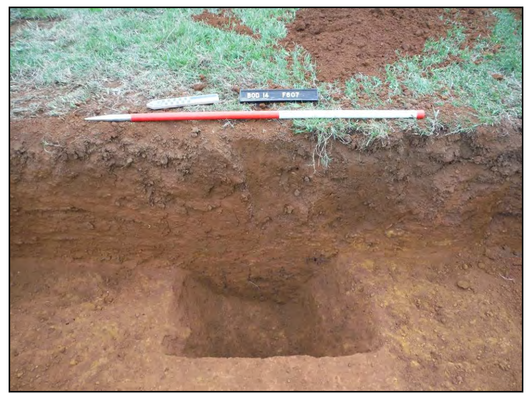
Figure 8- E-facing view of linear F.607 (Scale- 1 x 1m)