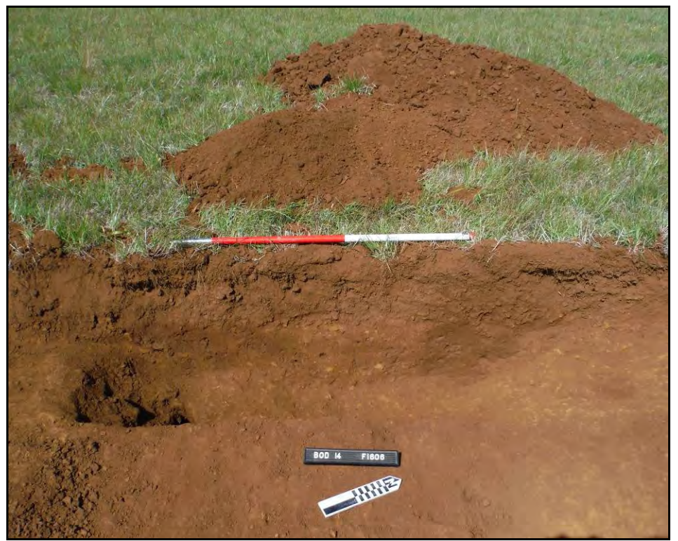
Figure. 20- WNW facing view of F.1606 (Scale-1 x 2m)