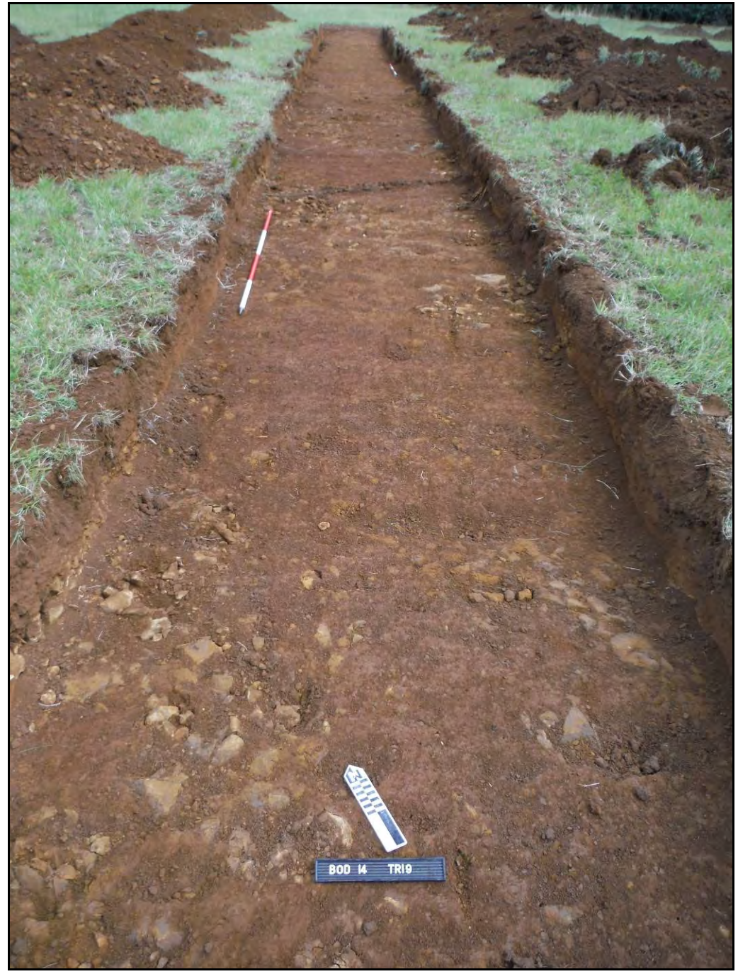
Figure. 25- NNE facing view of Trench 19 (Scale- 2 x 2m)