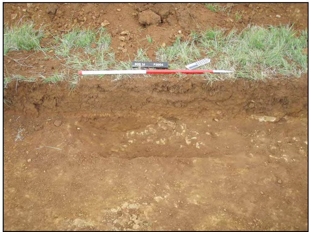
Figure. 29- NW facing view of linear F.2004 (Scale- 1 x 2m)