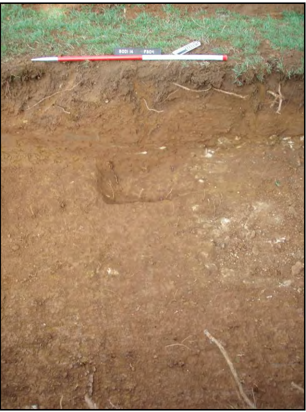
Figure 4- NW facing view of linear F.304 (Scale 1 x 1m)