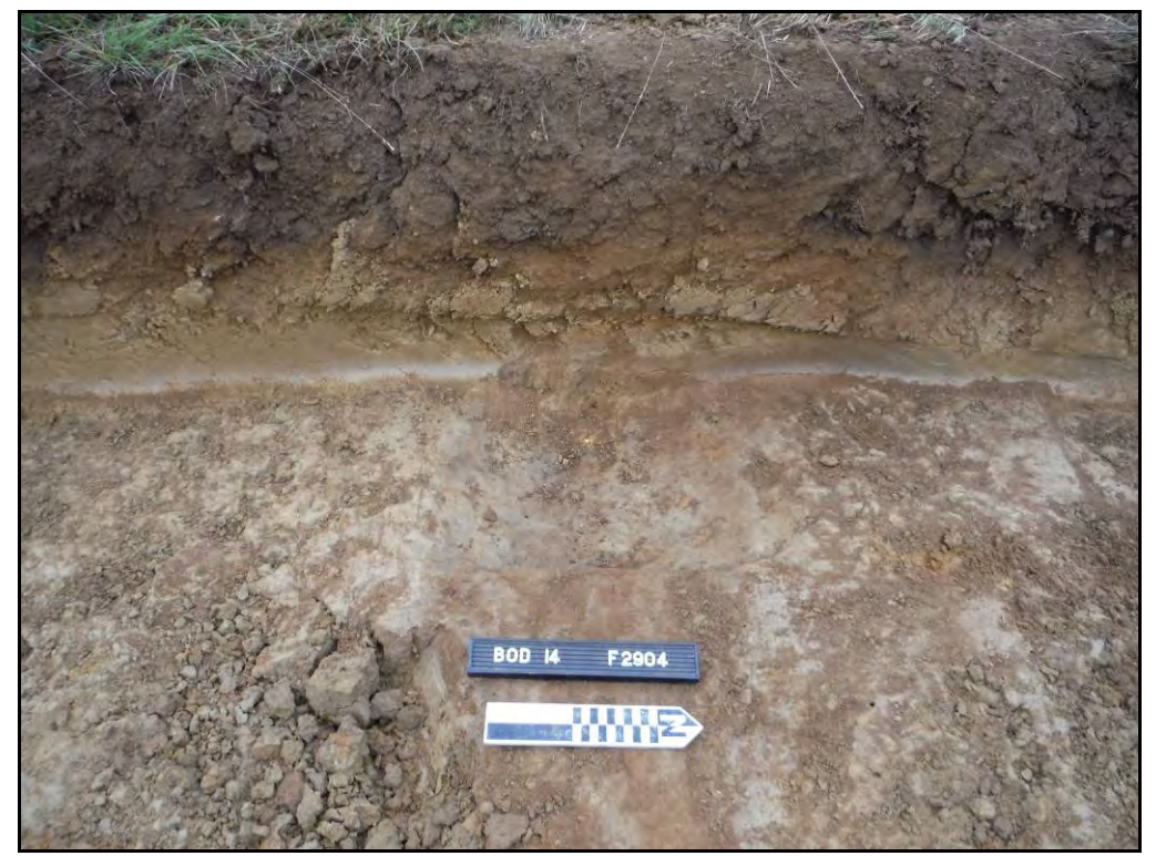
Figure. 35- W-facing view of linear F.2904 (Scale- 1 x 0.2m)