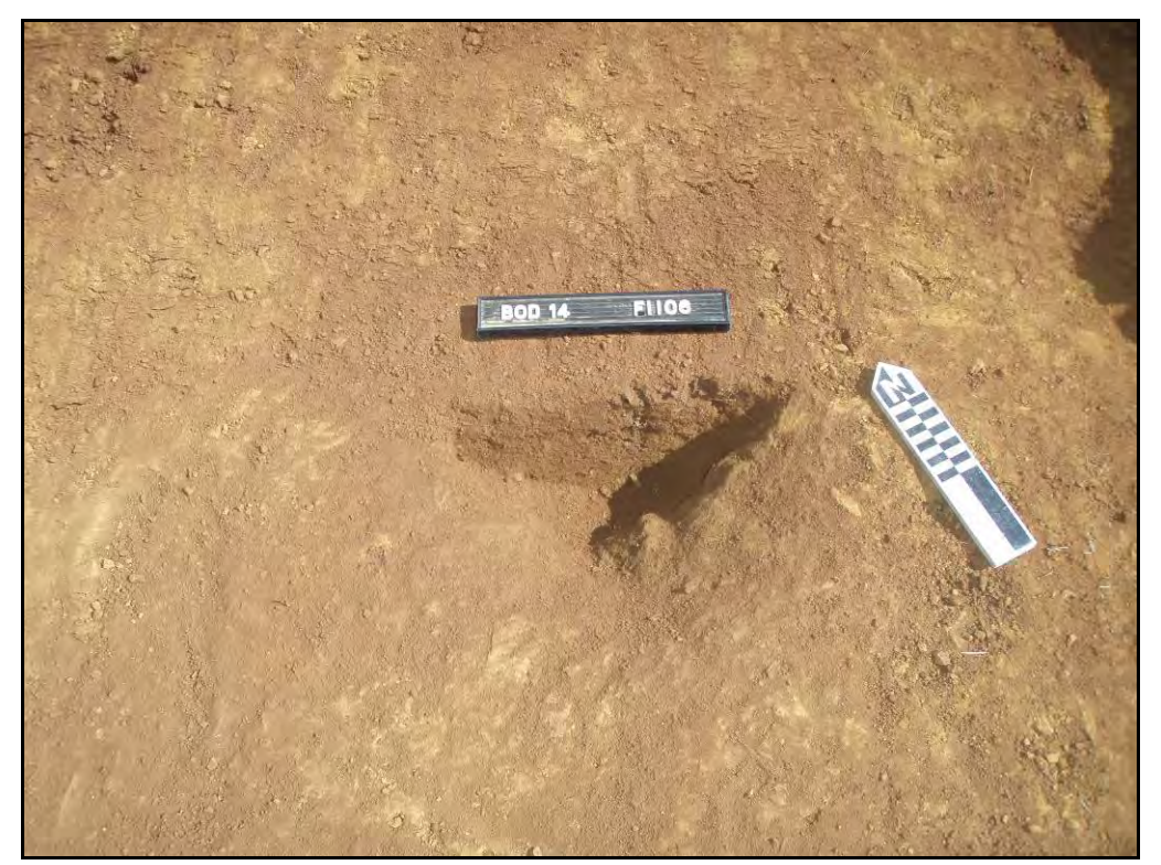
Figure. 14- NNE facing view of pit/posthole F.1106 (Scale- 1 x 0.2m)