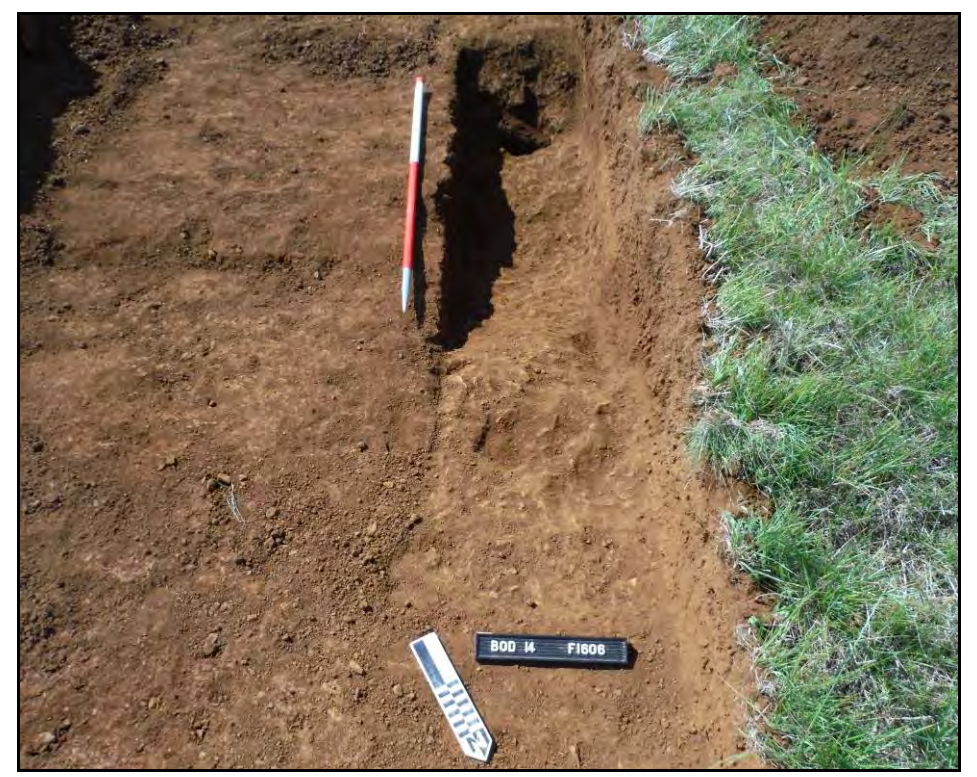
Figure. 21- SSW facing view of linear F.1606. Note truncating posthole F.1609 visible at southern edge of linear F.1606 (Scale- 1 x 1m)