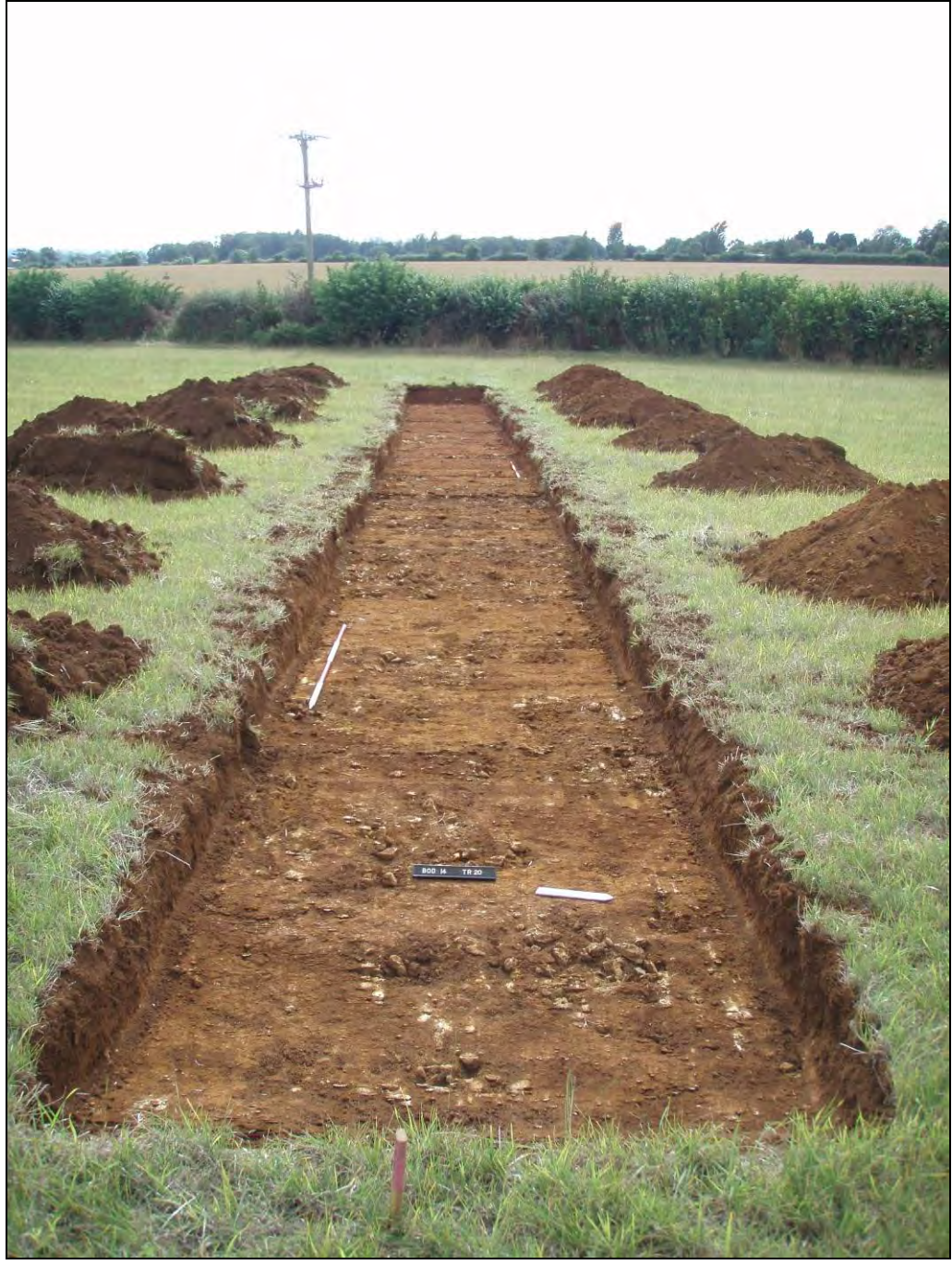
Figure. 28- SW facing view of Trench 20 (Scale- 2 x 2m)