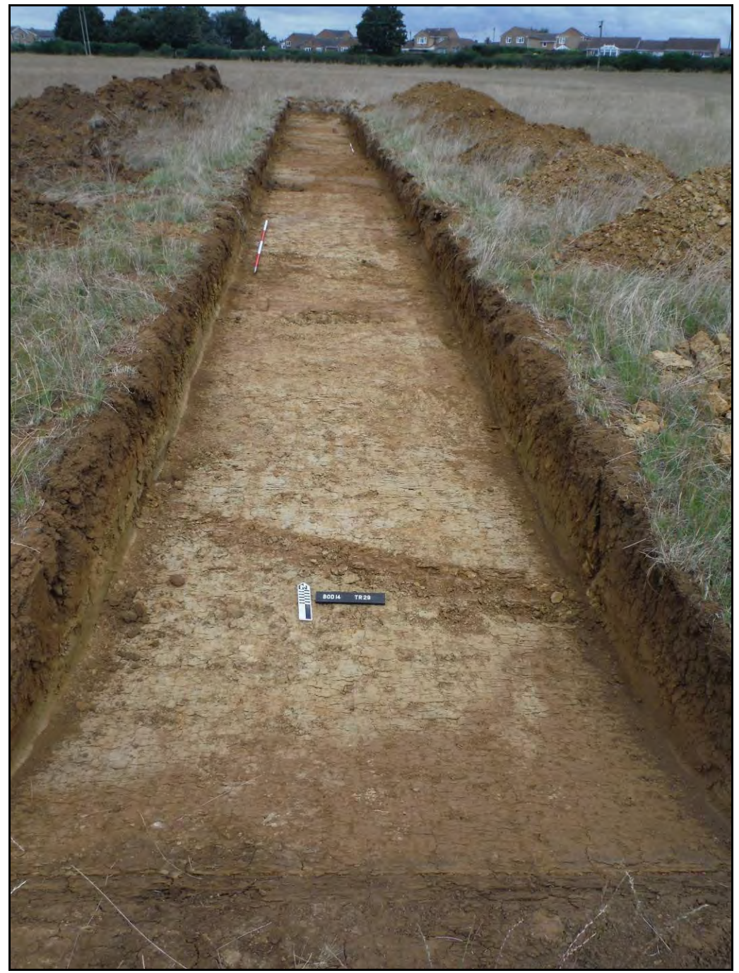
Figure. 31- N facing view of Trench 29 (Scale- 2 x 2m)