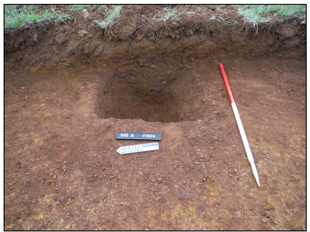
Figure. 24- E-facing view of F.1804 (Scale-1x1m)