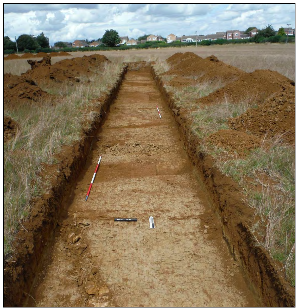
Figure. 38- N-facing view of Trench 30 (Scale- 2 x 2m)