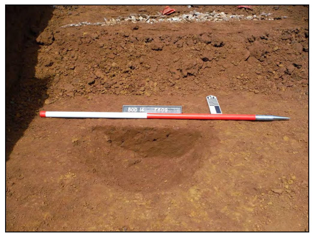
Figure 9- N-facing view of pit/linear terminus F.609. Note modern land drain in the background (Scale- 1 x 1m)