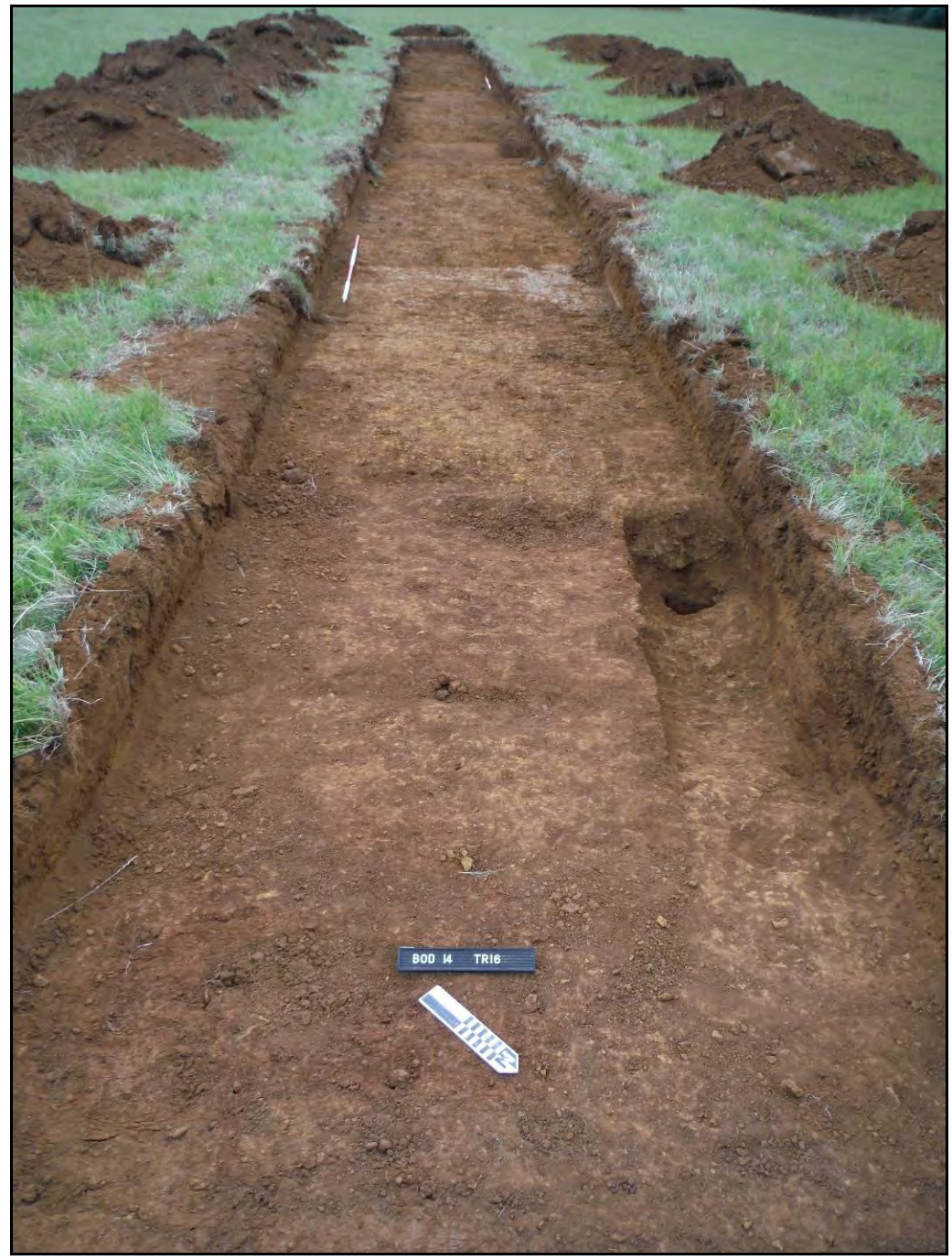
Figure. 19- SW-facing view of Trench 16 (Scale- 2 x 2m)