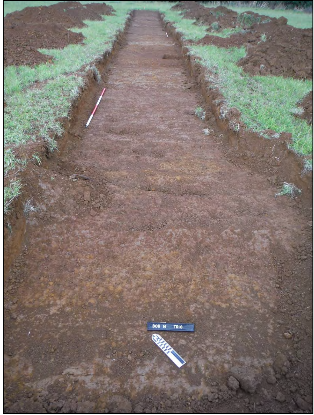
Figure. 23- NE facing view of Trench 18 (Scale 2 x 2m)