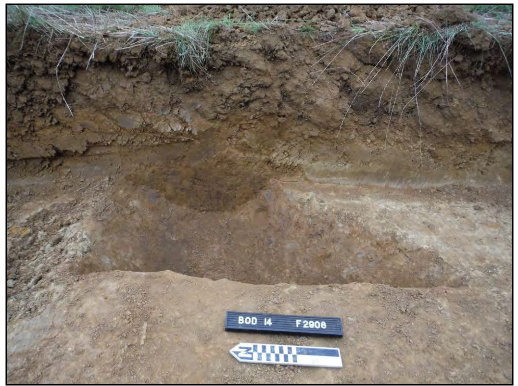
Figure. 34- E-facing view of section F.2908 (Scale- 1 x 0.2m)