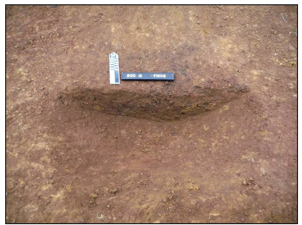
Figure. 18- N-facing view of pit F.1308 (Scale- 1 x 0.2m)