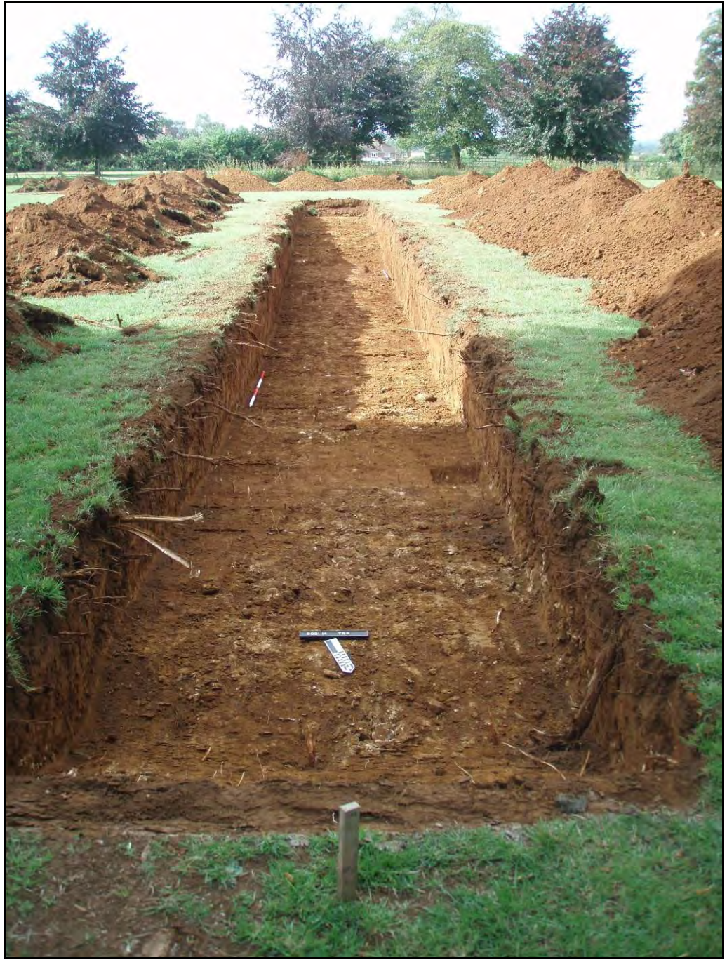
Figure. 3- SSW facing view of Trench 3 (Scale- 2 x 2m)