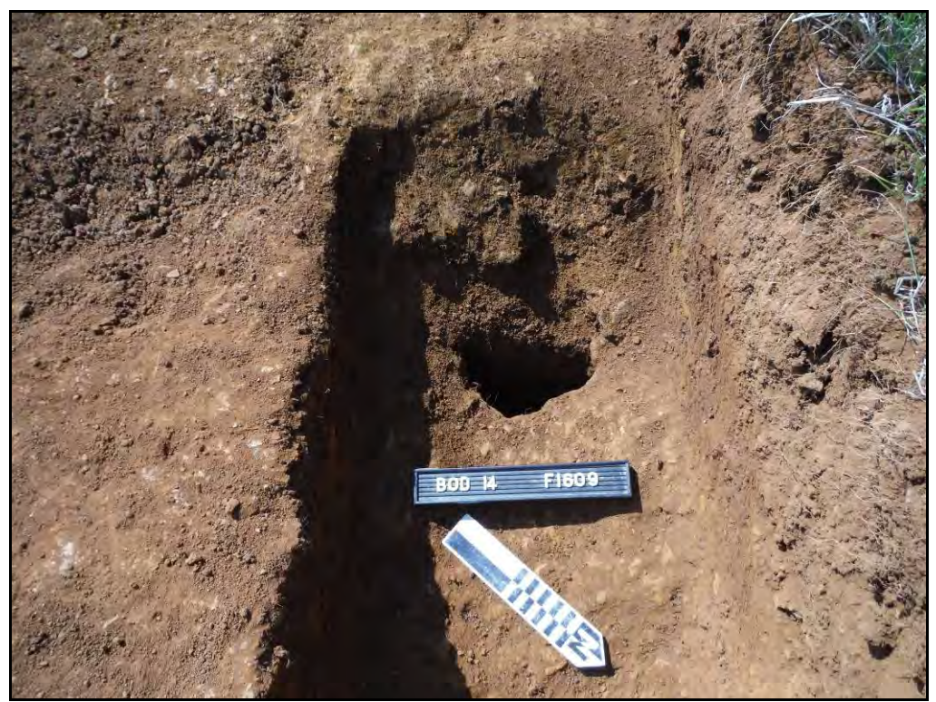
Figure. 22- SW facing view of posthole F.1609