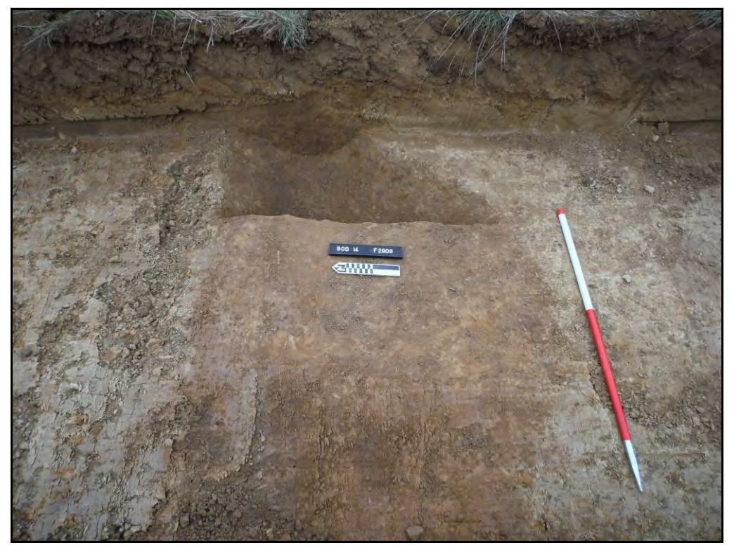
Figure. 33- E-facing view of pit F.2908 (Scale- 1 x 1m)