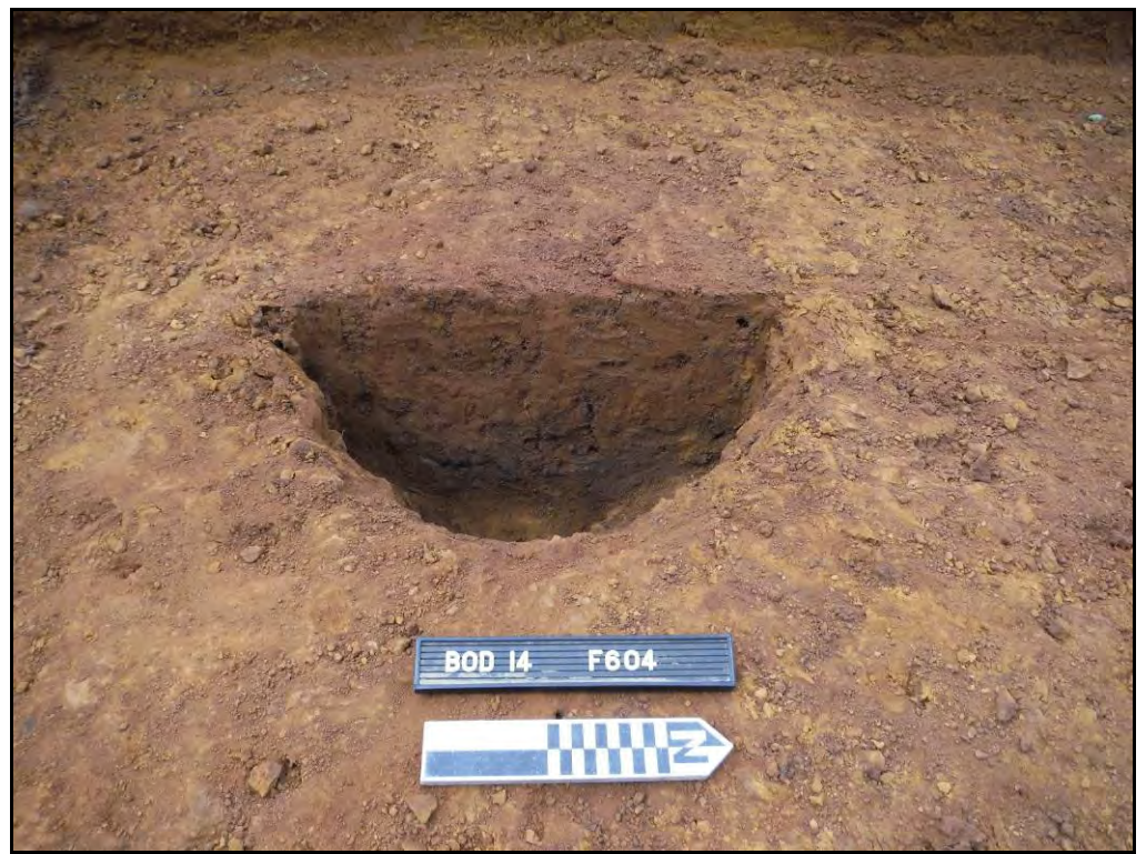
Figure 7- W-facing view of pit F.604 (Scale- 1 x 0.2m)