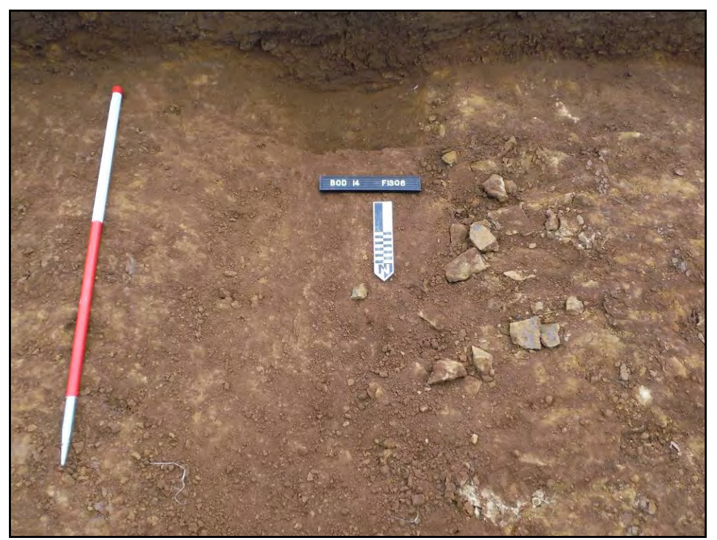
Figure. 17- S-facing view of linear F.1306 (Scale- 1 x 1m)