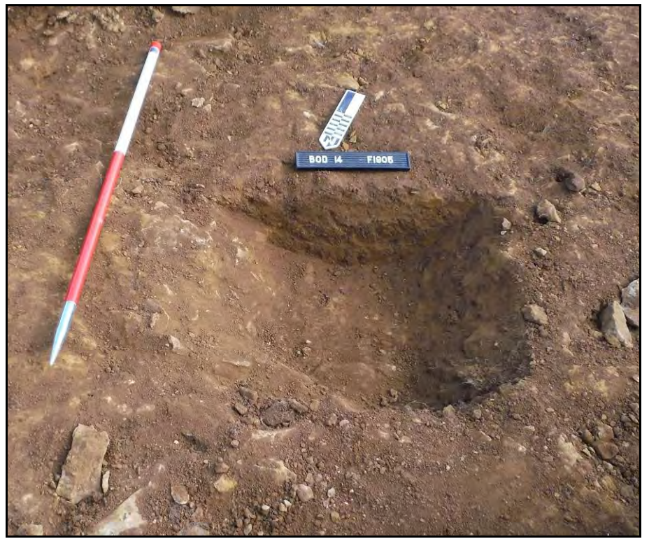
Figure. 26- SSE facing view of linear F.1905 (Scale – 1 x 1m)