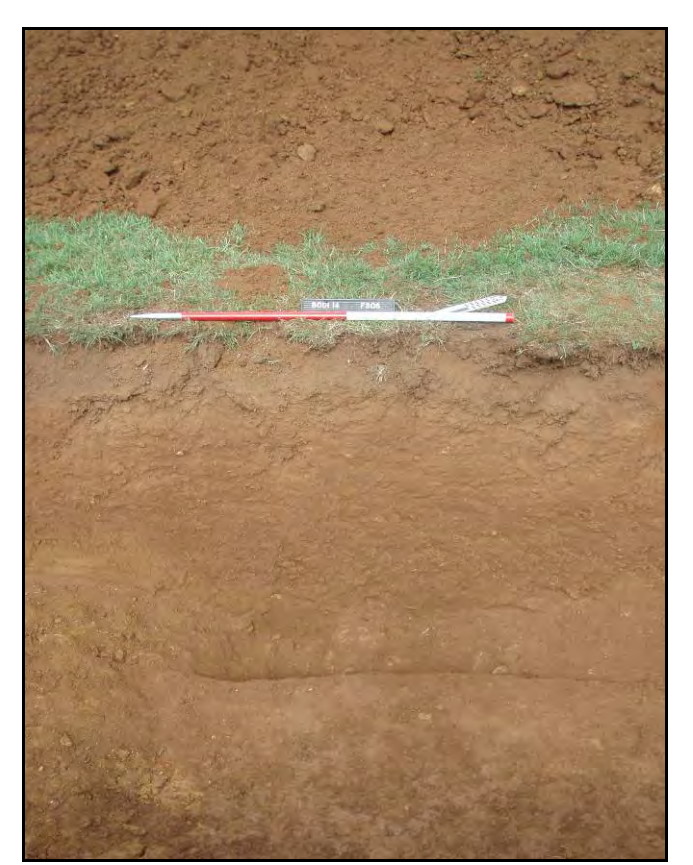
Figure 5- NW facing view of linear F.306 (Scale- 1 x 1m)