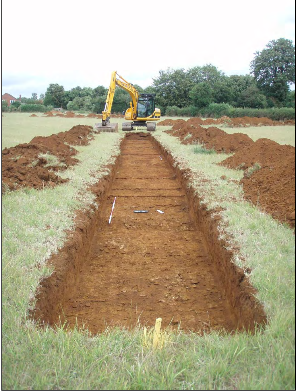
Figure. 12- NE facing view of Trench 11 (Scale- 2 x 2m)