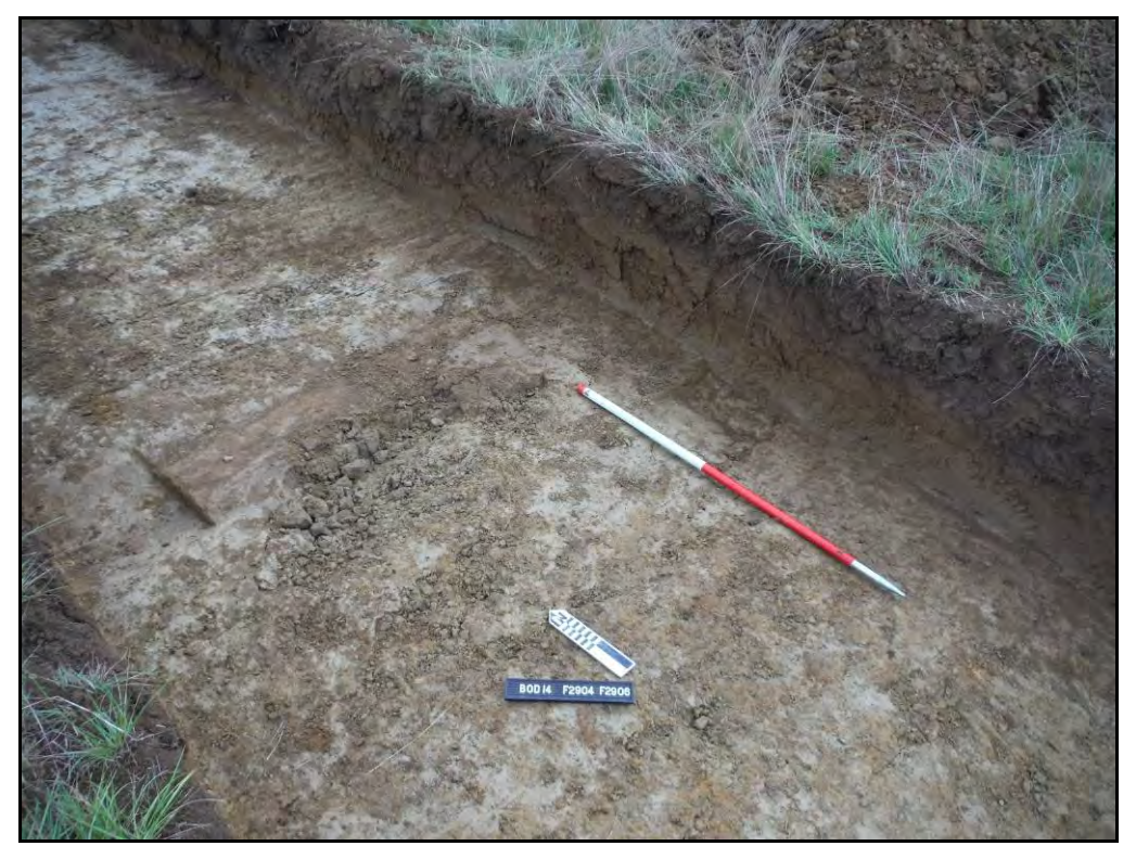
Figure. 37- NE-facing view of linears F.2906 and F.2904 (Scale- 1 x 1m)