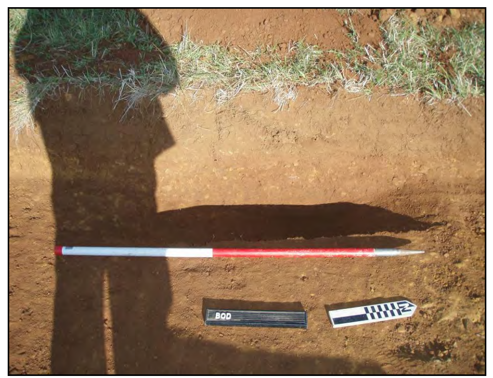
Figure. 27- W-facing view of linear F.1908 (Scale- 1 x 1m)