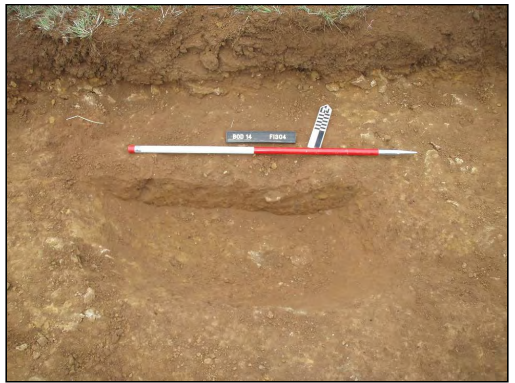
Figure. 16- NNW facing view of linear terminus F.1304 (Scale- 1 x 1m)