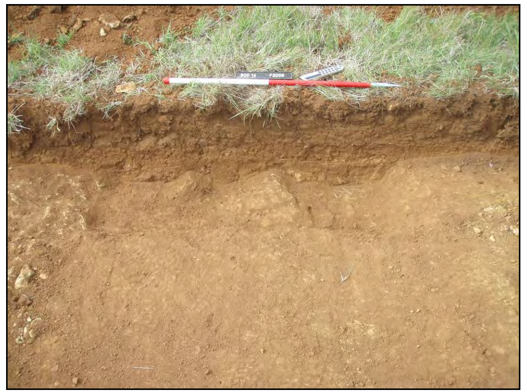
Figure. 30- NW facing view of linear F.2006 (Scale- 1 x 2m)