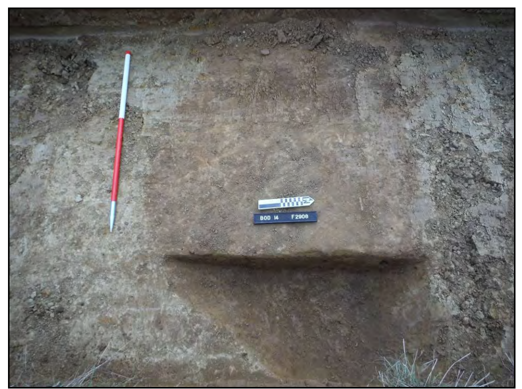
Figure. 32- W-facing view of pit F.2908 (Scale-1 x 1m)