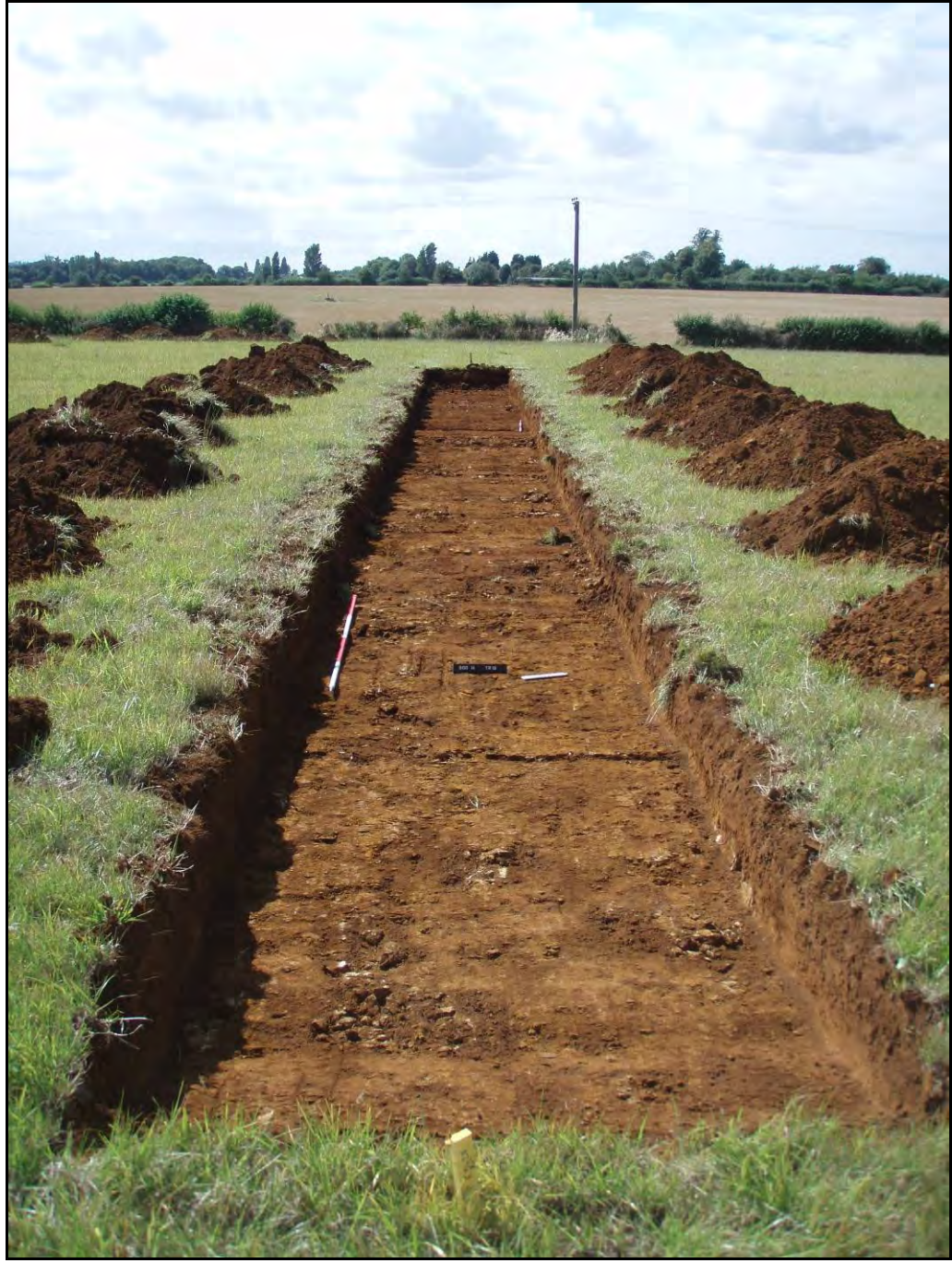
Figure. 15- WSW facing view of Trench 13 (Scale- 2 x 2m)