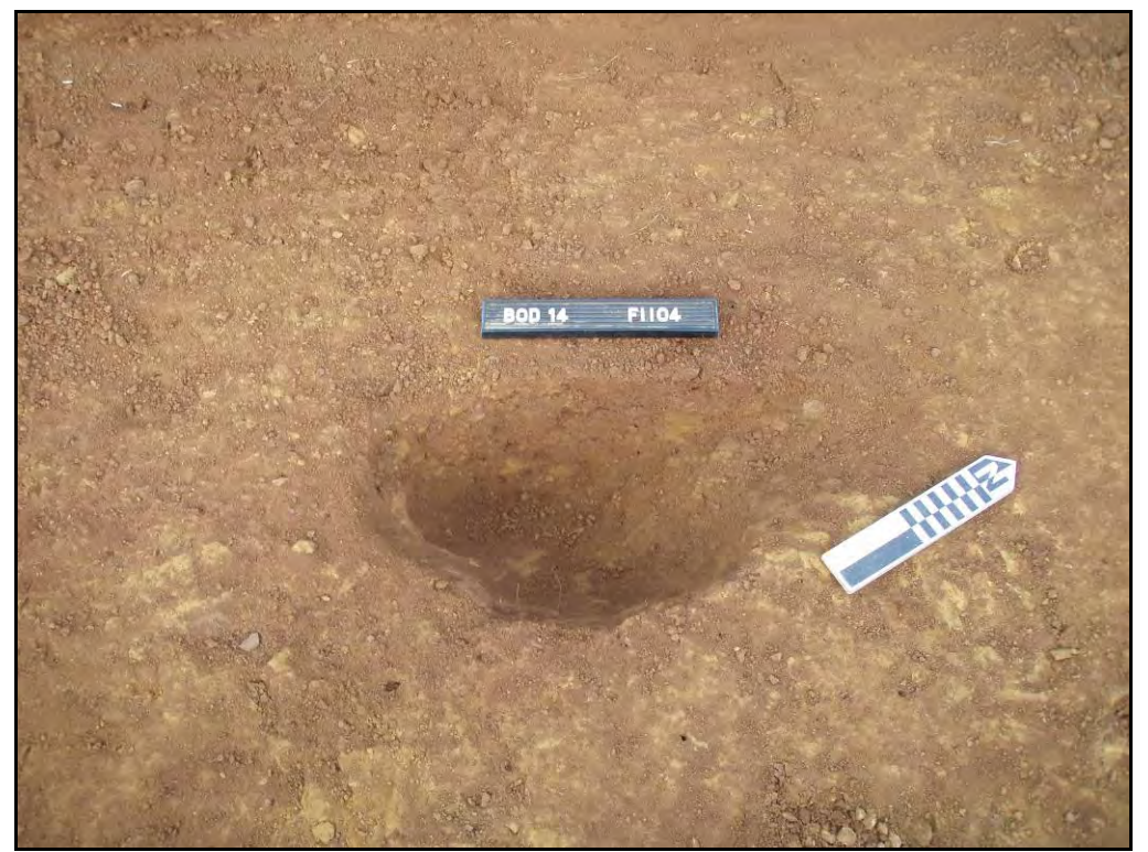
Figure. 13- NW facing view of pit/posthole F1104 (Scale- 1 x 0.2m)