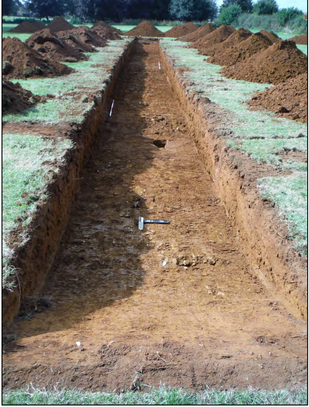
Figure. 10 – S-facing view of Trench 8 (Scale- 2 x 2m)