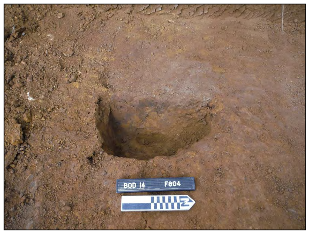
Figure. 11- W-facing view of pit F.804 (Scale- 1 x 0.2m)