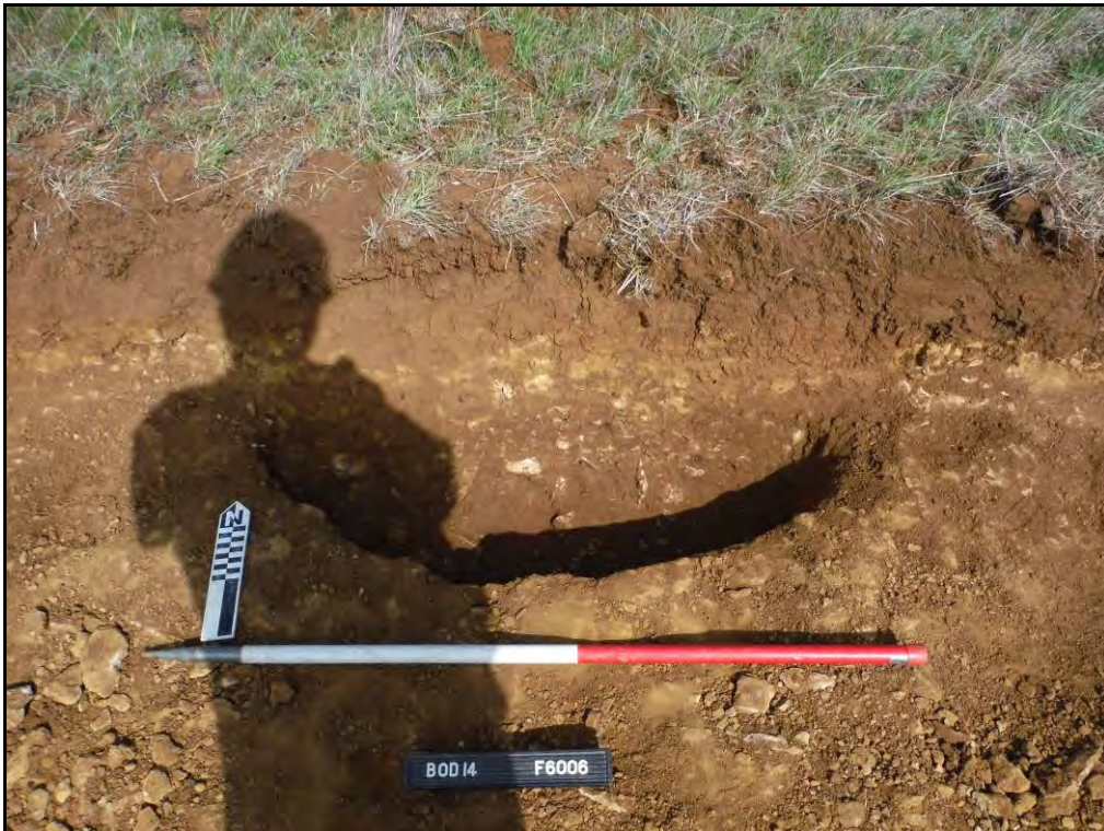
Figure. 87- N-facing view of pit F.6006 (Scale – 1 x 1m)