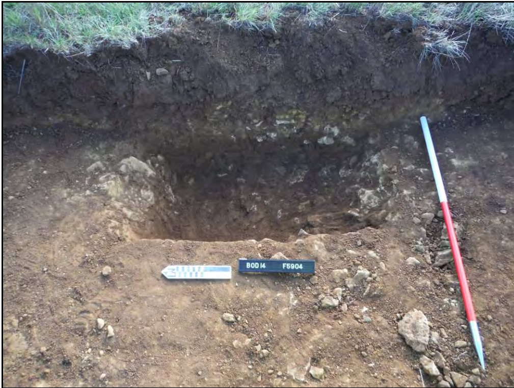
Figure. 83- E-facing view of linear F.5904 (Scale- 1 x 1m)