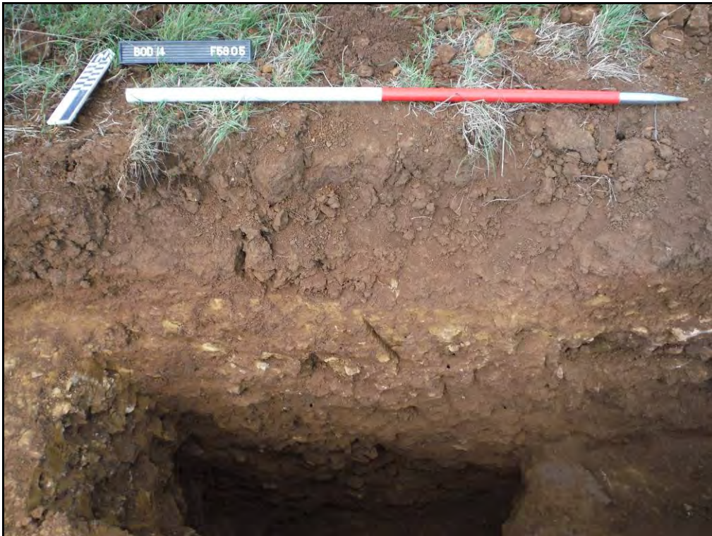
Figure. 79- N-facing view of pit F.5804- not excavated to maximum depth (Scale- 1 x 1m)