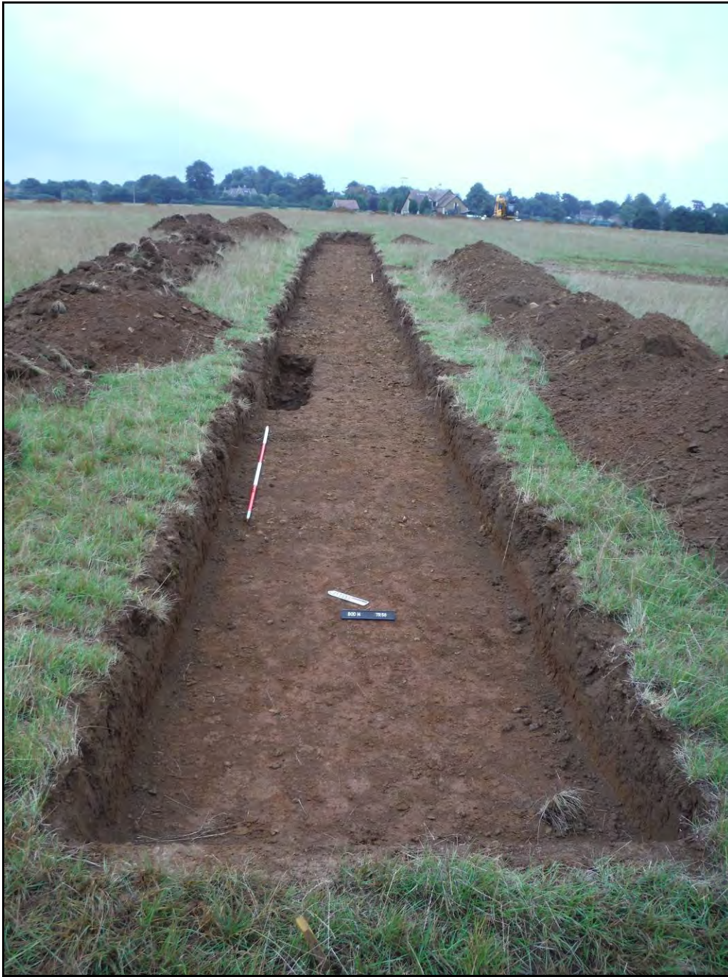
Figure. 77- NE-facing view of Trench 58 (Scale- 2 x 2m)