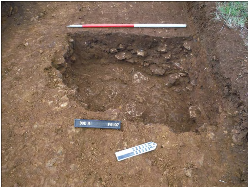
Figure. 94- ESE facing section through pit F.6107 (Scale- 1 x 1m)