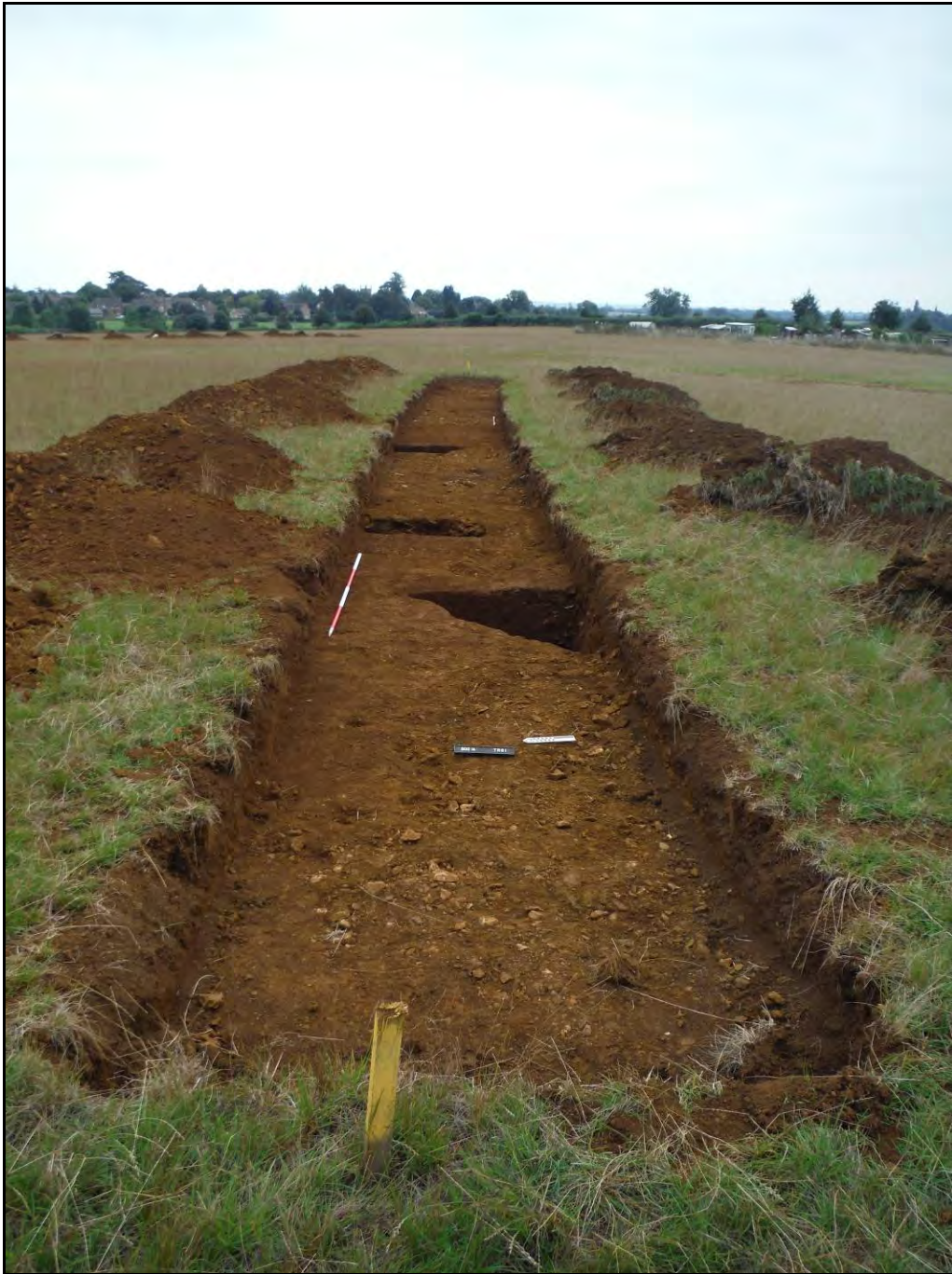
Figure. 90- E-facing view of Trench 61 (Scale- 2 x 2m)