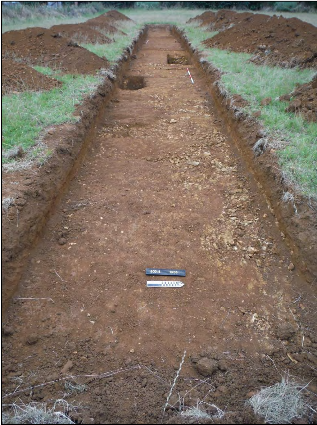
Figure. 111- W-facing view of Trench 68 (Scale- 2 x 2m)