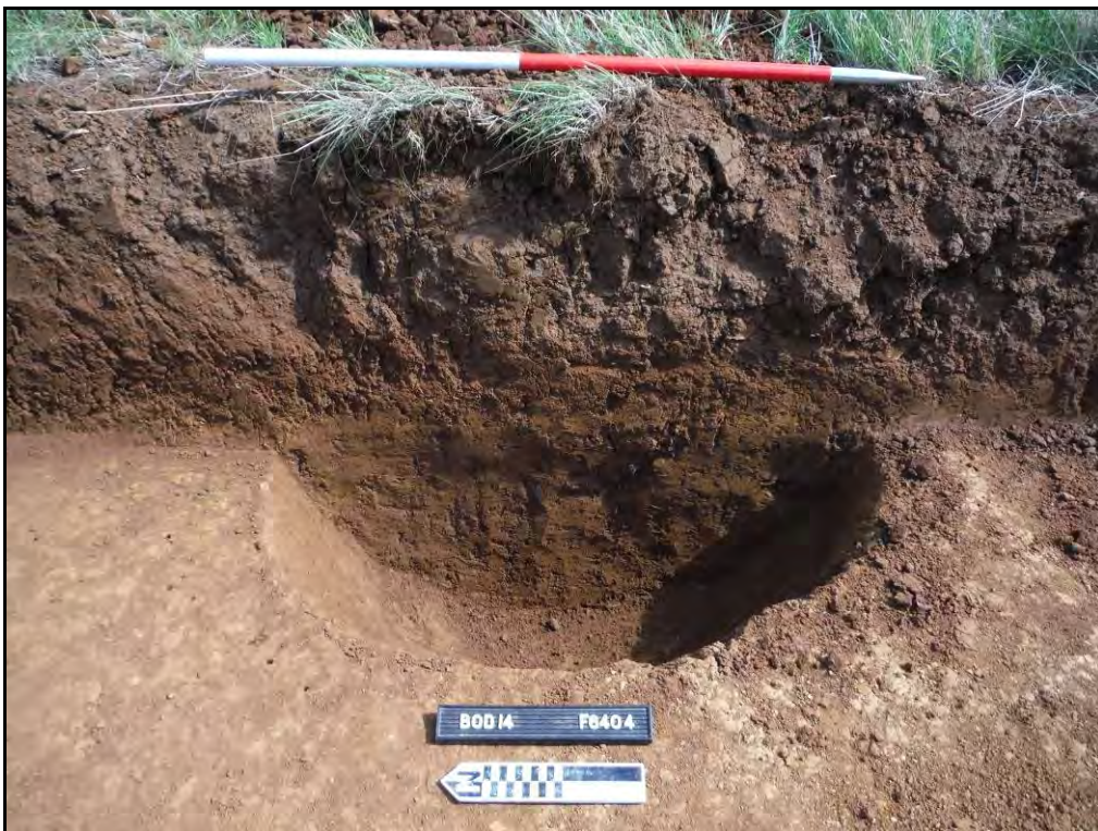
Figure. 98- E-facing view of pit F.6404 (Scale- 1 x 1m)