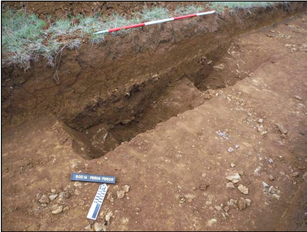
Figure. 103- NW-facing view of enclosure ditches F.6504 and F.6506 (Scale- 1 x 2m)