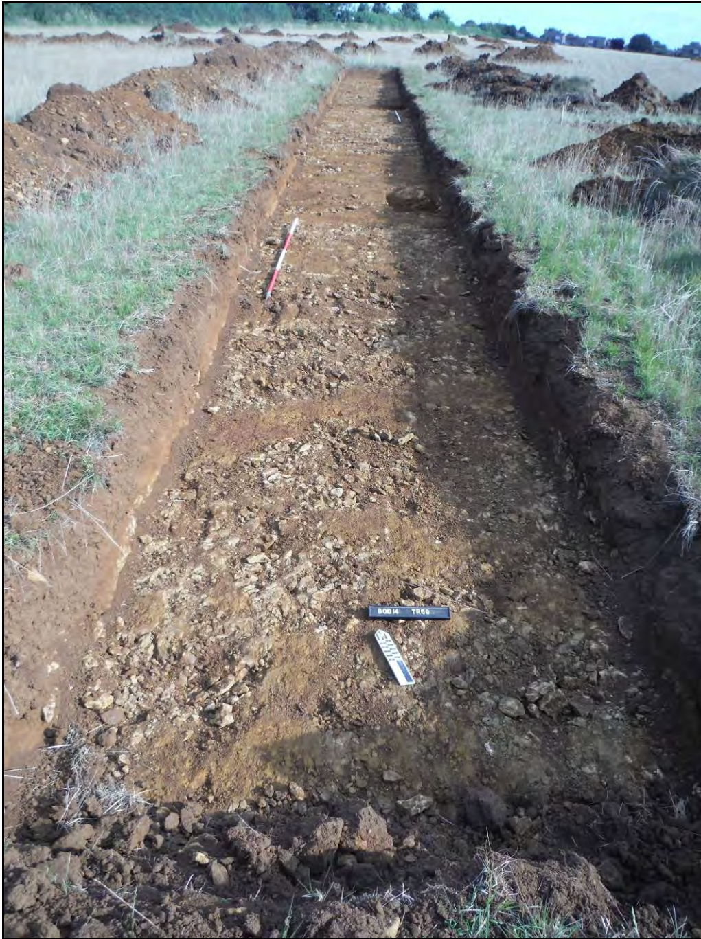
Figure. 82- NNE-facing view of Trench 59 (Scale- 2 x 2m)