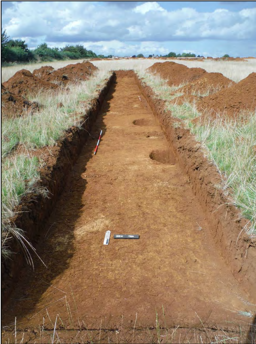
Figure. 99- N-facing view of Trench 64 (scale- 2 x 2m)