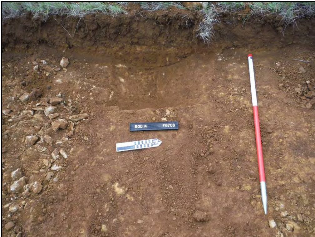
Figure. 107- E-facing section through linear F.6704 (Scale- 1 x 1m)