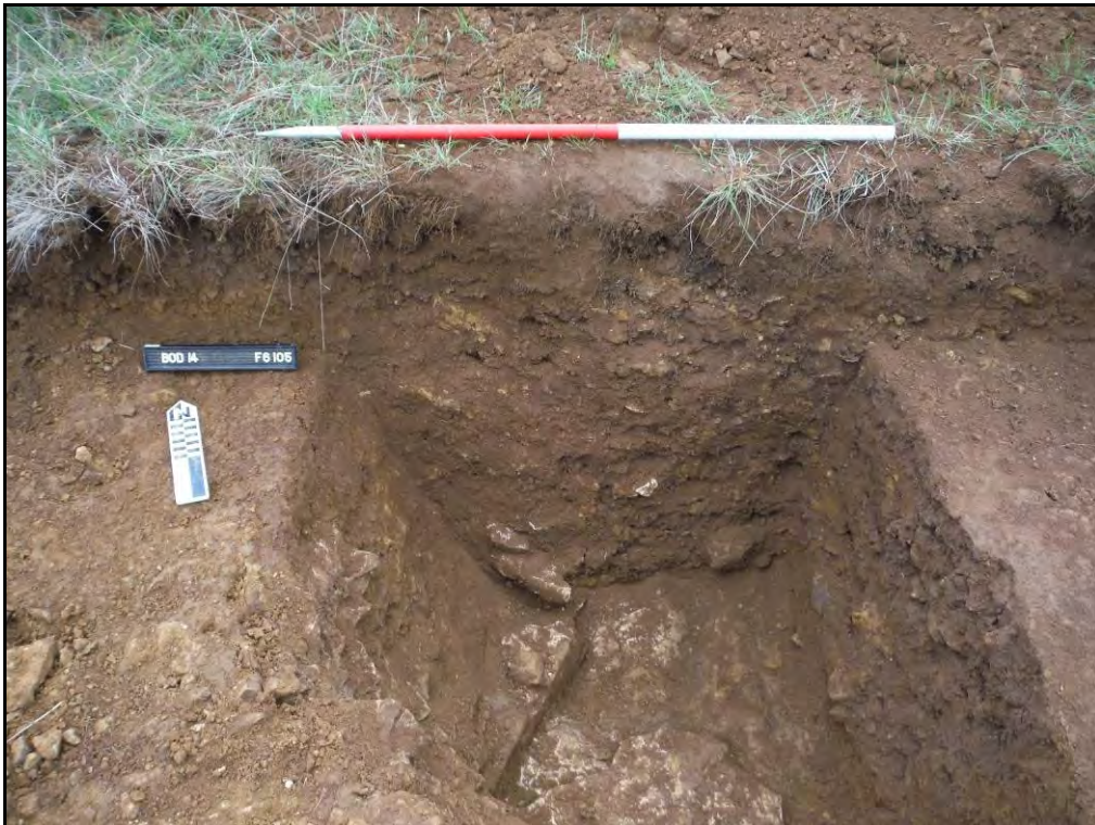
Figure. 92- SSW facing section through pit F.6105 (Scale- 1 x 1m)