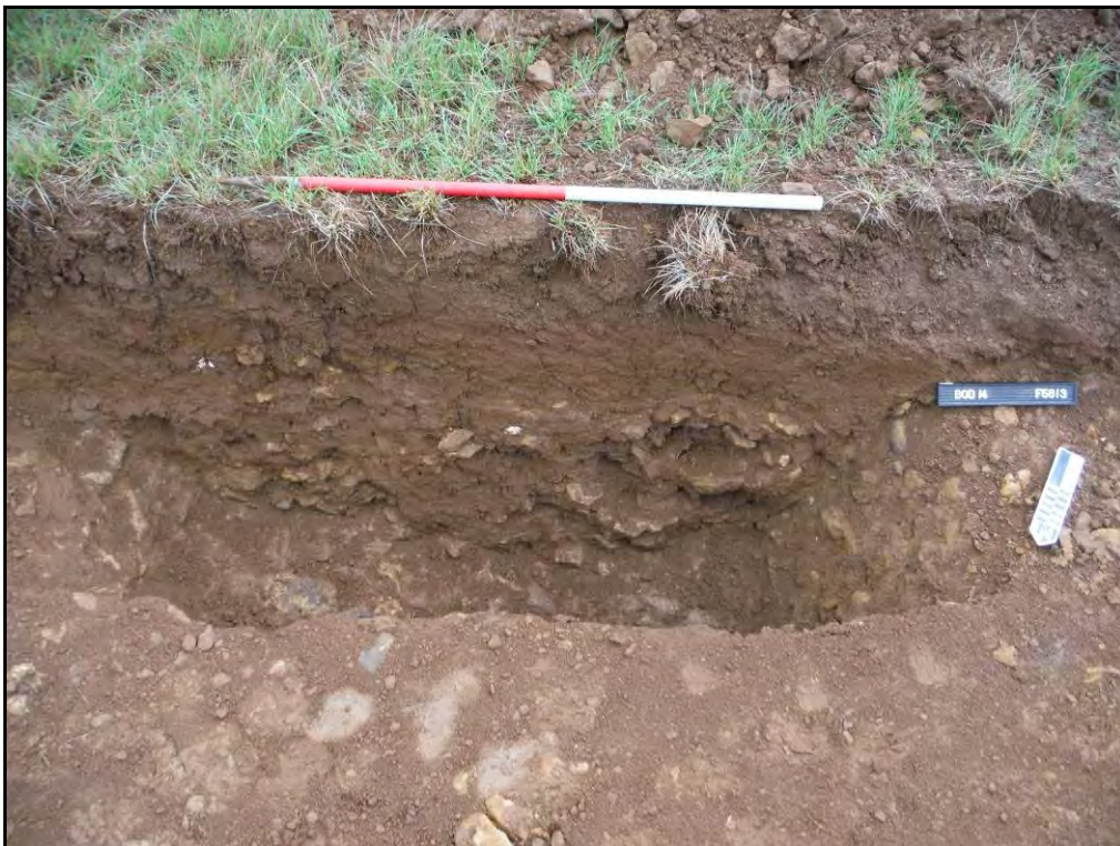
Figure. 81- SW-facing view of enclosure ditch F.5813 (Scale- 1 x 1m)