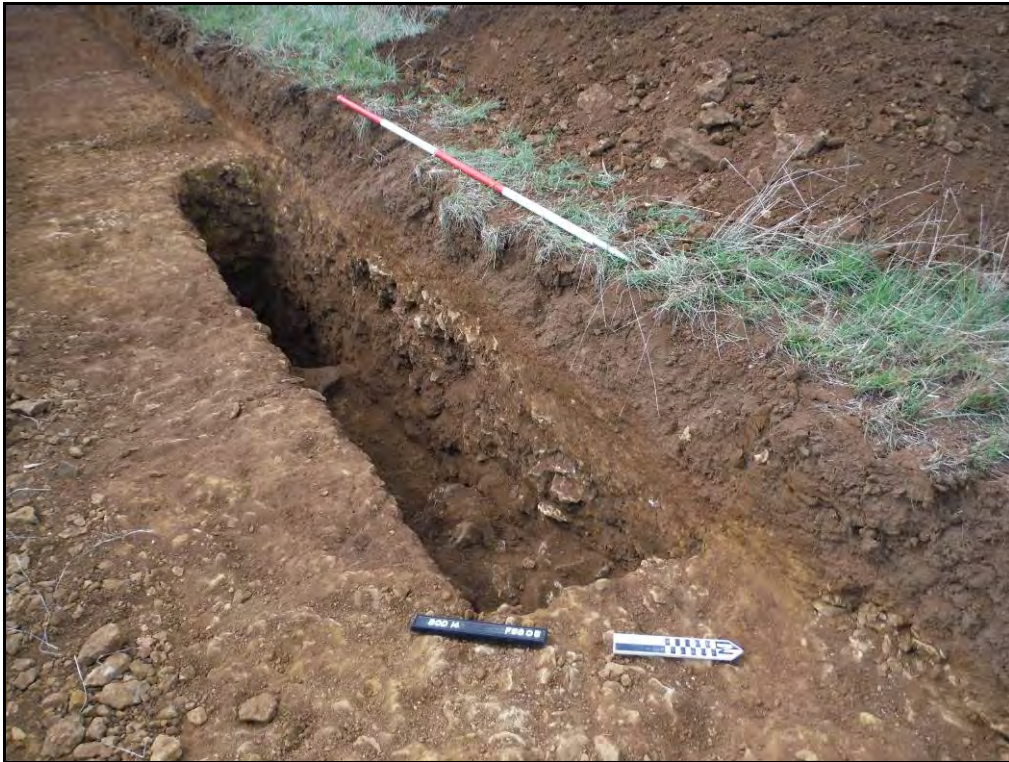
Figure. 78- W-facing view of pits F.5804 and F.5808 in association with enclosure ditch F.5806 (Scale 1 x 2m)