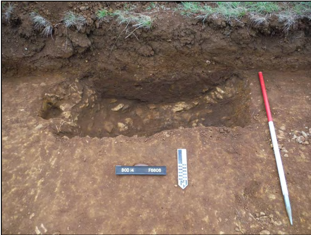
Figure. 112- N-facing section through linear F.6806 (Scale- 1 x 1m)