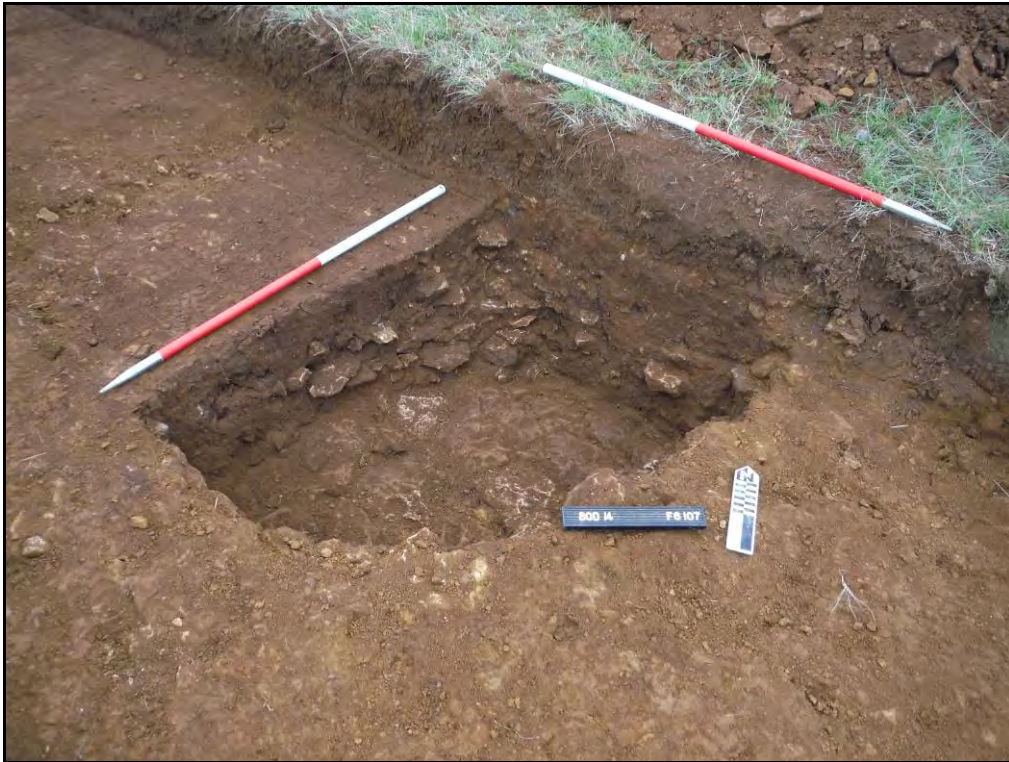
Figure. 93- N-facing view of pit F.6107 (Scale- 2 x 1m)