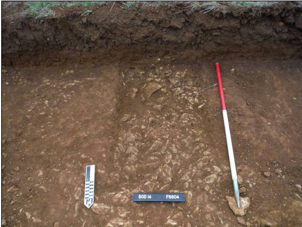
Figure. 110- S-facing view of linear F.6804 (Scale- 1 x 1m)