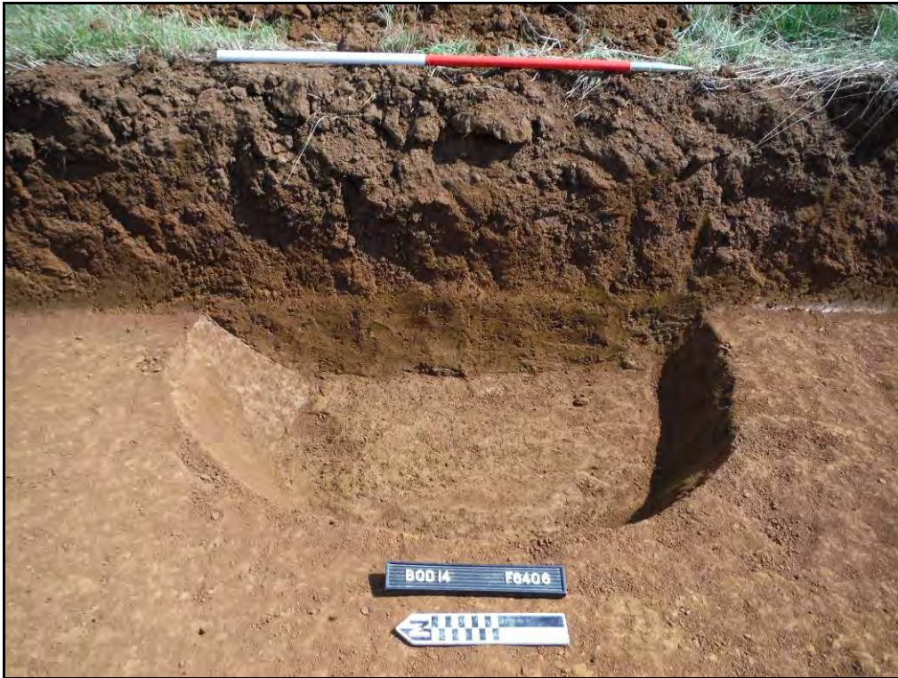
Figure. 100- E-facing view of pit F.6406 (Scale- 1 x 1m)