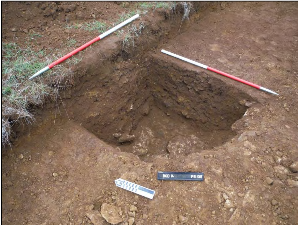
Figure. 91- NE-facing view of pit F.6105 (Scale -2 x 1m)