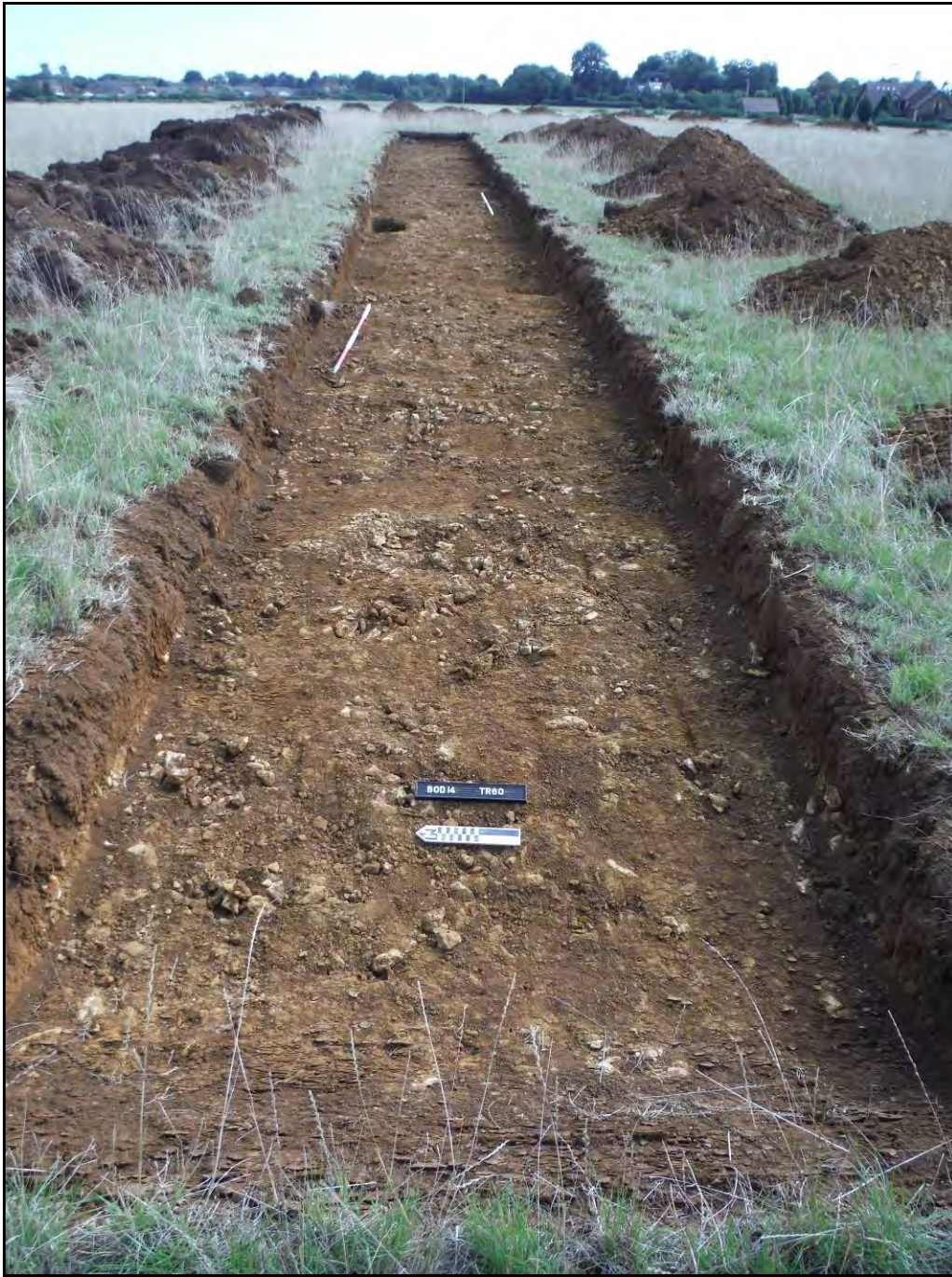
Figure. 85- W-facing view of Trench 60 (Scale- 2 x 2m)