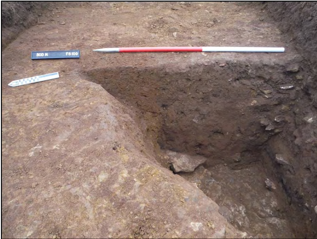
Figure. 97- WNW-facing section through pit F.6109 and linear F.6111. Note truncation of linear F.6111 by pit F.6109 (Scale- 1 x 1m)