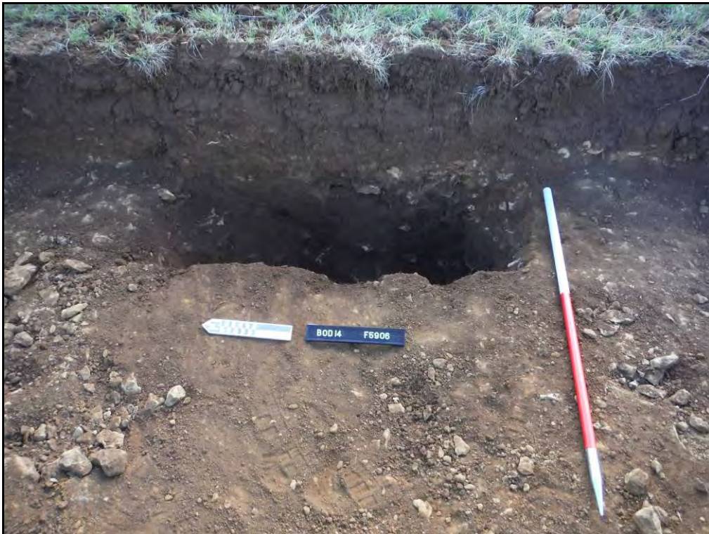
Figure. 84- E-facing view of linear F.5906 (Scale- 1 x 1m)