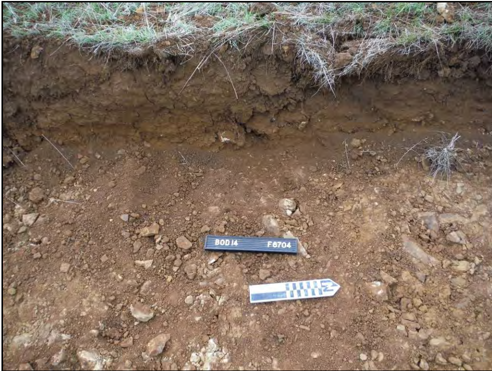
Figure. 109- E-facing section through furrow F.6704 (Scale 1 x 0.2m)