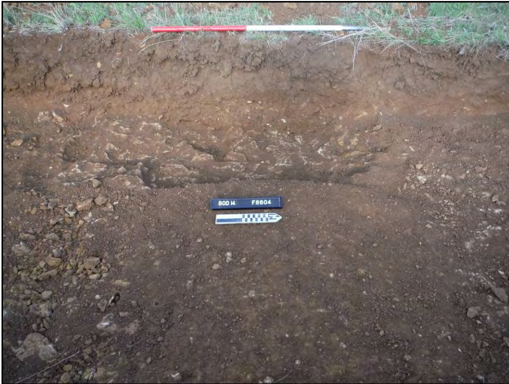
Figure. 106- E-facing section through linear F.6604 (Scale- 1 x 1m)