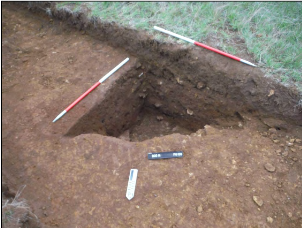
Figure. 95- S-facing view of pit F.6109 (Scale- 2 x 1m)