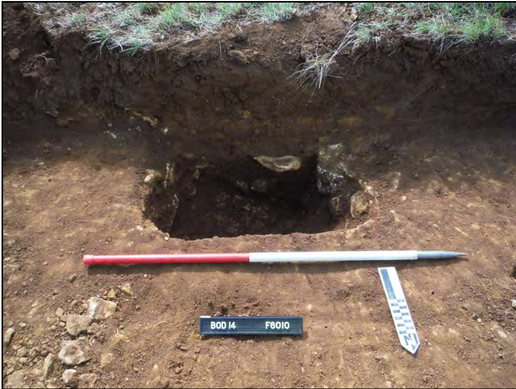
Figure. 88- S-facing view of pit F.6010 (Scale- 1 x 1m)