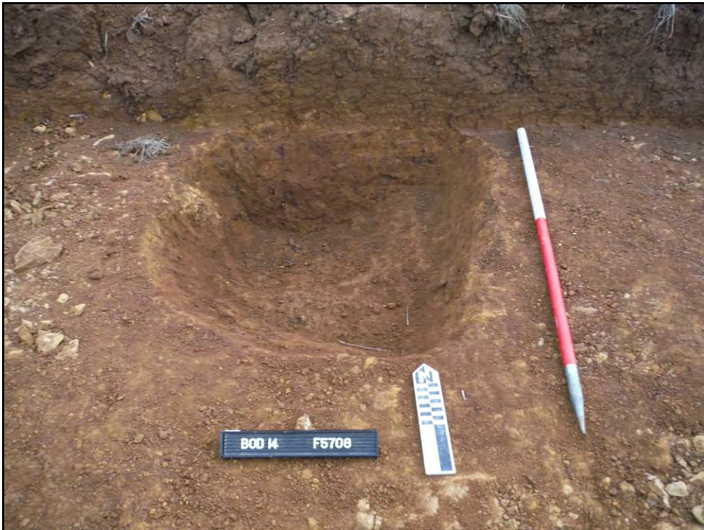
Figure. 76- N-facing view of pit F.5708 (Scale- 1 x 1m)