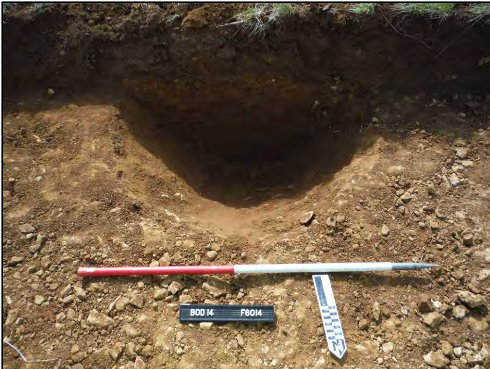
Figure. 89- S-facing view of pit F.6014 (Scale- 1 x 1m)