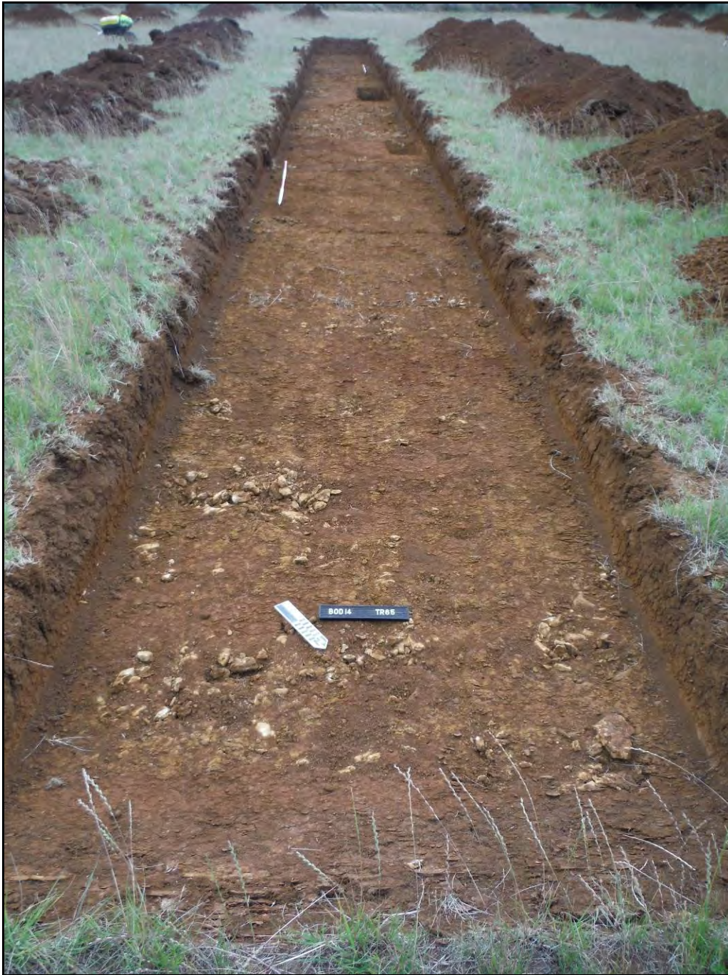
Figure. 102- SE-facing view of Trench 69 (Scale- 2 x 2m)