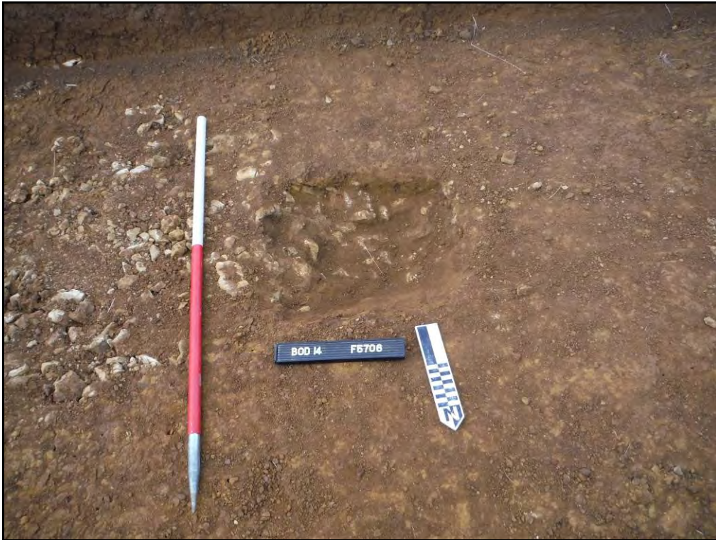
Figure. 75- SSW-facing view of F.5706 (Scale- 1 x 1m)