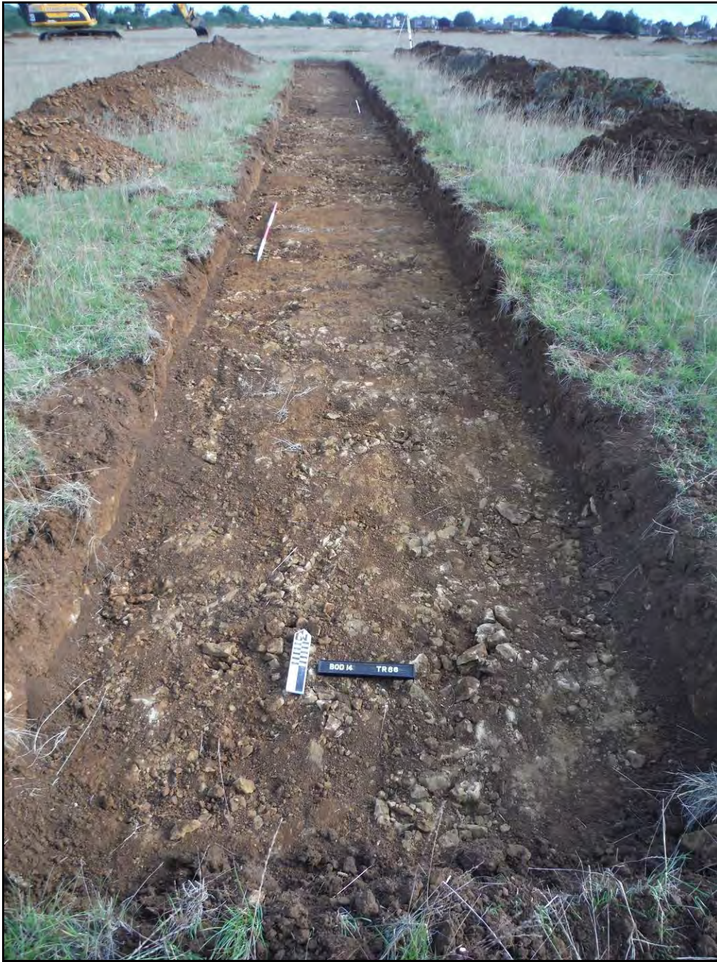
Figure. 105- N-facing view of Trench 66 (Scale- 2 x 2m)