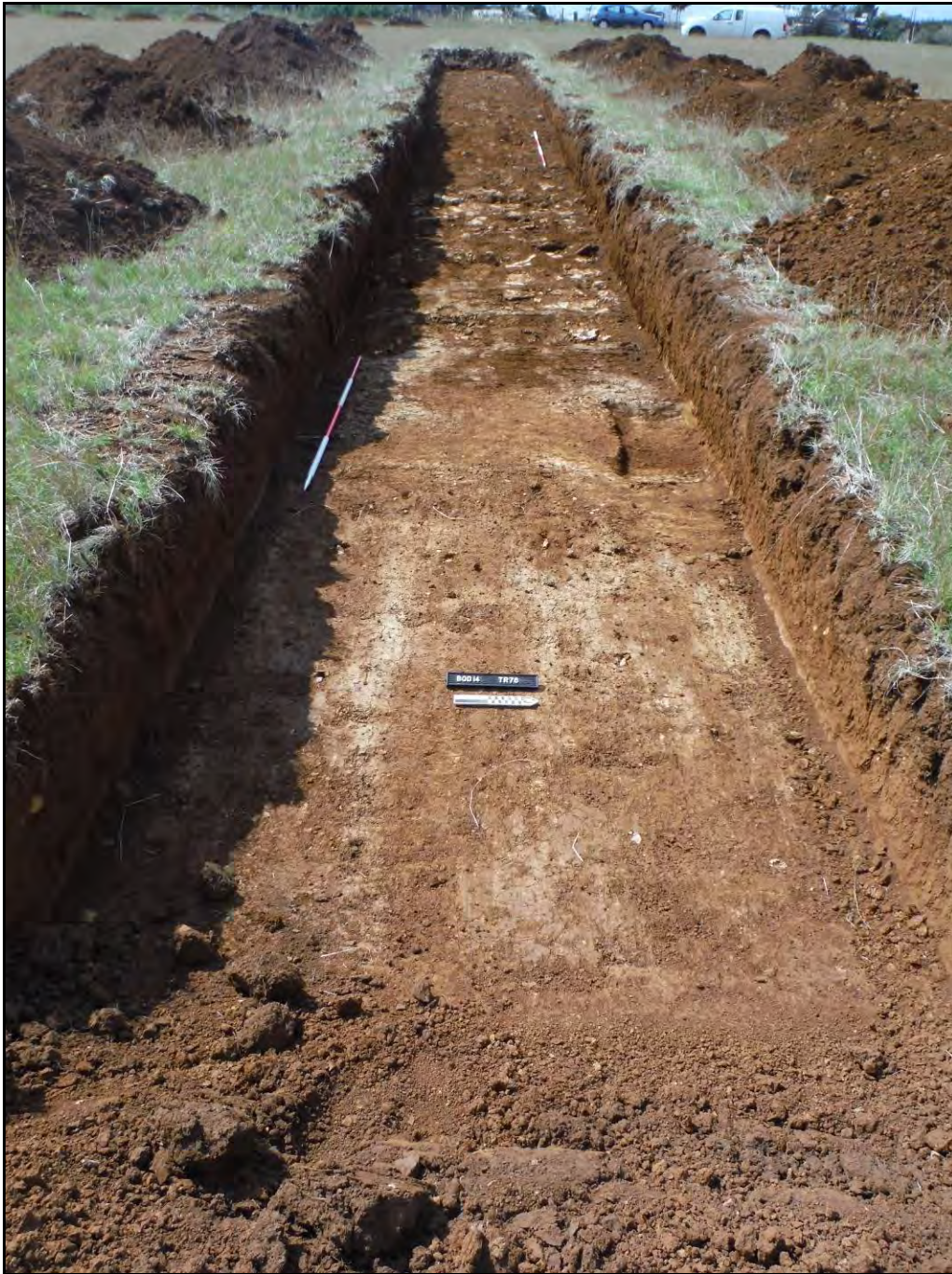
Figure. 108- W-facing view of Trench 67 (Scale- 2 x 2m)