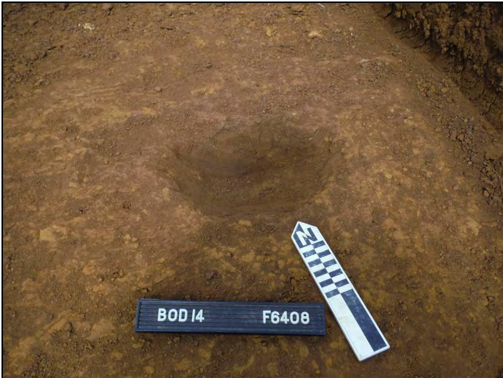
Figure. 101- NE-facing view of posthole F.6408 (Scale 1 x 0.2m)