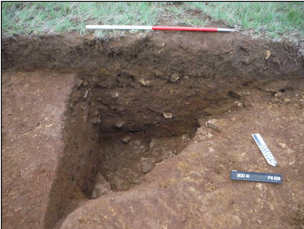
Figure. 96- NNE-facing section through pit F.6109 (Scale- 1 x 1m)