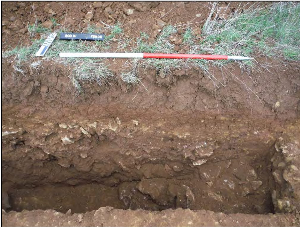
Figure. 80- N facing view of pit F.5808 (Scale- 1 x 1m)