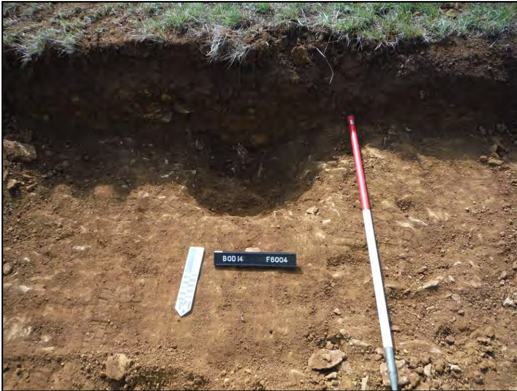
Figure. 86-facing view of pit F.6004 (Scale- 1 x 1m)