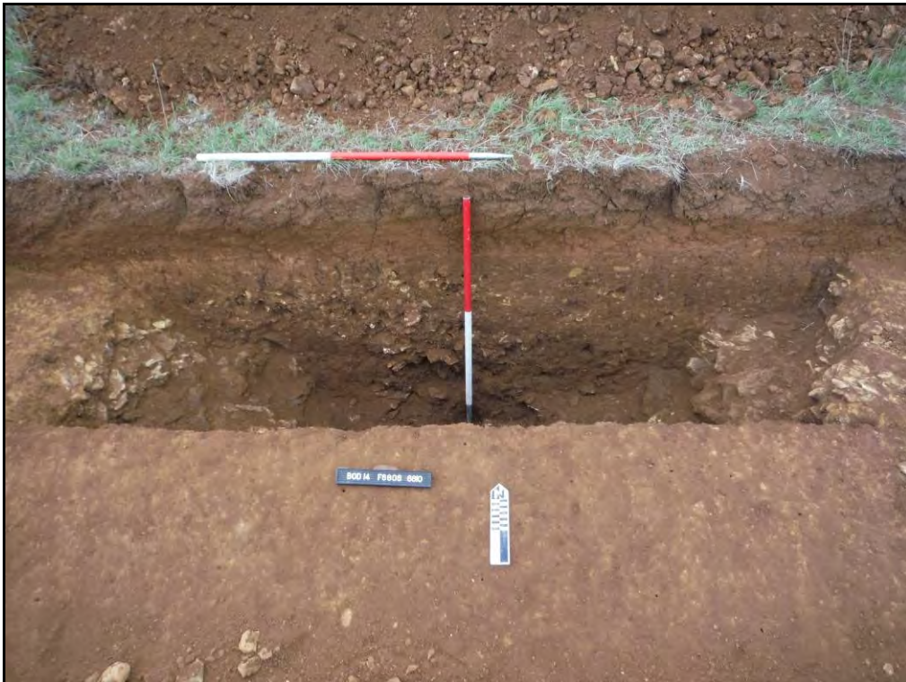
Figure. 113- S-facing section through enclosure ditches F.6808 and F.6814 (Scale- 2 x 1m)