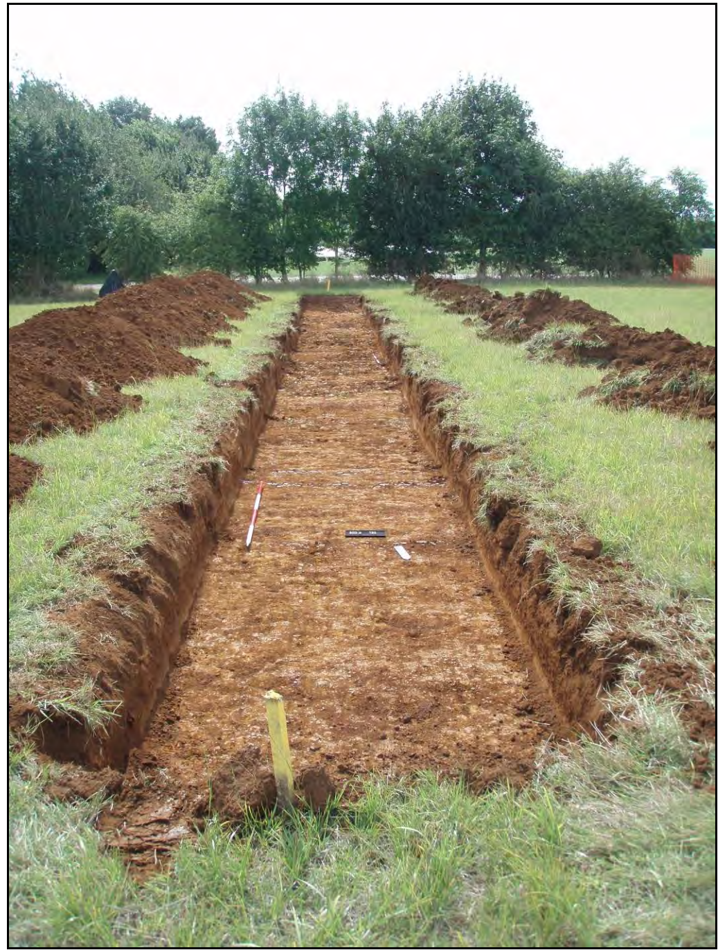
Figure. 123- SW-facing view of Trench 9 (Scale- 2 x 2m)