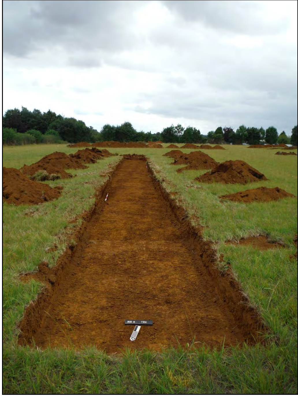
Figure. 126- SSE-facing view of Trench 14 (Scale- 2 x 2m)