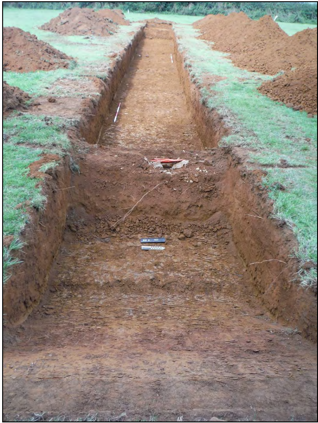
Figure. 122- W-facing view of Trench 7. Note unexcavated foul pipe bisecting eastern extent of Trench 7 (Scale- 2 x 2m)