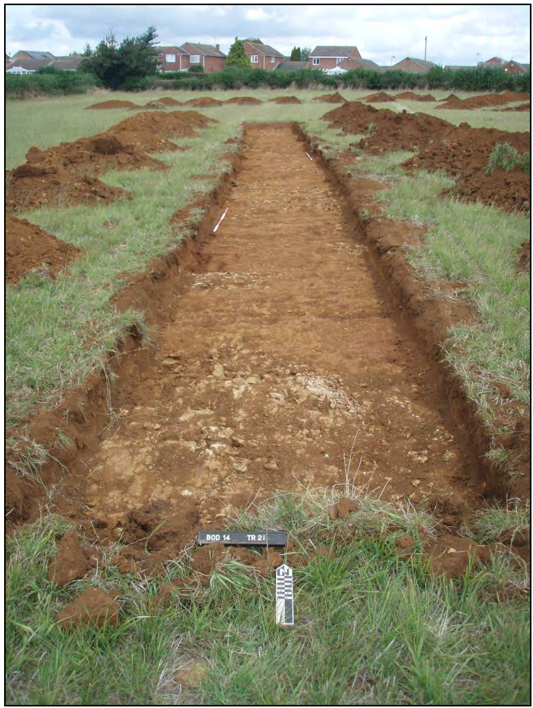
Figure. 129- N-facing view of Trench 21 (Scale- 2 x 2m)