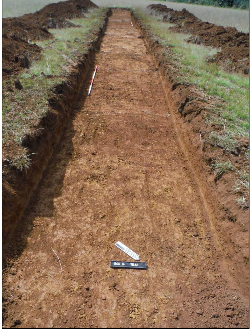
Figure. 138- SW-facing view of Trench 42 (Scale- 2 x 2m)