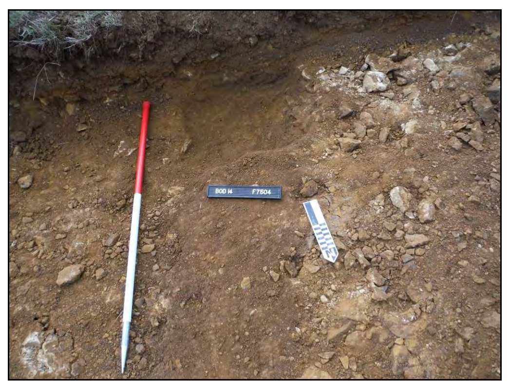
Figure. 118- N-facing section through linear F.7504 (Scale- 1 x 1m)