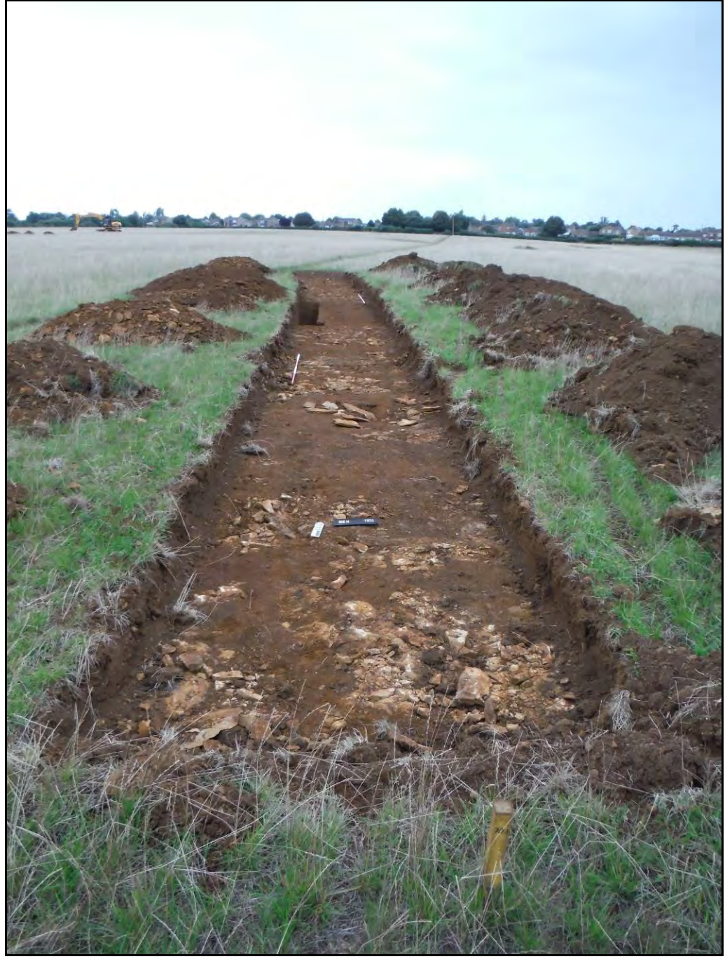
Figure. 116- N-facing view of Trench 70 (Scale- 2 x 2m)