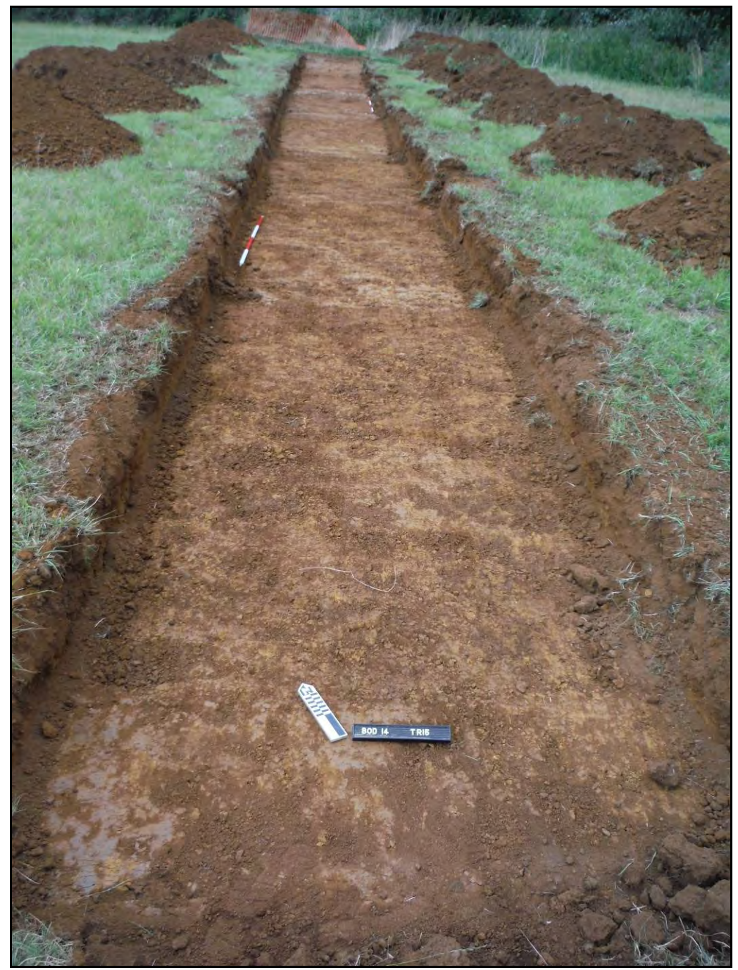
Figure. 127- NE-facing view of Trench 15 (Scale- 2 x2m)