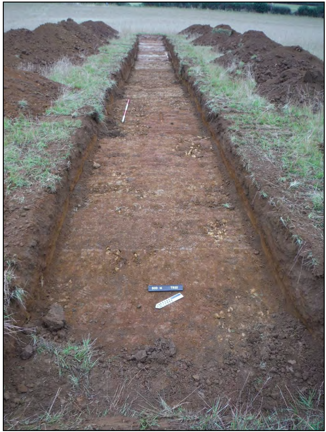
Figure. 134- SW-facing view of Trench 32 (Scale- 2 x 2m)