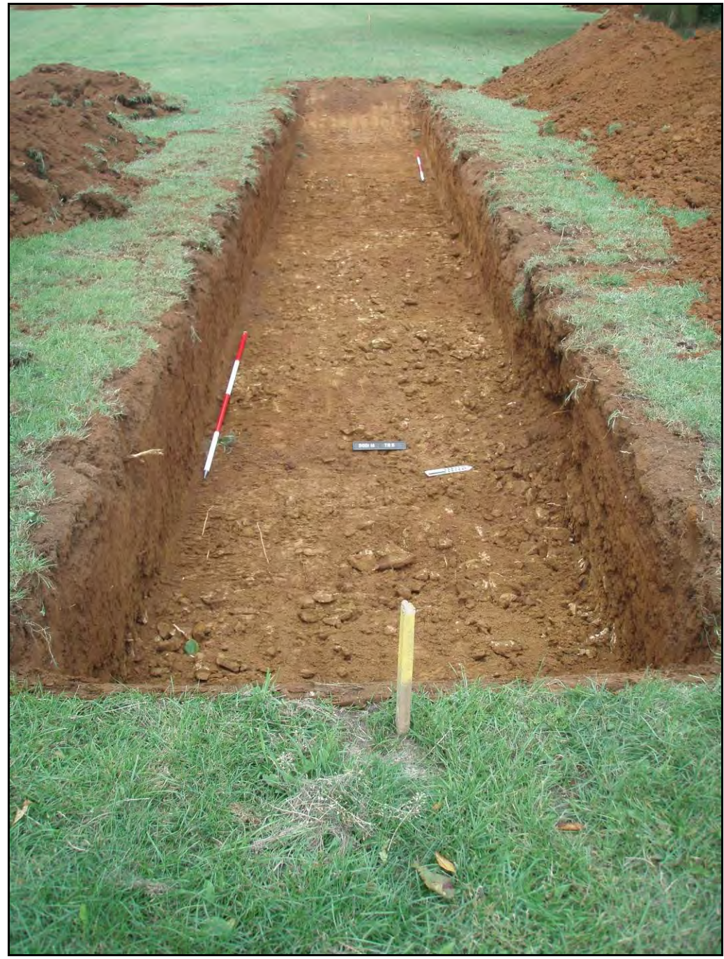
Figure. 121- WNW- facing view of Trench 5 – Trench shortened to avoid damage to nearby trees (Scale- 2 x 2m)