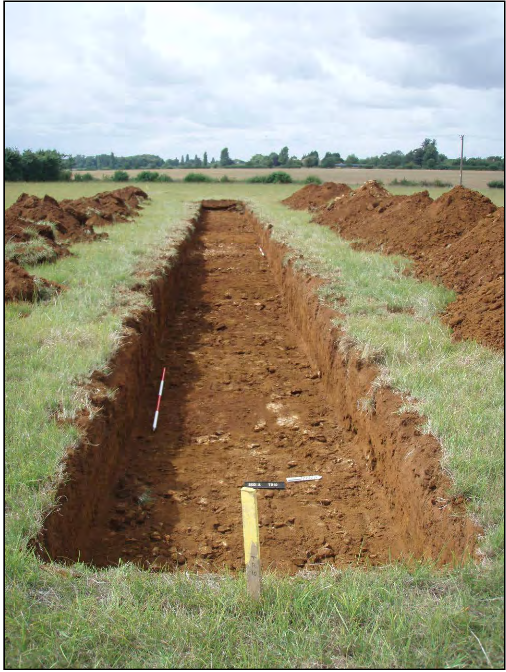
Figure. 124- W-facing view of Trench 10 (Scale- 2 x 2m)