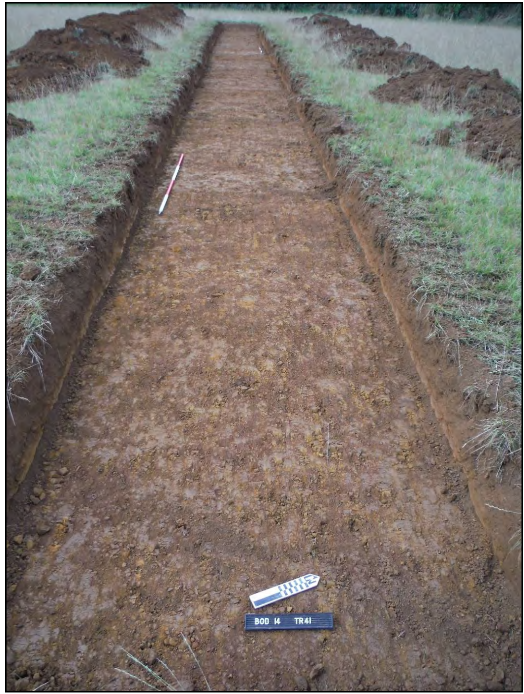
Figure. 137- WNW-facing view of Trench 41 (Scale 2 x 2m)