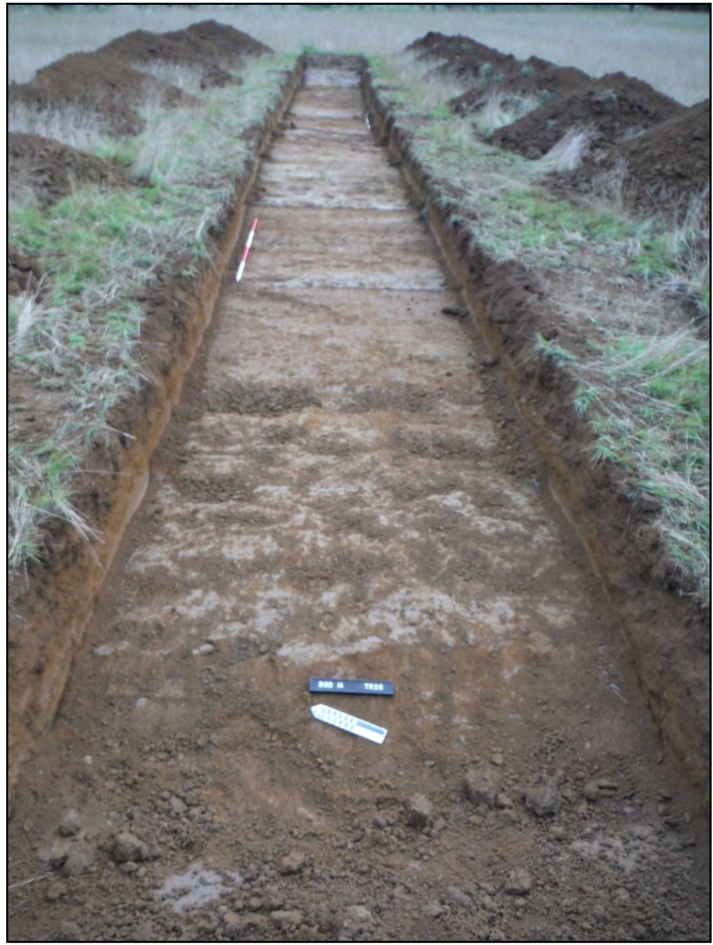
Figure. 131- ENE-facing view of Trench 26 (Scale- 2 x 2m)