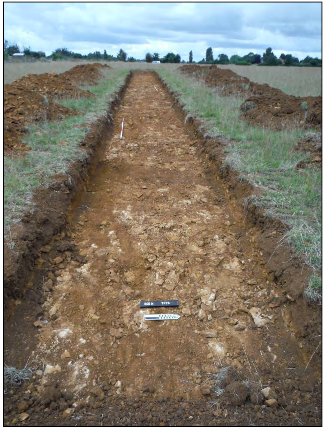
Figure. 117- W-facing view of Trench 75 (Scale- 2 x 2m)