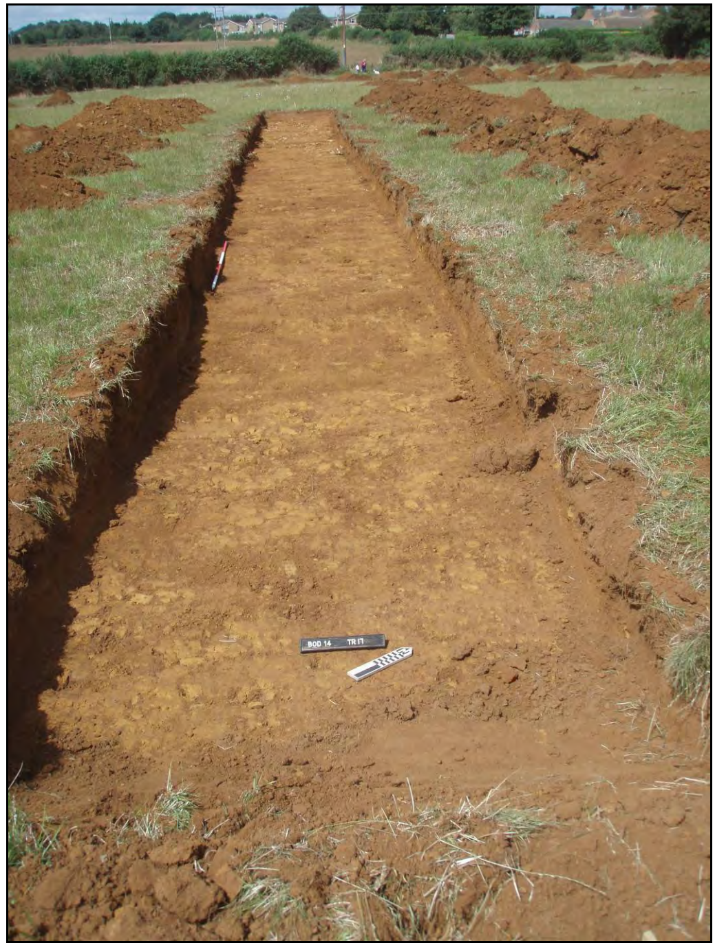
Figure. 128- NW-facing view of Trench 17 (scale- 2 x 2m)