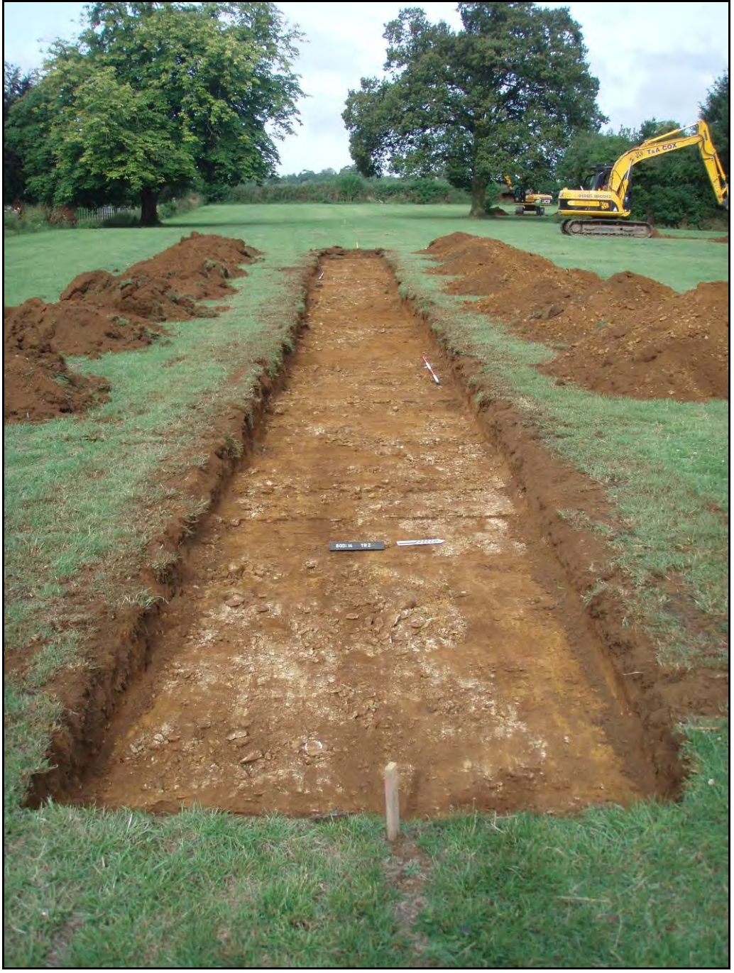
Figure. 119- W-facing view of Trench 2 (Scale- 2 x 2m)