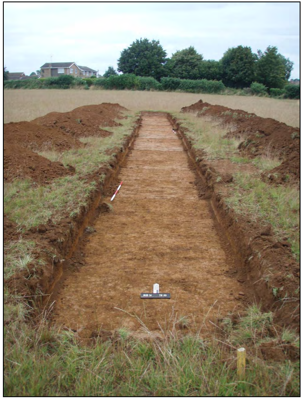
Figure. 135- N-facing view of Trench 33 (Scale- 2 x 2m)