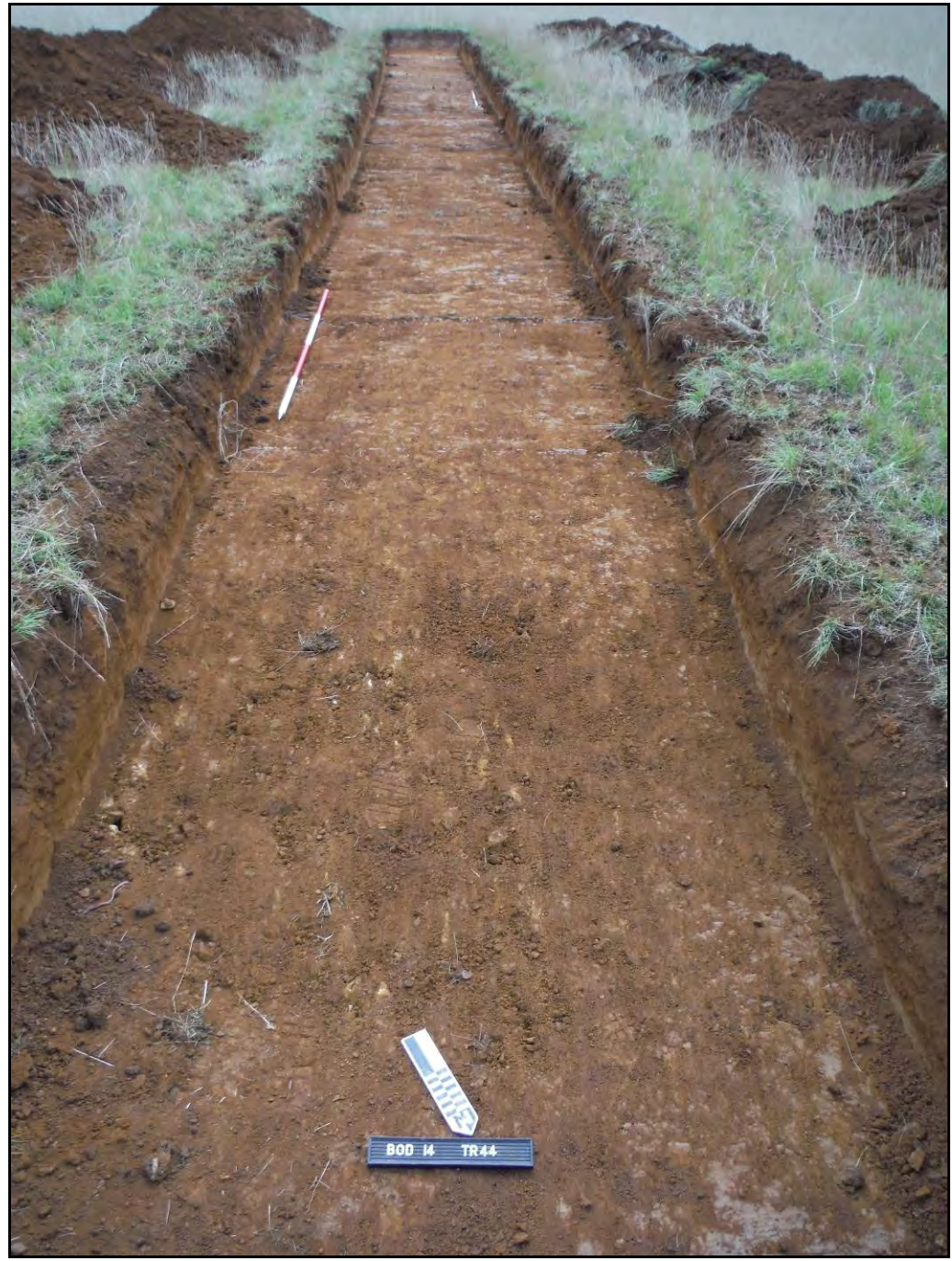
Figure. 139-SW-facing view of Trench 44 (Scale- 2 x 2m)