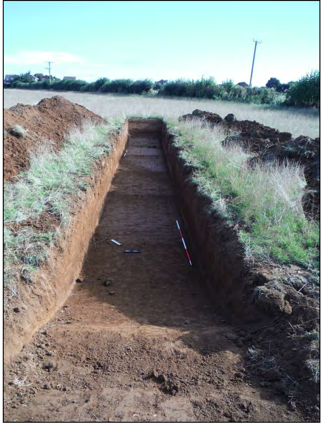
Figure. 130- NE-facing view of Trench 24 (Scale- 2 x 2m)