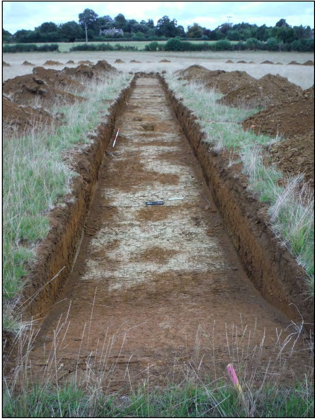
Figure. 140- E-facing view of Trench 45 (Scale- 2 x 2m)