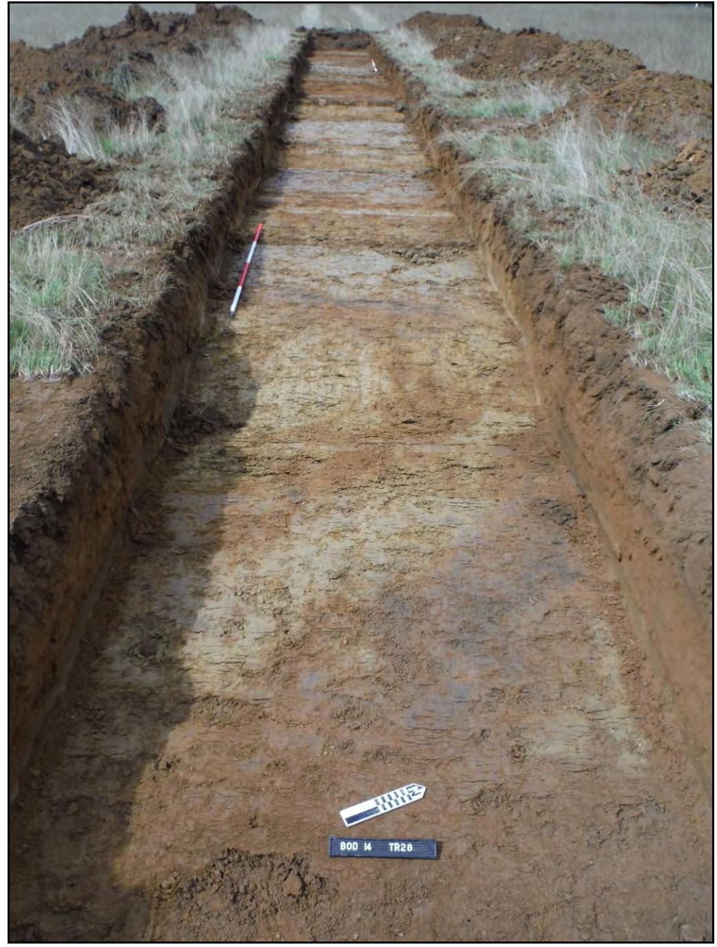
Figure. 133- WNW-facing view of Trench 28 (Scale- 2 x 2m)