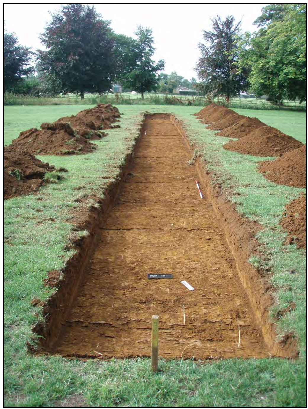
Figure. 120- SW-facing view of Trench 4 (Scale- 2 x 2m)