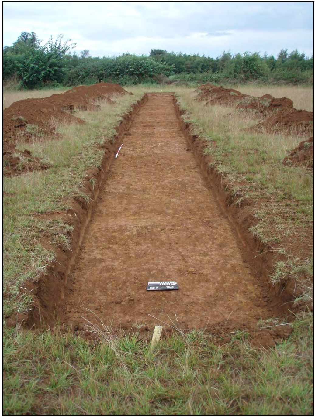
Figure. 136- NE-facing view of Trench 40 (Scale- 2 x 2m)