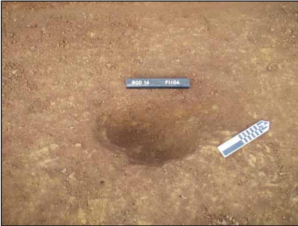
Figure. 13- NW facing view of pit/posthole F1104 (Scale- 1 x 0.2m)