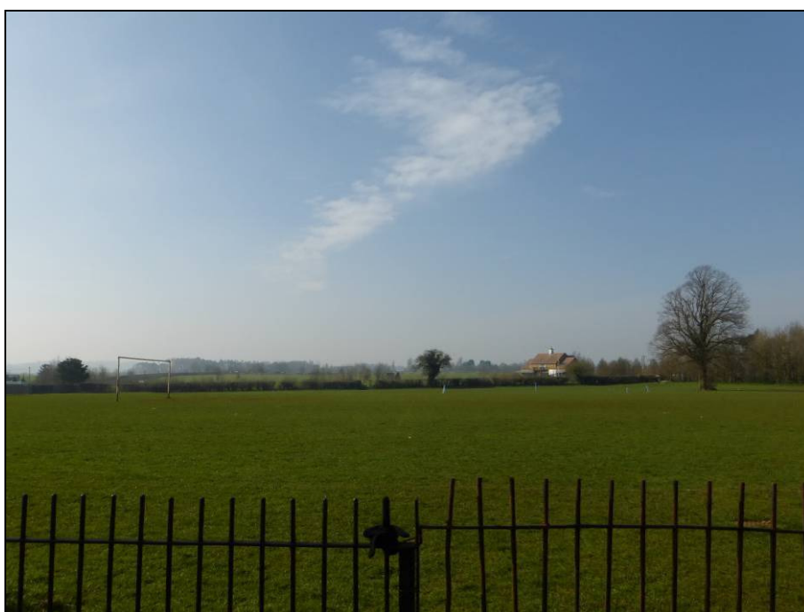
Figure 18: View from the Lodge to Bodicote House, looking east towards PDA