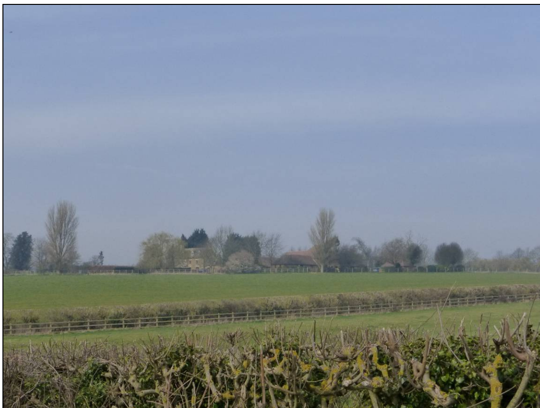
Figure 22.:View towards Wykham Farmhouse from Wykham Lane