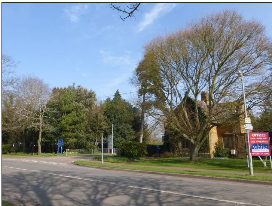
Figure 17: View north-east across White Post Road to the Lodge to Bodicote House