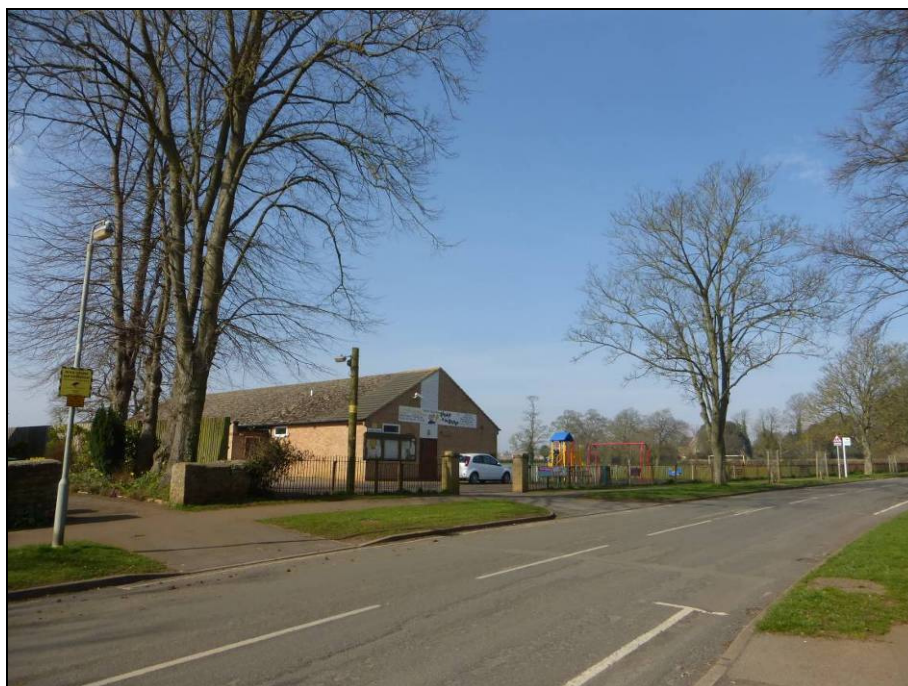
Figure 15: View from Brown Thatch, Bodicote, looking north-west towards PDA