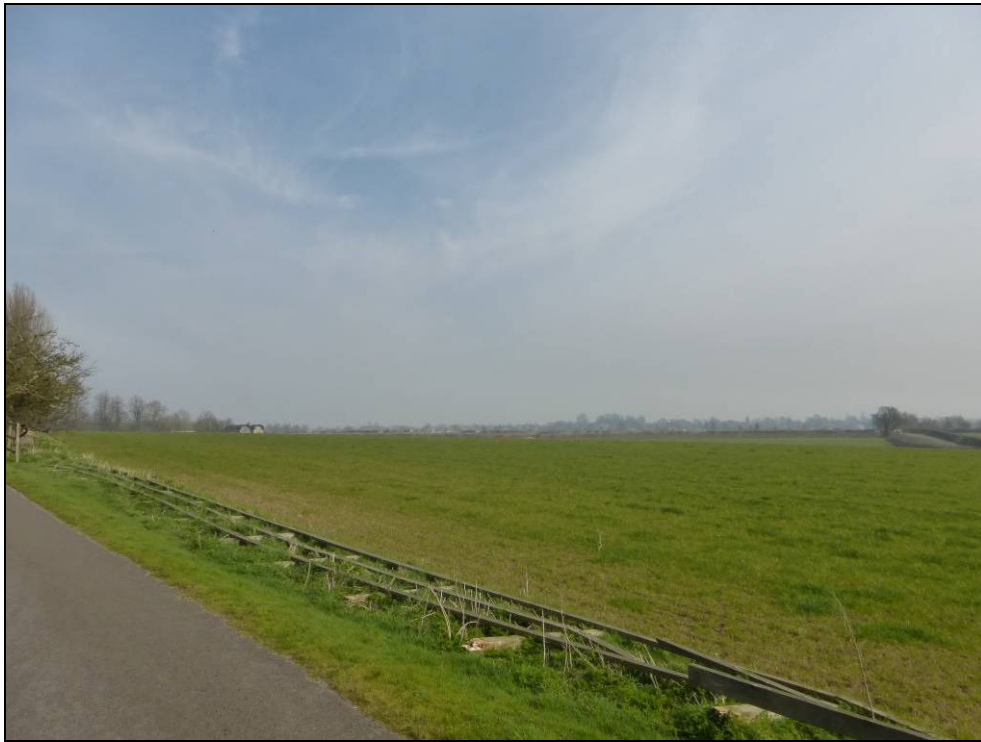
Figure 24: View north-east from lane at side of Wykham Farmhouse towards the PDA with modern barn conversions to left