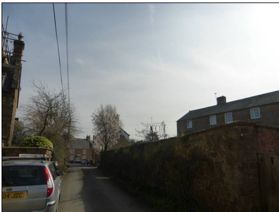
Figure 14: The Paddocks and associated wall, looking east