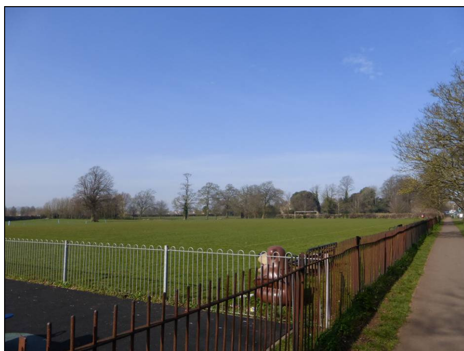
Figure 16: View along White Post Road, Bodicote, looking north-west towards PDA