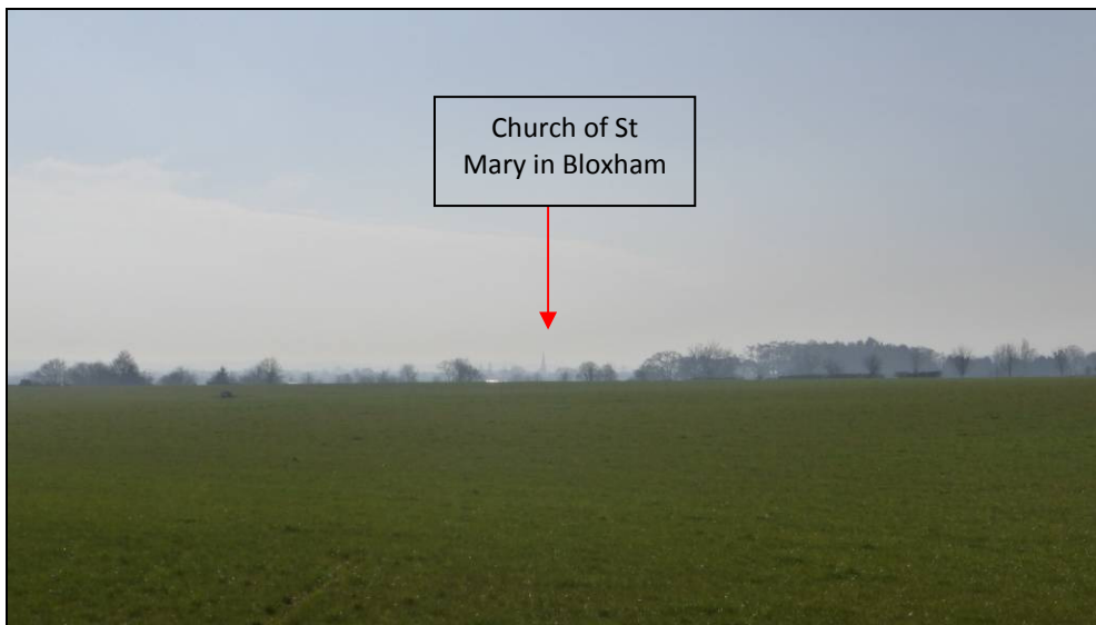
Figure 25: View north-east from lane at side of Wykham Farmhouse towards the PDA with modern barn conversions to left