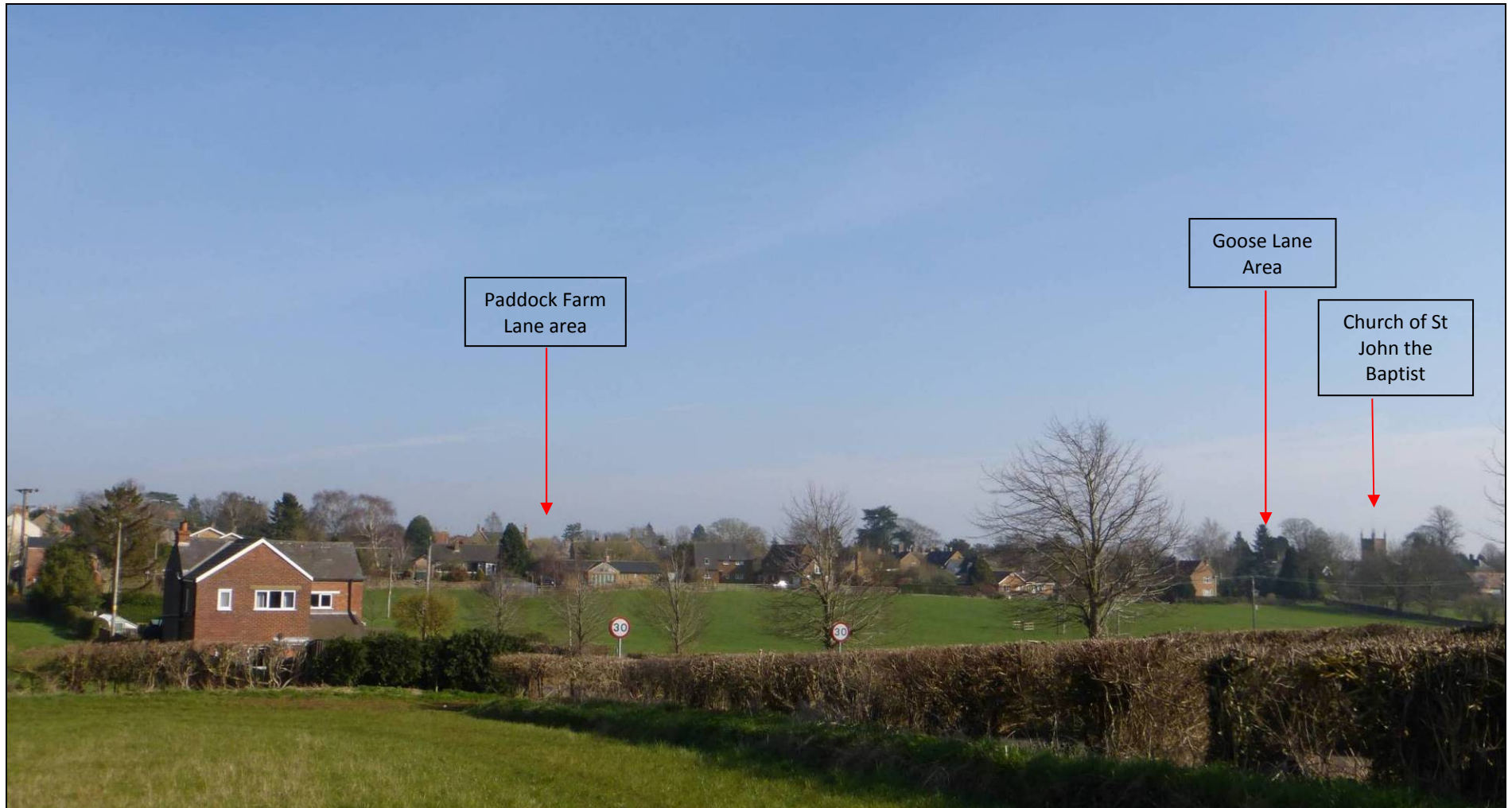
Figure 21: Annotated Bodicote Village from southern edge of PDA, adjacent to Wykam Road, showing modern housing along Wykam Road.