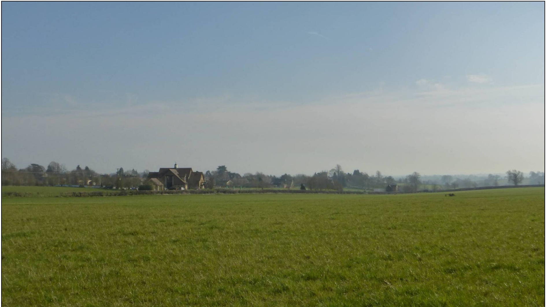
Figure 20: View south-east across the PDA towards Bodicote Village, with Banbury Cricket Pavillion in the foreground