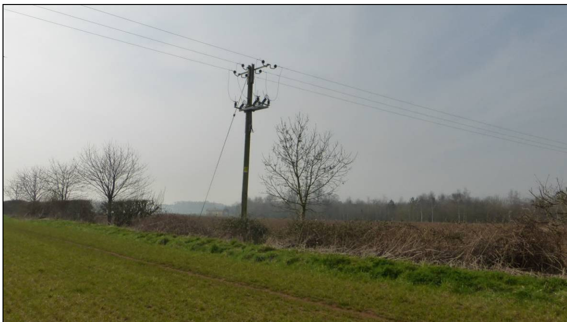
Figure 23: View south-west towards Wykham Farmhouse from PDA