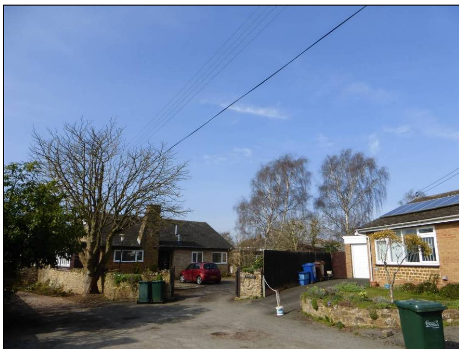
Figure 15: End of Paddock Farm Lane, looking north-west towards proposed development area