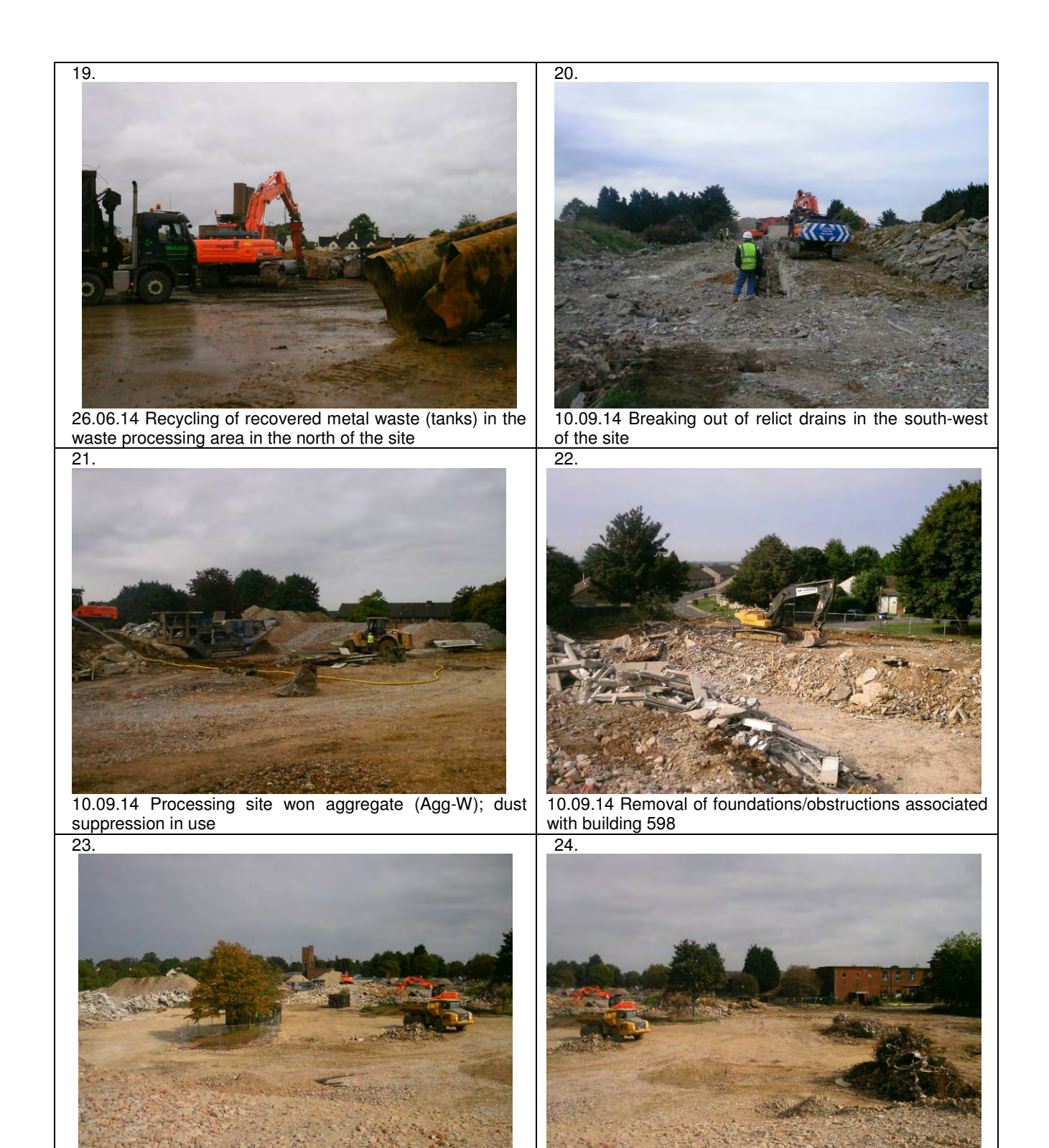
10.09.14 Northern view across the site with processing of hard-standing taking place