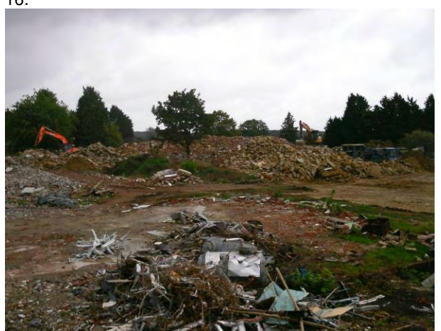
26.06.14 Processing of site won aggregates in the south of the site