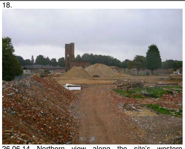
26.06.14 Northern view along the site's western boundary