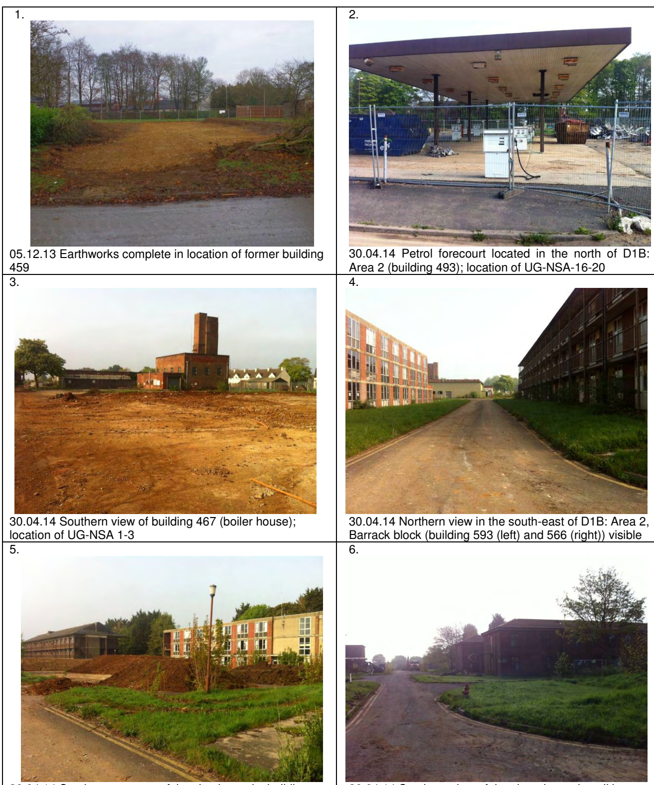
30.04.14 South-west corner of the site, barracks buildings 594 (right) and 598 (left) visible

30.04.14 Southern view of the site prior to demolition