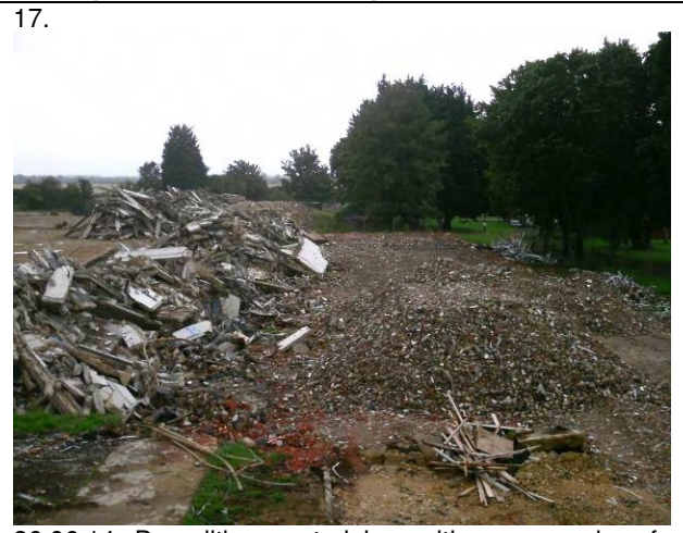
26.06.14 Demolition material awaiting processing from buildings 594 and 598