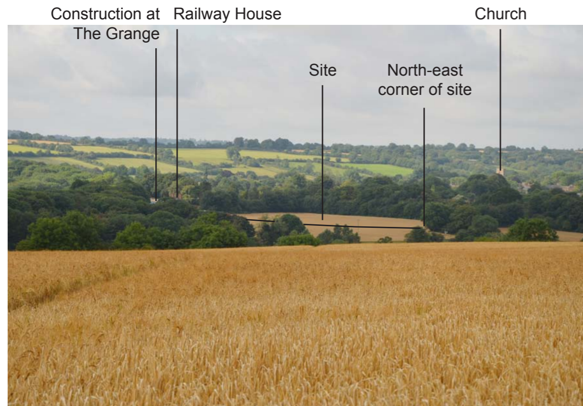
Photograph 8 A zoomed view of Photograph 7, with site lying between Railway House and end of tree belt marking north-east corner of site.