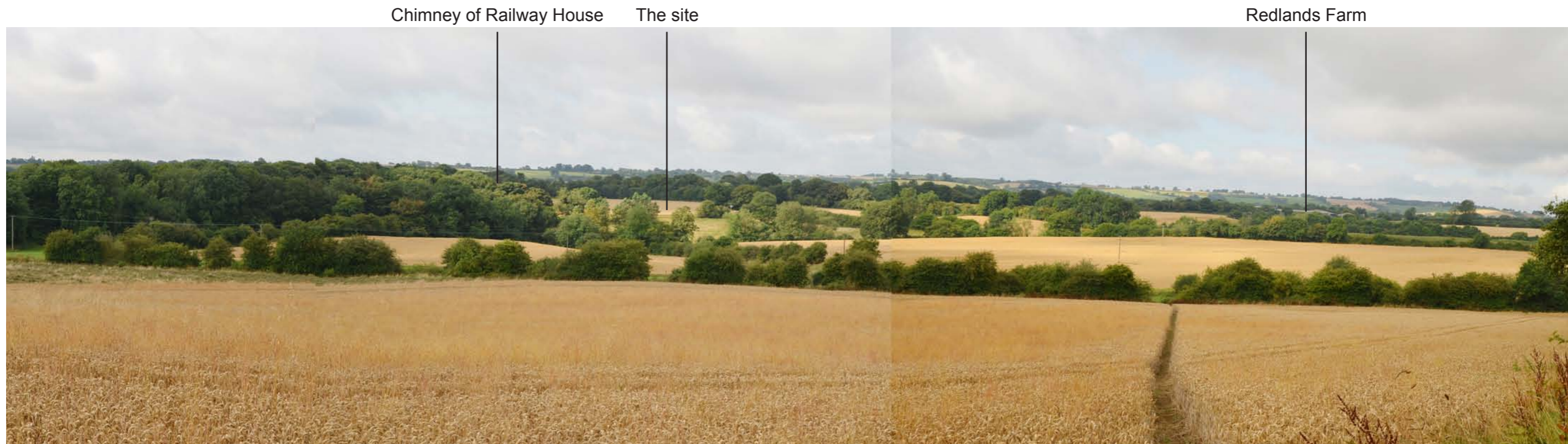
Photograph 5 From Footpath 253/21 on lower flanks of Council Hill looking south-west towards the site.