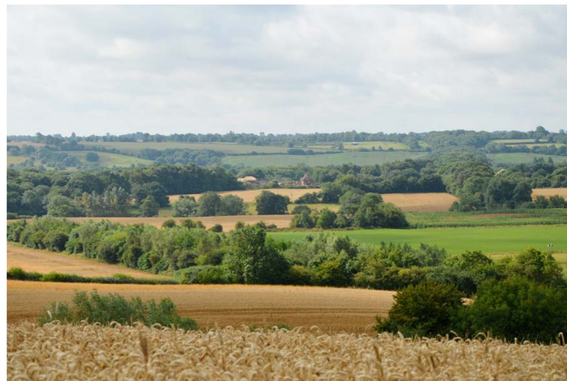
Photograph 3 A zoomed view of Photograph 2, showing visibility of Railway House and construction at The Grange.