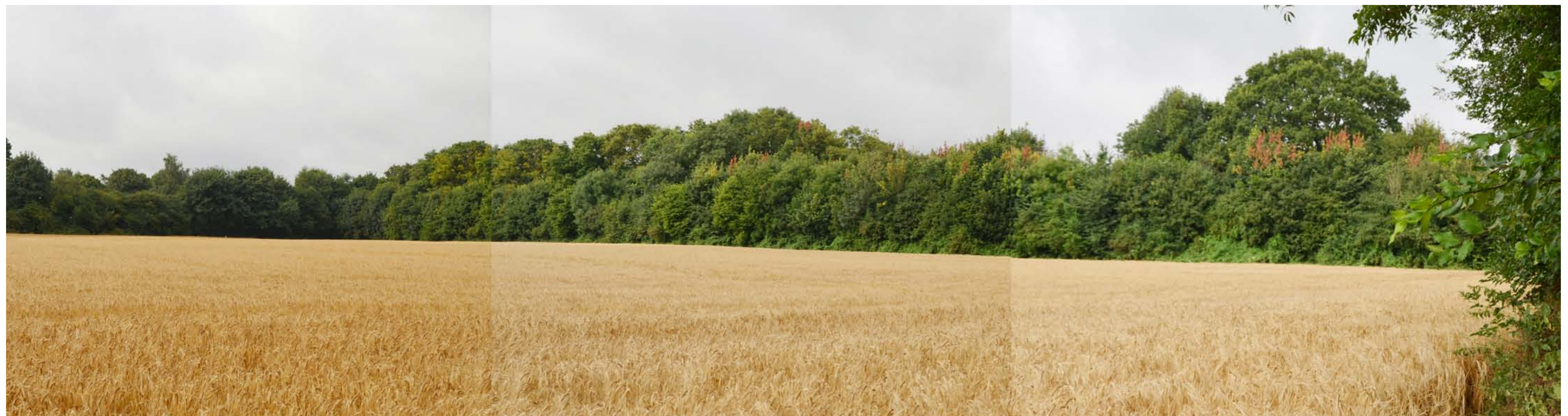
Photograph 4 Continued from above.