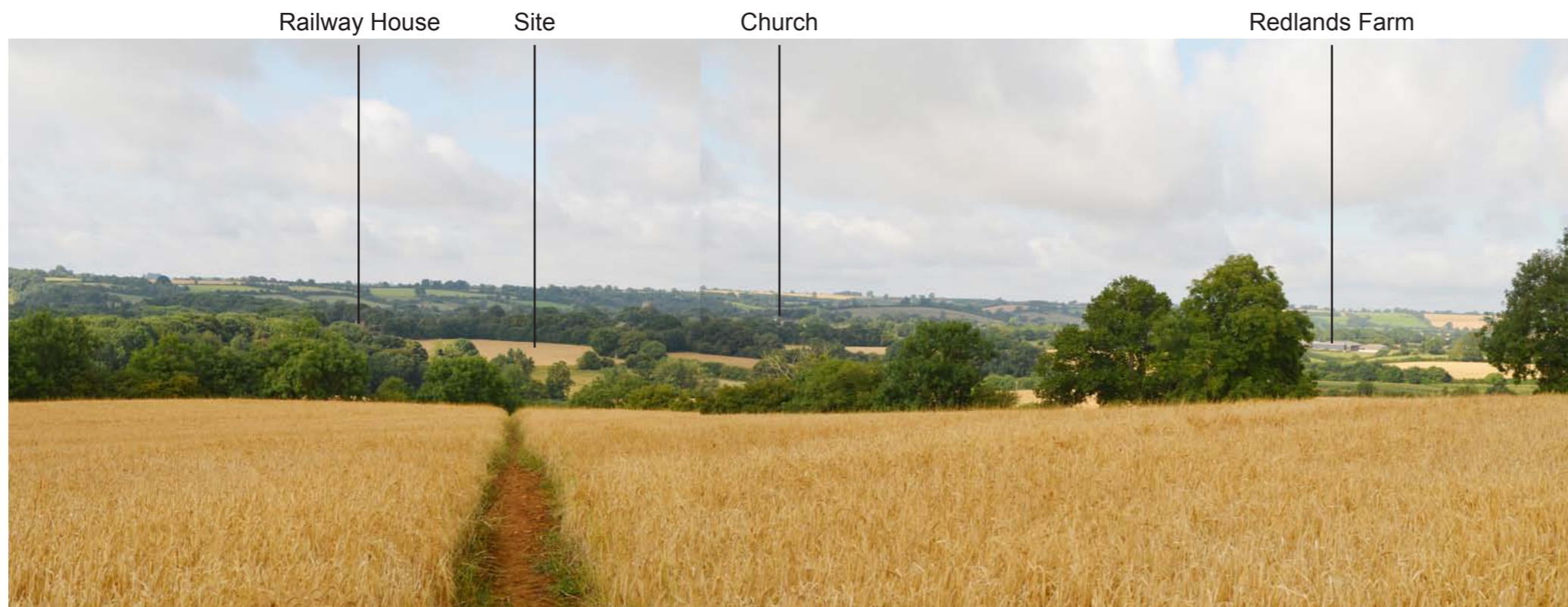
Photograph 6 From Footpath 253/21, mid-way up Council Hill looking south-west towards the site.