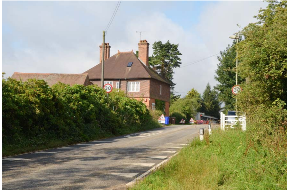
Photograph 11 Railway House on south side of Station Road at approach to Hook Norton from the east.