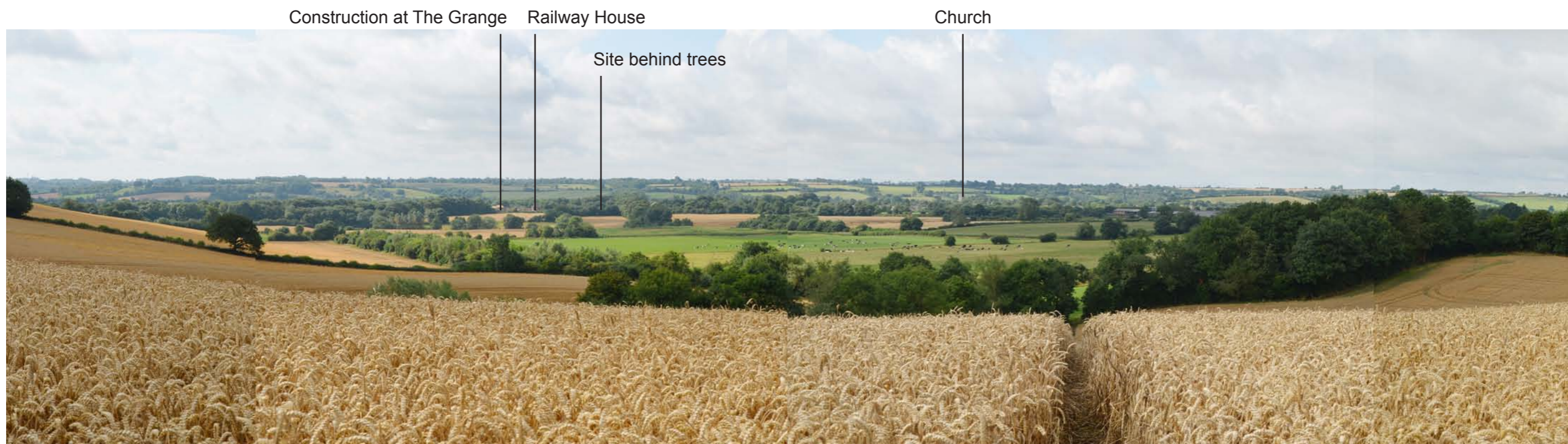
Photograph 2 From northern end of Footpath 253/19, south of Nill Cottages, looking south towards village of Hook Norton. Railway House, which would be opposite the south-east corner of the proposed development, is visible in this panorama.