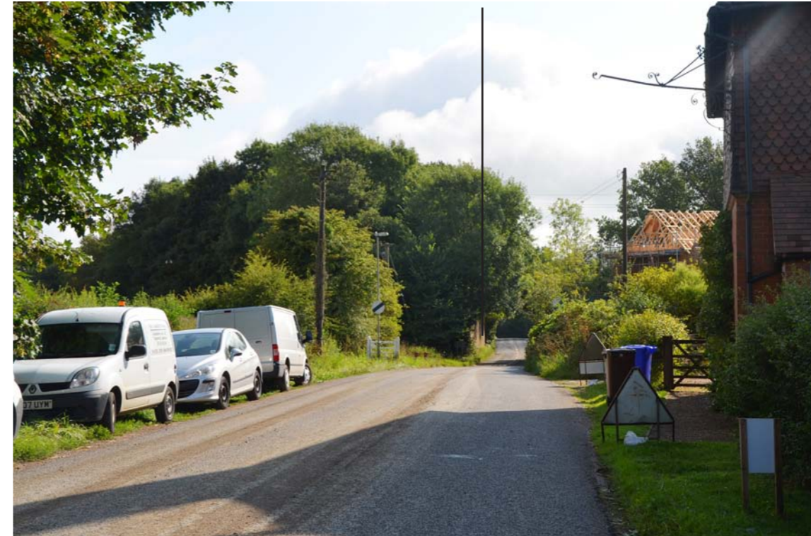
Photograph 12 Taken from adjacent to Station House looking east along Station Road showing former bridge abutment and construction progressing at The Grange.