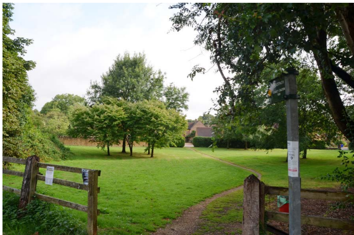
Photograph 1 Southern end of Footpath 253/19 where it crosses the public open space on the south-west corner of housing at Ironstone Hollow.