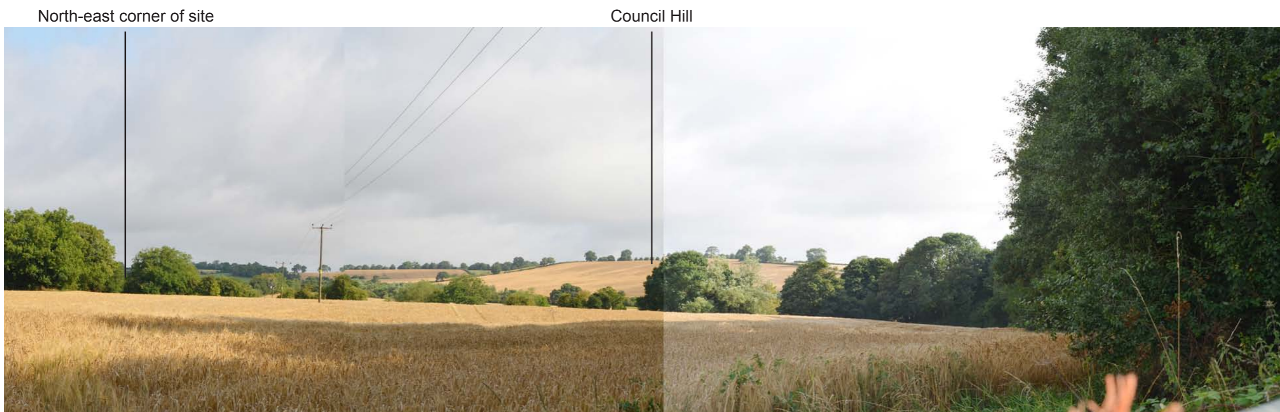
Photograph 10 Continued from above.