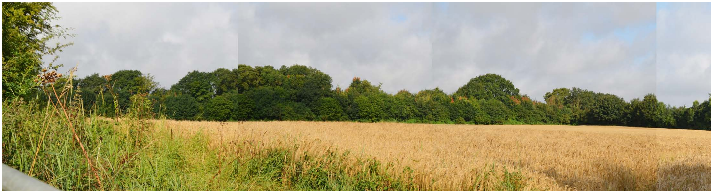
Photograph 10 From existing field gate on Station Road located to the east of the site, looking towards the tree belt along the western site boundary.