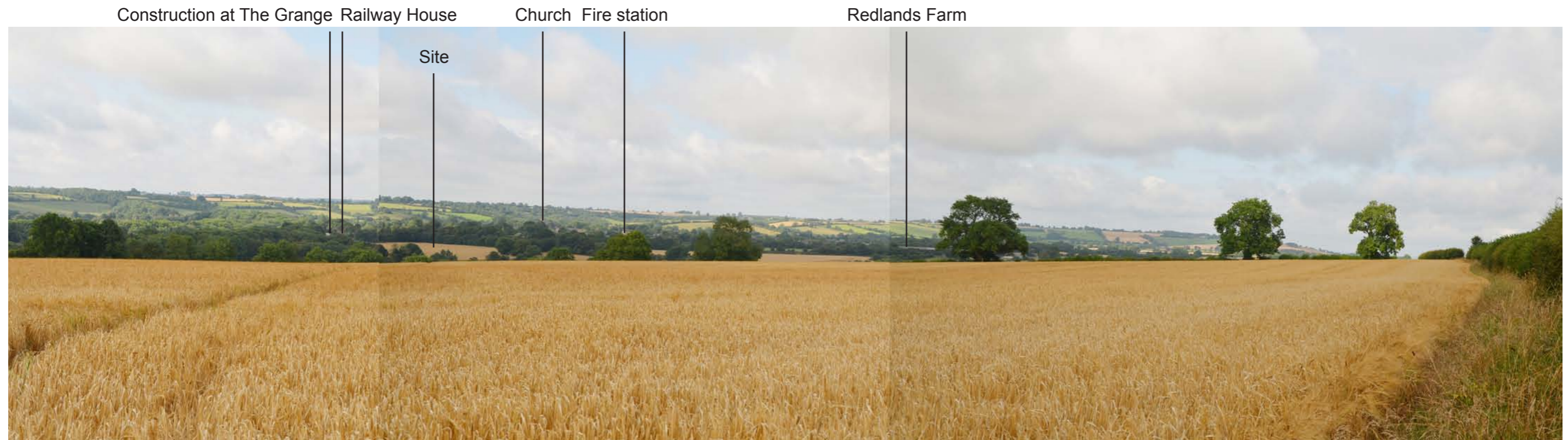
Photograph 7 From Footpath 253/12 at top of Council Hill, 900m from north-east corner of site, looking back towards Hook Norton.