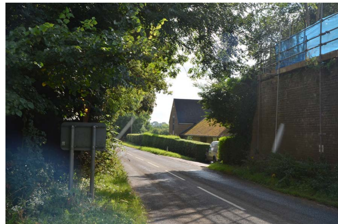
Photograph 14 From edge of former bridge abutments showing that users of the business premises at Railway Bridge House would only have oblique views towards the site.