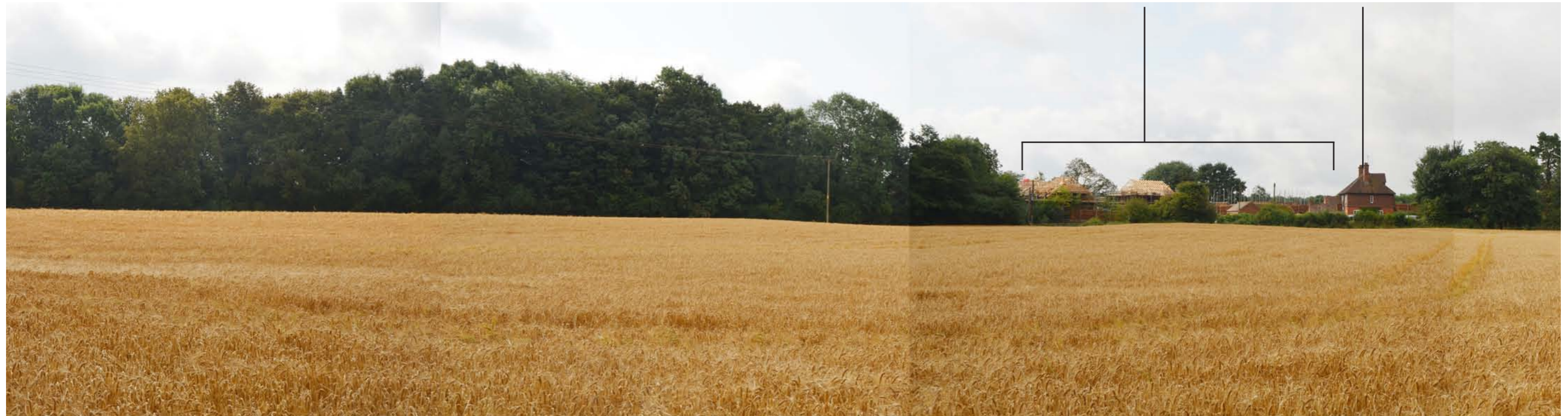
Photograph 4 From north-east corner of site where proposed link with Footpath 253/21 would be located.