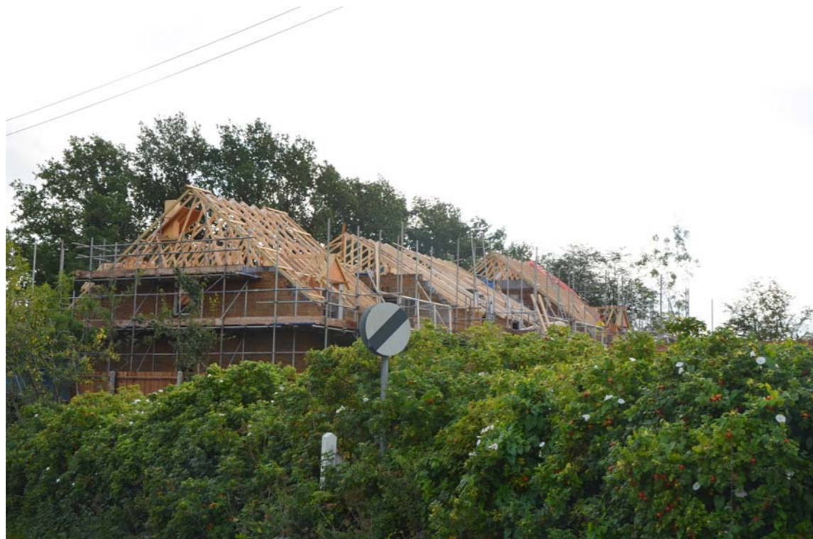
Photograph 13 Construction at The Grange taken from Station Road.