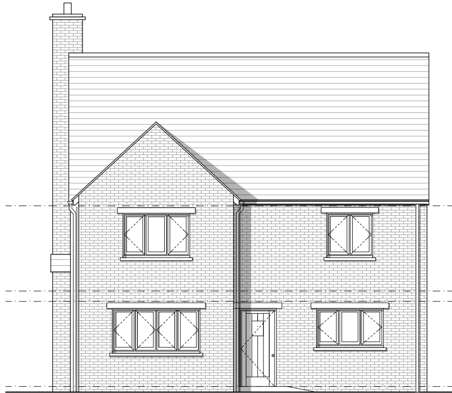
Front Elevation - D2 1:100 (A3)