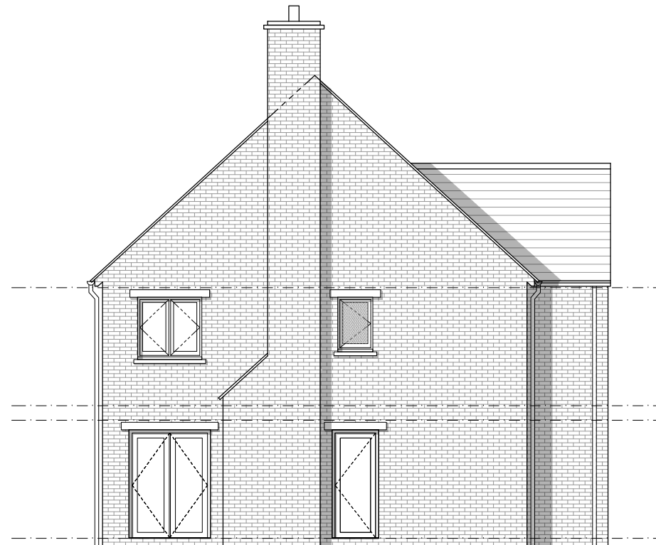
Rear Elevation - D2 1:100 (A3)