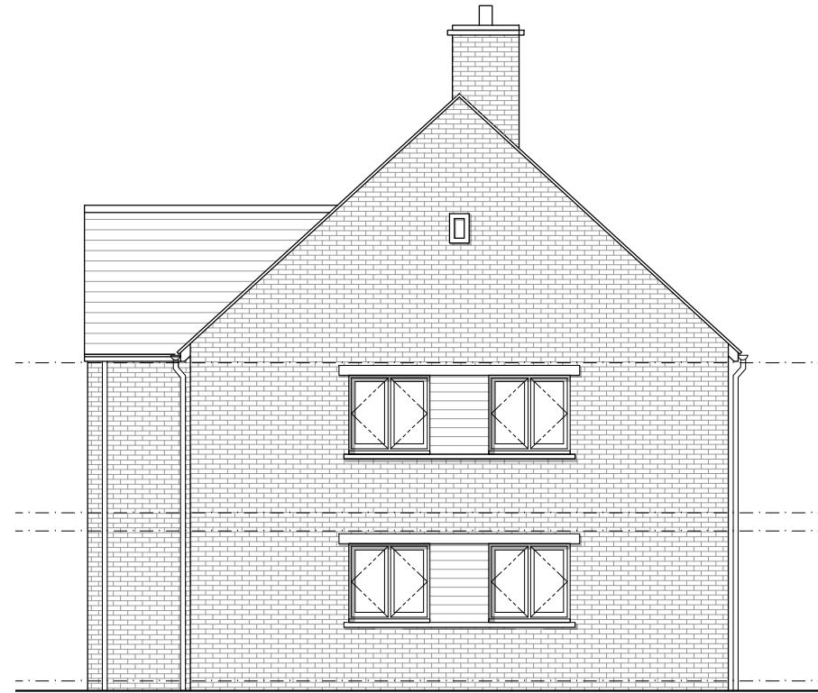
Front Elevation 2 - D2 1:100 (A3)