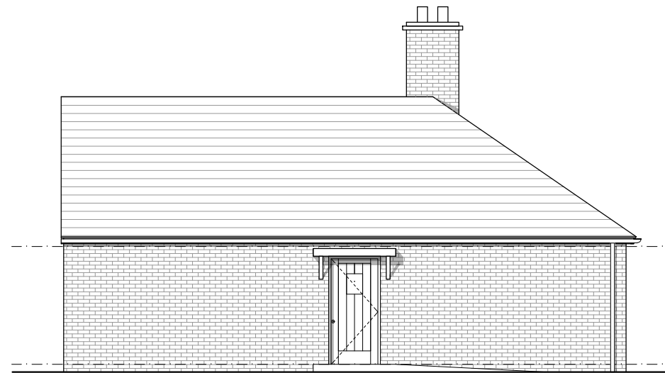
Side Elevation - BuBu 1:100 (A3)