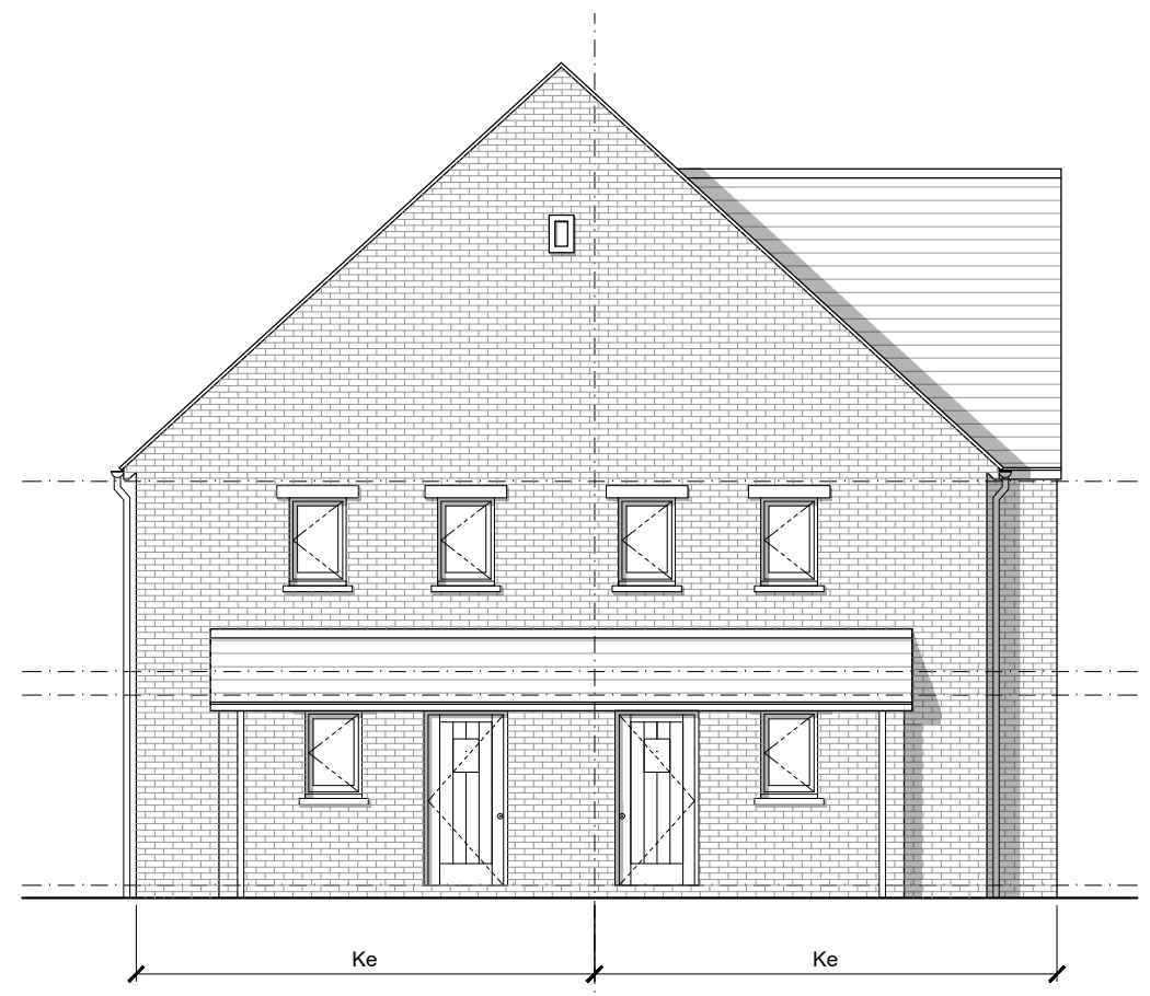
Front Elevation 2 - Ke 1:100 (A3)