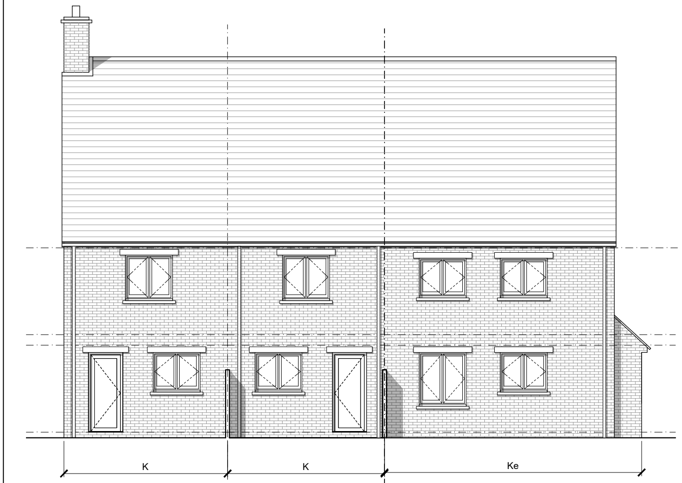
Rear Elevation - KeKeKK 1:100 (A3)