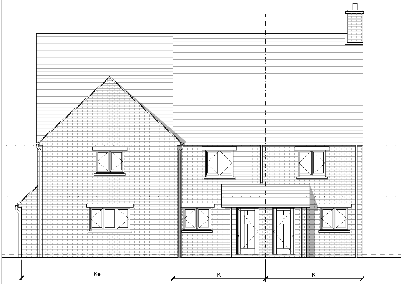
Front Elevation - KeKeKK 1:100 (A3)