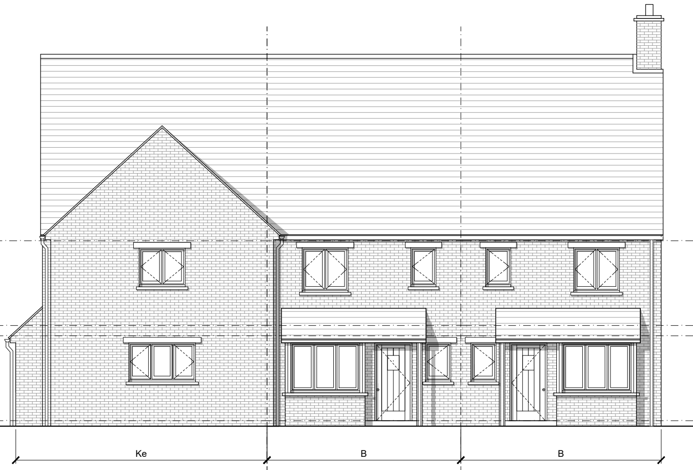
Front Elevation - KeKeBB 1:100 (A3)