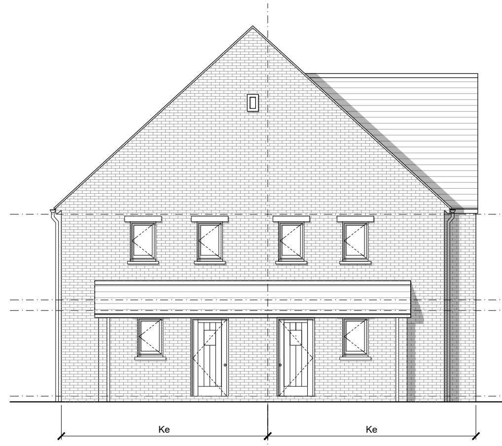
Front Elevation 2 - Ke 1:100 (A3)