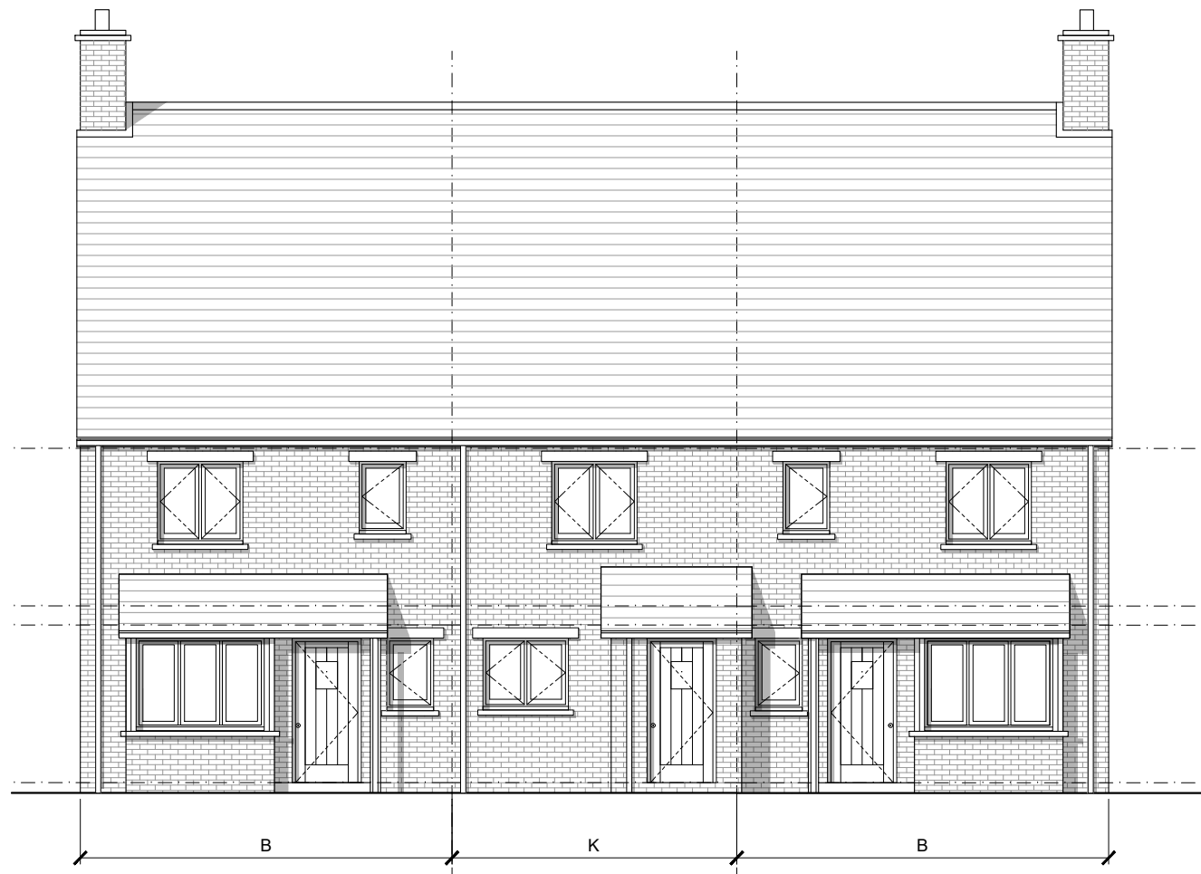
Front Elevation - BKB 1:100 (A3)