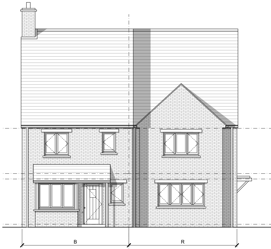
Front Elevation - BR 2 1:100 (A3)