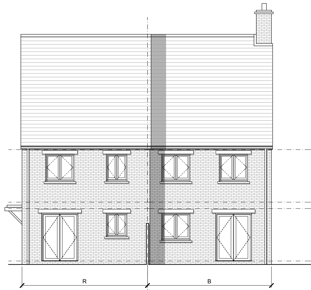
Rear Elevation - BR 2 1:100 (A3)