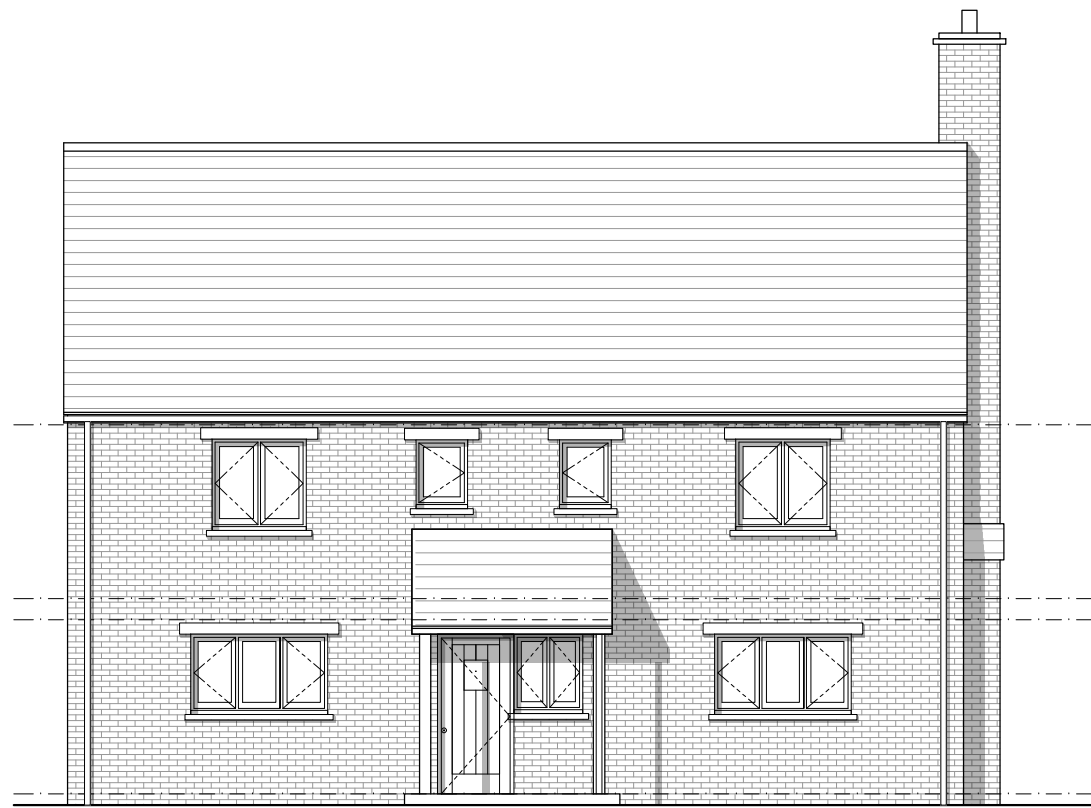
Front Elevation - W 1:100 (A3)