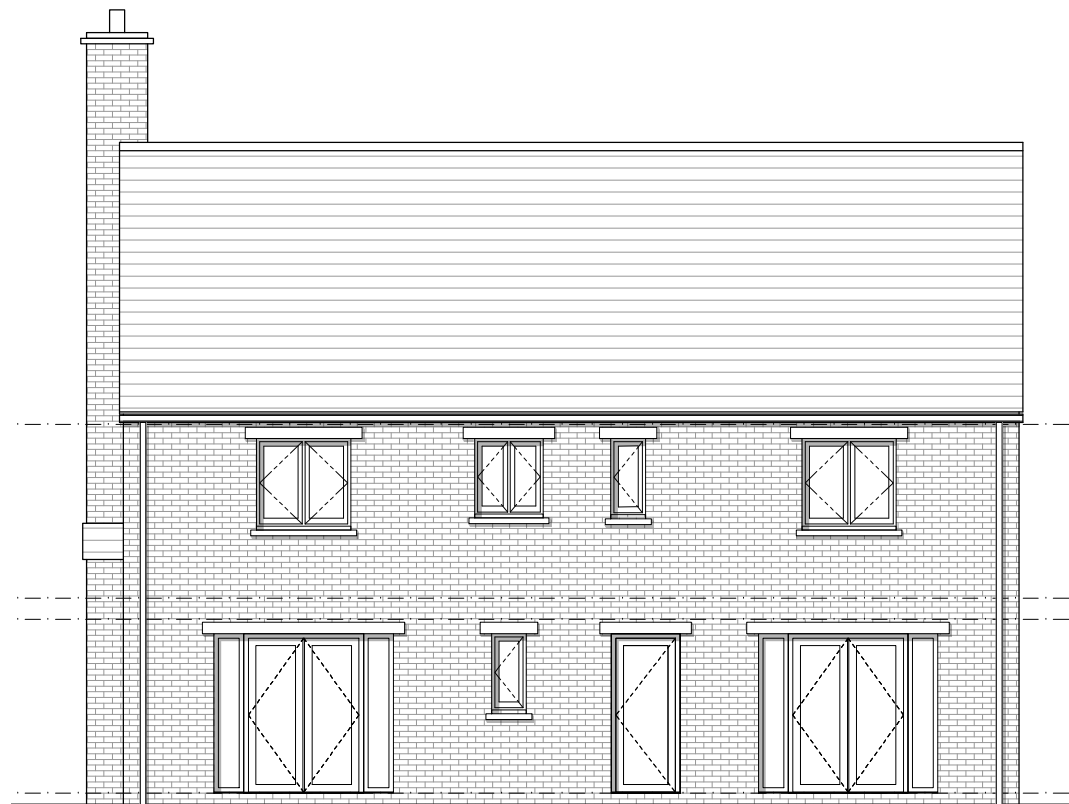
Rear Elevation - W 1:100 (A3)