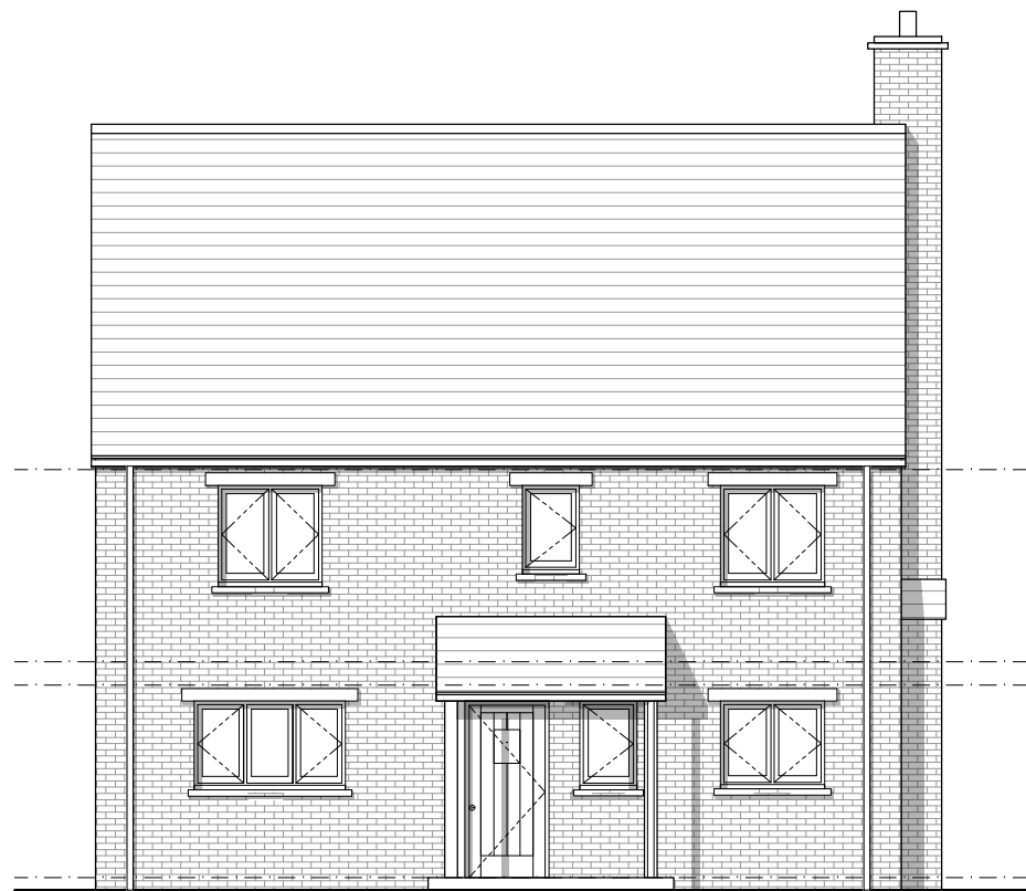
Front Elevation - D 1:100 (A3)