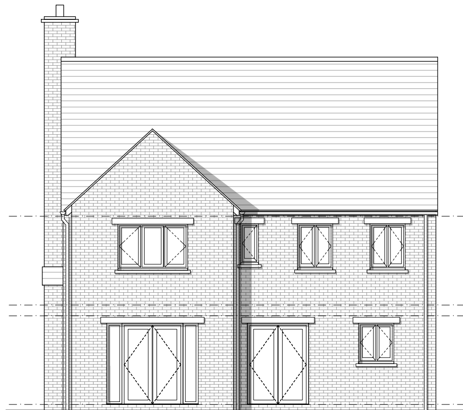
Rear Elevation - D 1:100 (A3)