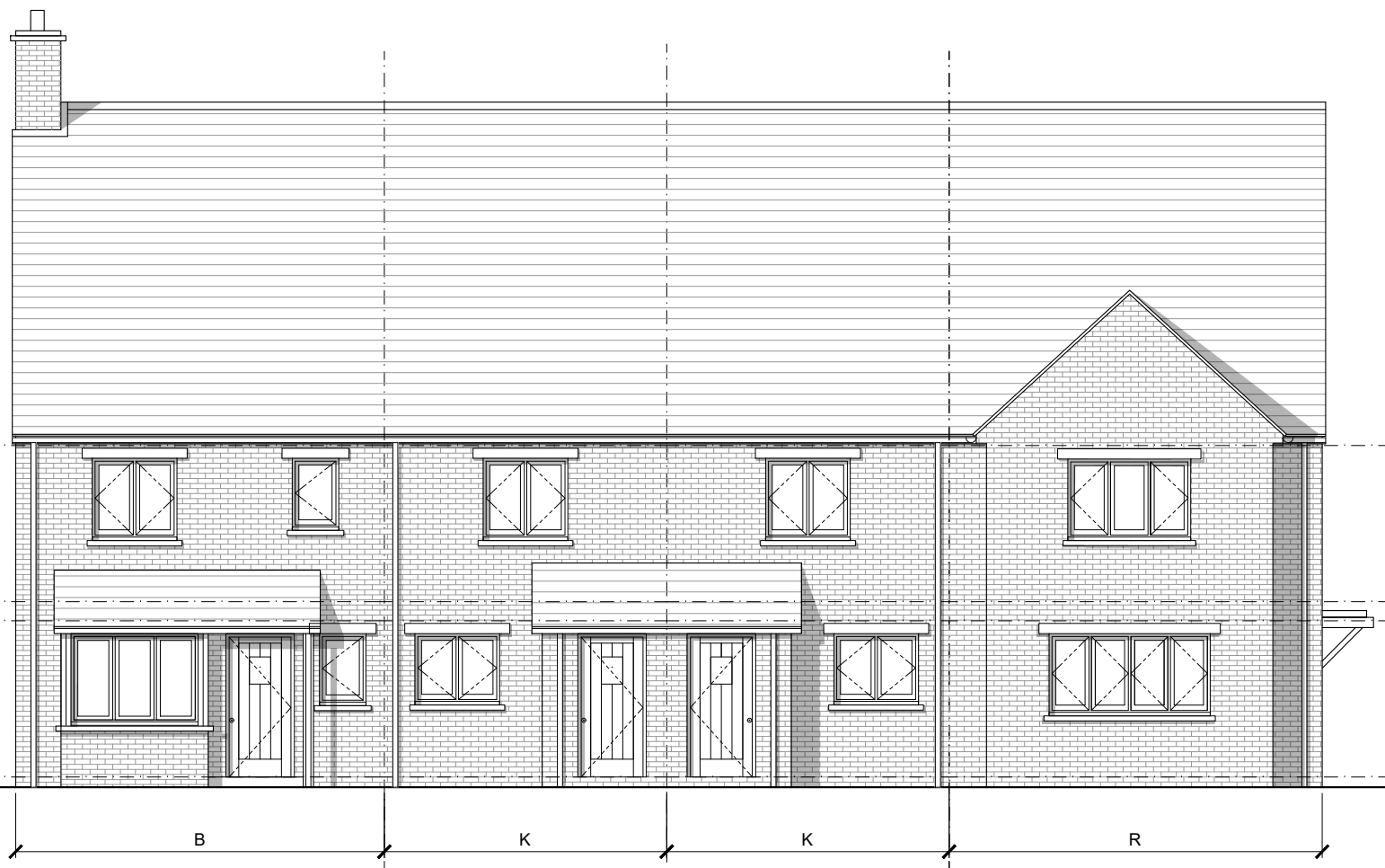
Front Elevation - BKKR 1:100 (A3)