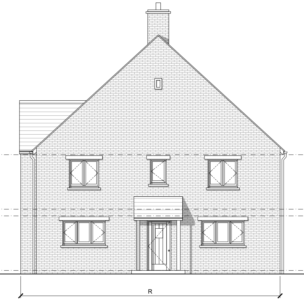
Front Elevation 2 - R 1:100 (A3)